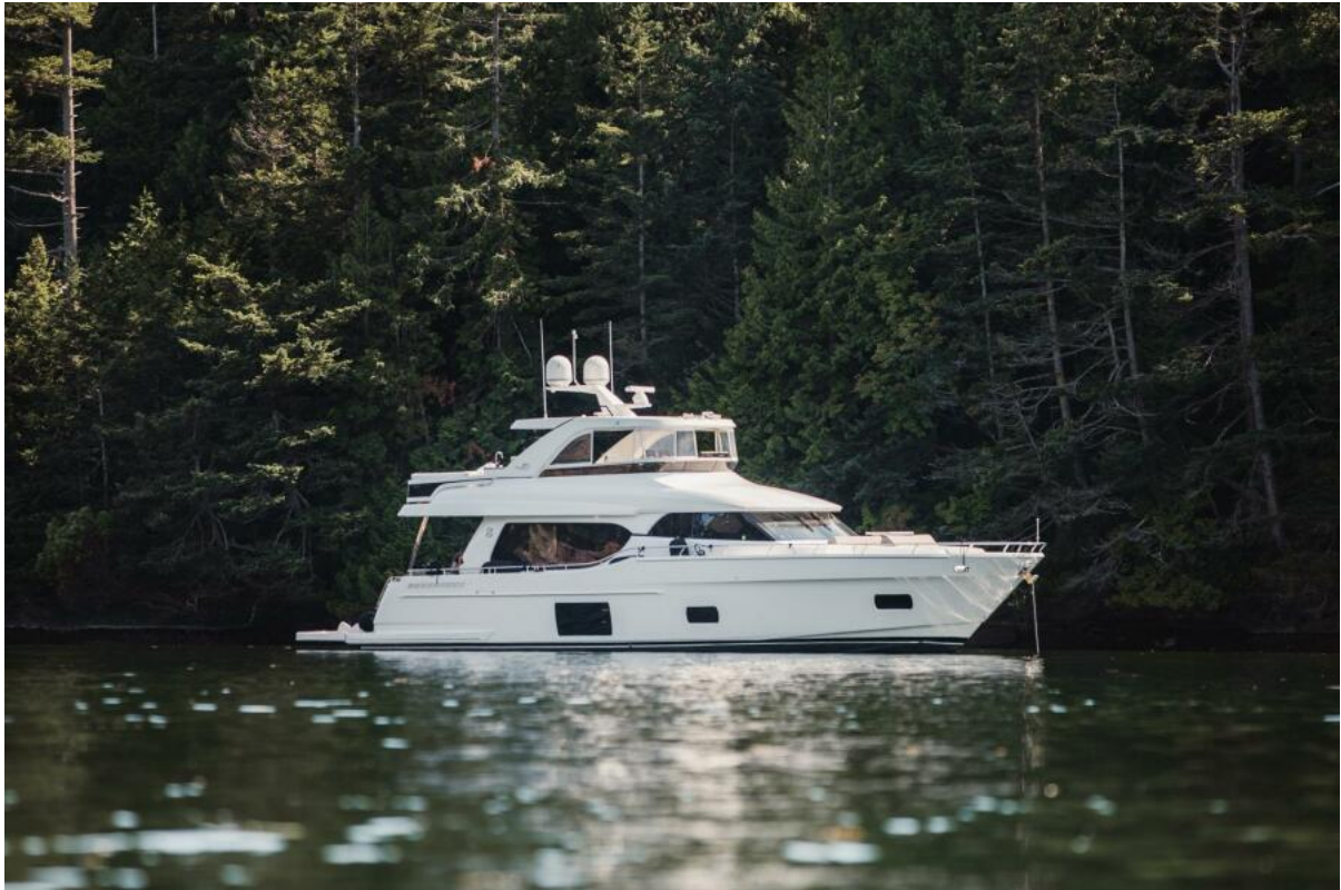
PLAYBOOK 70' (21.34m) Ocean Alexander 2018