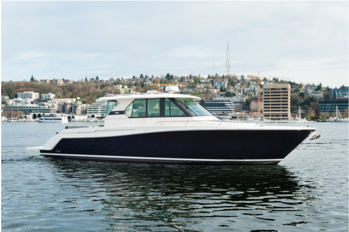
DAY TRIPPER, 44' Tiara 2016