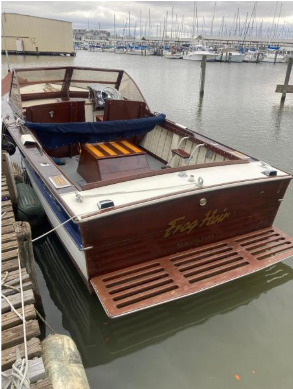
Mahogany Swim Platform