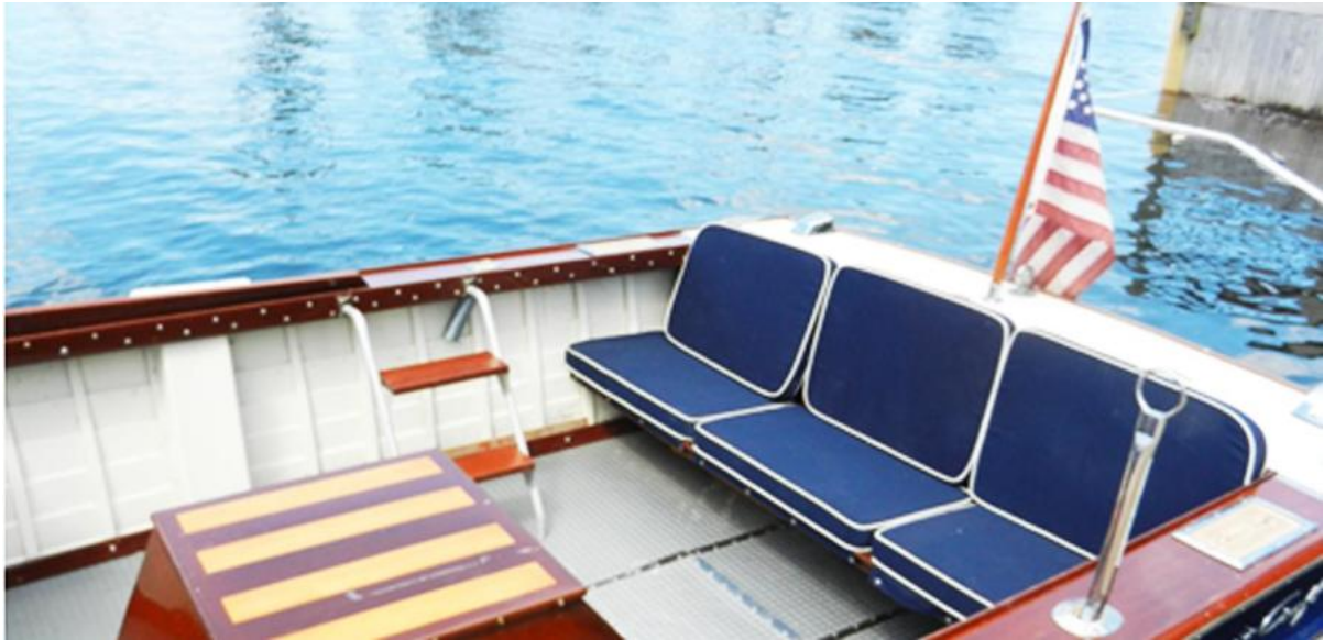
Aft seating 2