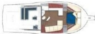
Standard 1-Stateroom / 1-Head Arrangement