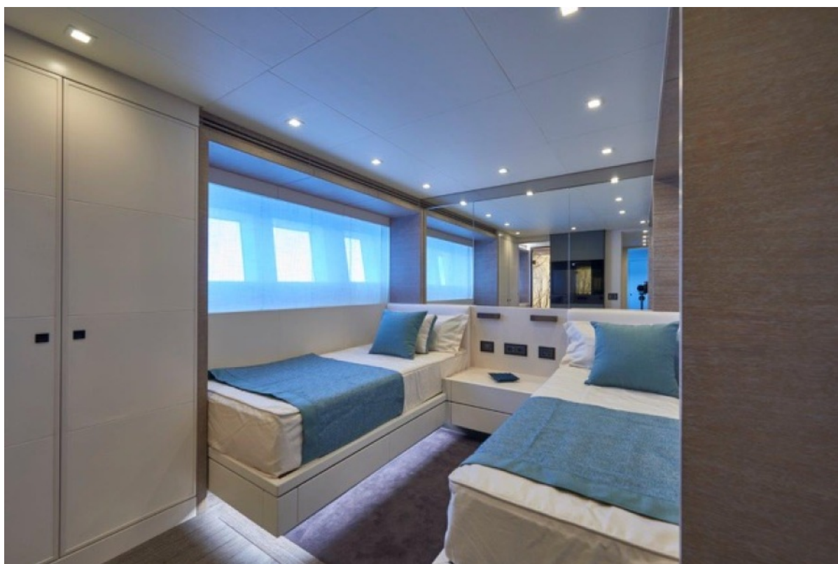
Astondoa 110 Century