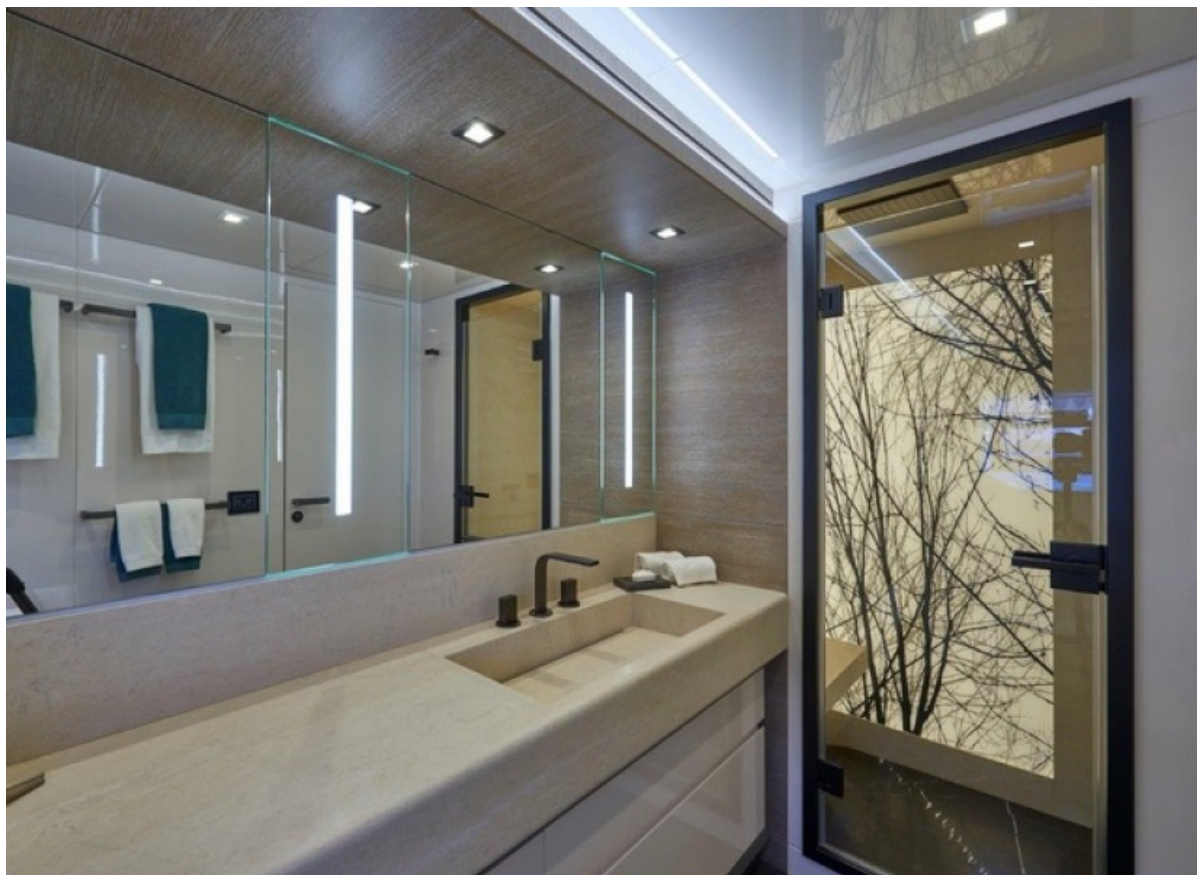
Astondoa 110 Century