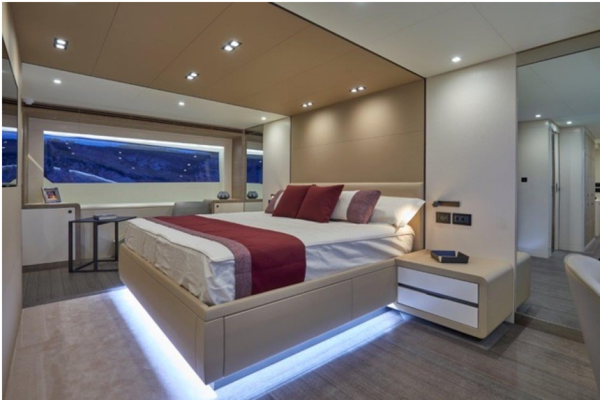
Astondoa 110 Century