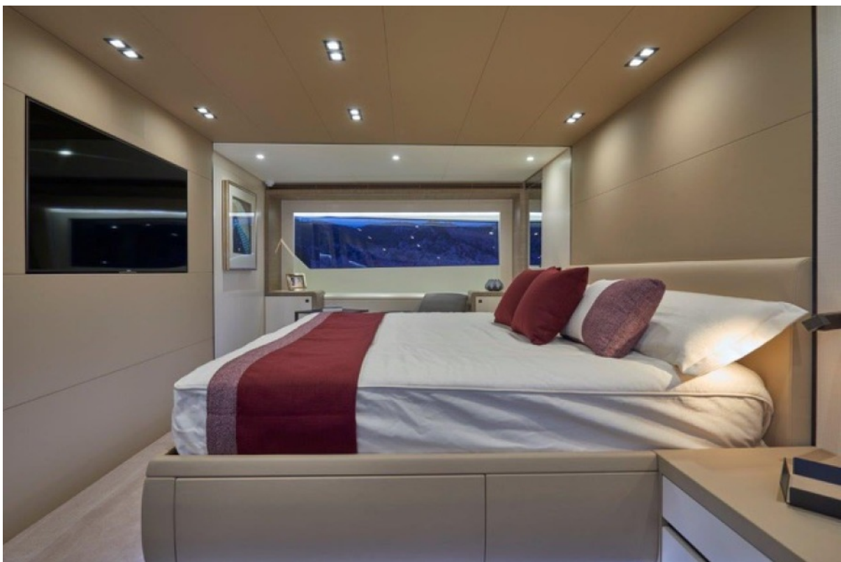
Astondoa 110 Century