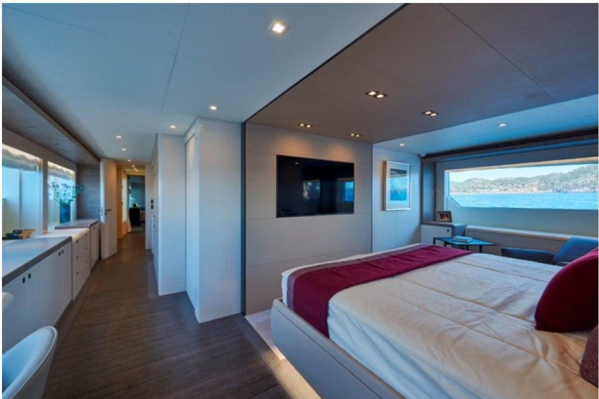
Astondoa 110 Century