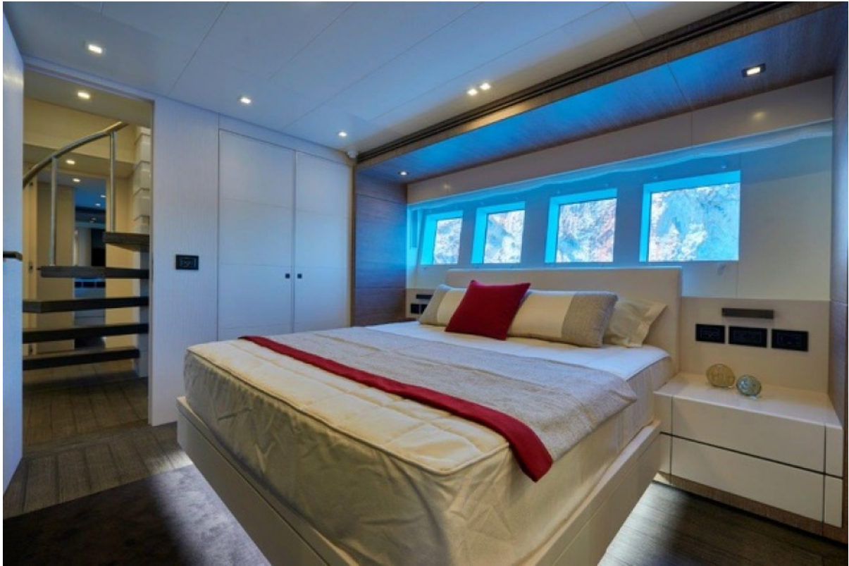
Astondoa 110 Century