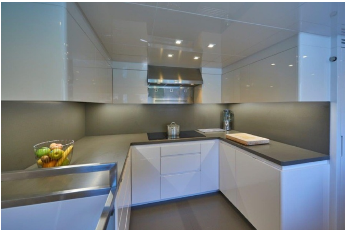
Astondoa 110 Century