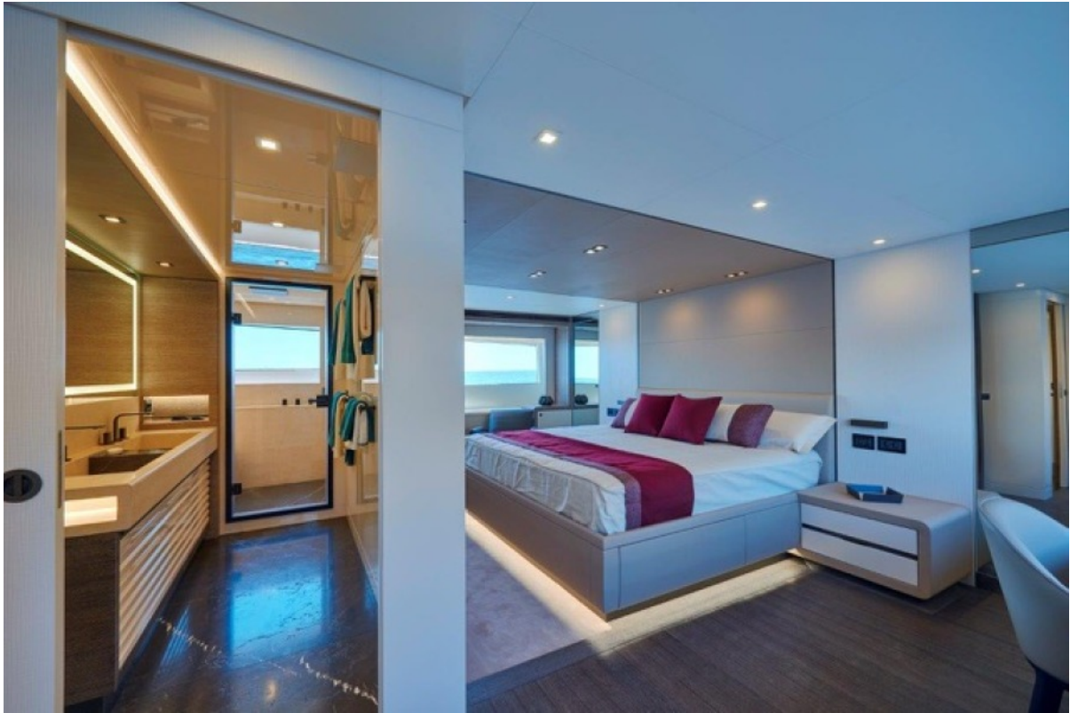
Astondoa 110 Century