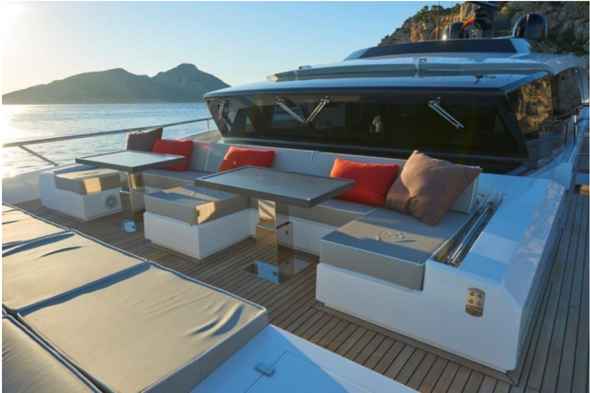
Astondoa 110 Century