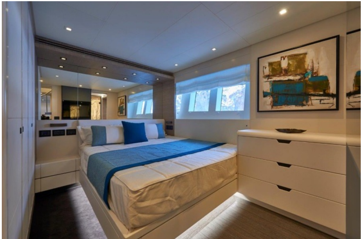
Astondoa 110 Century