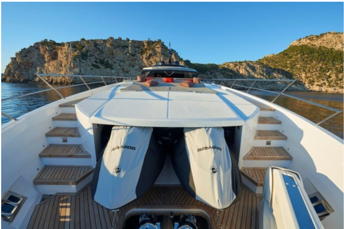
Astondoa 110 Century