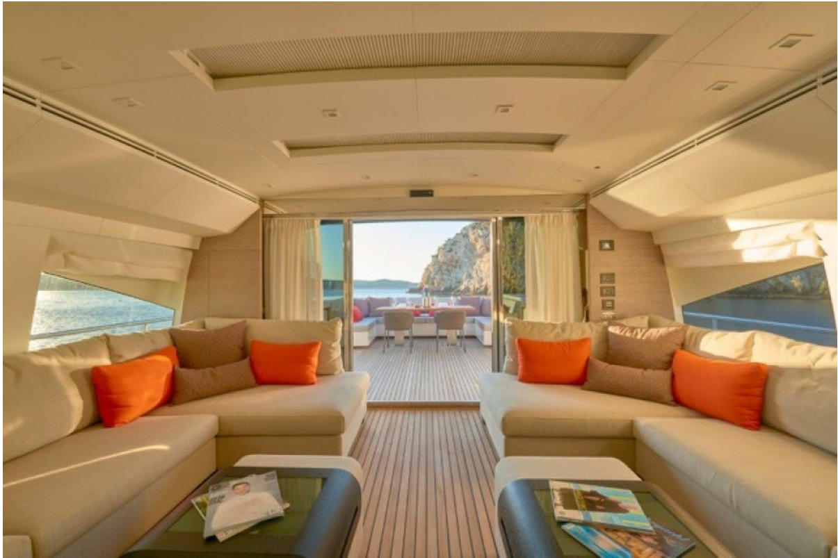
Astondoa 110 Century