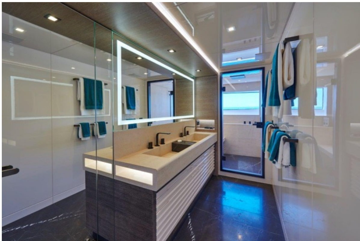
Astondoa 110 Century