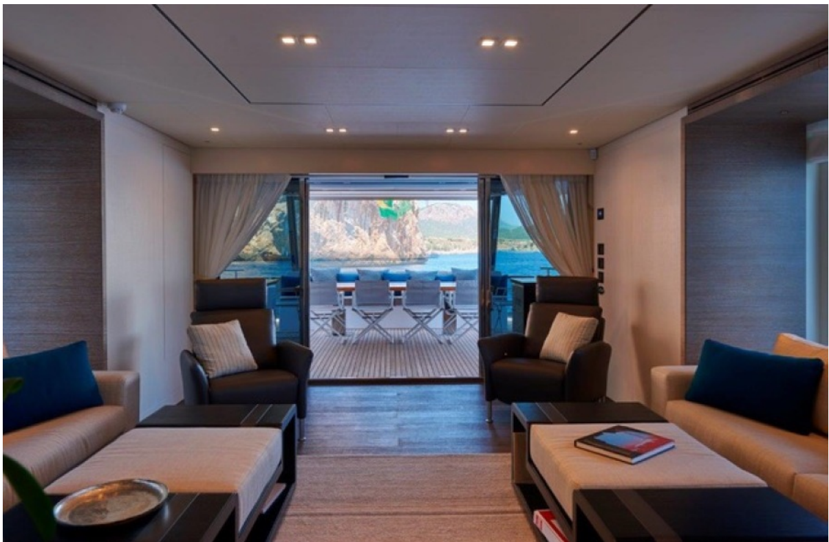
Astondoa 110 Century