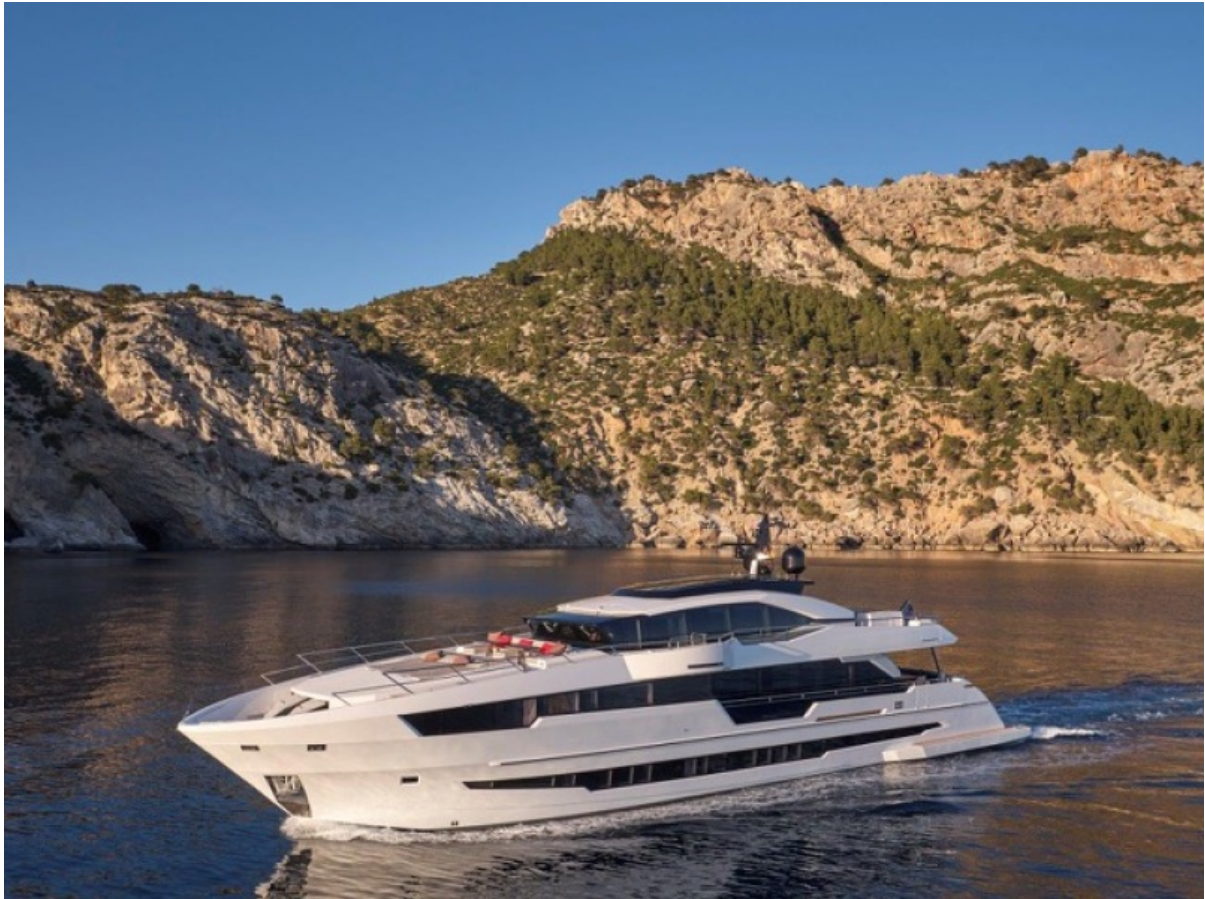
Astondoa 110 Century