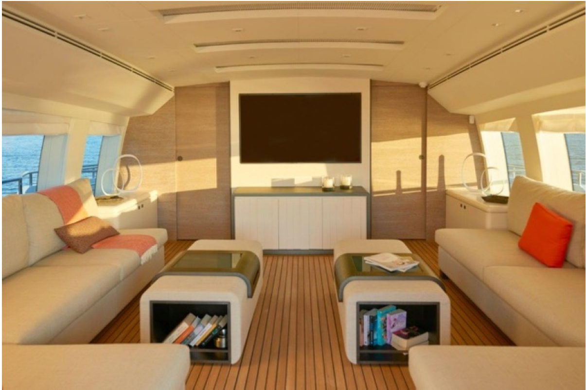
Astondoa 110 Century