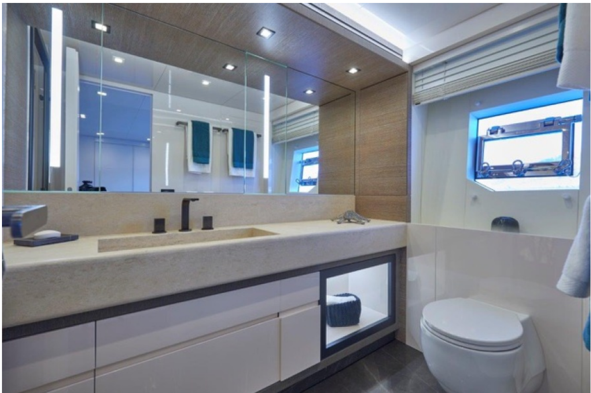
Astondoa 110 Century