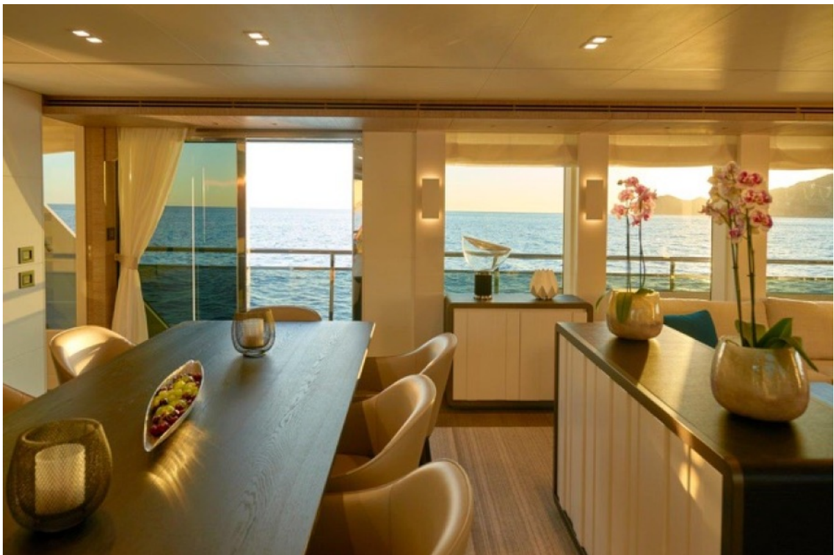
Astondoa 110 Century