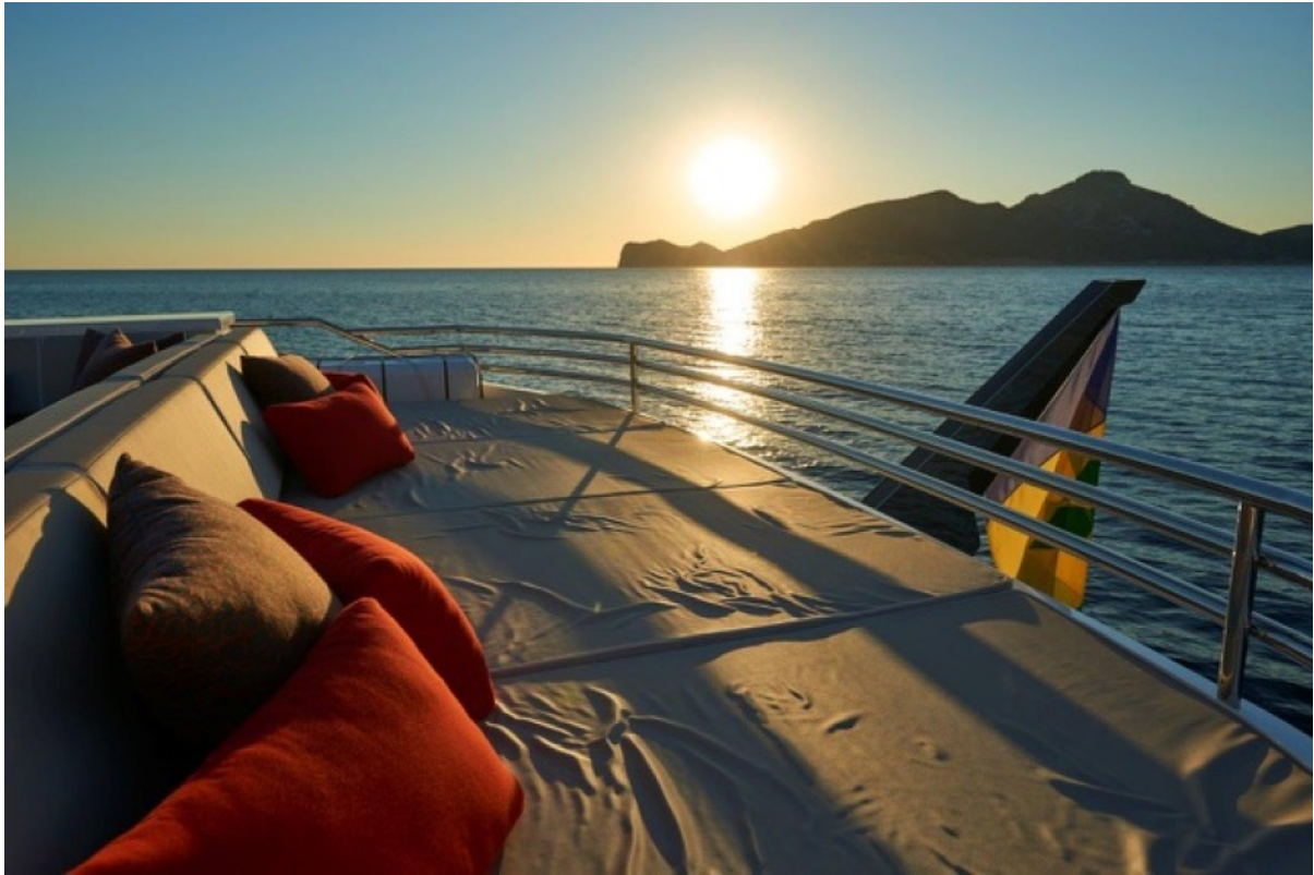
Astondoa 110 Century