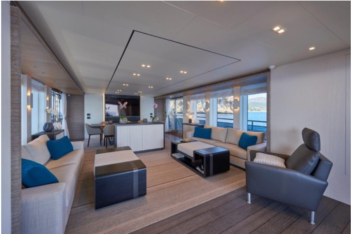
Astondoa 110 Century