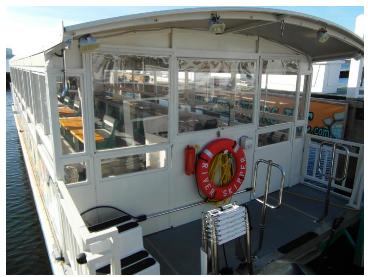
2006 Trident 44 Passenger Tour Boat Forward Deck With Entrance to Seating Area and Swim Ladder.