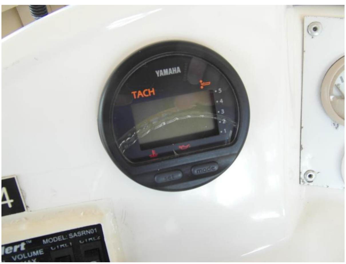
2006 Trident 44 Passenger Tour Boat Yamaha Fuel Guage