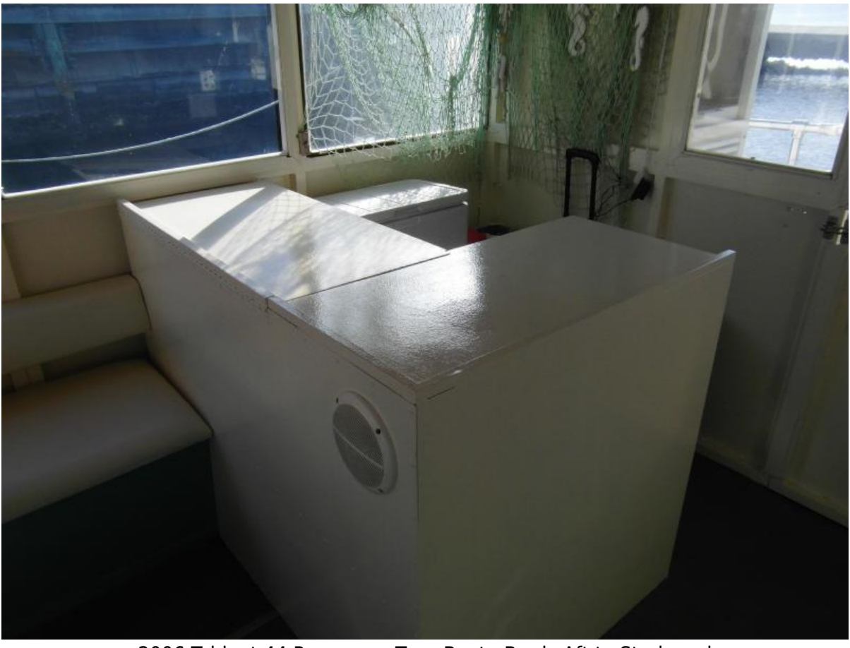
2006 Trident 44 Passenger Tour Boat Bar is Aft to Starboard