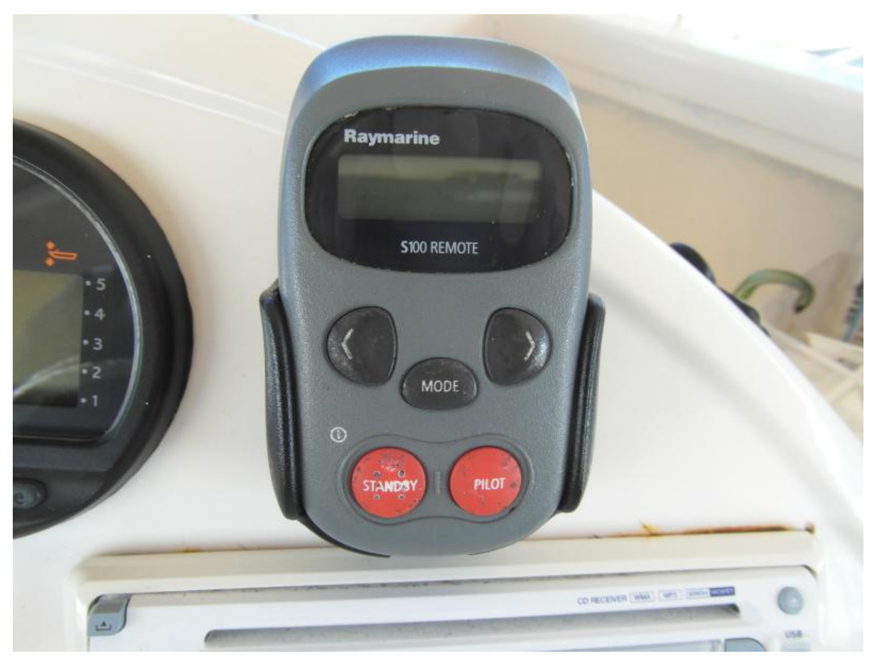
2006 Trident 44 Passenger Tour Boat Raymarine