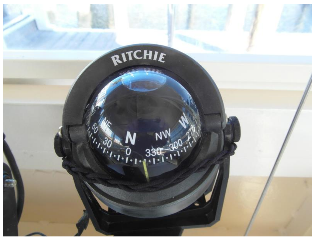
2006 Trident 44 Passenger Tour Boat Ritchie Compass