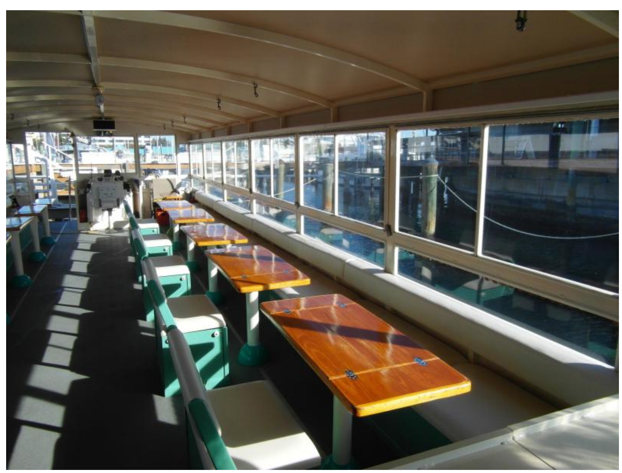
2006 Trident 44 Passenger Tour Boat Starboard Passenger Seating