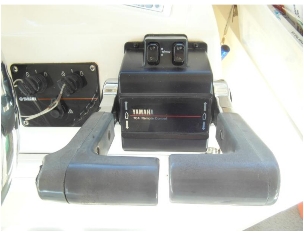
2006 Trident 44 Passenger Tour Boat Yamaha Engine Controls