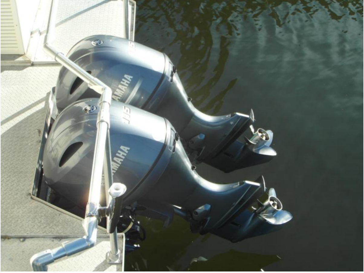
2006 Trident 44 Passenger Tour Boat Hydraulic Rotating Jack to Raise and Lower Engines