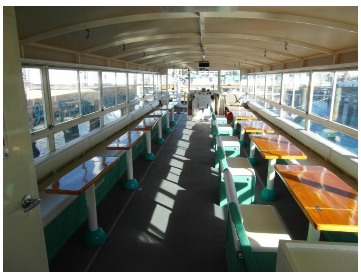
2006 Trident 44 Passenger Tour Boat Passenger Seating Facing Forward