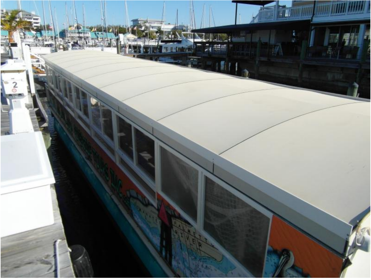
2006 Trident 44 Passenger Tour Boat 42' USCG Approved Pontoons With Only 2'6' Draft