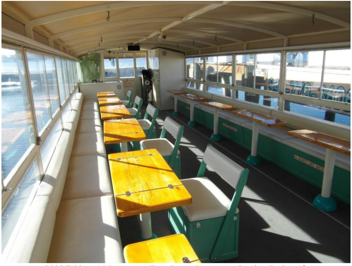
2006 Trident 44 Passenger Tour Boat Passenger Seating Facing Aft