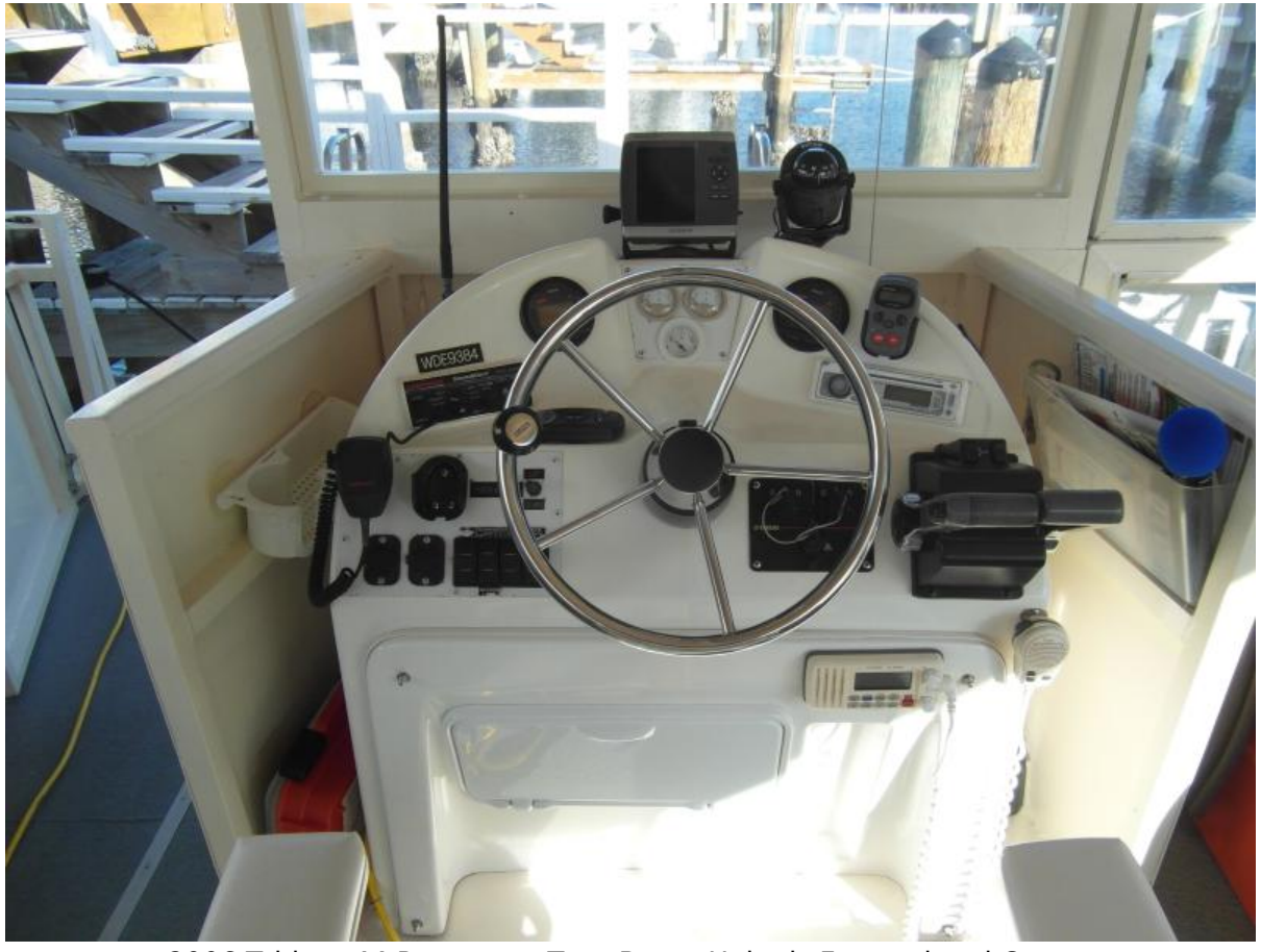
2006 Trident 44 Passenger Tour Boat Helm is Forward and Center