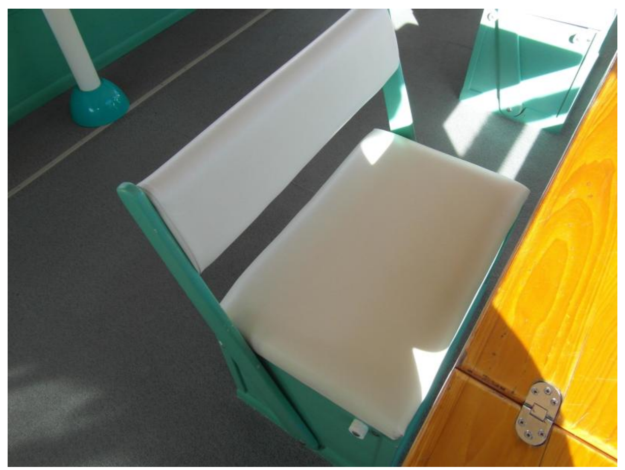
2006 Trident 44 Passenger Tour Boat Custom Water Resistant Seats With Storage Underneath