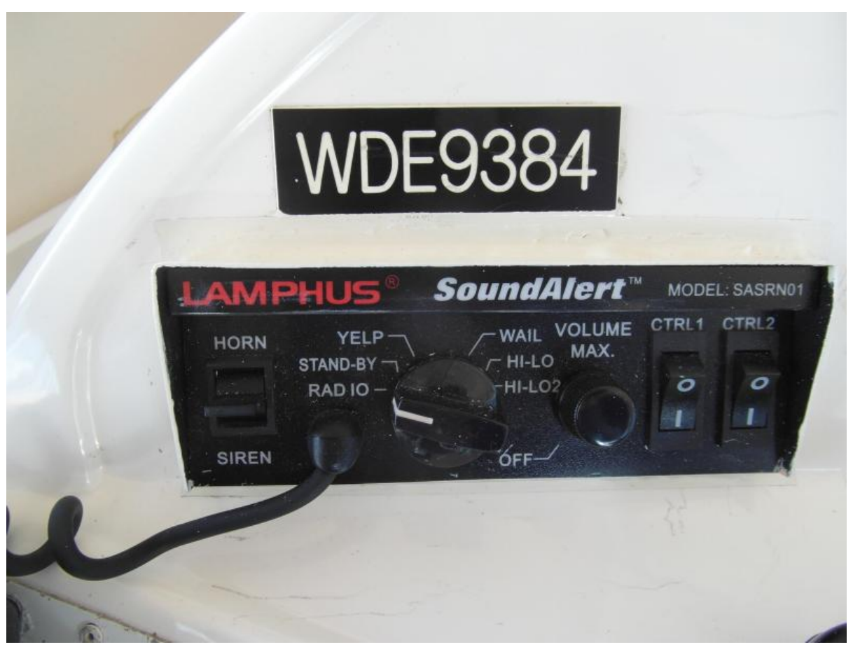
2006 Trident 44 Passenger Tour Boat Lamphus Sound Alert