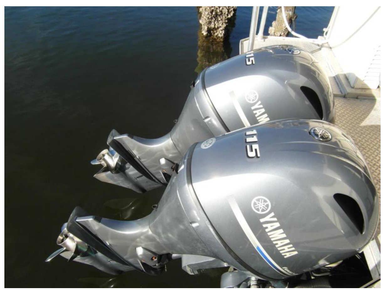
2006 Trident 44 Passenger Tour Boat 2017 Yamaha 115hp Engines