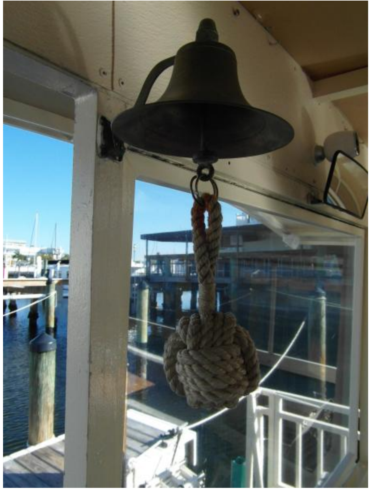
2006 Trident 44 Passenger Tour Boat Captain's Bell