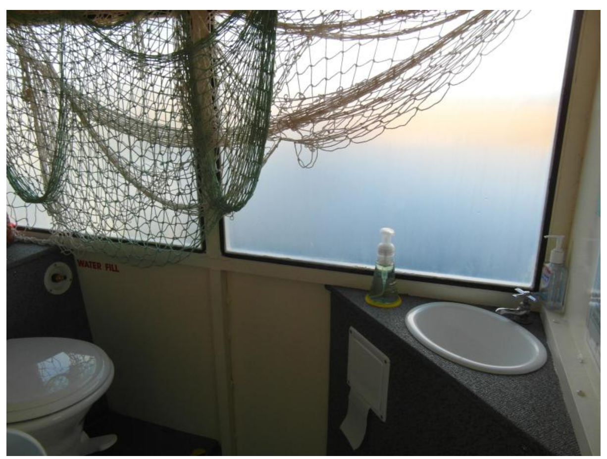
2006 Trident 44 Passenger Tour Boat Sink and Vanity