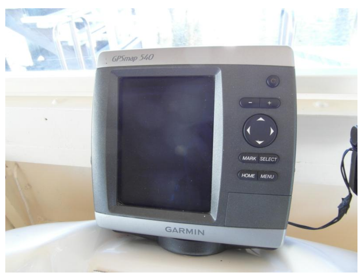
2006 Trident 44 Passenger Tour Boat Garmin 540