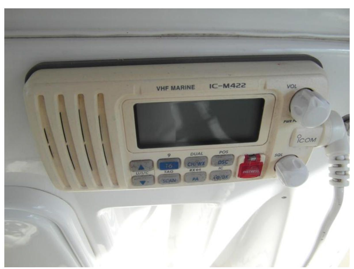
2006 Trident 44 Passenger Tour Boat ICOM-M422 VHF