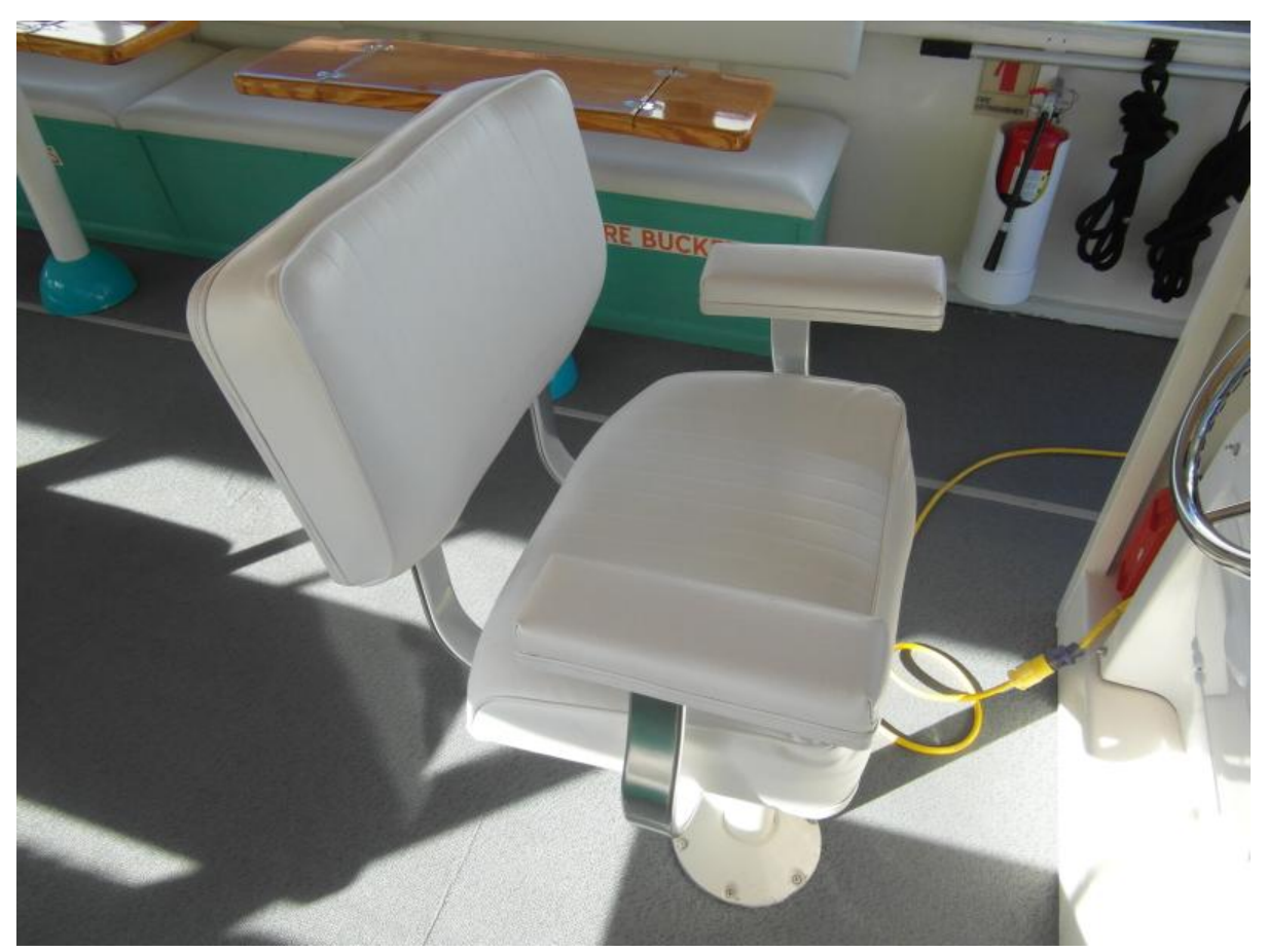
2006 Trident 44 Passenger Tour Boat Captain's Chair