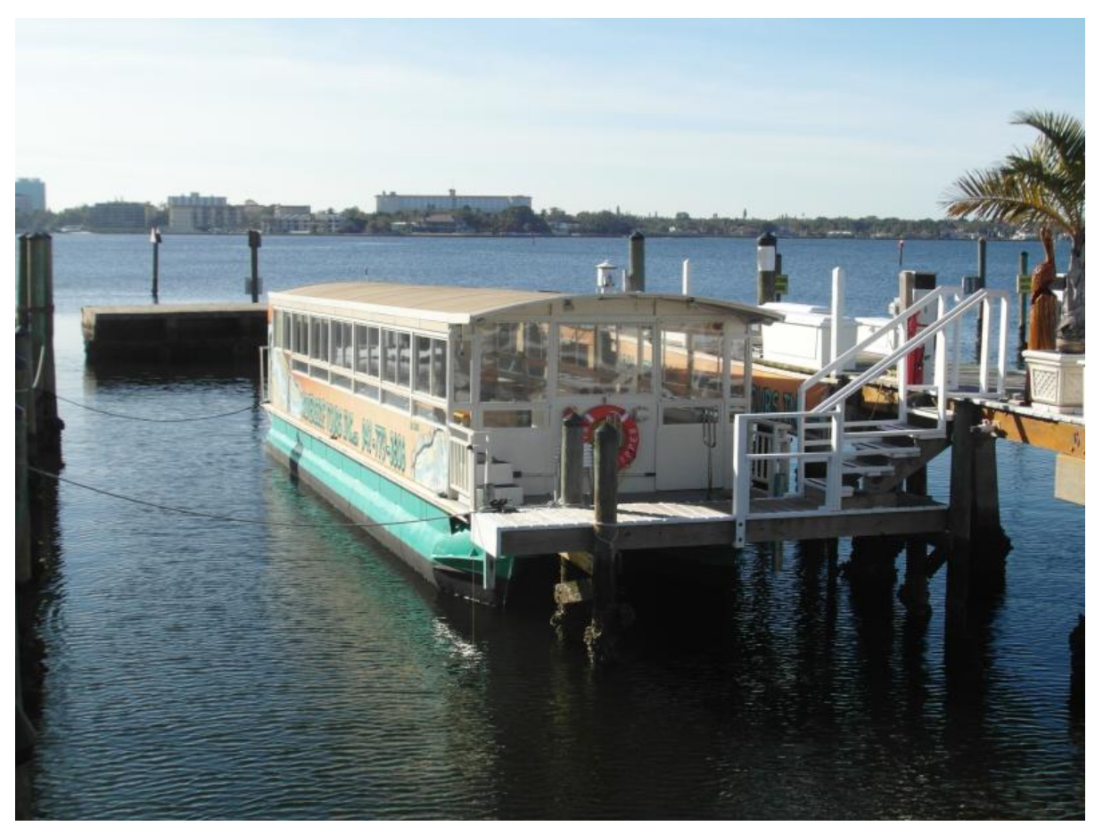
2006 Trident 4512 Touring Pontoon Boat USCG Approved for 44 Passengers and 4 Crew.