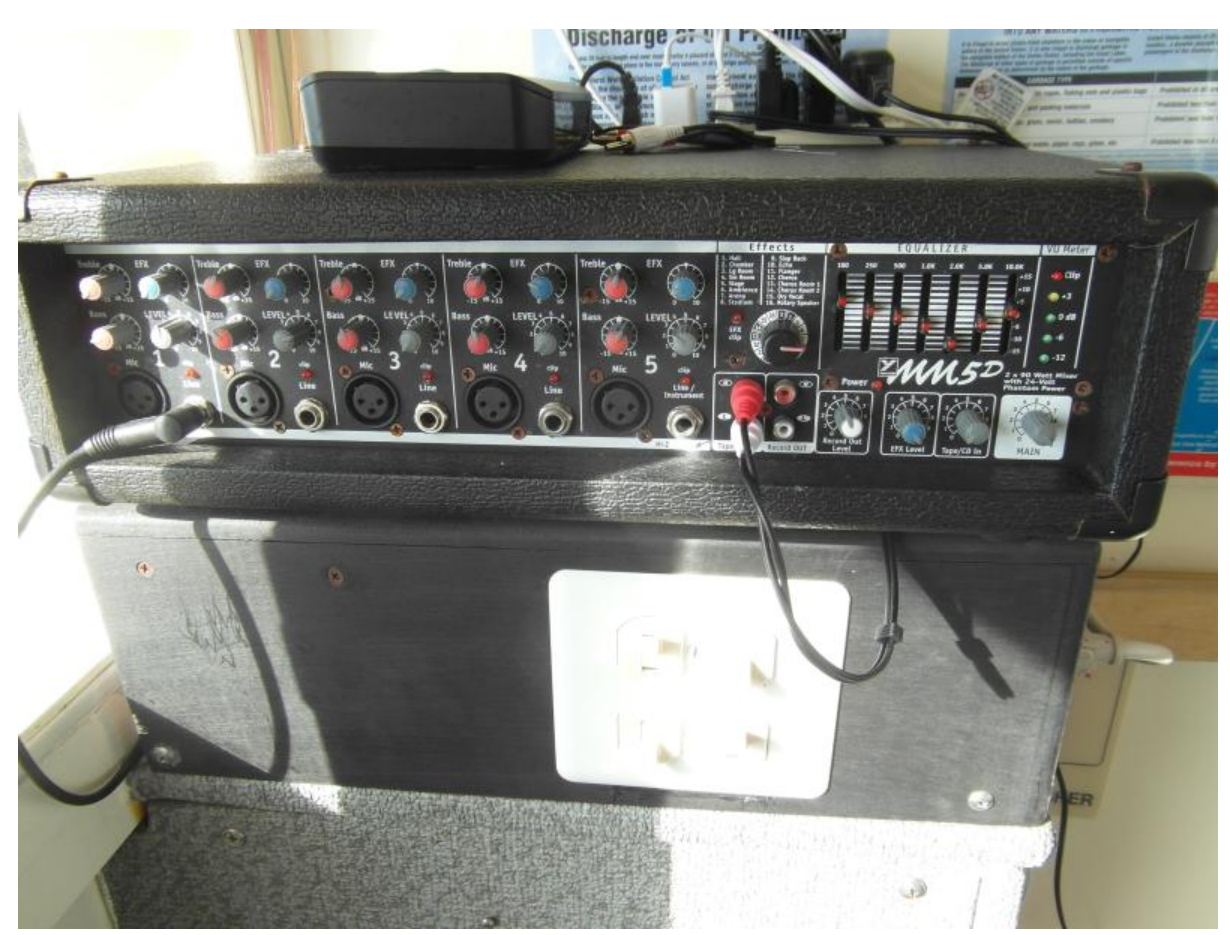
2006 Trident 44 Passenger Tour Boat Stereo System is Aft to Port