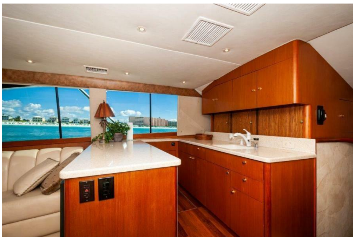
1998 Ocean Yachts 48 Super Sport Galley 2