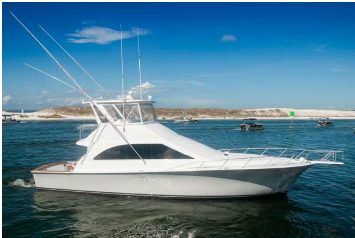
1998 Ocean Yachts 48 Super Sport Main Profile