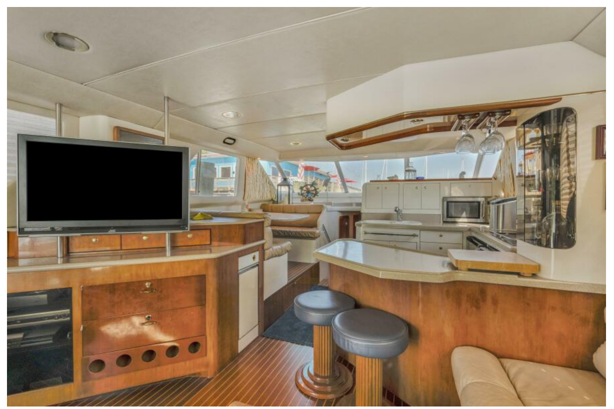
1997 55 Sea Ray 550 Sedan No Name Salon (2)