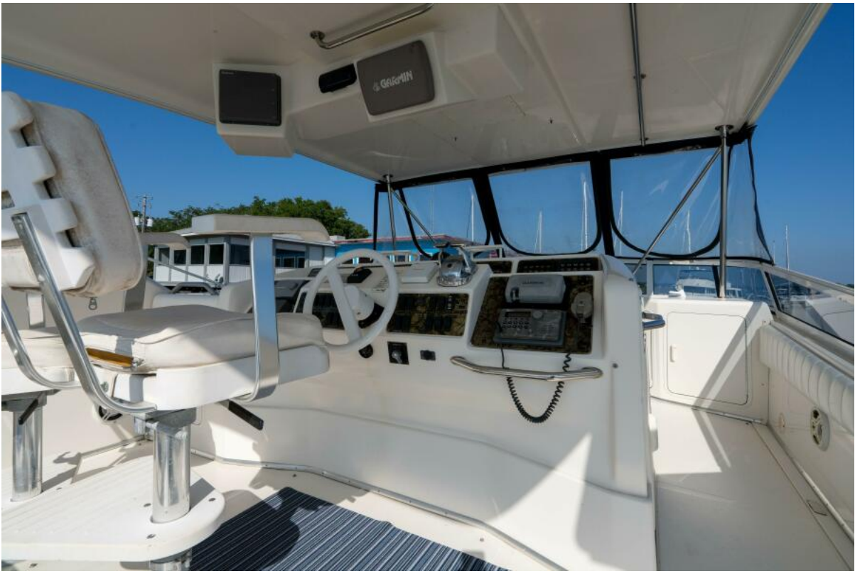
1997 55 Sea Ray 550 Sedan No Name Upper Helm (2)