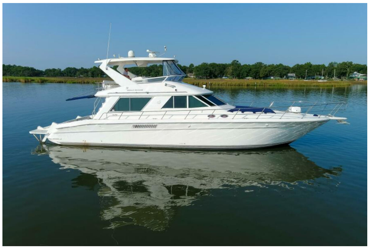
1997 55 Sea Ray 550 Sedan No Name Profile