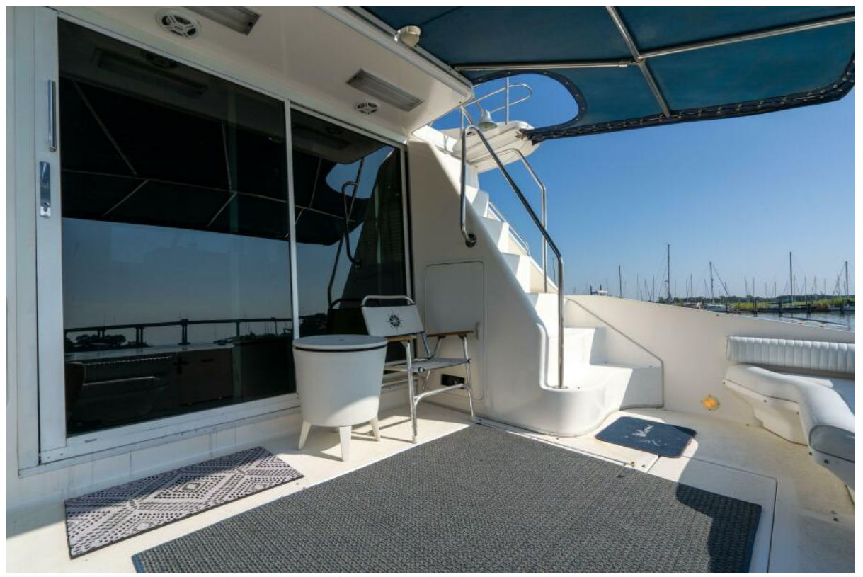
1997 55 Sea Ray 550 Sedan No Name Cockpit