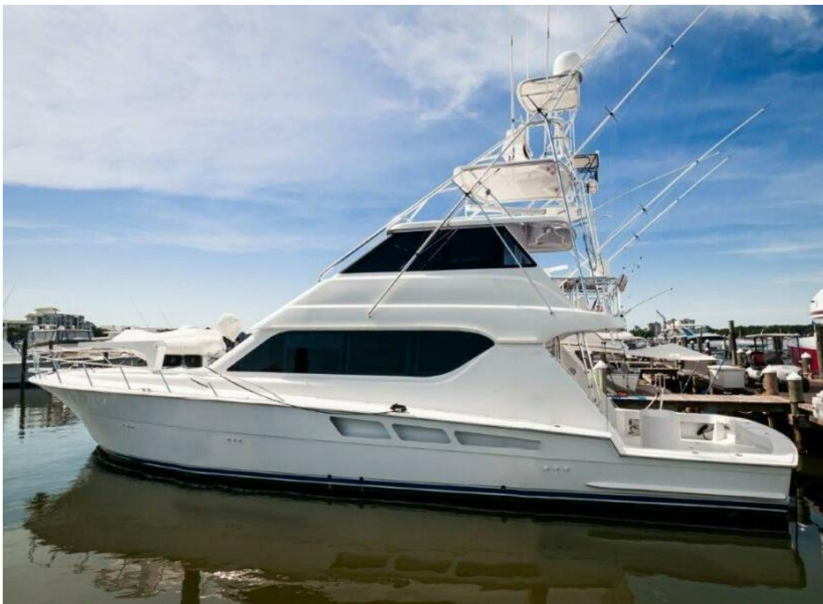
2002 65 Hatteras Convertible Moontan Main Profile