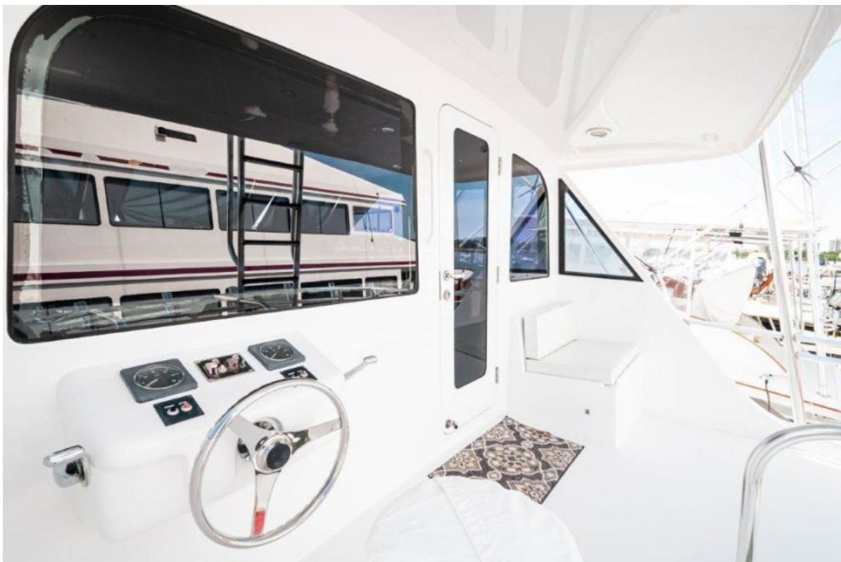
2002 65 Hatteras Convertible Moontan Flybridge (2)