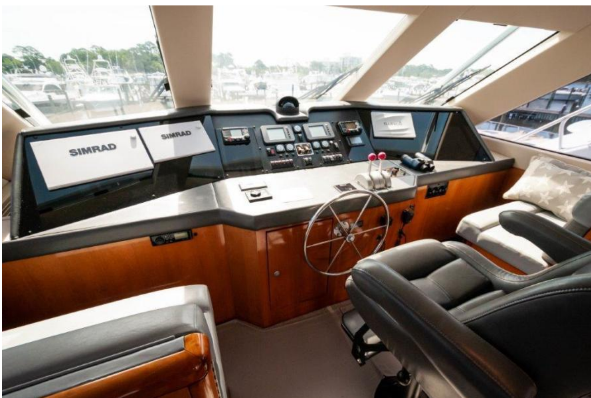
2002 65 Hatteras Convertible Moontan Flybridge (3)