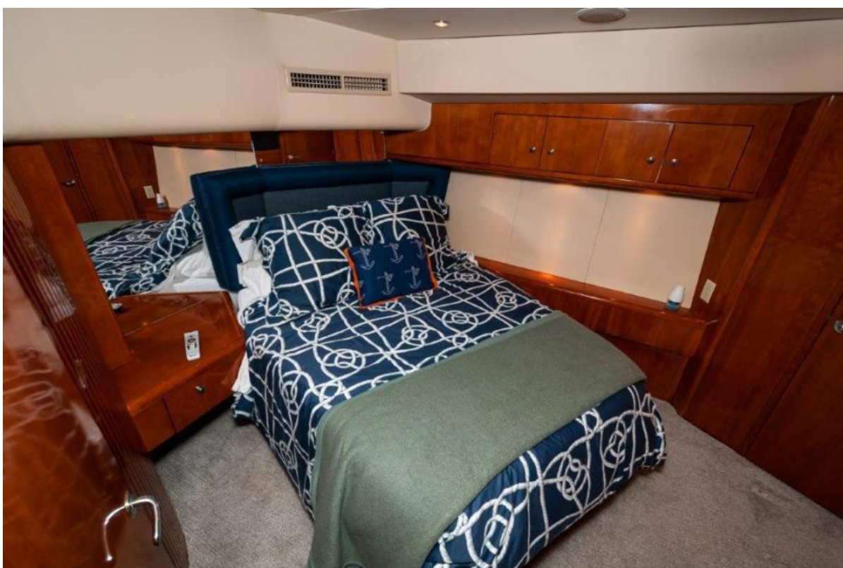
2002 65 Hatteras Convertible Moontan Master Stateroom (1)