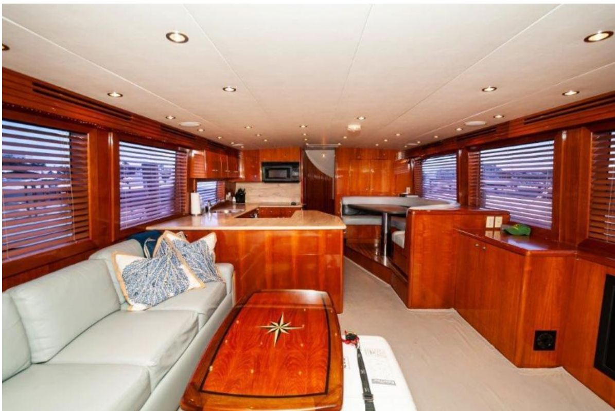
2002 65 Hatteras Convertible Moontan Salon