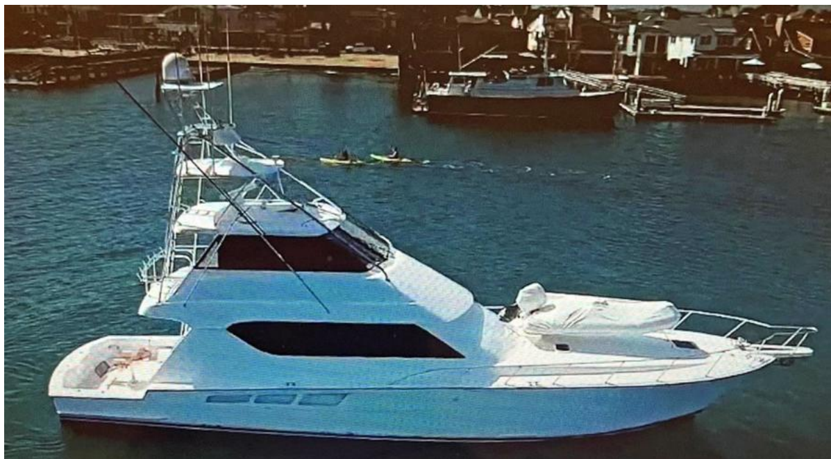
2002 65 Hatteras Convertible Moontan Profile Shot