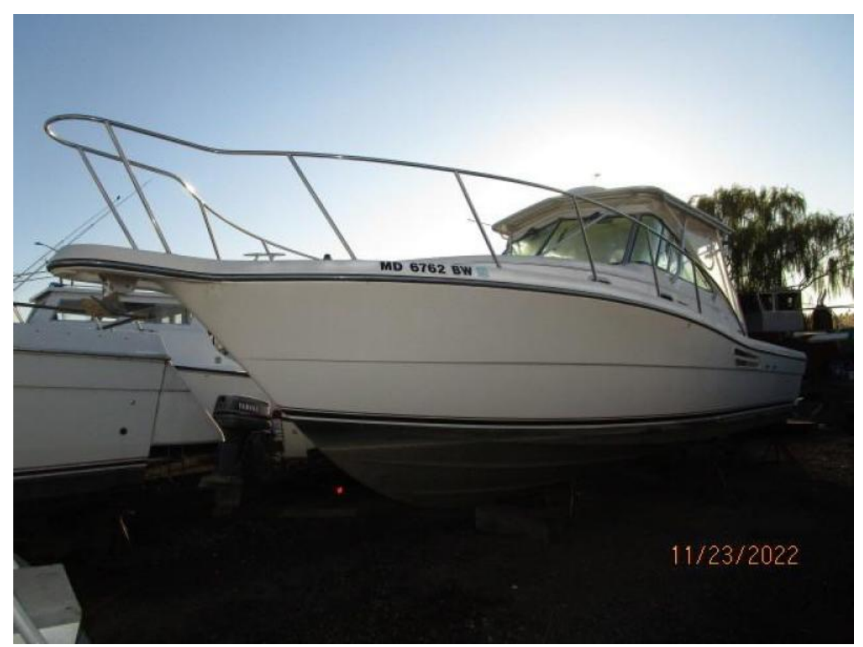
30' Pursuit port forward profile