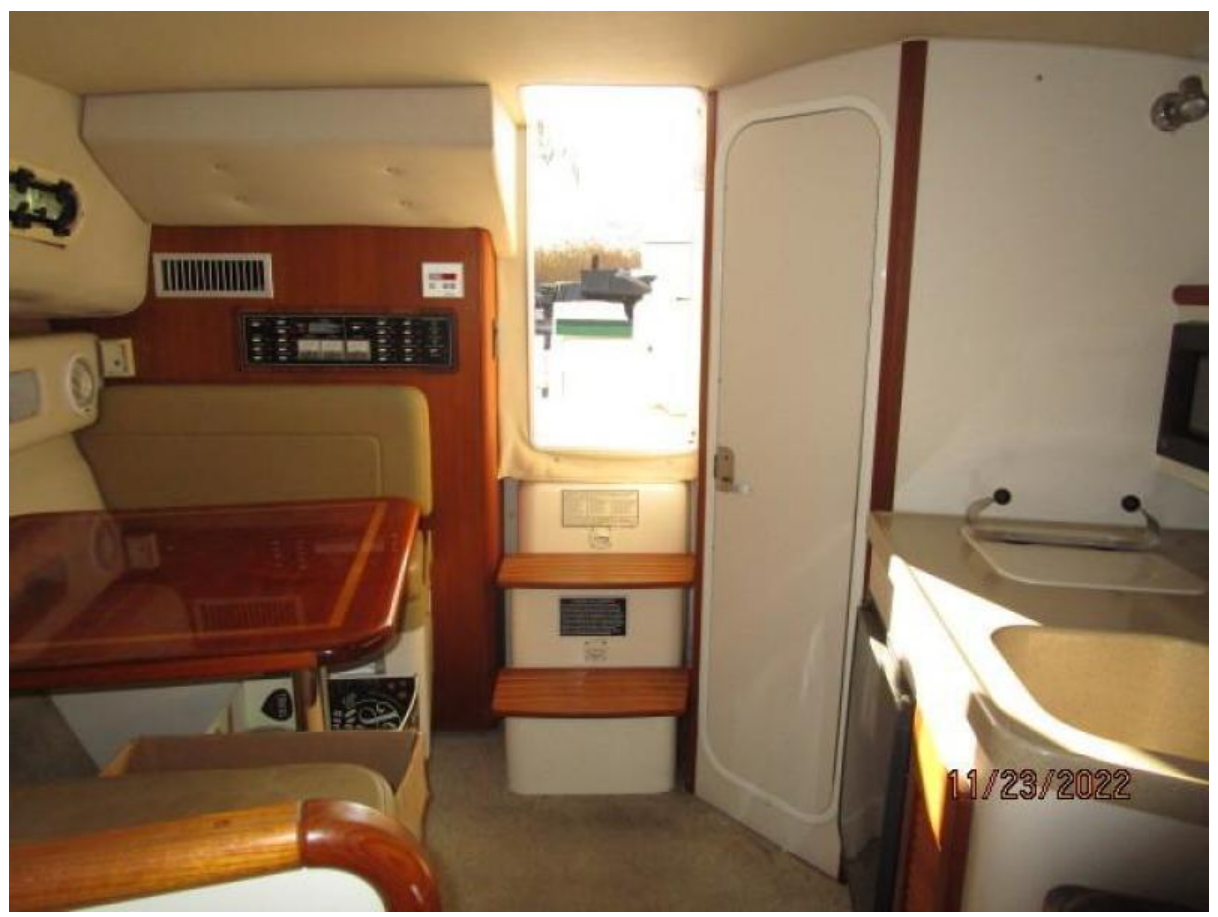
30' Pursuit lower deck aft