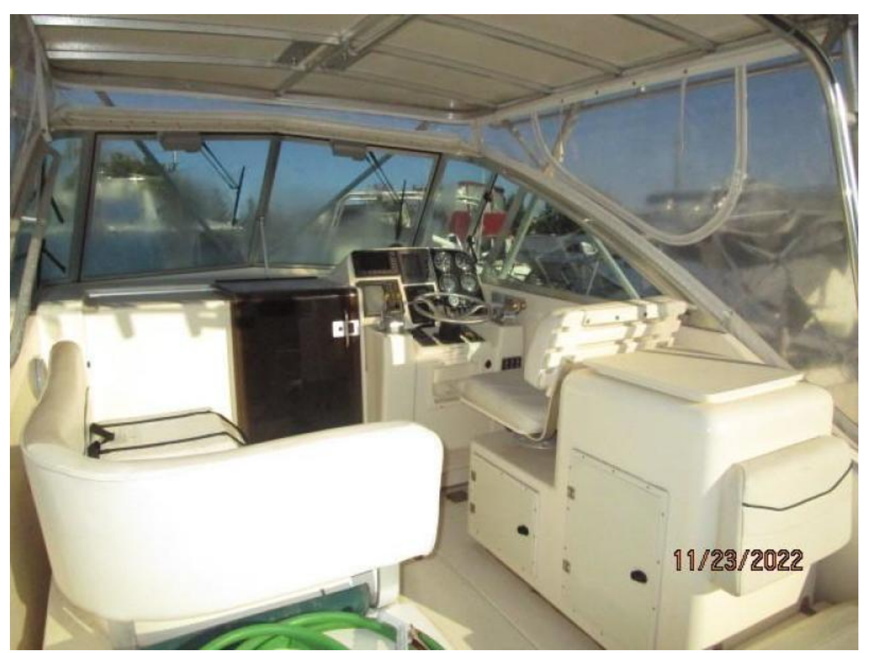
30' Pursuit upper deck forward