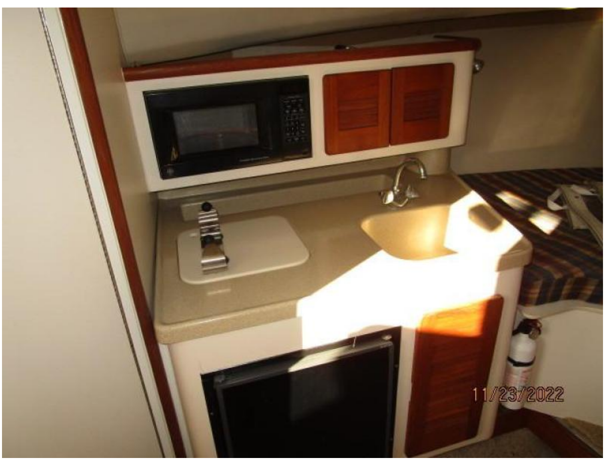
30' Pursuit galley