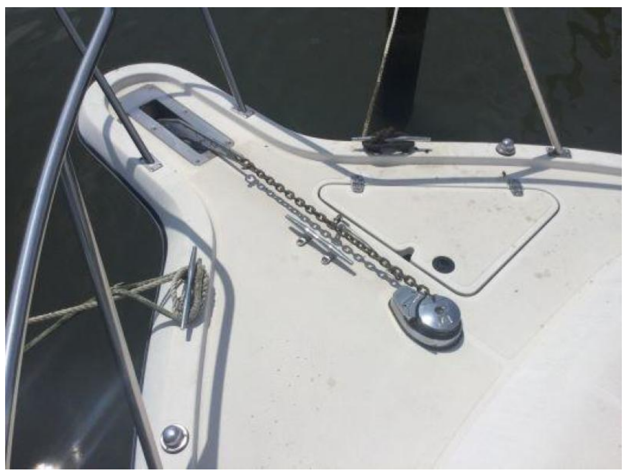
30' Pursuit anchor windlass