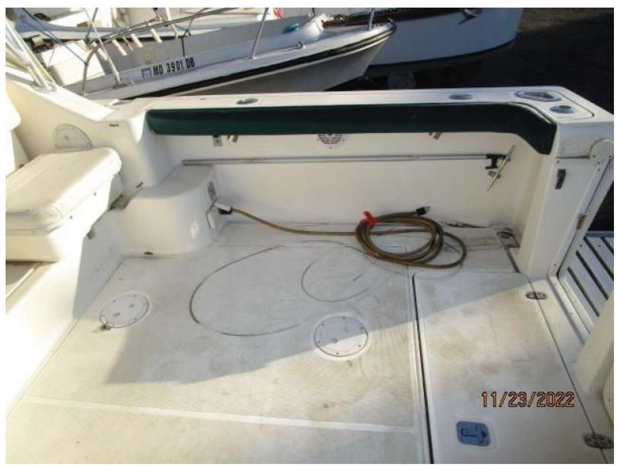
30' Pursuit cockpit starboard