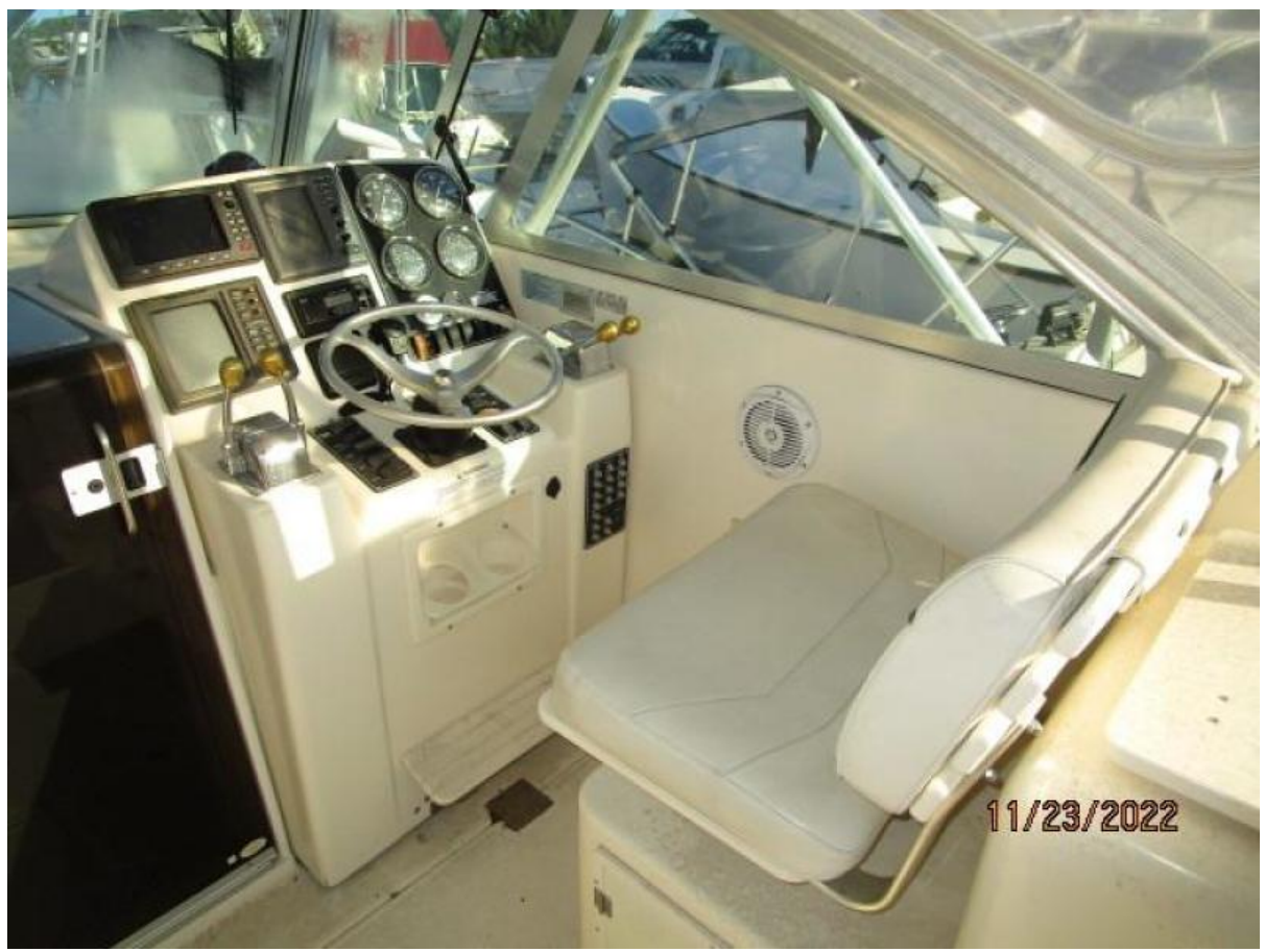
30' Pursuit helm1