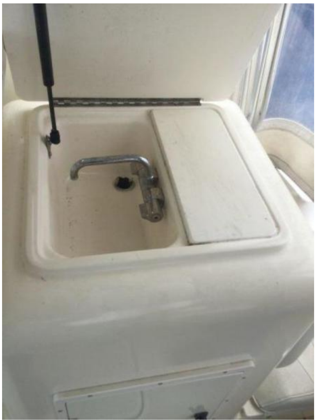
30' Pursuit cockpit sink