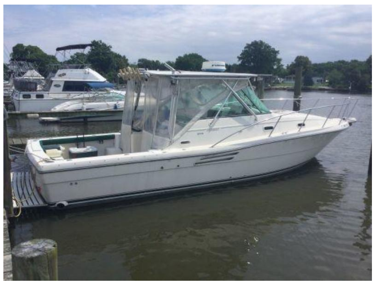
30' Pursuit starboard aft profile1