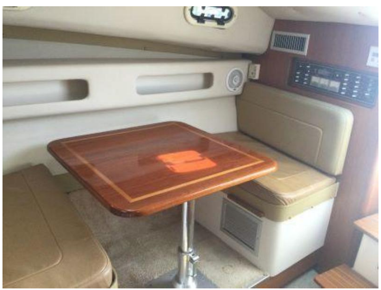
30' Pursuit dinette