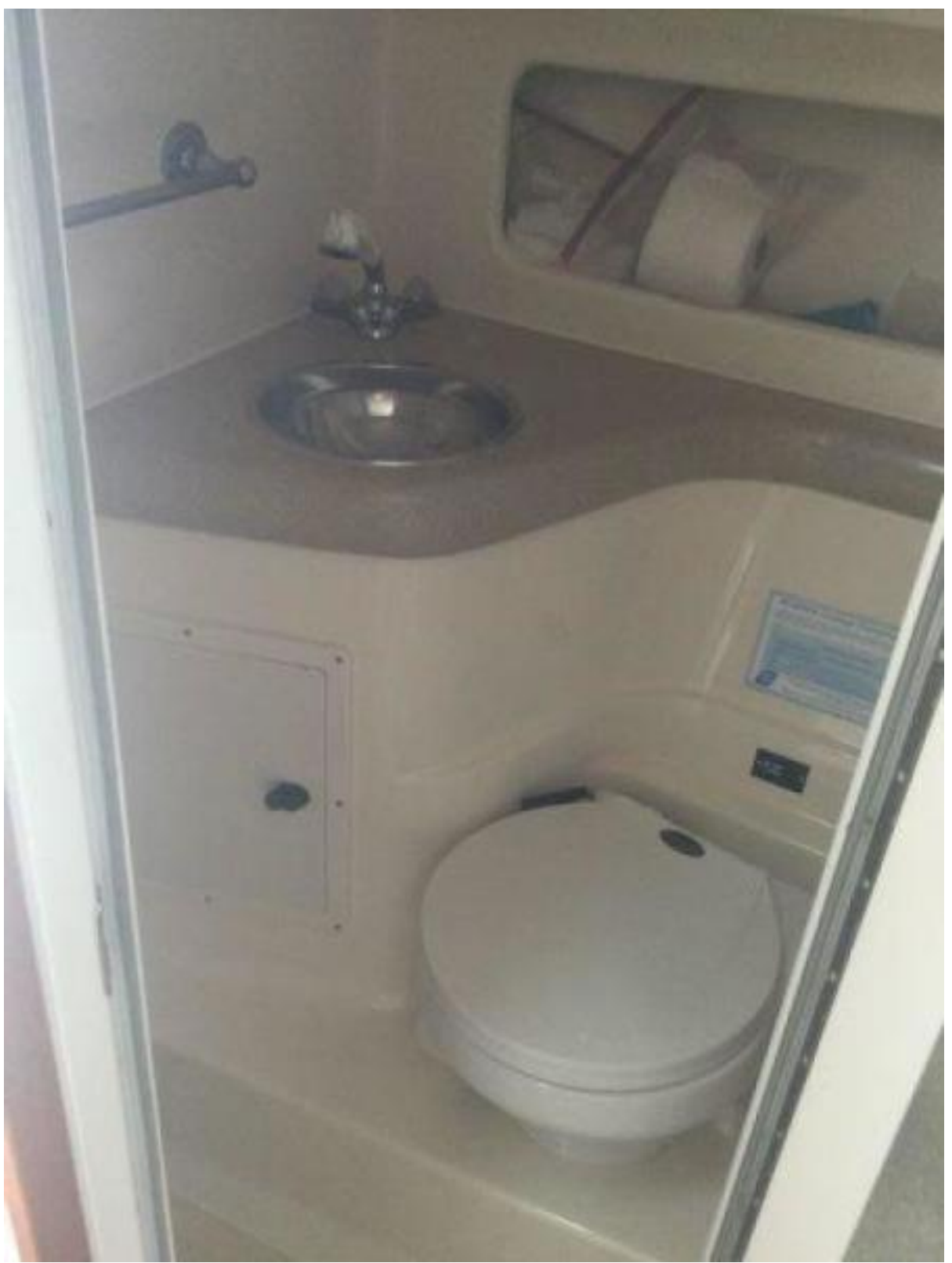
30' Pursuit head