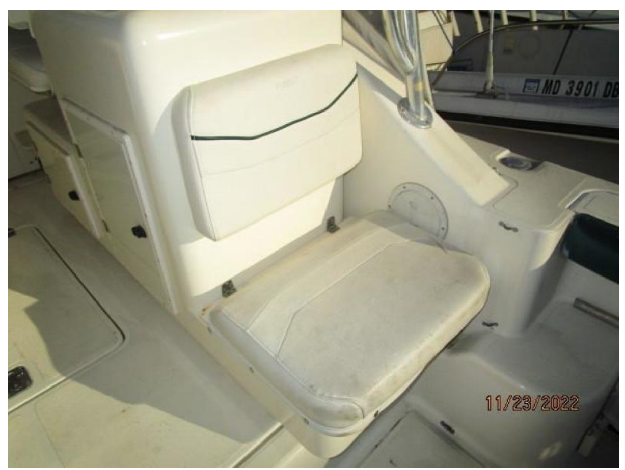
30' Pursuit cockpit seating