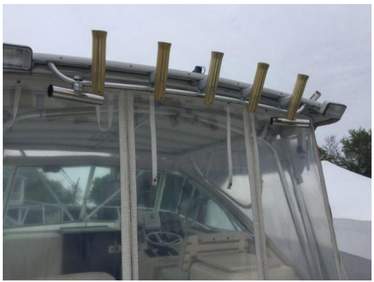
30' Pursuit Eisenglass enclosure2