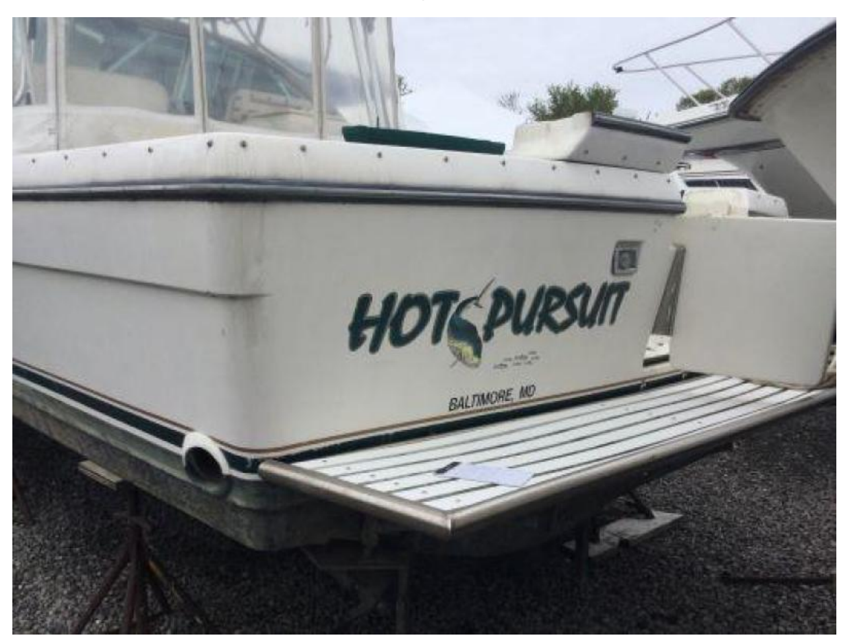
30' Pursuit swimplatform