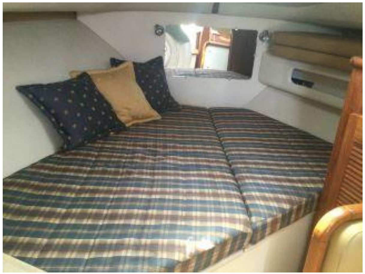
30' Pursuit stateroom1