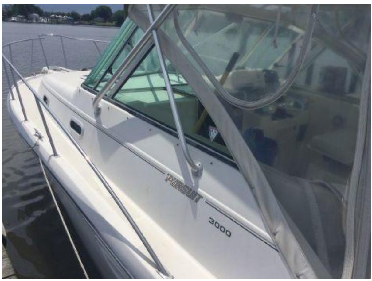
30' Pursuit port side deck