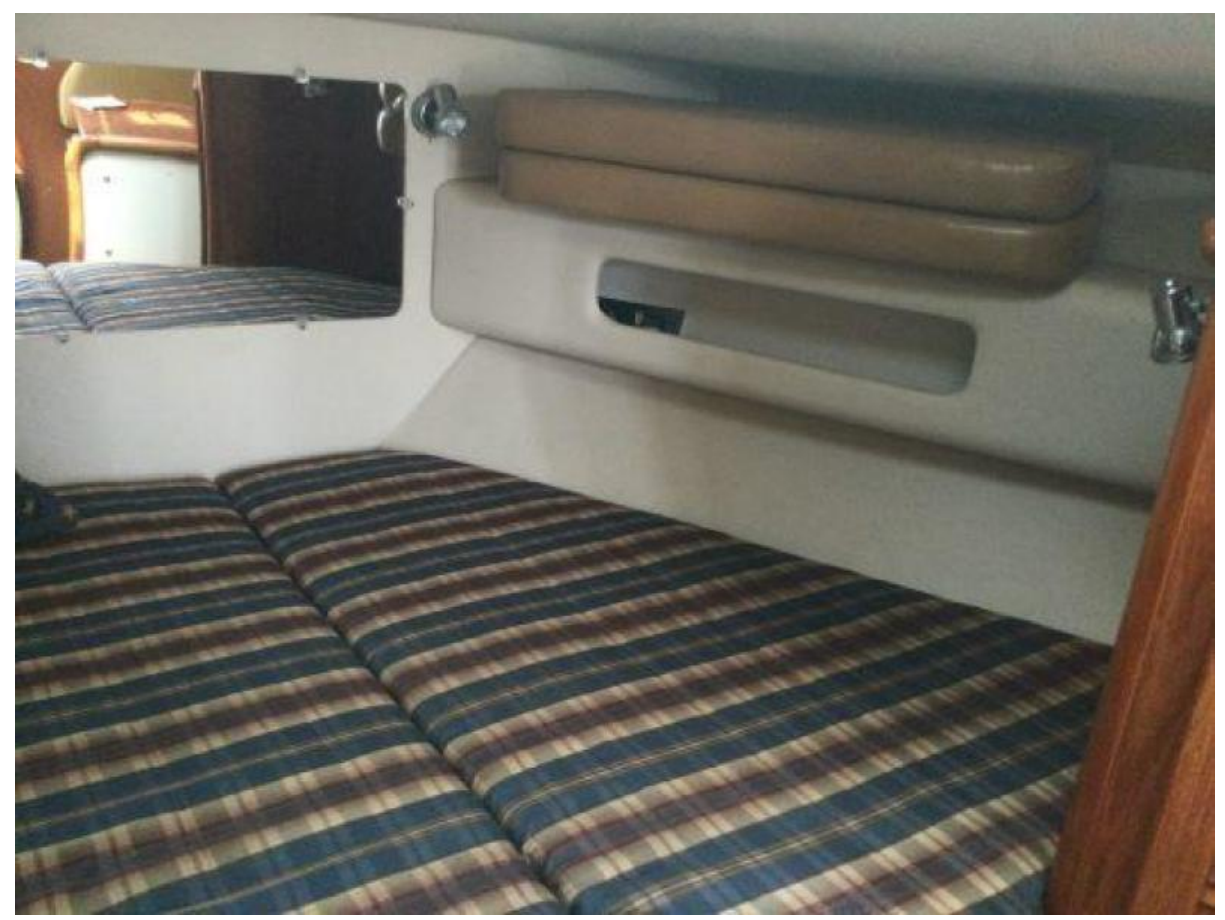
30' Pursuit stateroom2