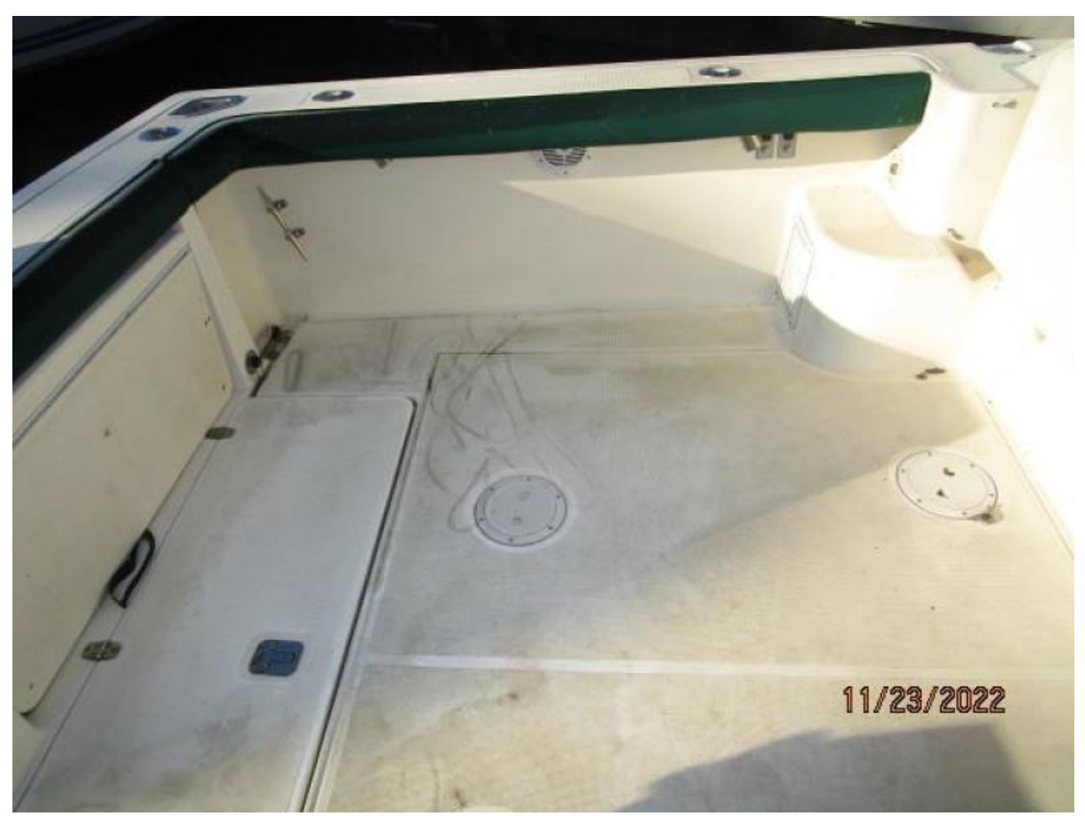
30' Pursuit cockpit port