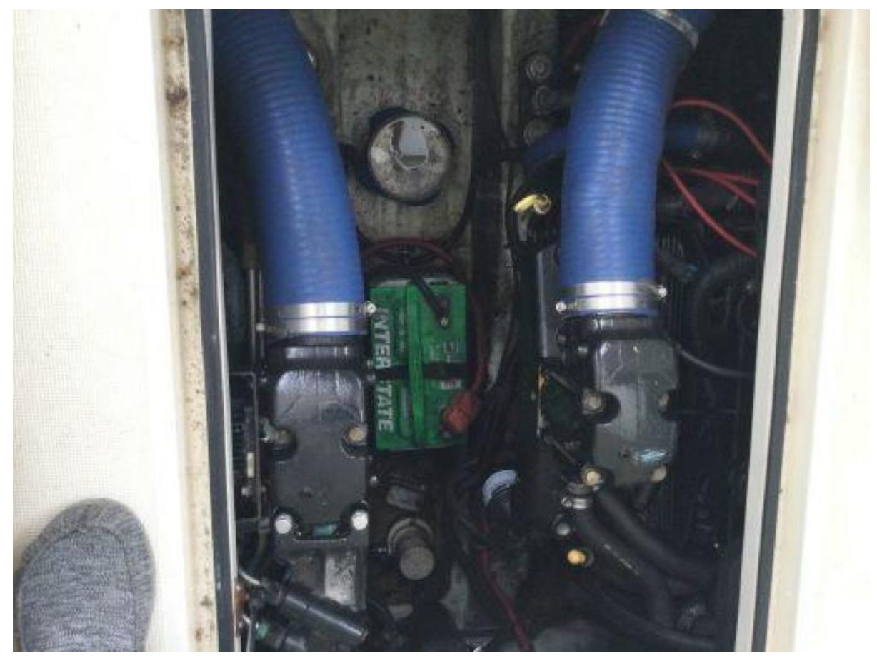
30' Pursuit engine room access