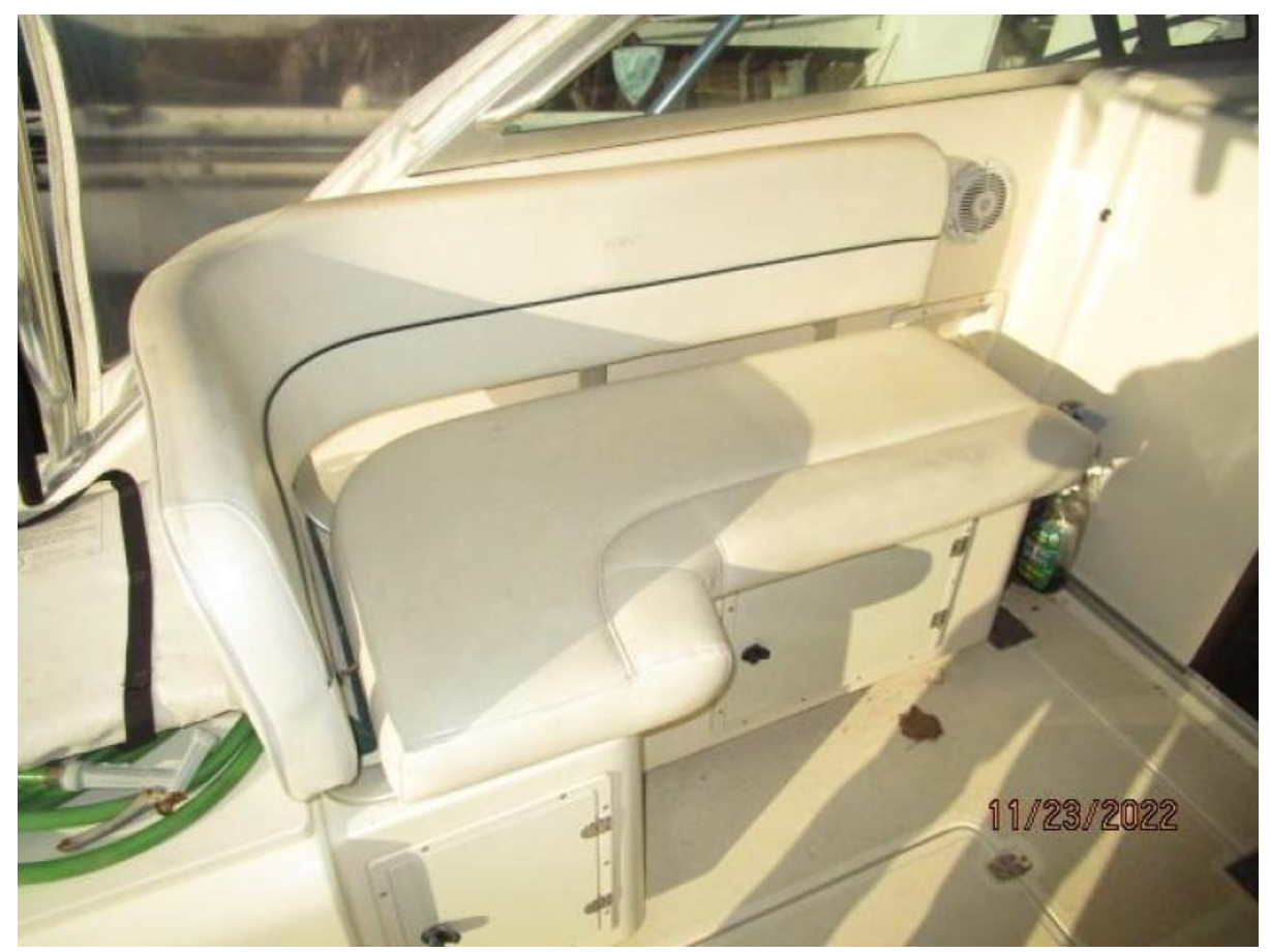
30' Pursuit upper deck port seating