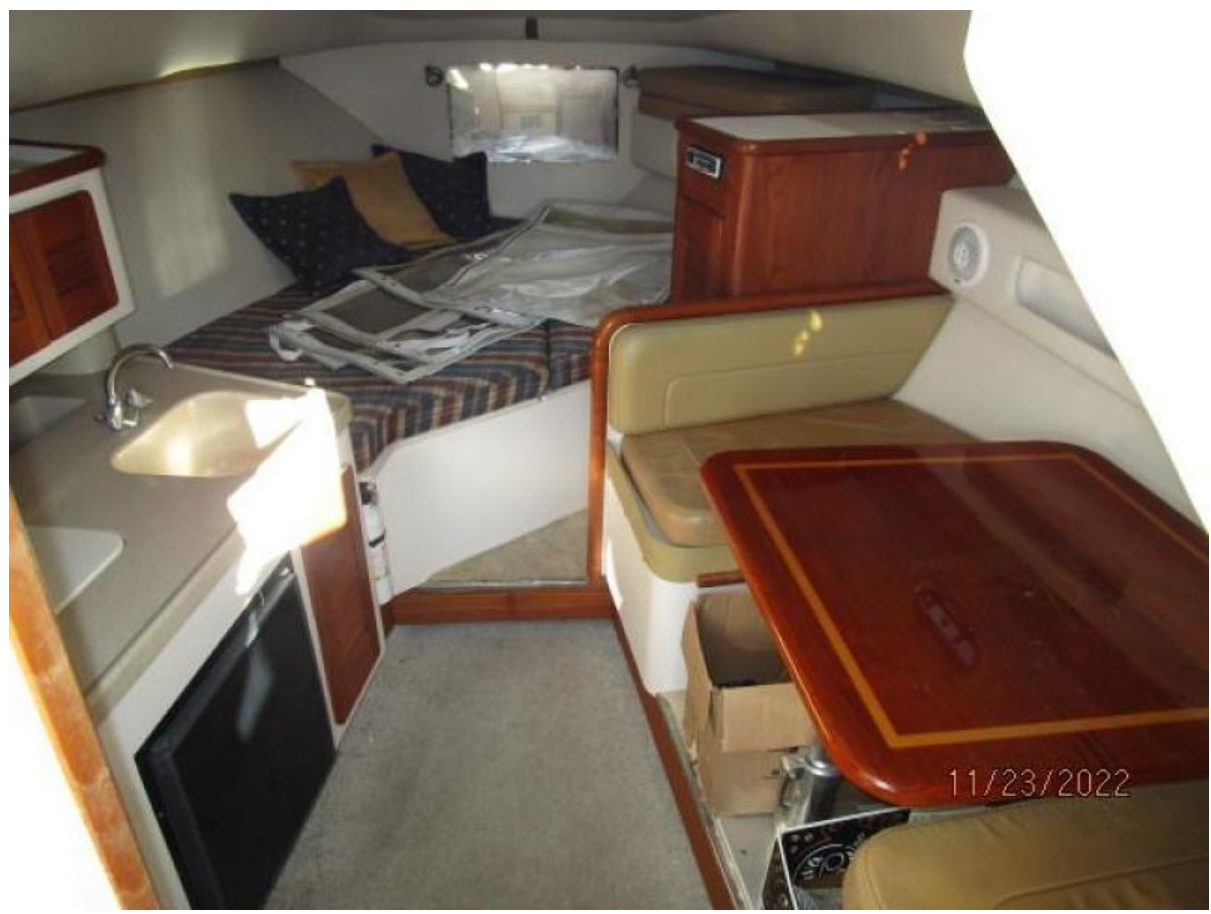
30' Pursuit lower deck forward