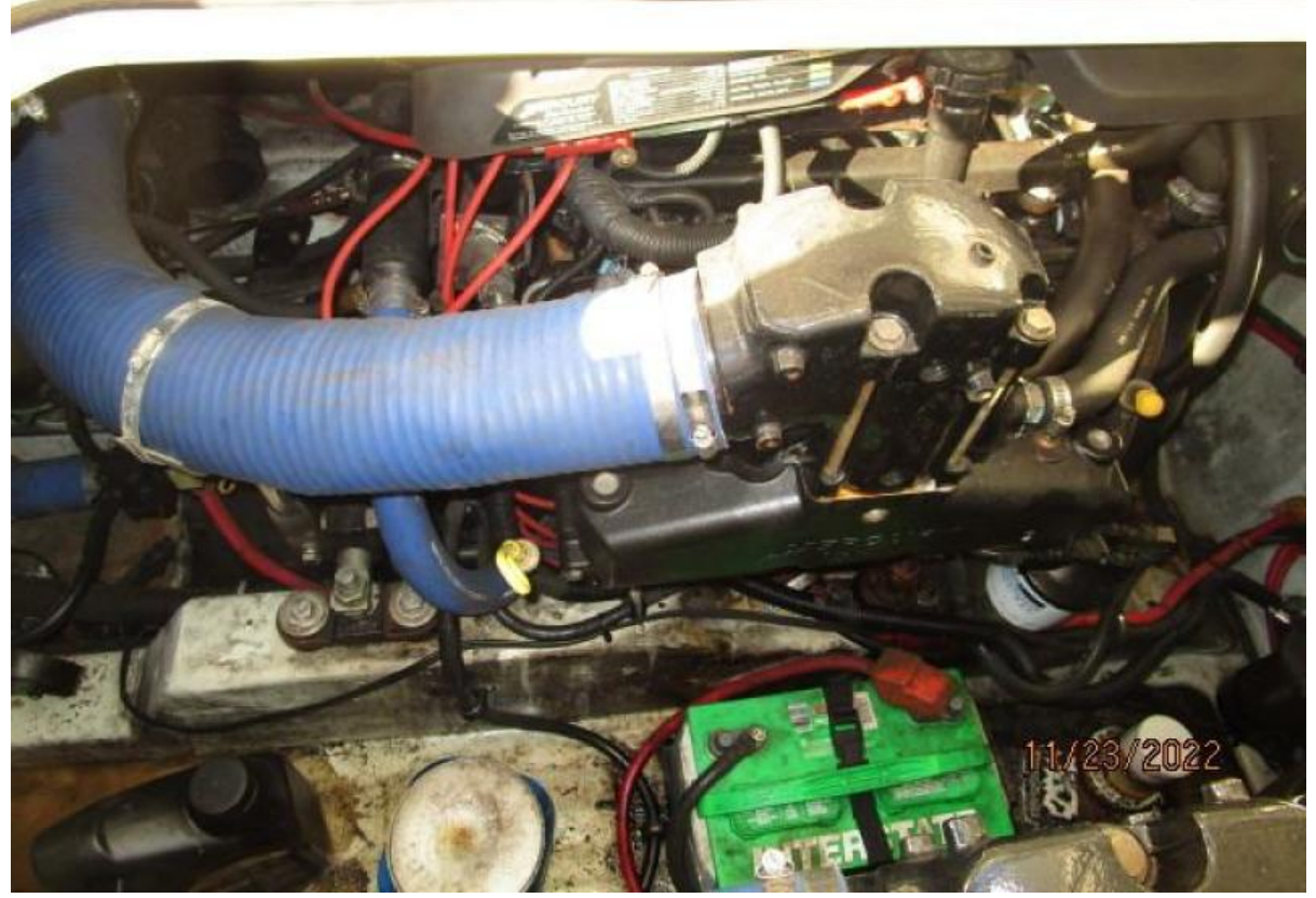
30' Pursuit port main engine