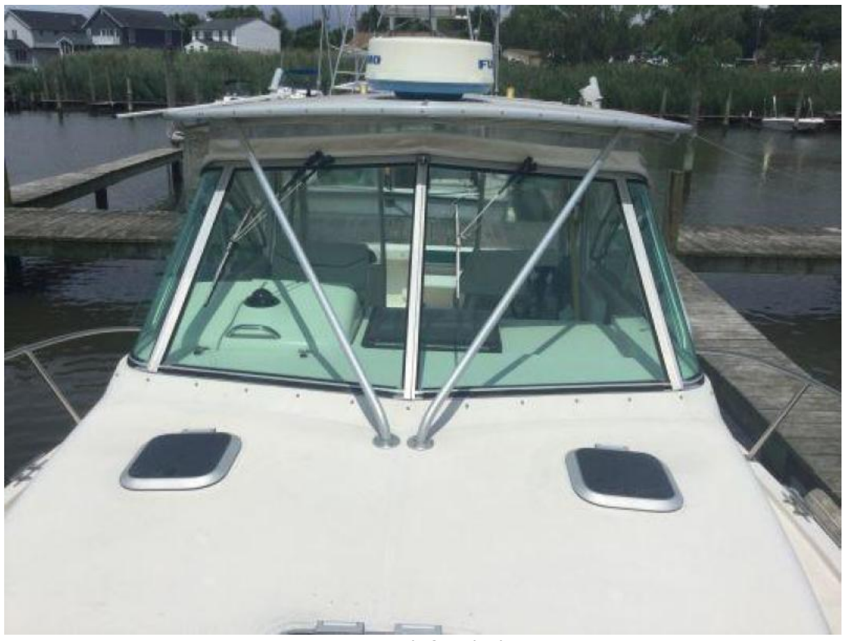
30' Pursuit foredeck