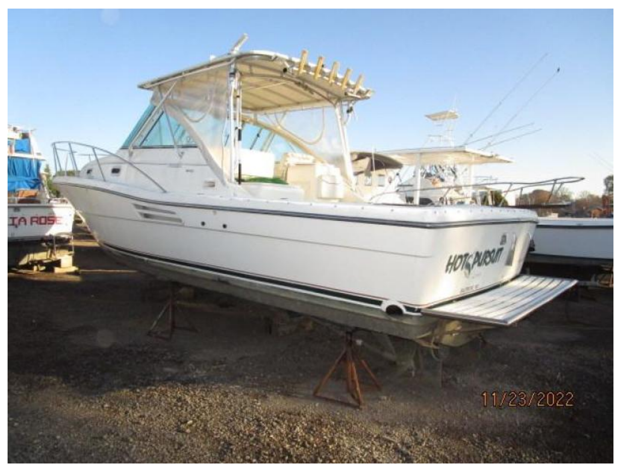
30' Pursuit port aft profile