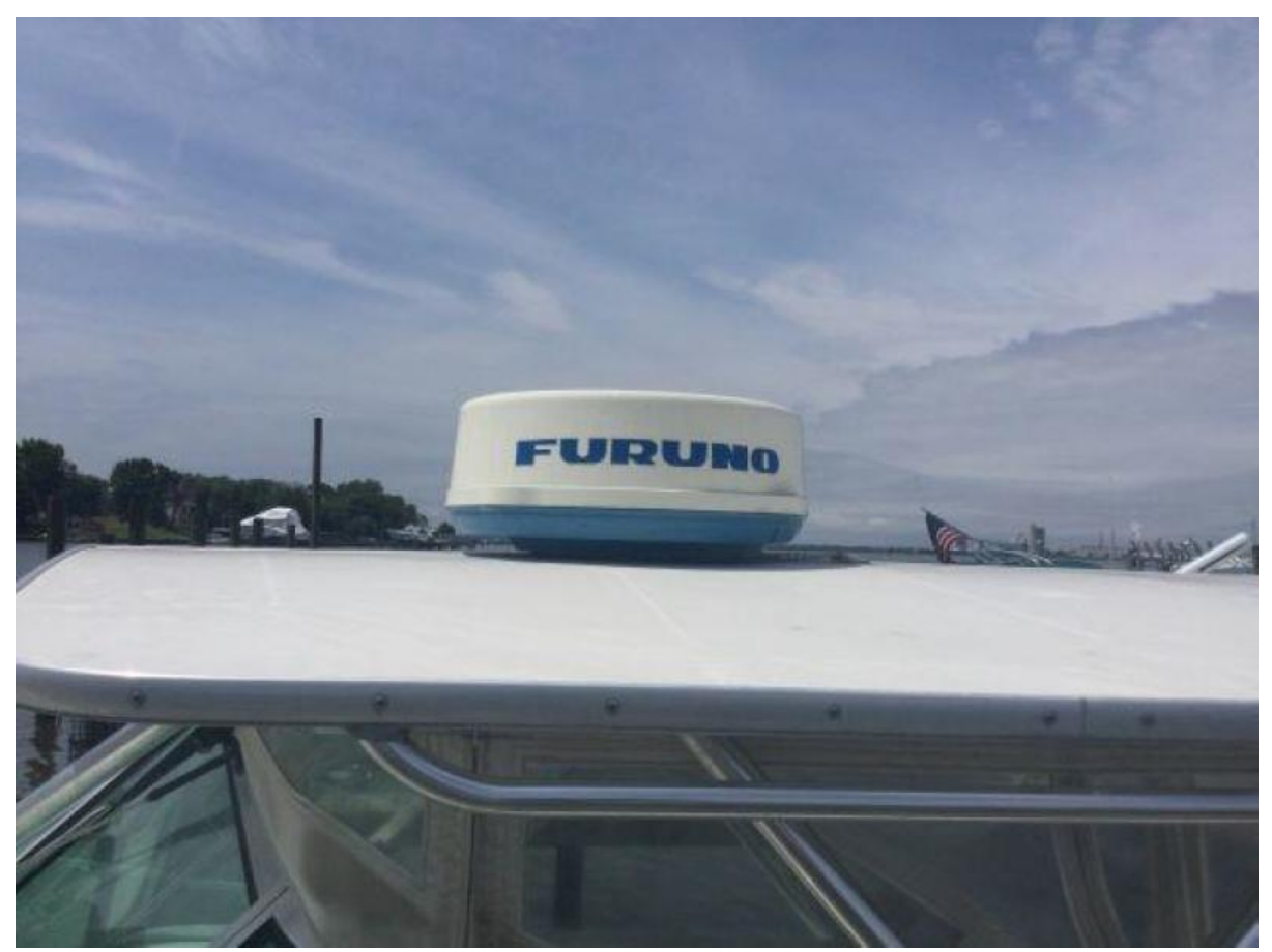
30' Pursuit Radar