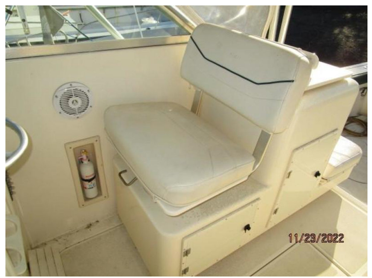
30' Pursuit helmseat