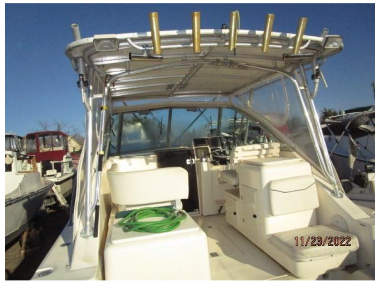
30' Pursuit cockpit forward