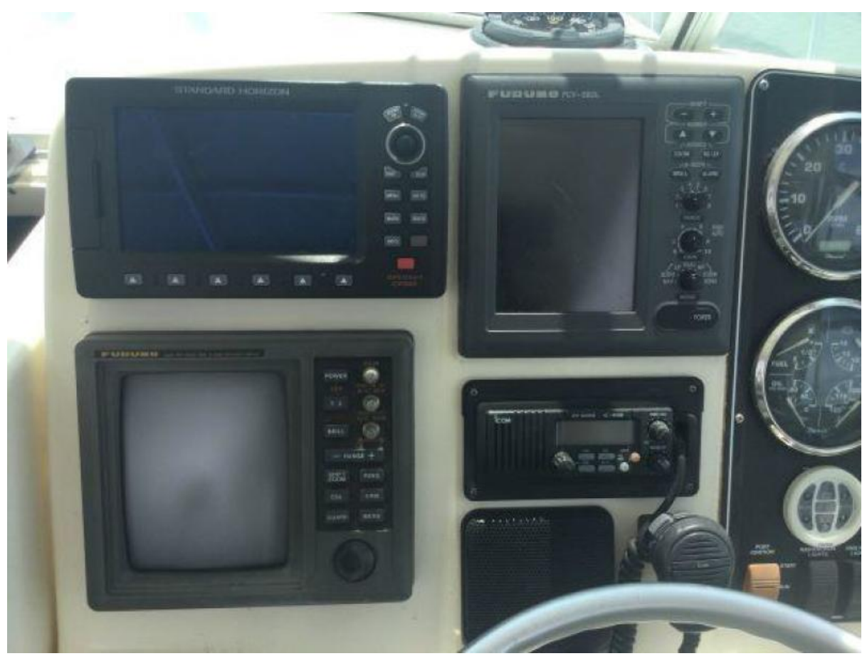
30' Pursuit helm3