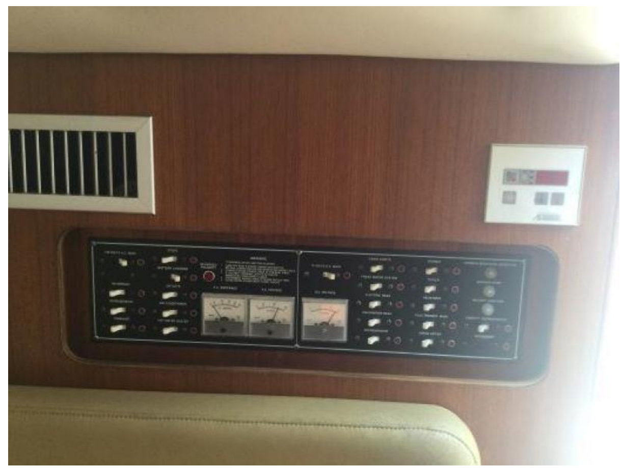
30' Pursuit electrical panel