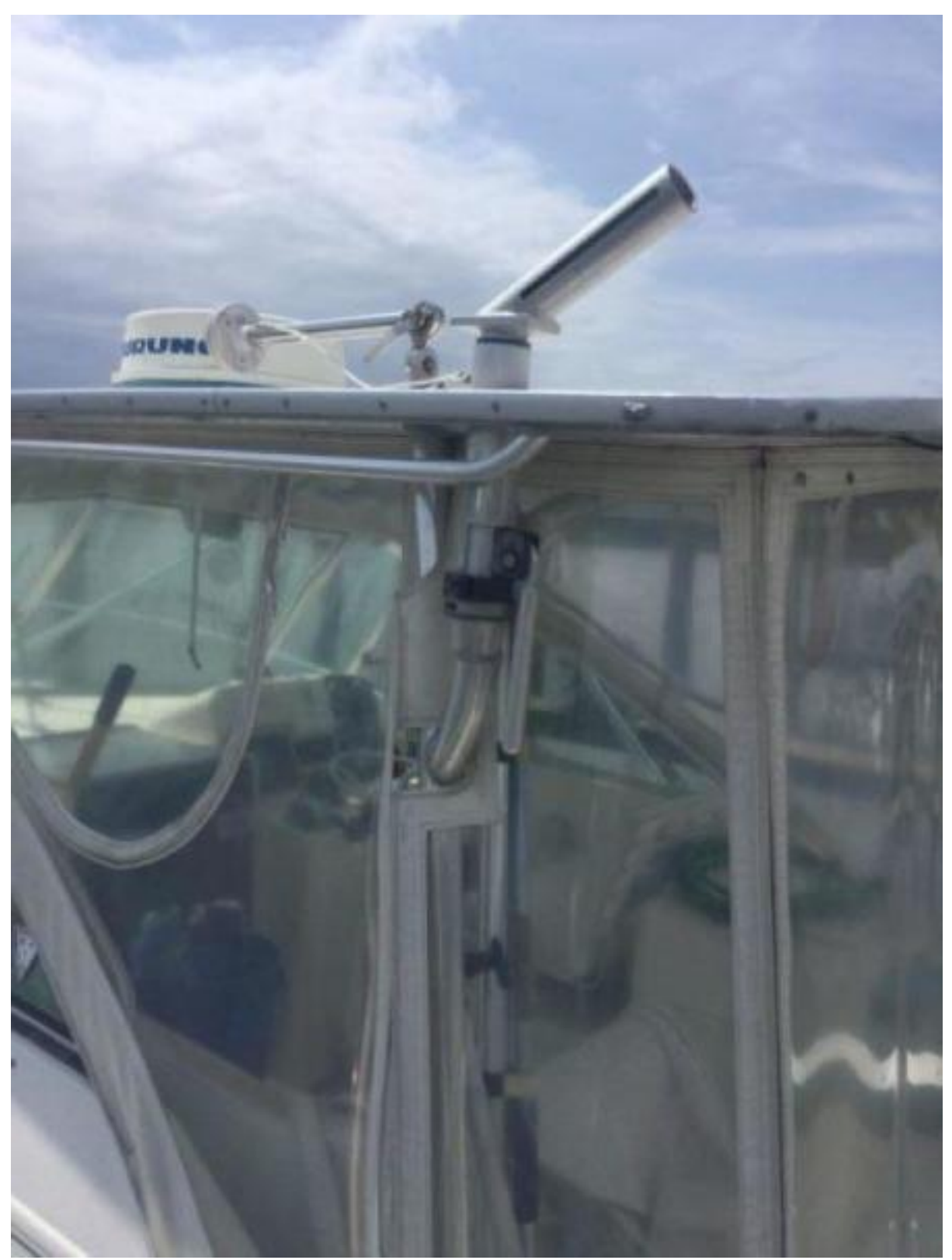
30' Pursuit Eisenglass enclosure1