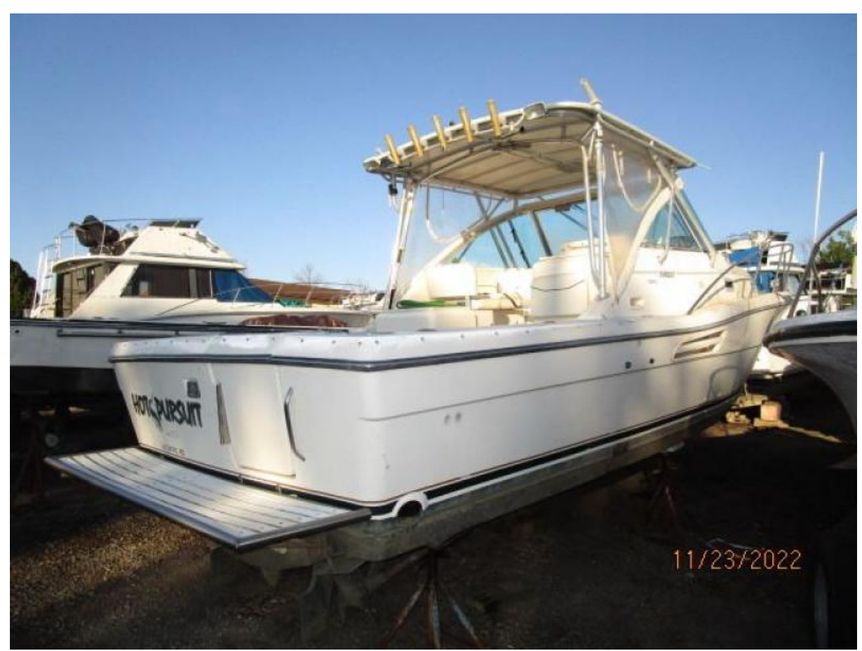
31' Pursuit starboard aft profile2