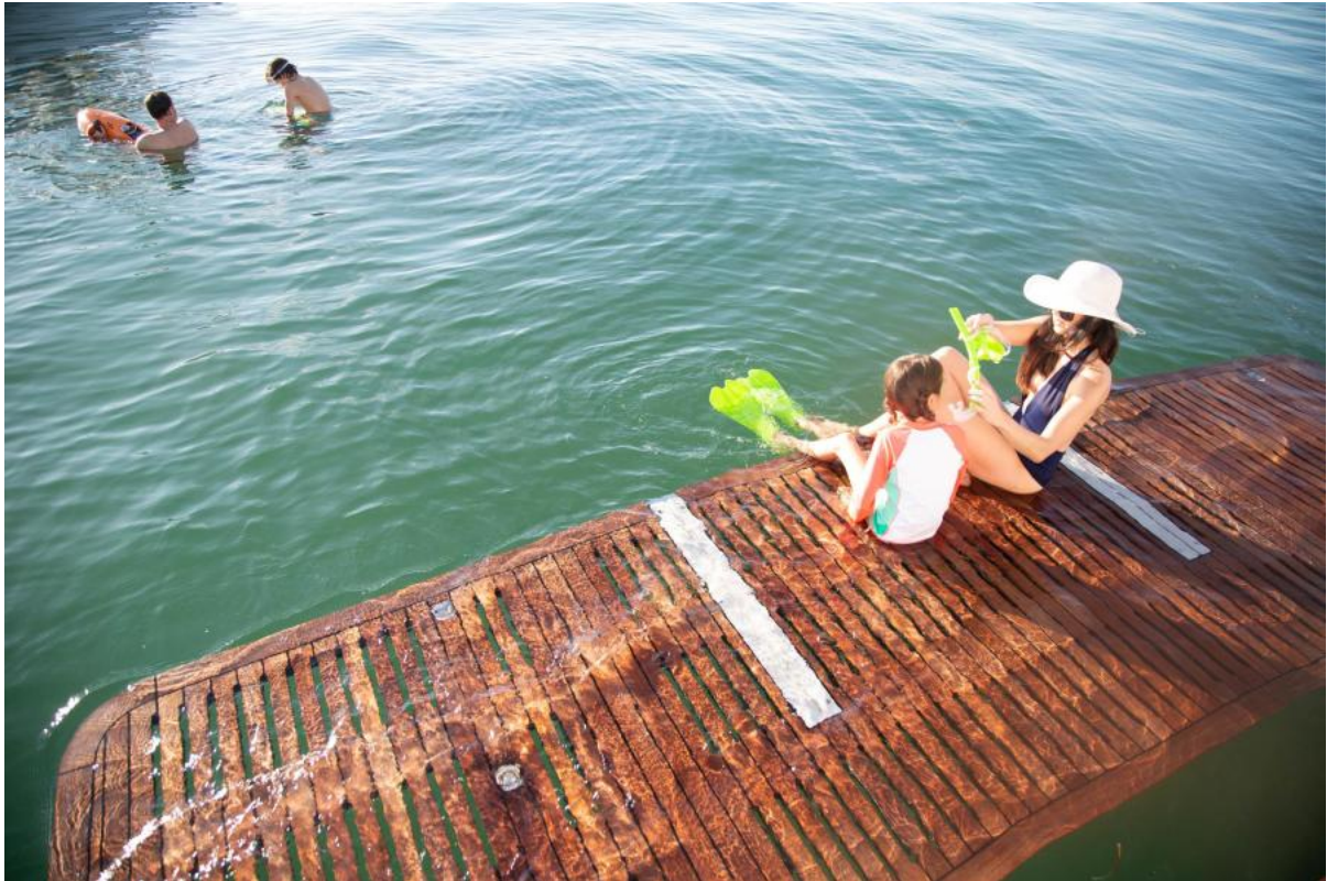
Swim Platform/Beach Club