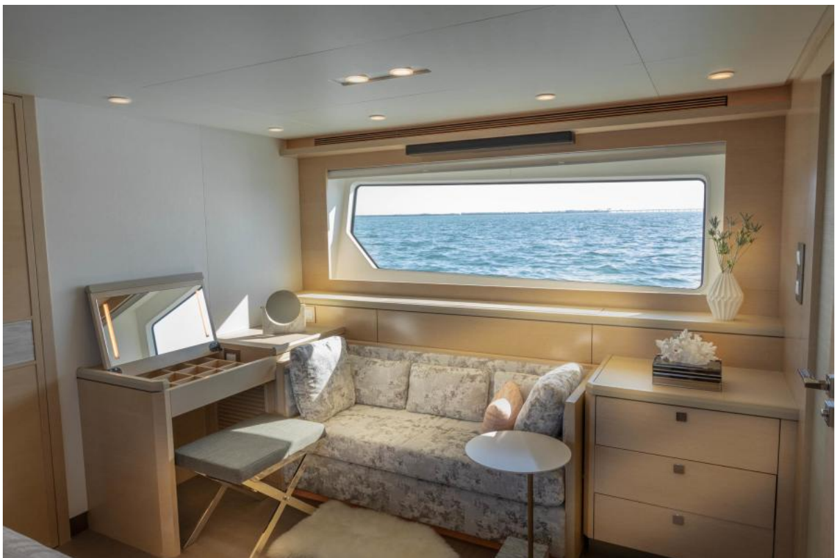
Primary settee and vanity