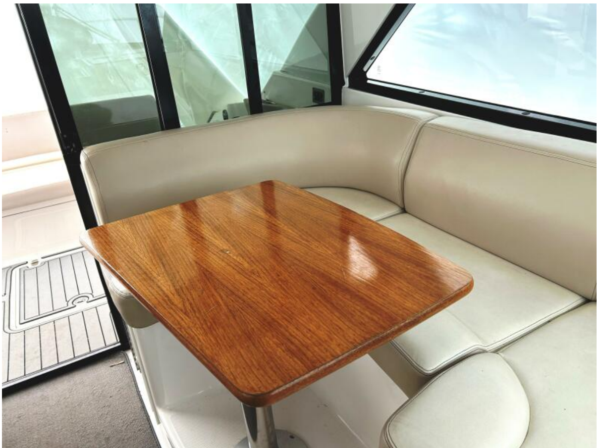
Helm Deck, port aft