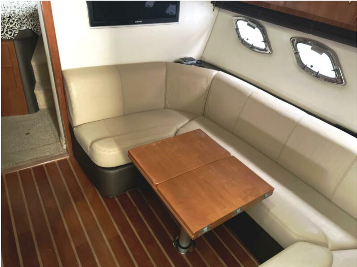
Salon, starboard side