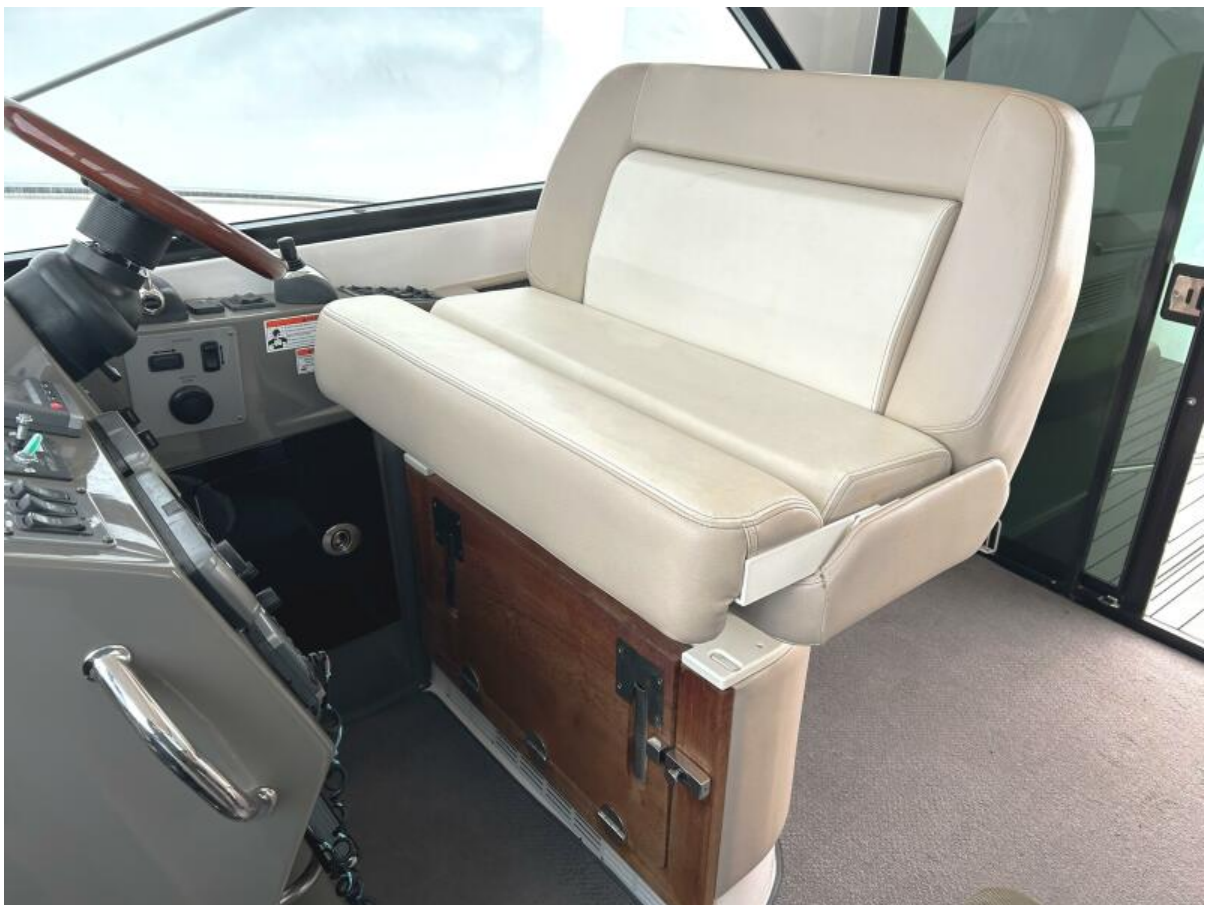
Helm Station seating