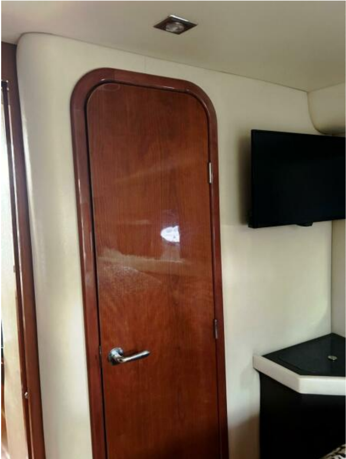
Master Stateroom Head entrance, port side