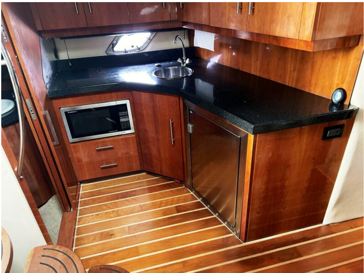
Galley, port side