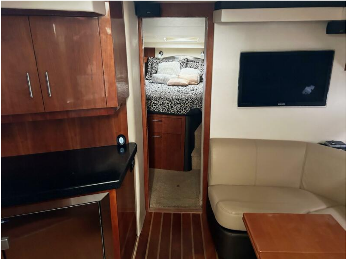
Salon forward to Master Stateroom