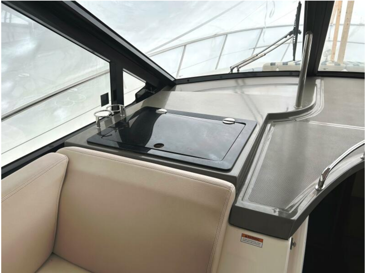
Helm Deck, port side aft