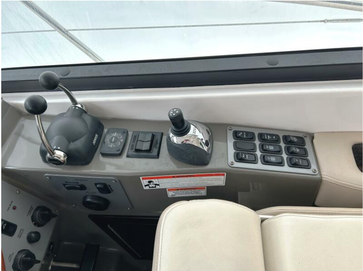
Engine & JoyStick IPS controller