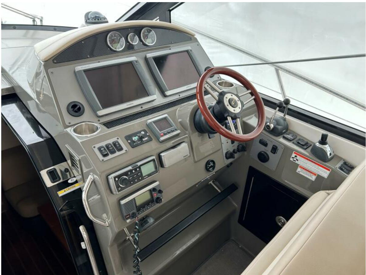
Helm Station 2