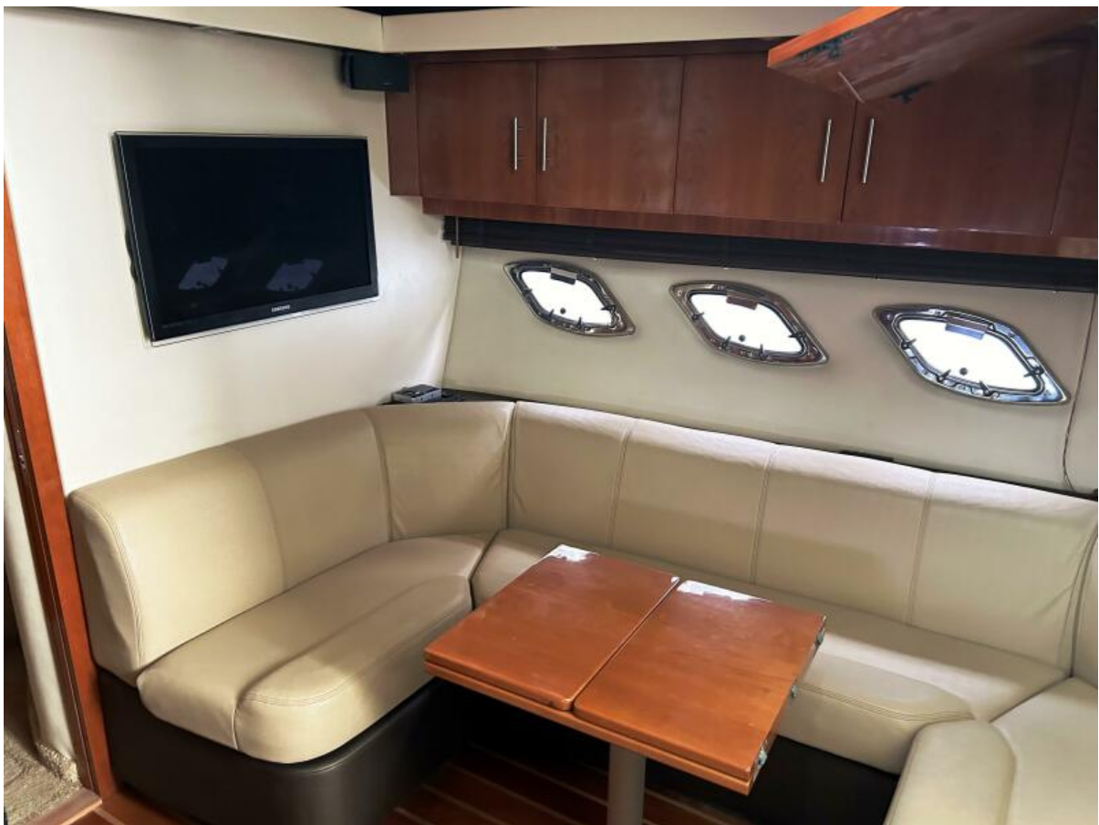
Salon, starboard side 2