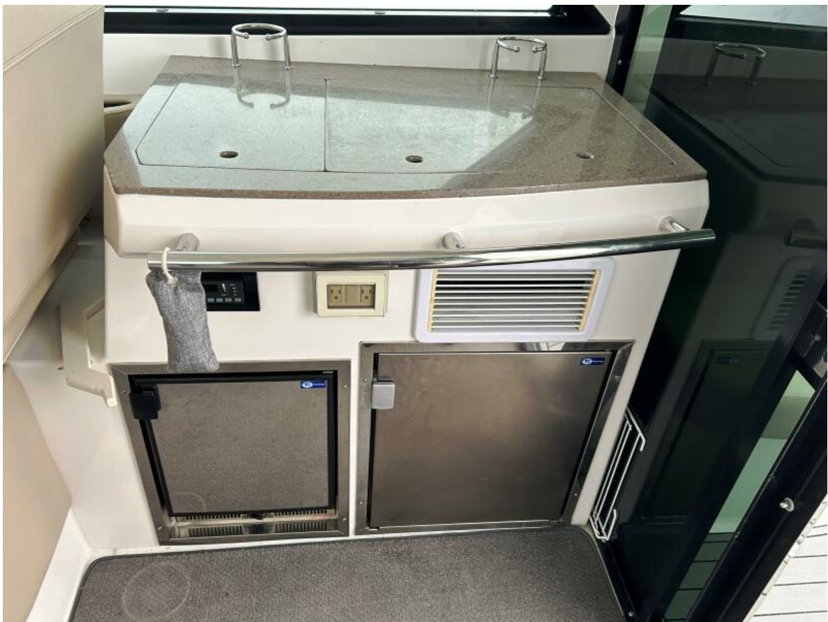
Helm Deck Entertainment Center, port side