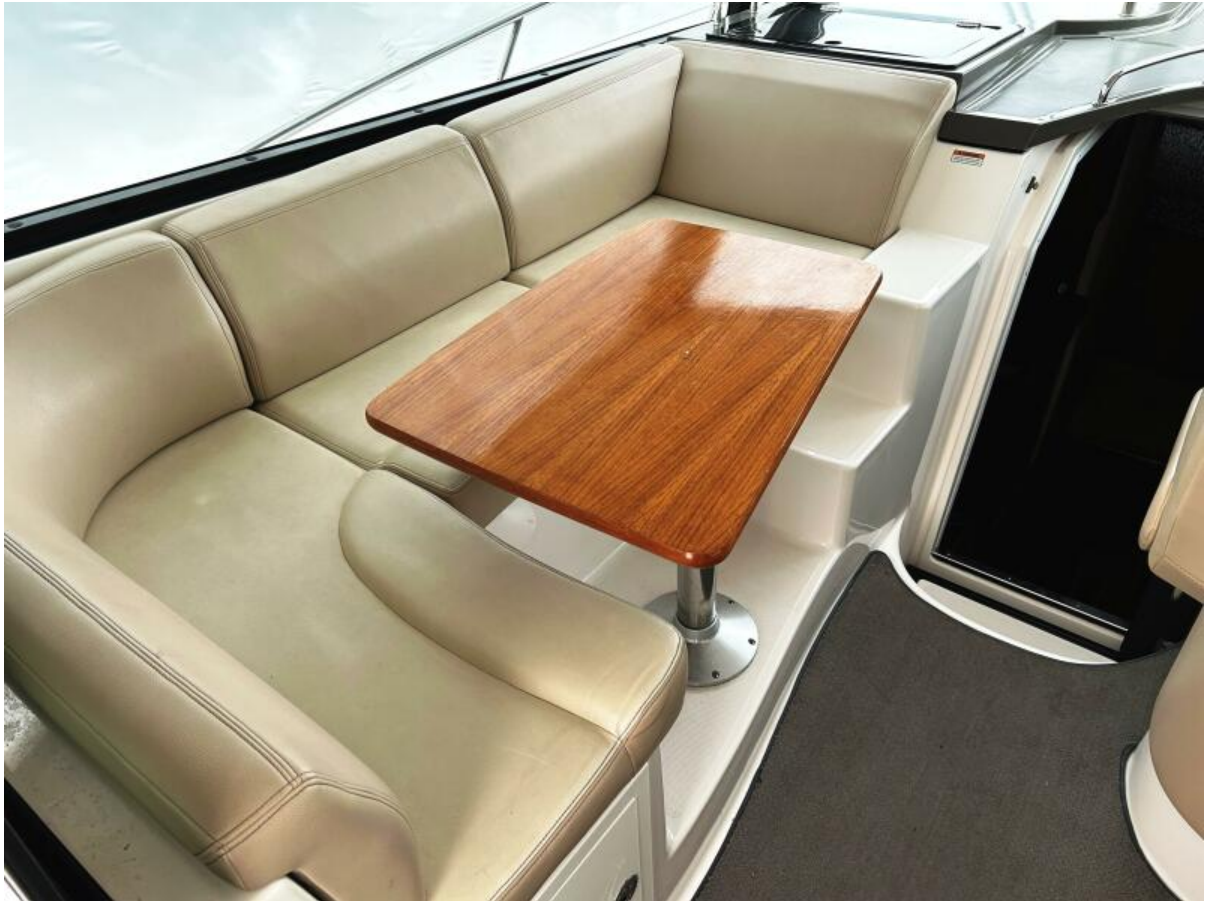
Helm Deck seating, port side