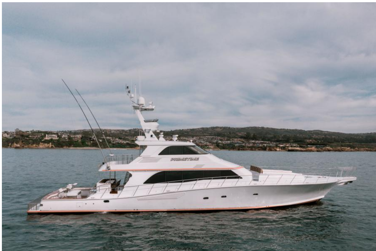
2002 Queenship Custom 98 Sportfisher - PRIME TIME Profile