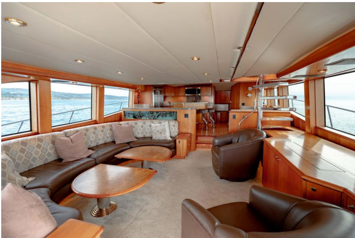
2002 Queenship Custom 98 Sportfisher - PRIME TIME Main Salon