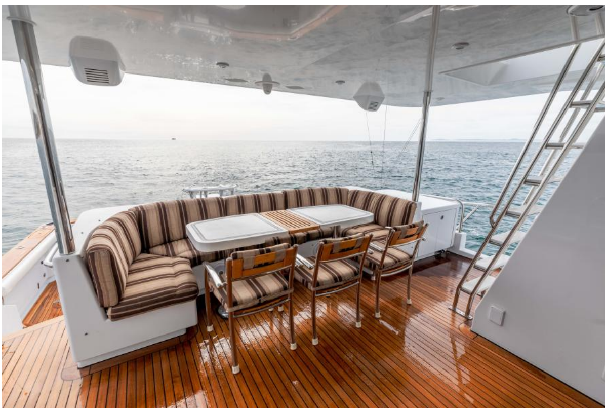
2002 Queenship Custom 98 Sportfisher - PRIME TIME California Deck