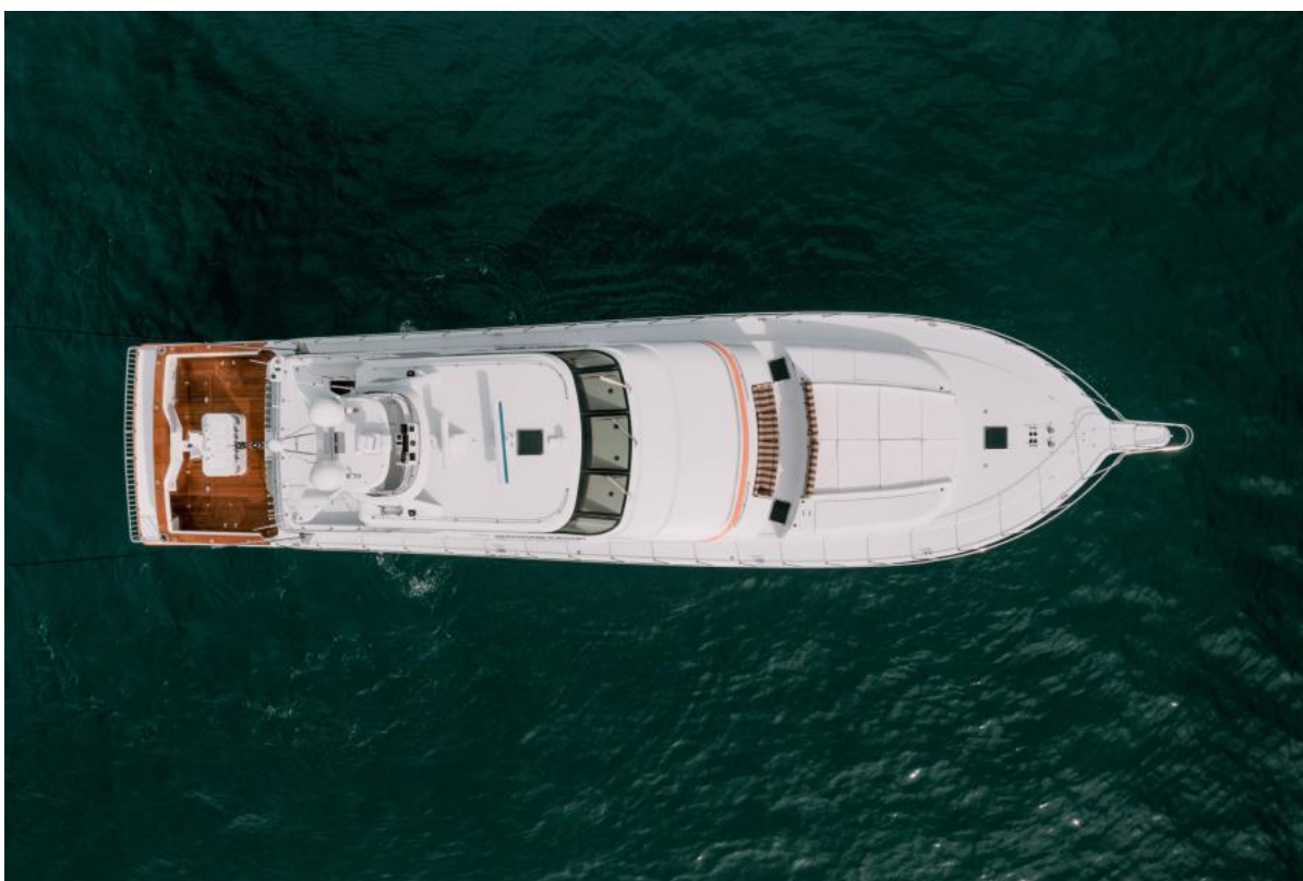
2002 Queenship Custom 98 Sportfisher - PRIME TIME Aerial