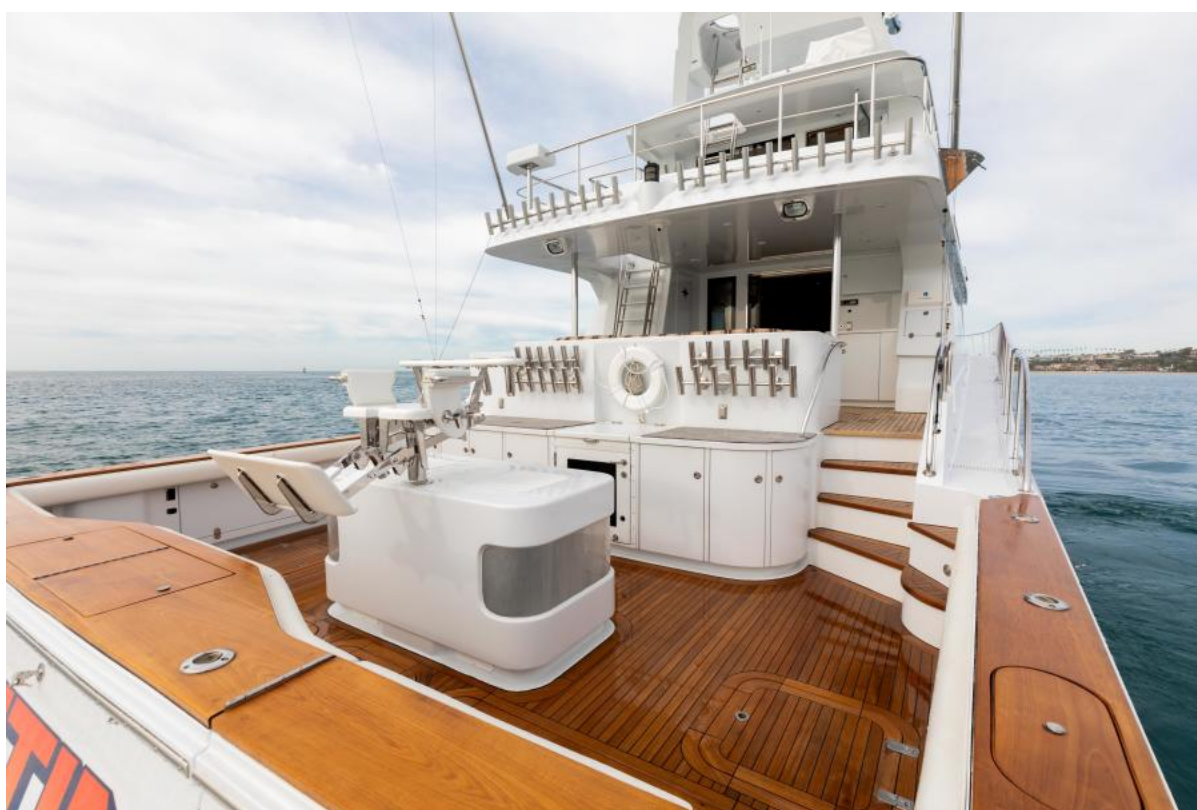
2002 Queenship Custom 98 Sportfisher - PRIME TIME Cockpit