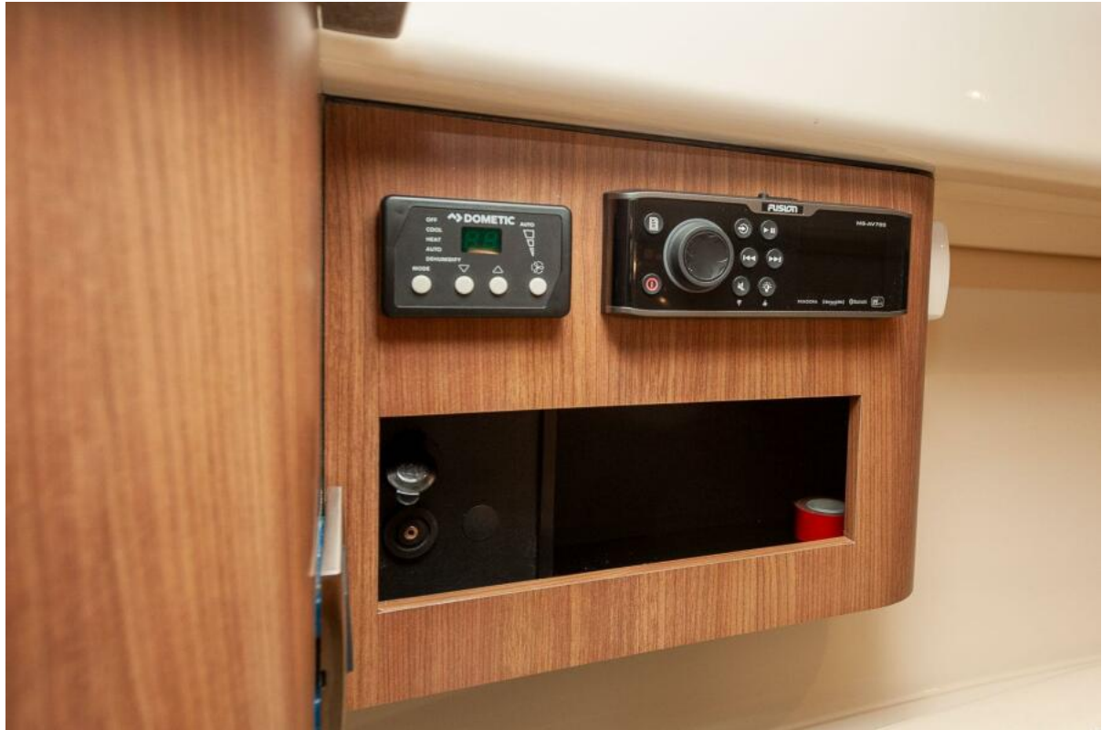
Marine Air and Domestic AC Systems / Radio