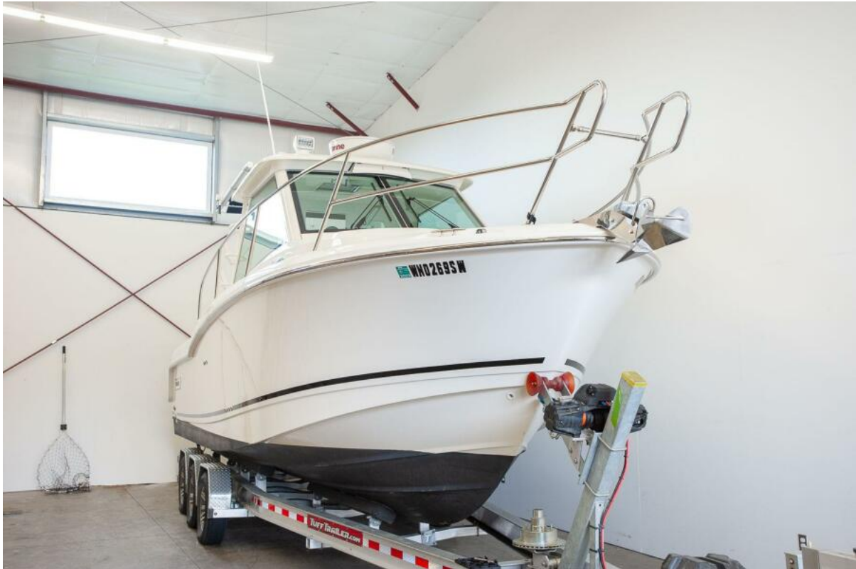
285 CONQUEST, 28' (8.53m) Boston Whaler 2019