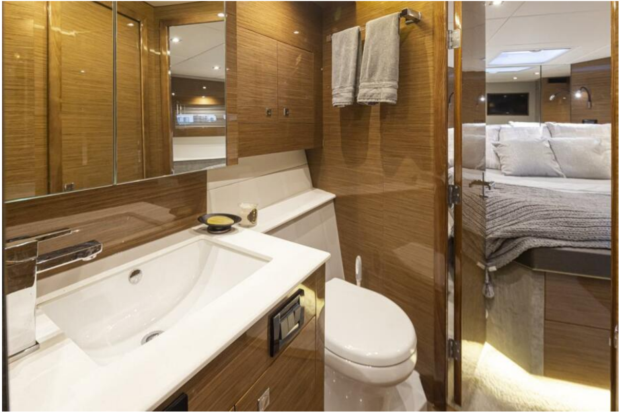
VIP Stateroom Ensuite