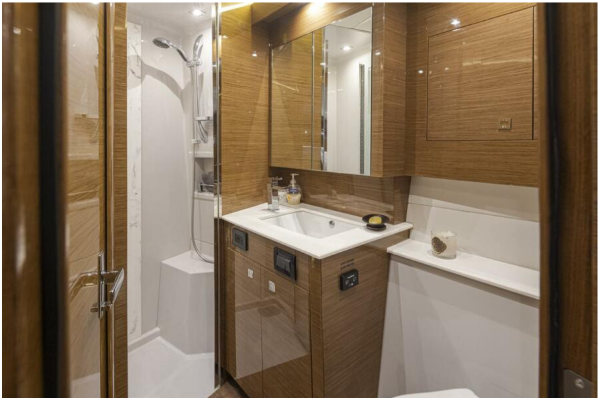
VIP Stateroom Ensuite