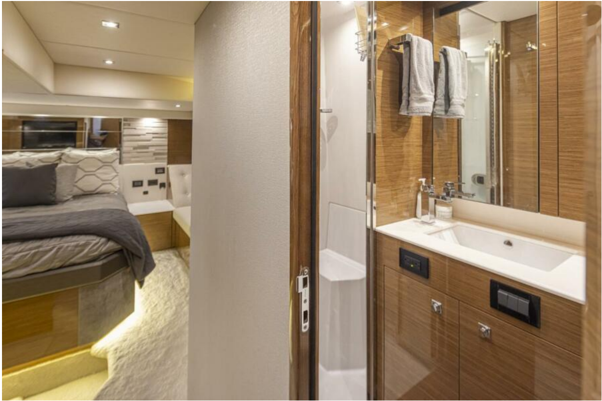
Owner's Stateroom Ensuite