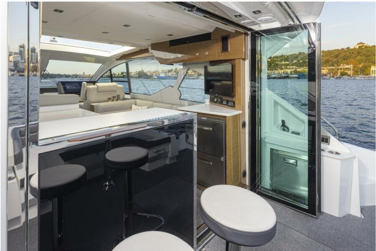
Aft Deck Bar