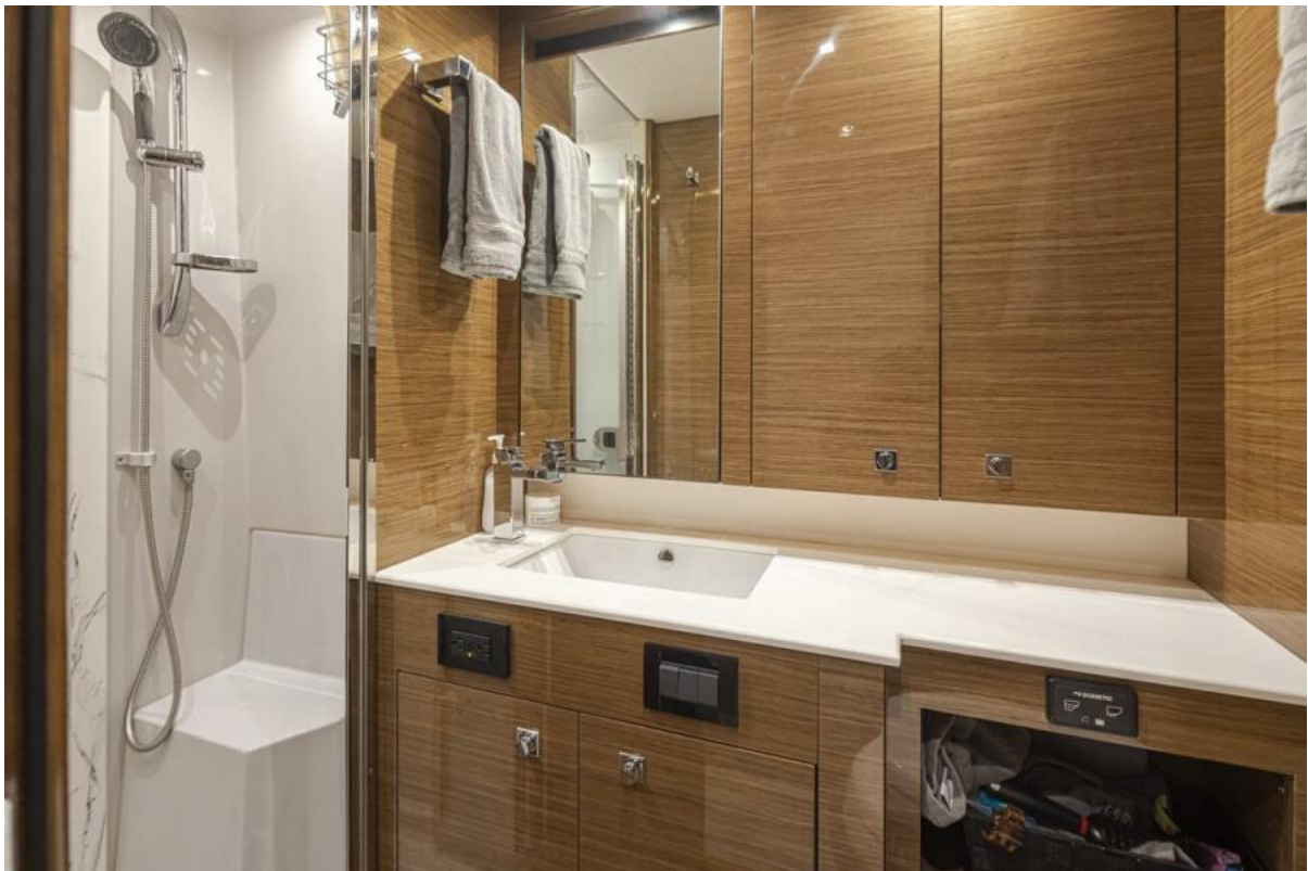
Owner's Stateroom Ensuite