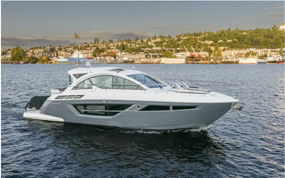
BLU WAVE (Name Reserved), 50' (15.24m) Cruisers Yacht 2018