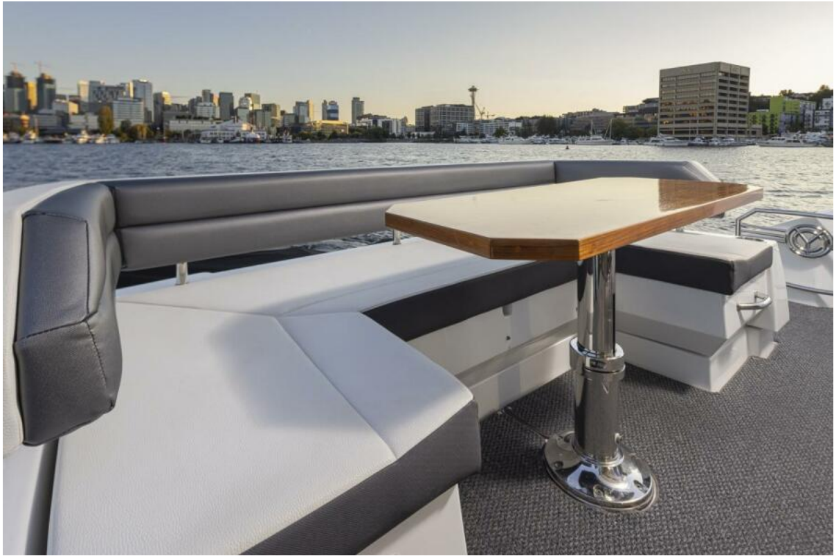
Aft Deck Settee