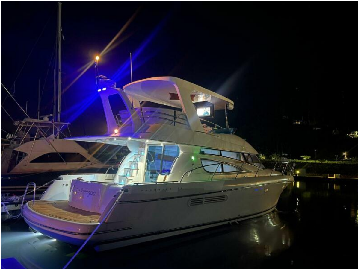
Night Profile Prestige 460 for sale in Costa Rica