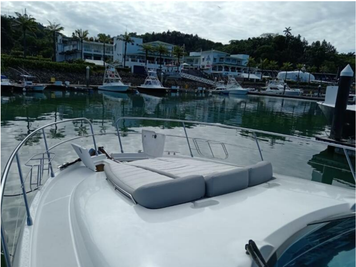
Foredeck Forward View Quepos Costa Rica yacht for sale - Prestige 46'