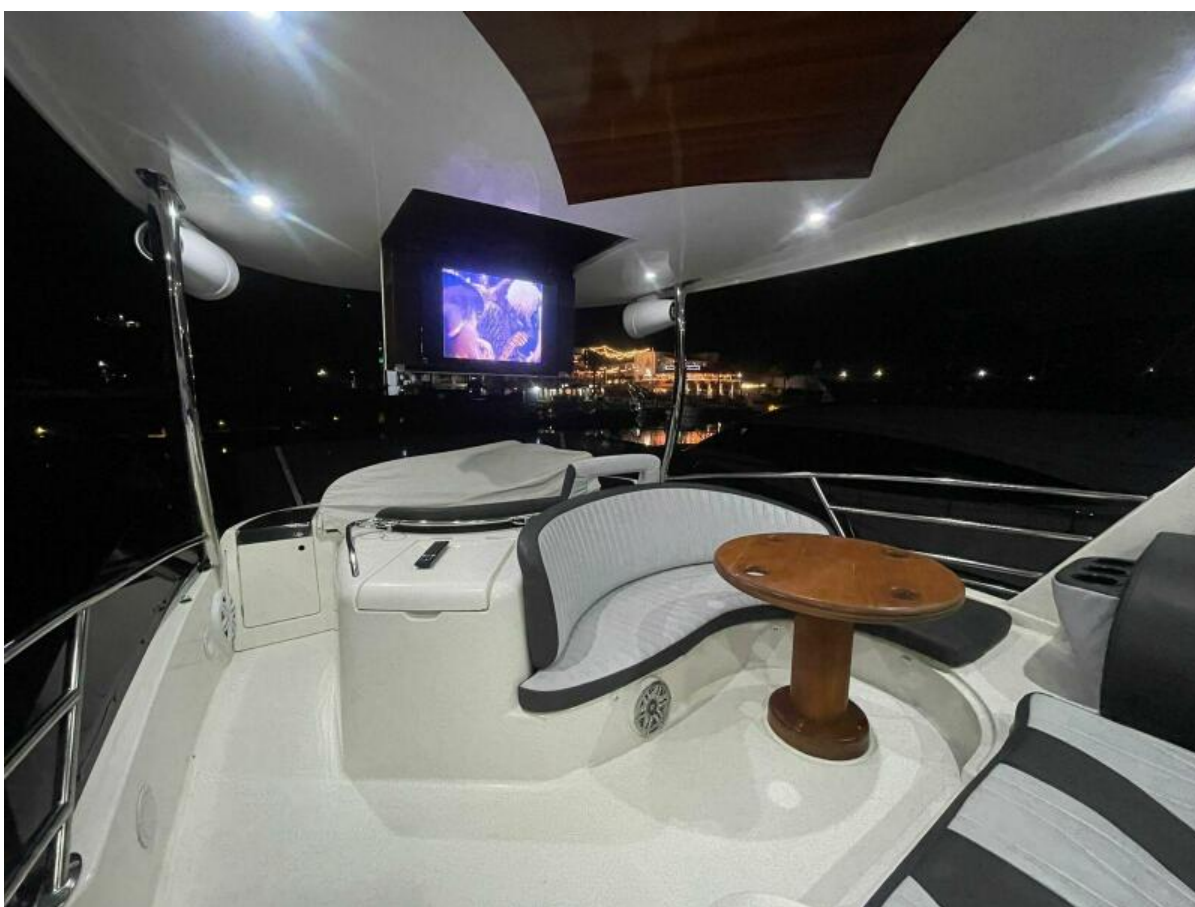
Flybridge Forward View Prestige yacht for sale in Costa Rica flybridge