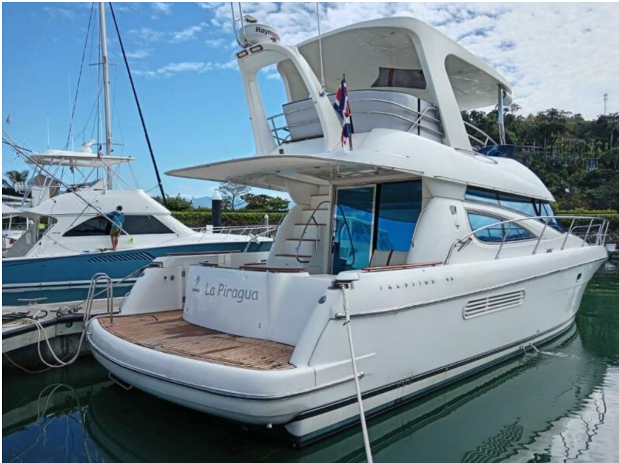
Profile "La Piragua" 46' Prestige Motor Yacht For Sale "La Piragua" 2006 46' Prestige yacht for sale