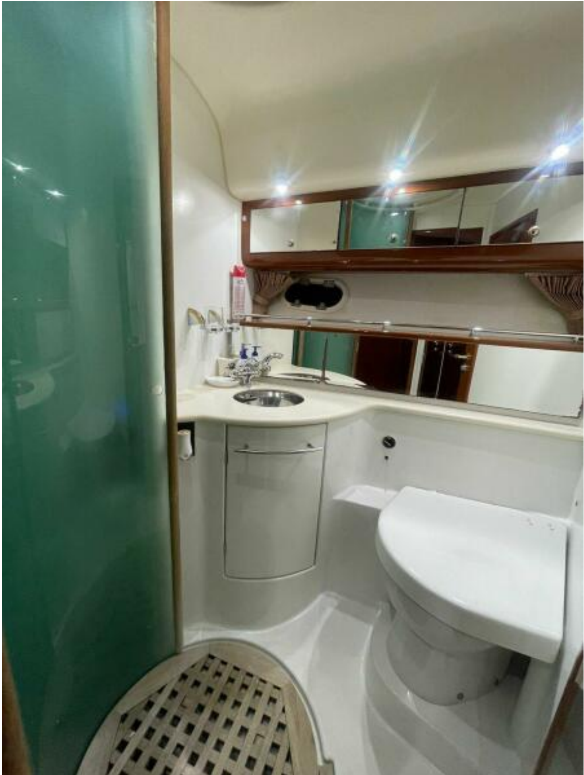
Master Bath 2006 460 Prestige motor yacht for sale master bath