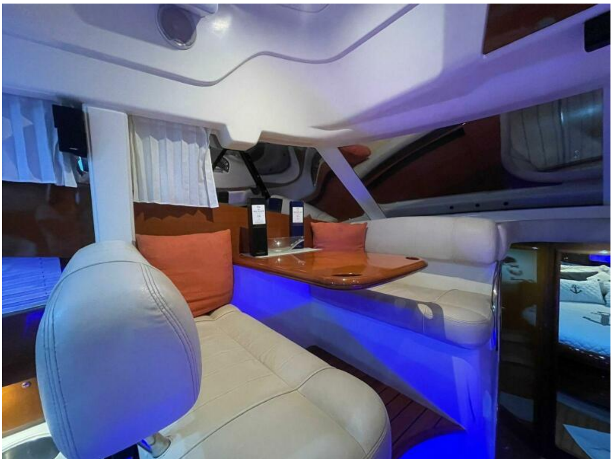
Main Deck Settee 460 Prestige for sale salon dinette