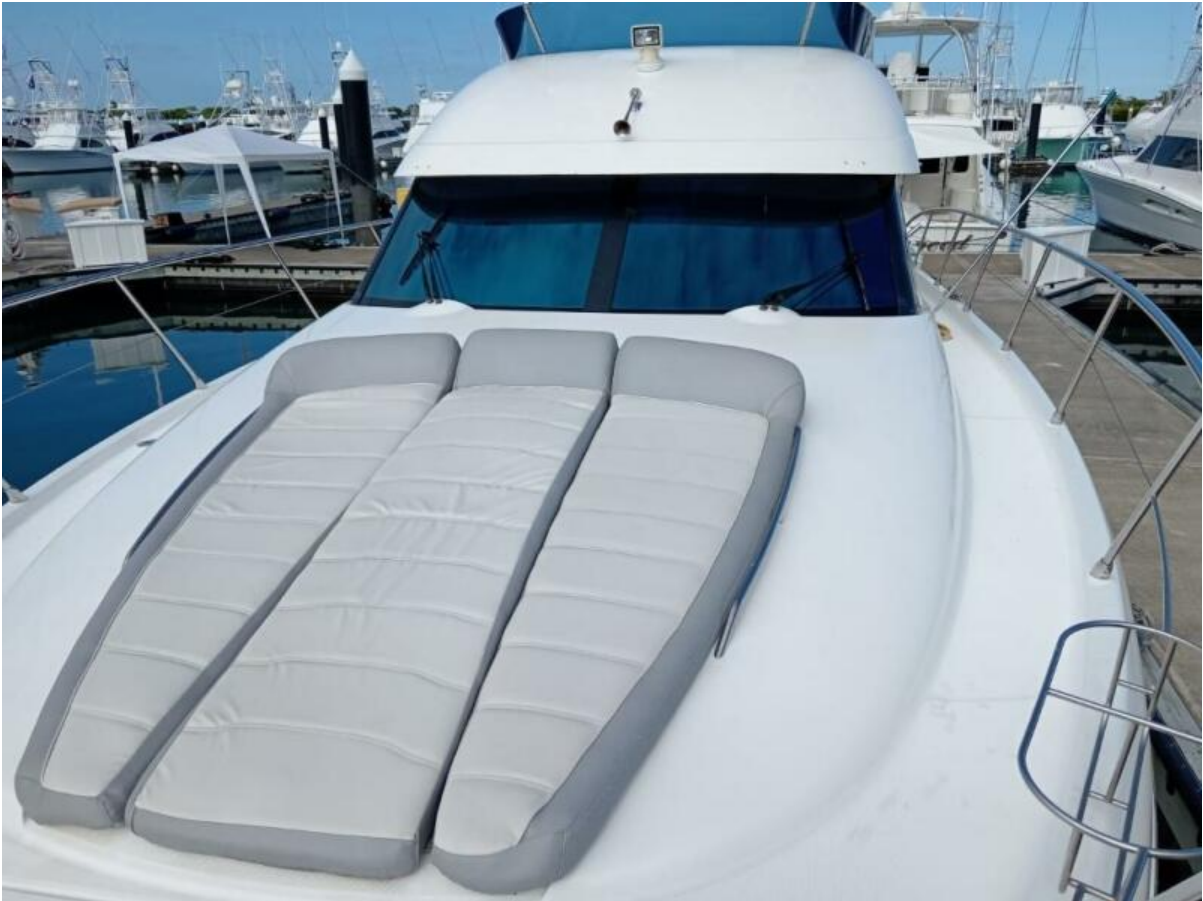
Foredeck Aft View Yacht for sale in Costa Rica Prestige 46