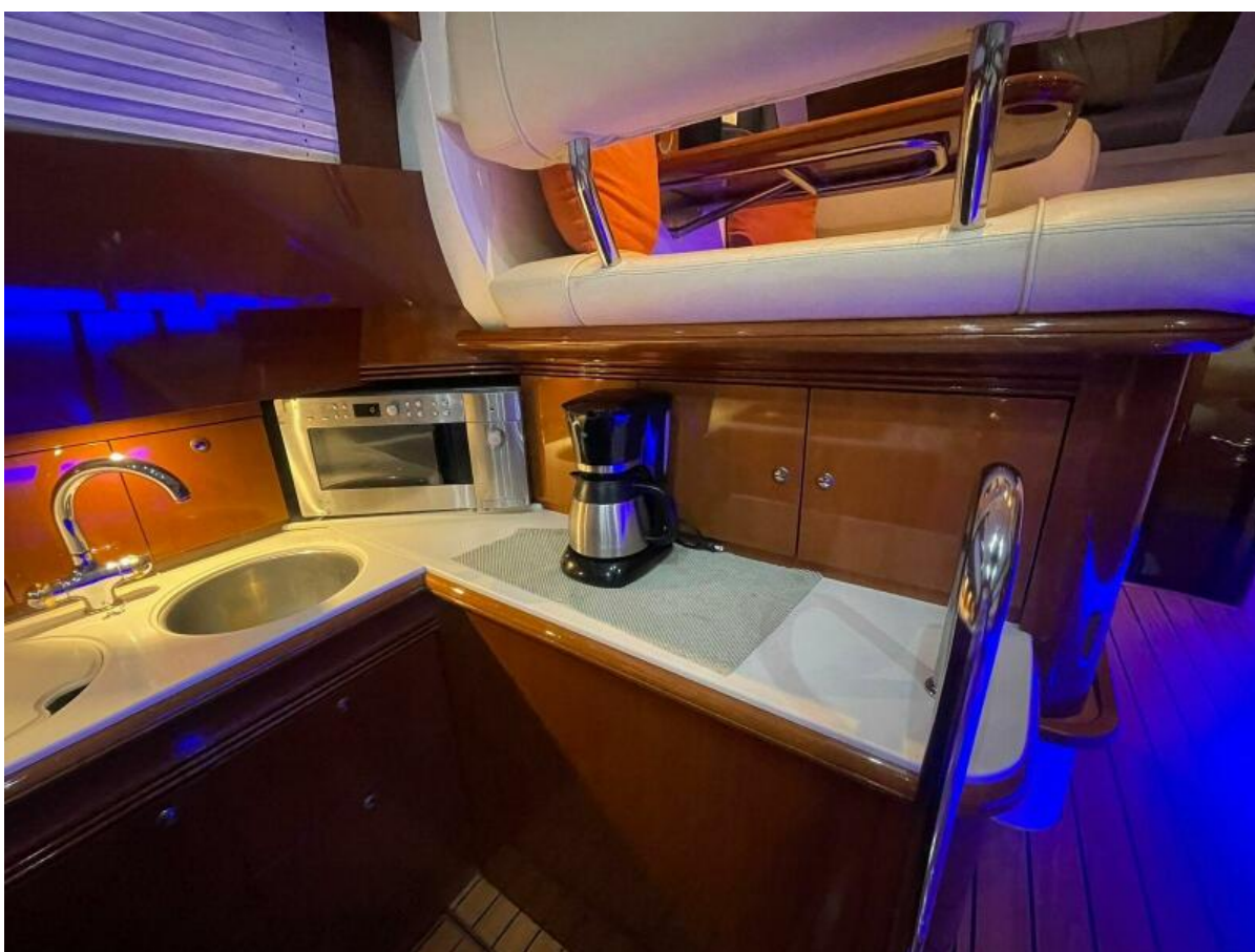
Galley Forward View Prestige 460 flybridge for sale galley