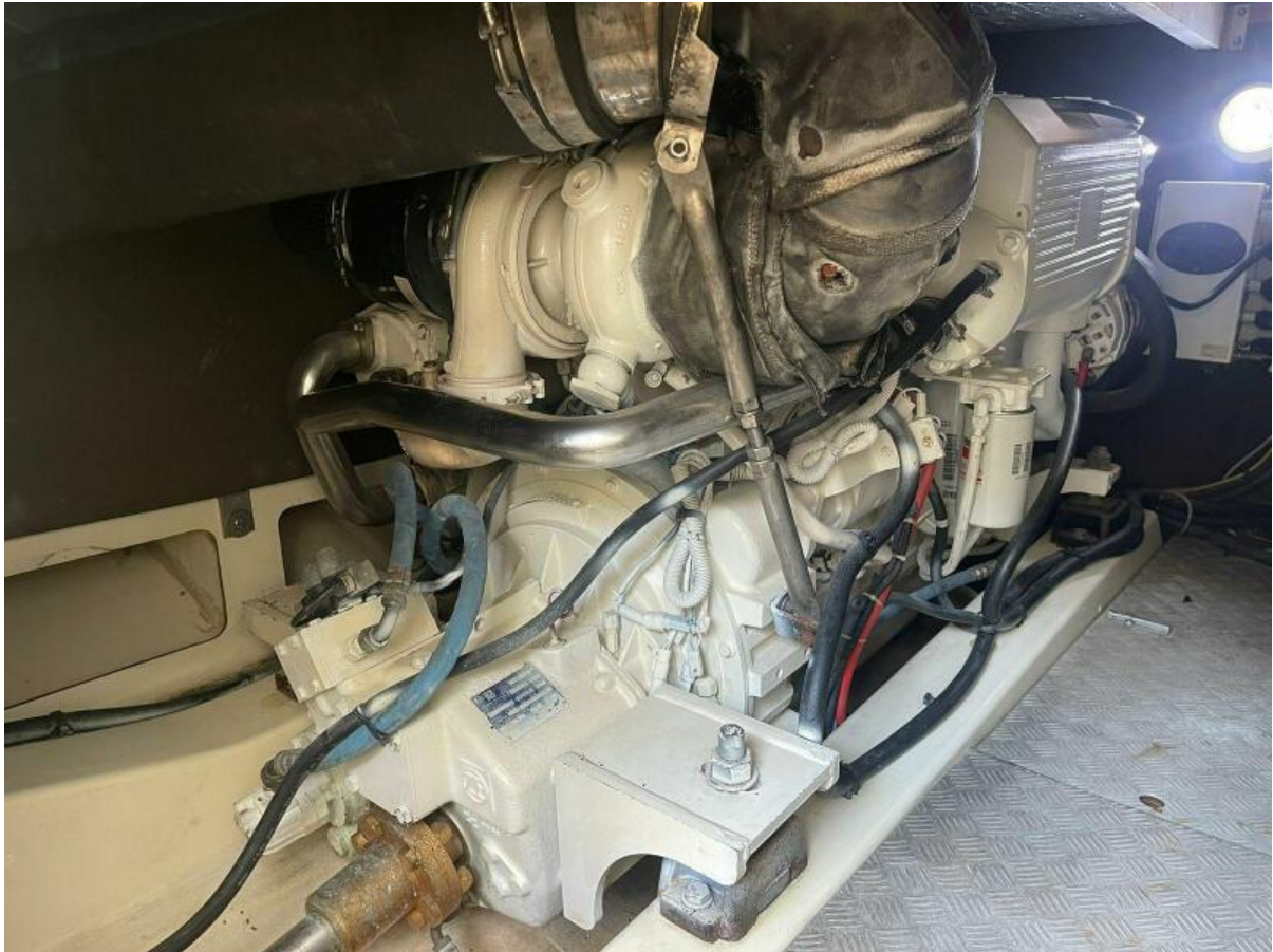
Port Engine Prestige 460 Cummins engine in Costa Rica