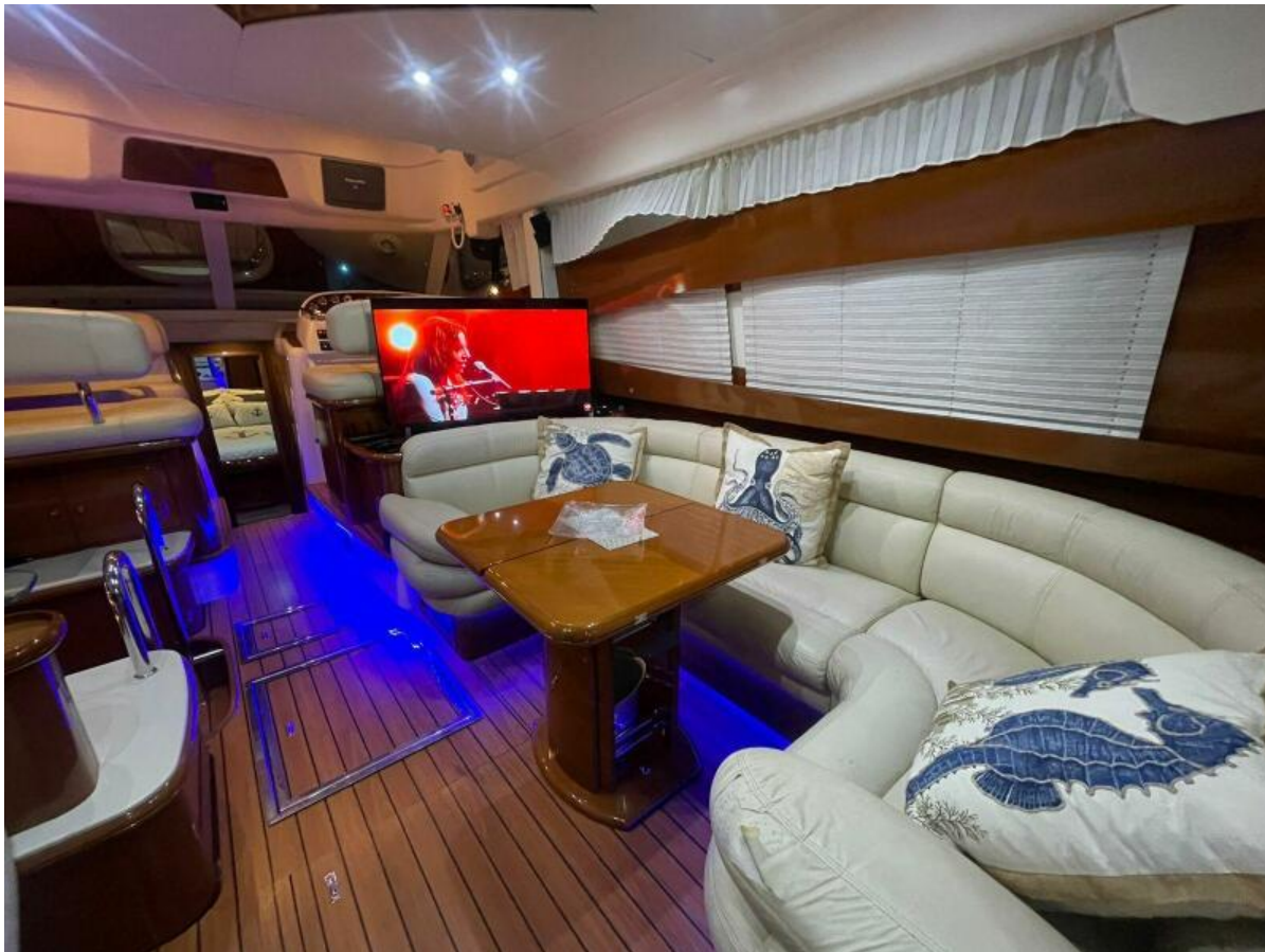
Salon 46 Prestige for sale salon view