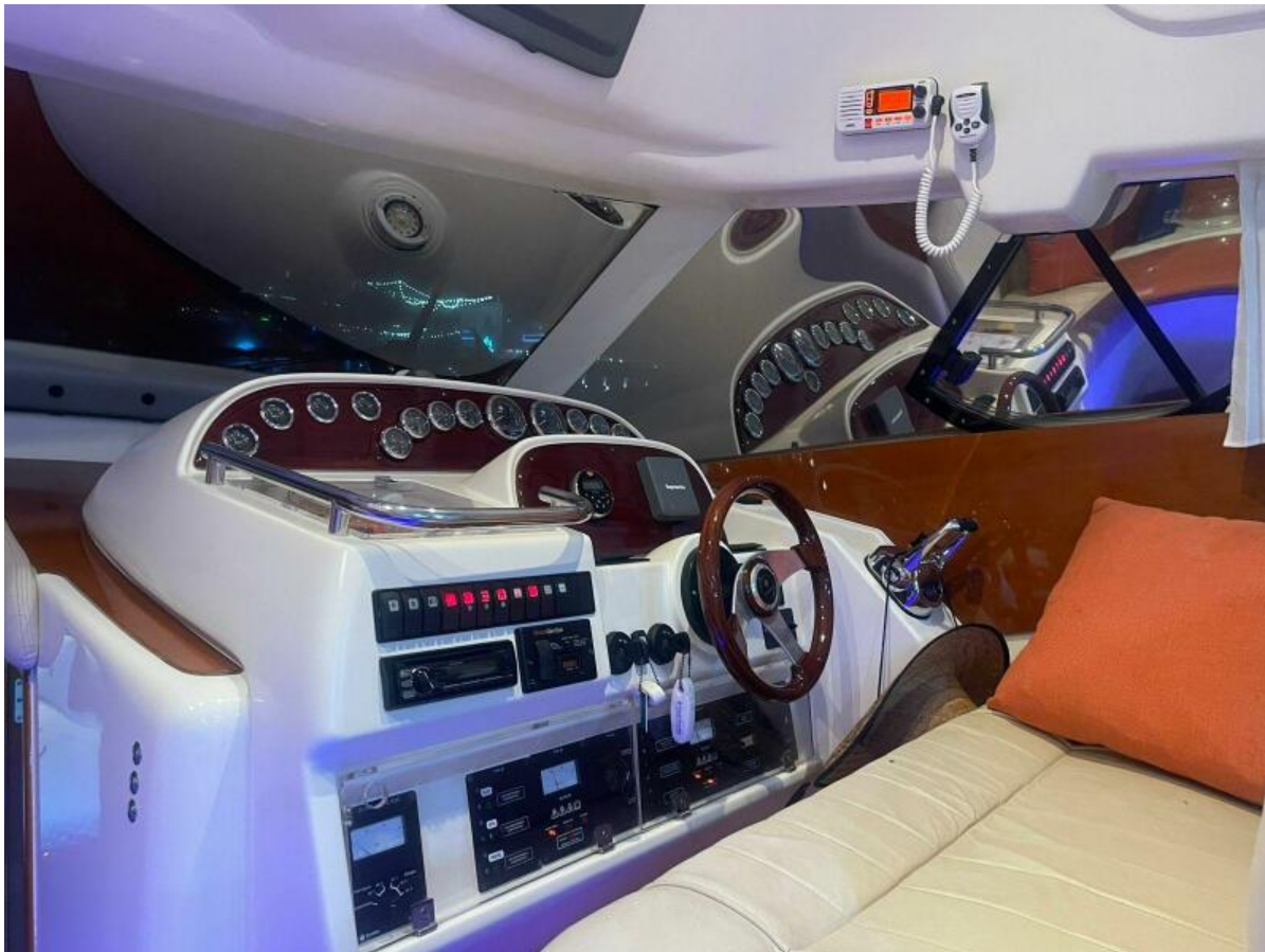
Lower Helm 2006 460 Prestige for sale lower helm