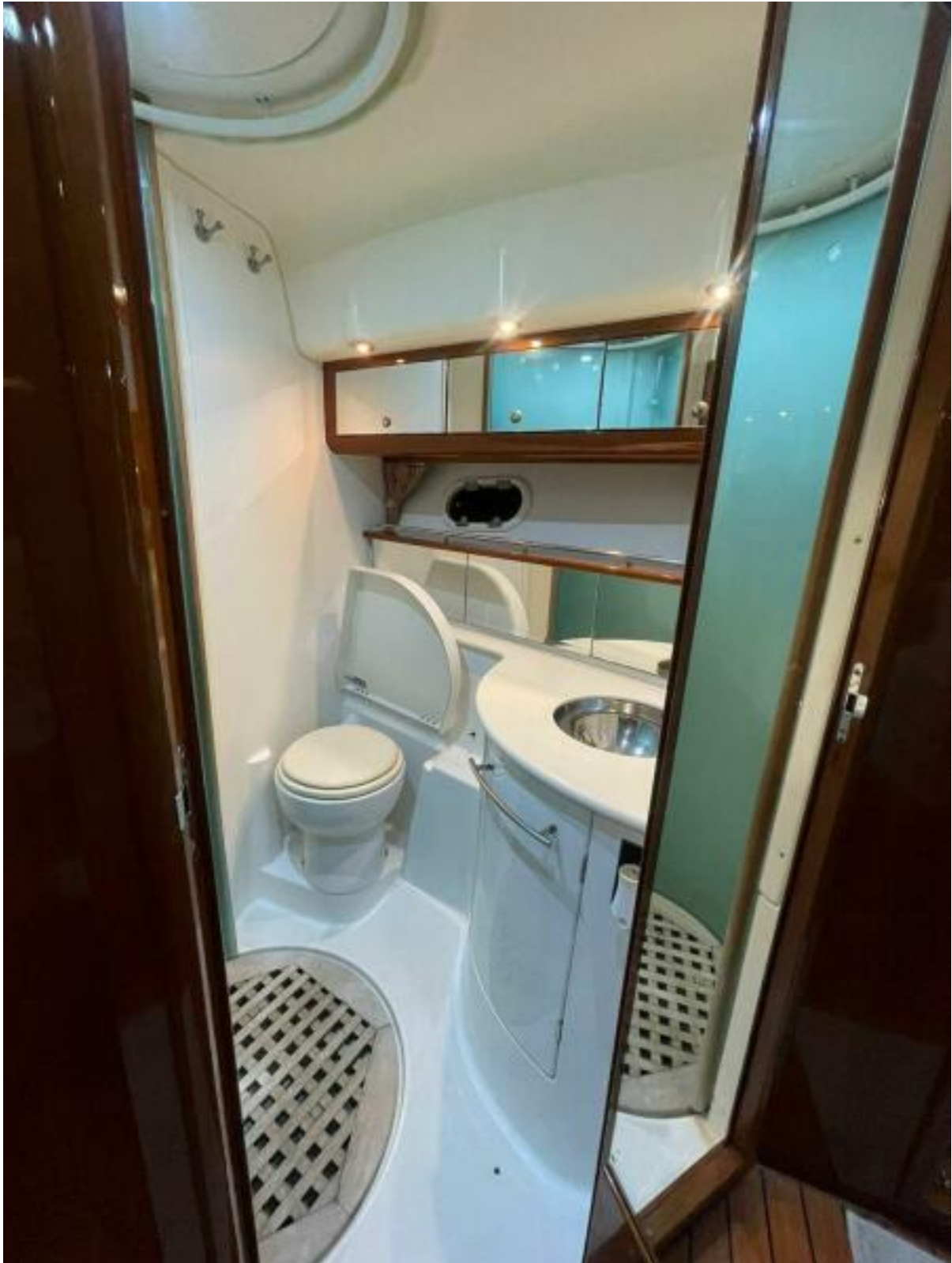
Guest Bath Prestige 46 motor yacht for sale bath view