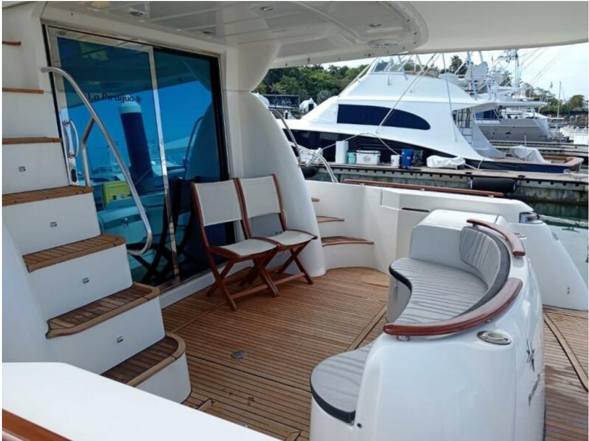
Cockpit Forward View Quepos Costa Rica yacht for sale