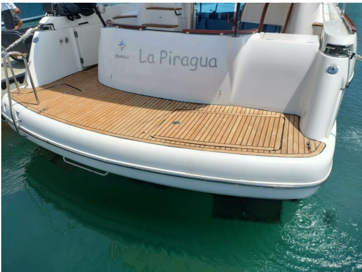
Transom Prestige 46 transom view with swim platform