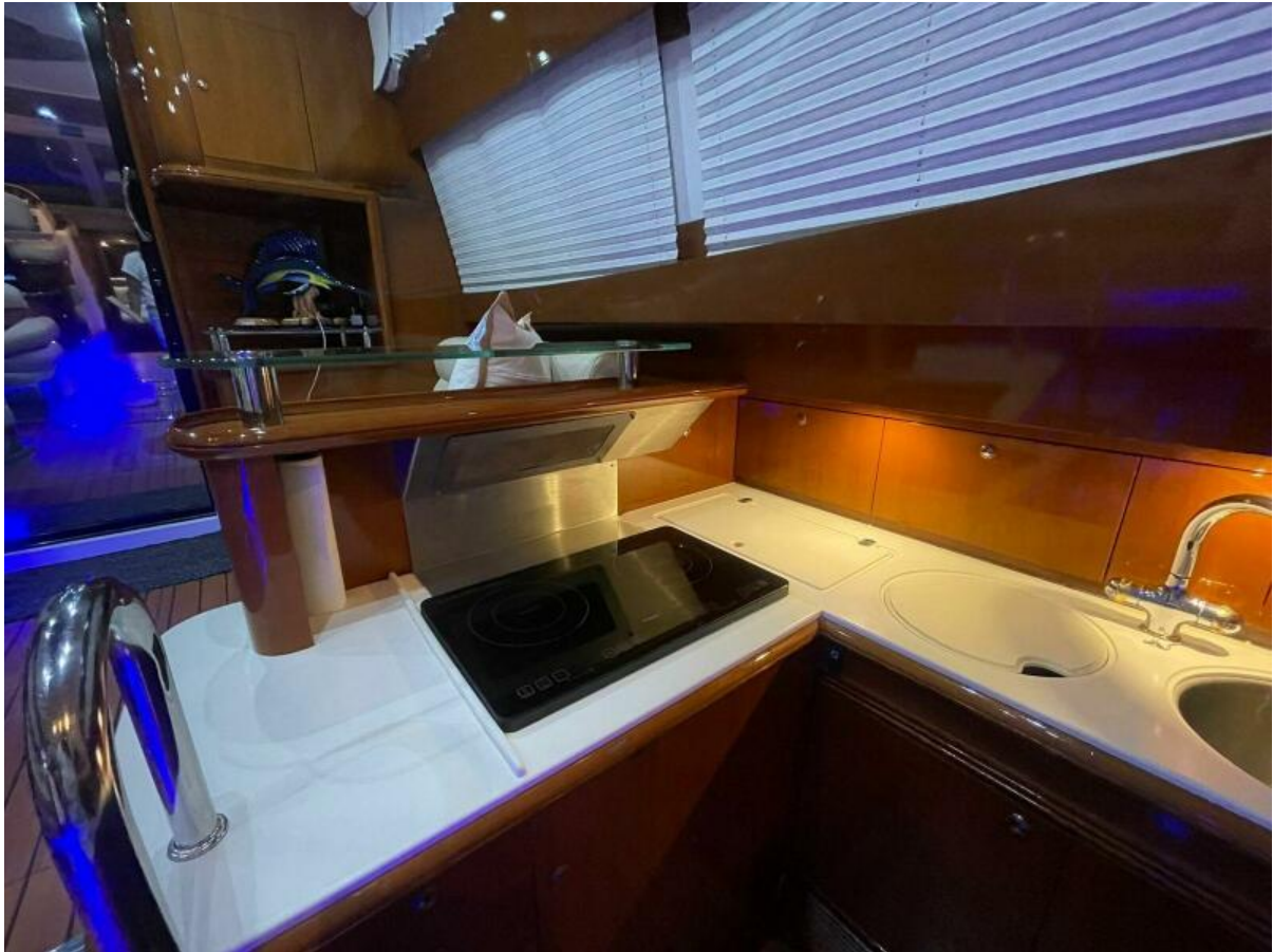
Galley Aft View Prestige 46 for sale galley