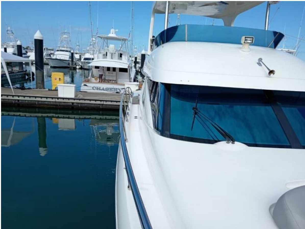
Walkaround Deck Costa Rica cruising yacht for sale - Prestige 46