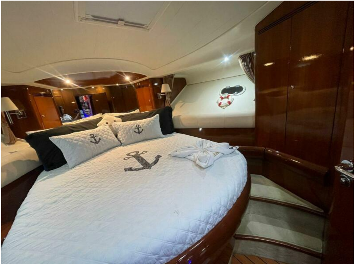
Master Stateroom Prestige 460 master stateroom