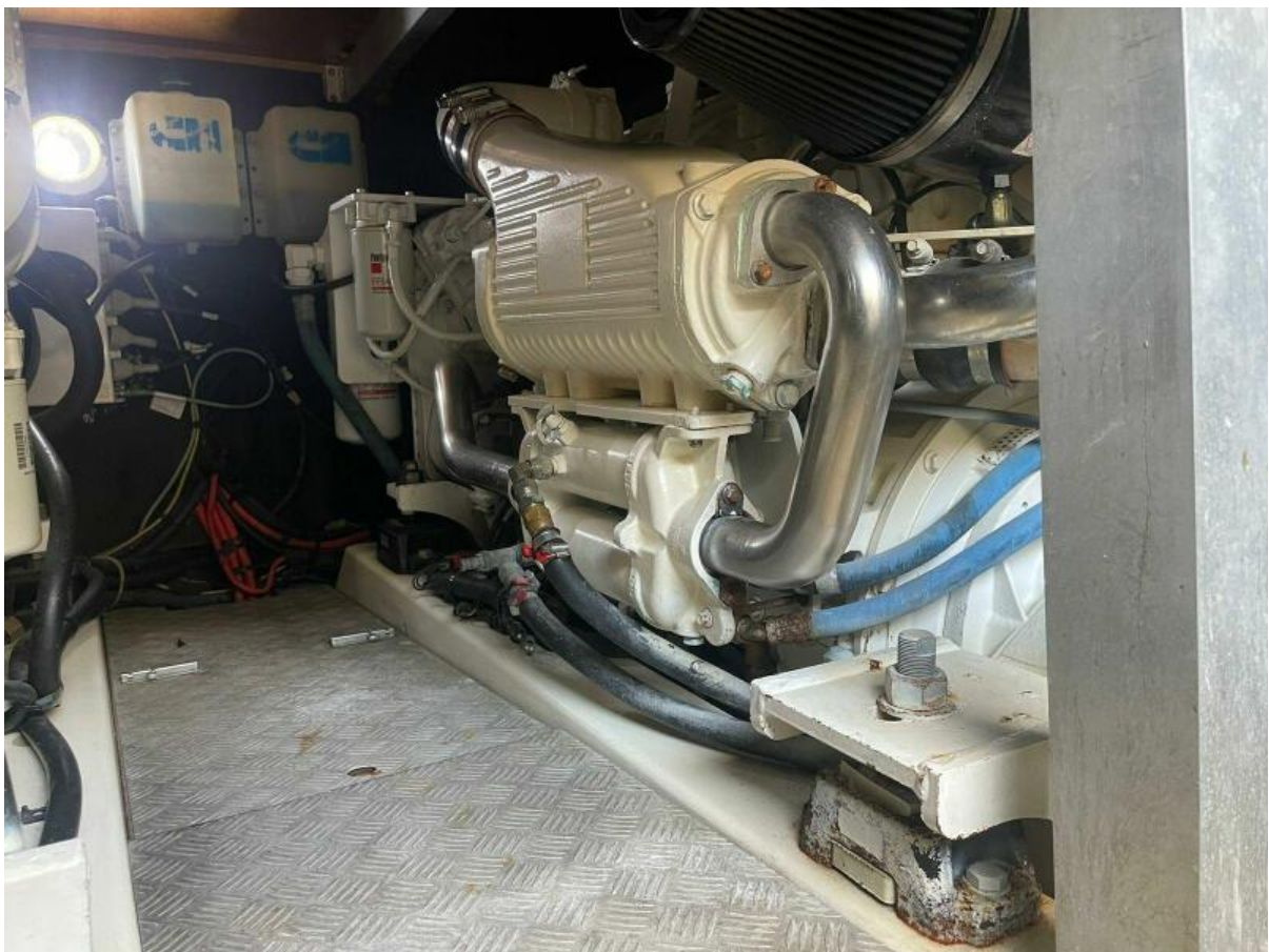
Starboard Engine Cummins engine in Costa Rica