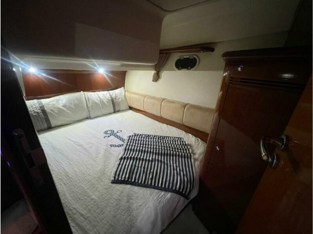
Guest Twin Stateroom -Together Prestige 460 for sale twin stateroom with beds together