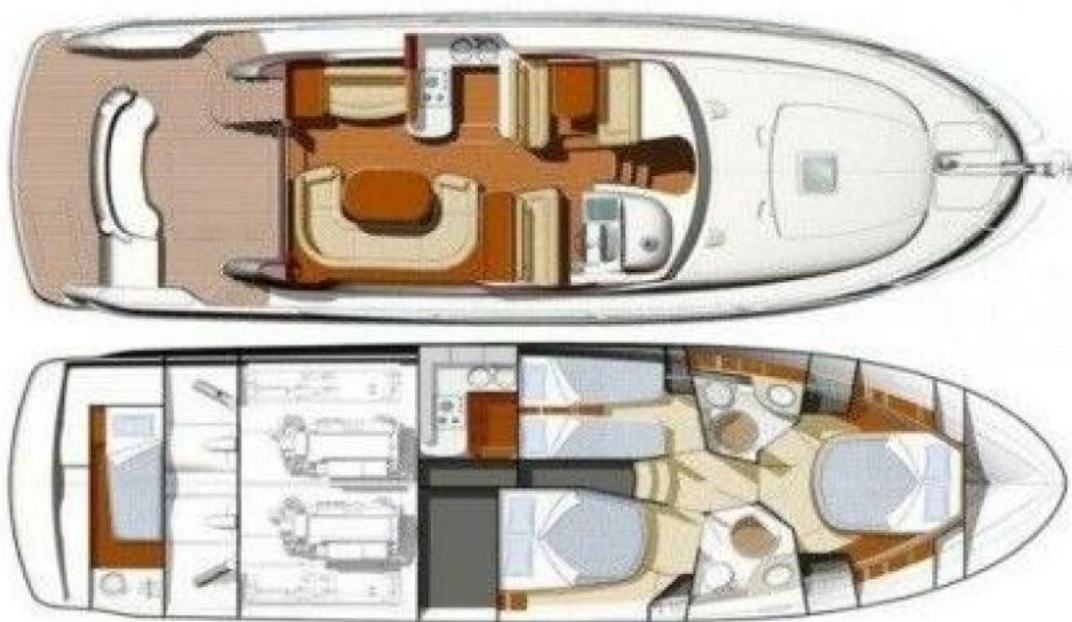
Layout 2006 460 Prestige Layout