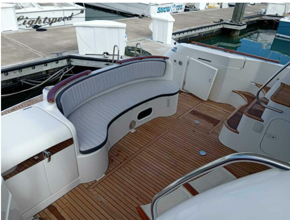
Cockpit Aft View