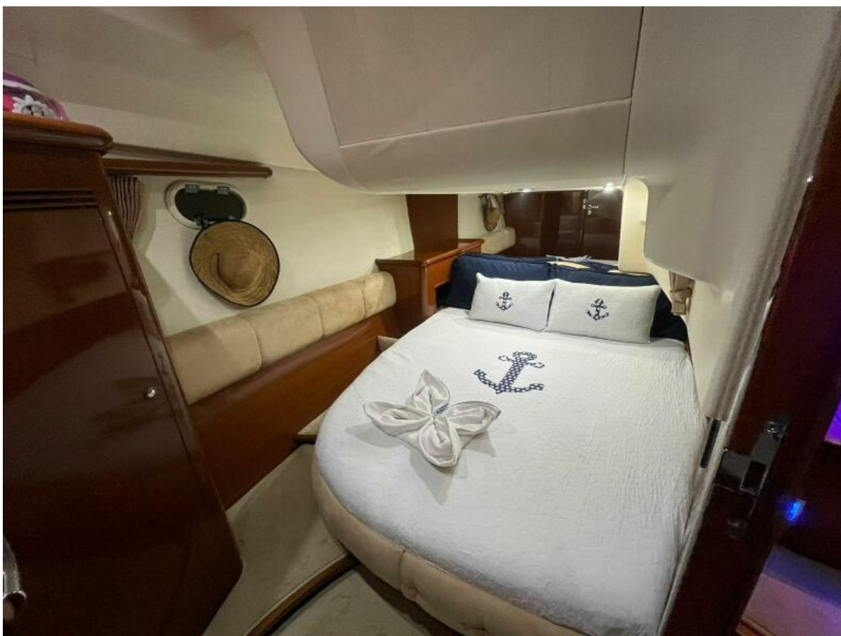
Guest Double Stateroom 46 Prestige 2006 guest stateroom