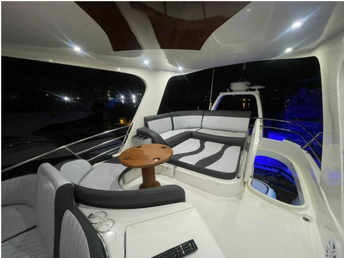
Flybridge Aft View Prestige yacht for sale flybridge