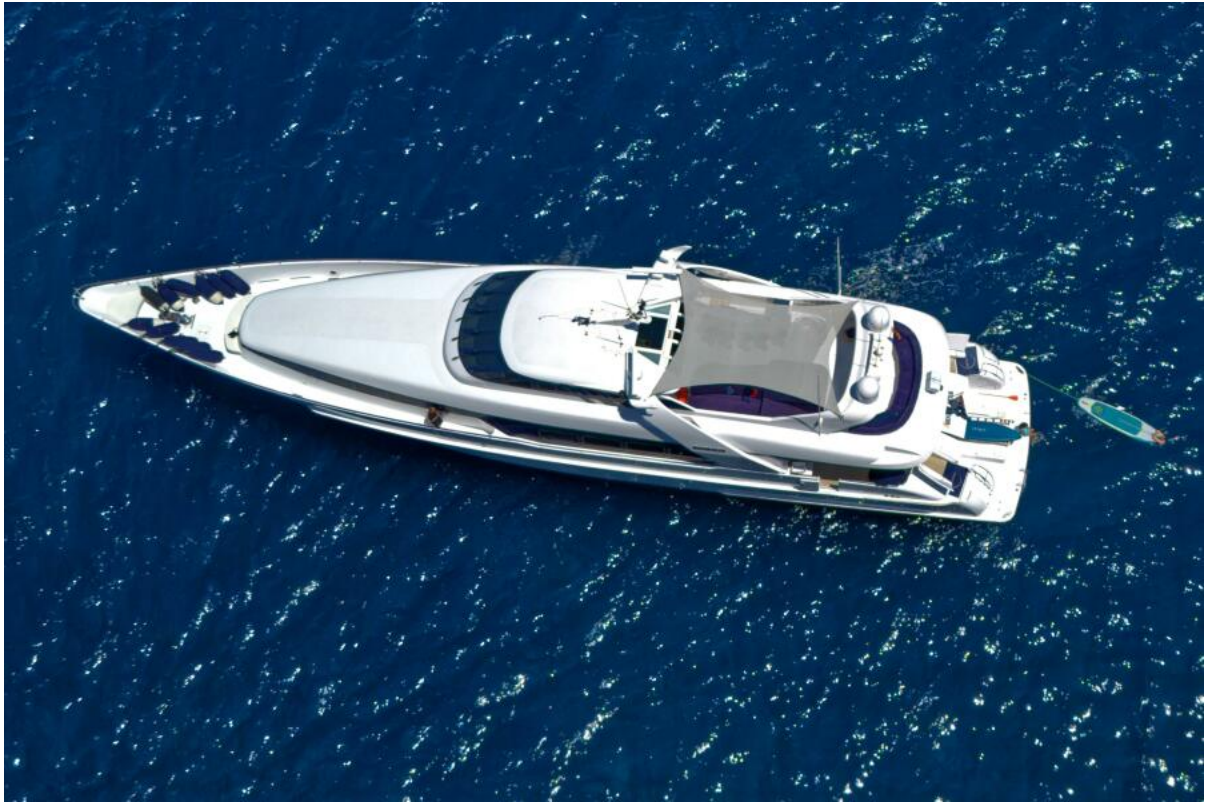
Moonraker God's Eye