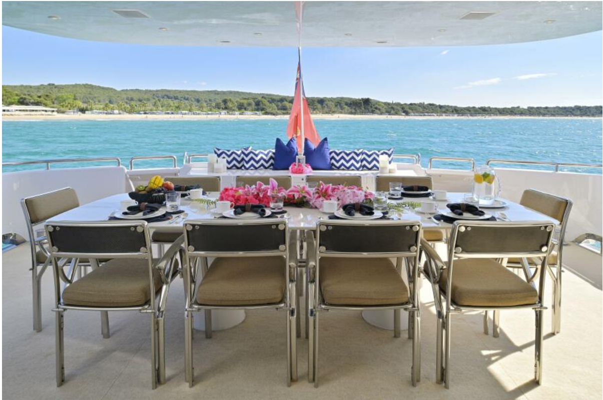
Moonraker Aft Deck