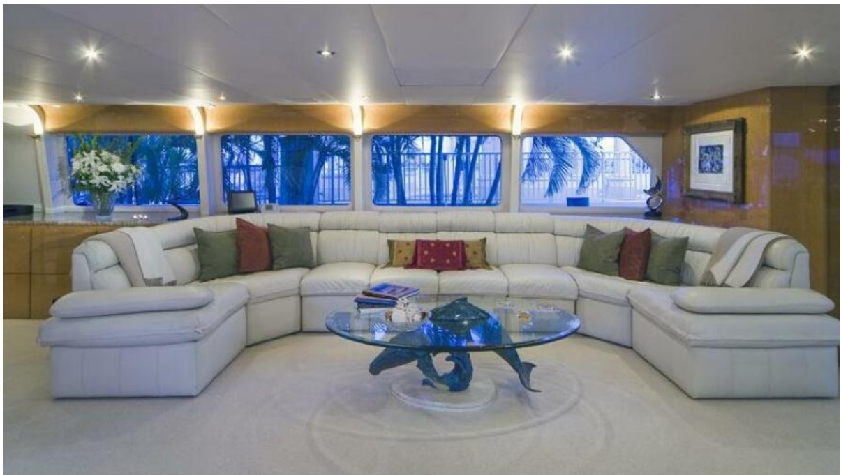
Moonraker Salon Settee