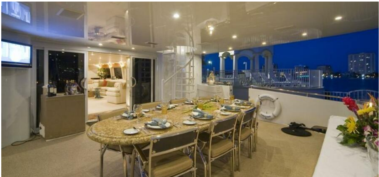
Moonraker Aft Deck