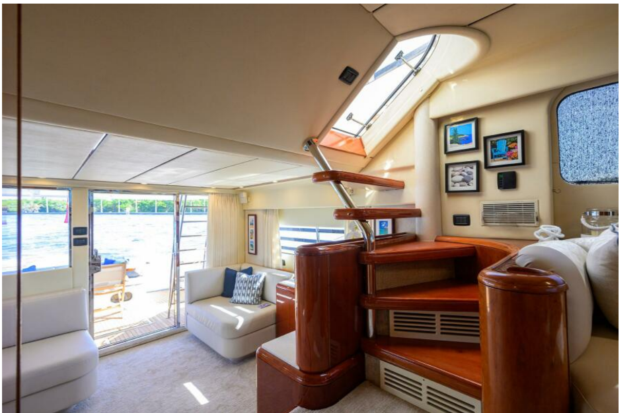
Stairway to Flybridge