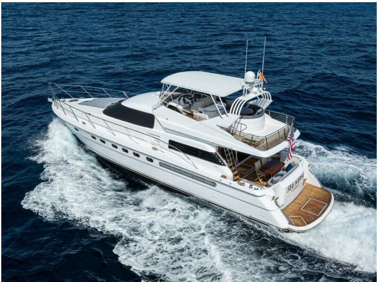
Port Stern Profile