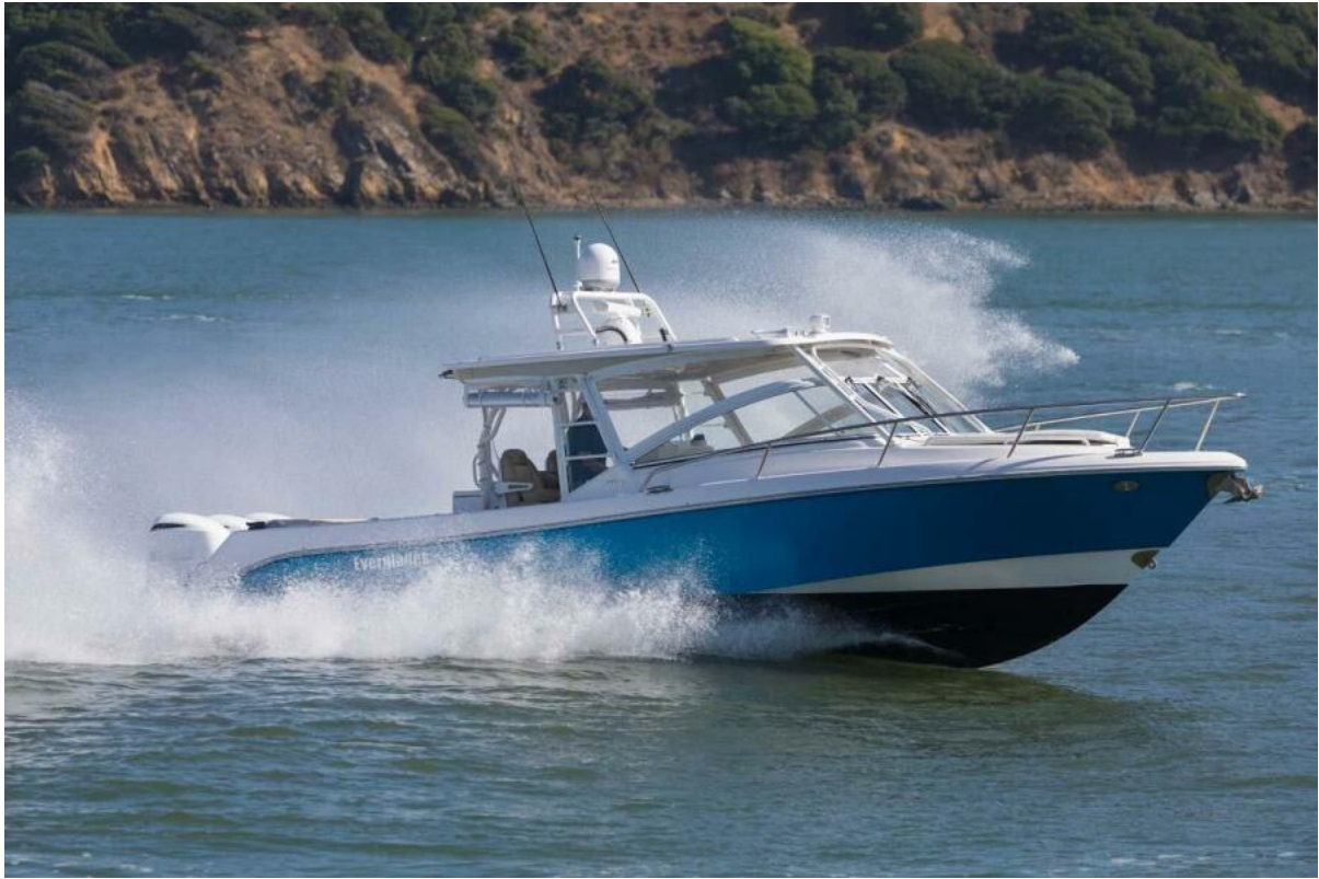
MAITRI, 36' (10.97m) Everglades 2016