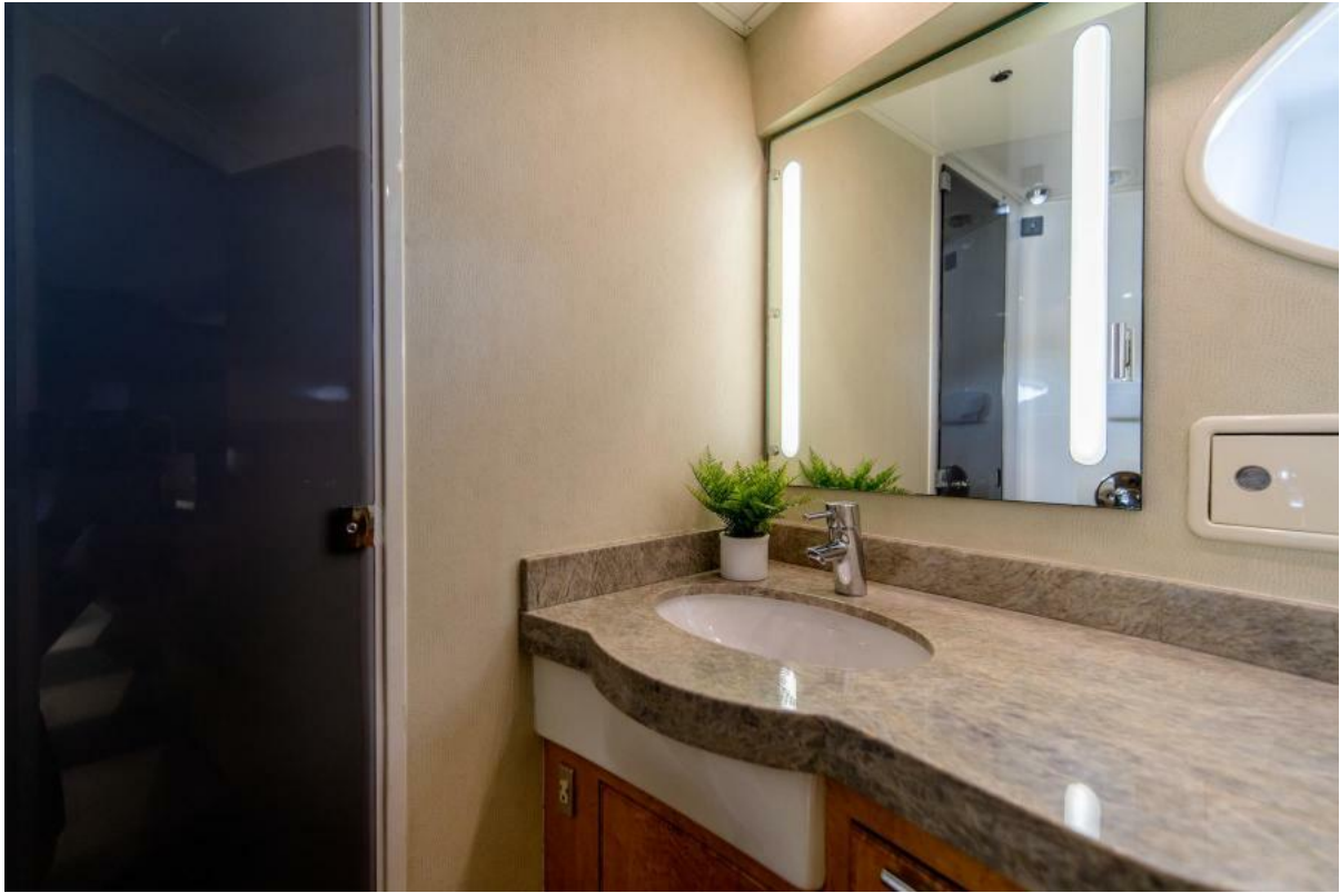
Forward Owner's Stateroom Ensuite