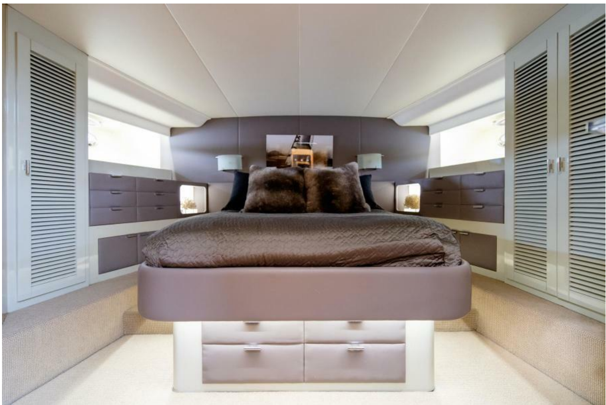
Forward Owner's Stateroom