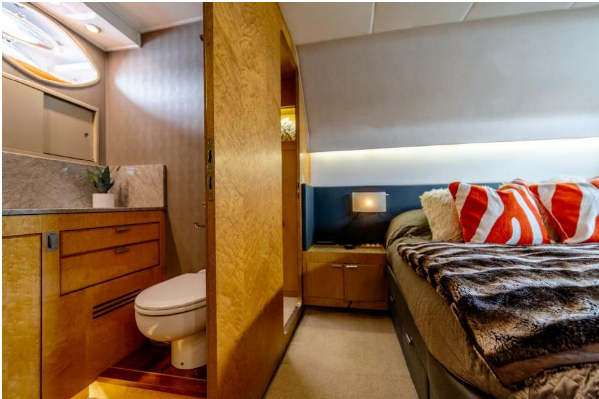
Aft Owner's Stateroom