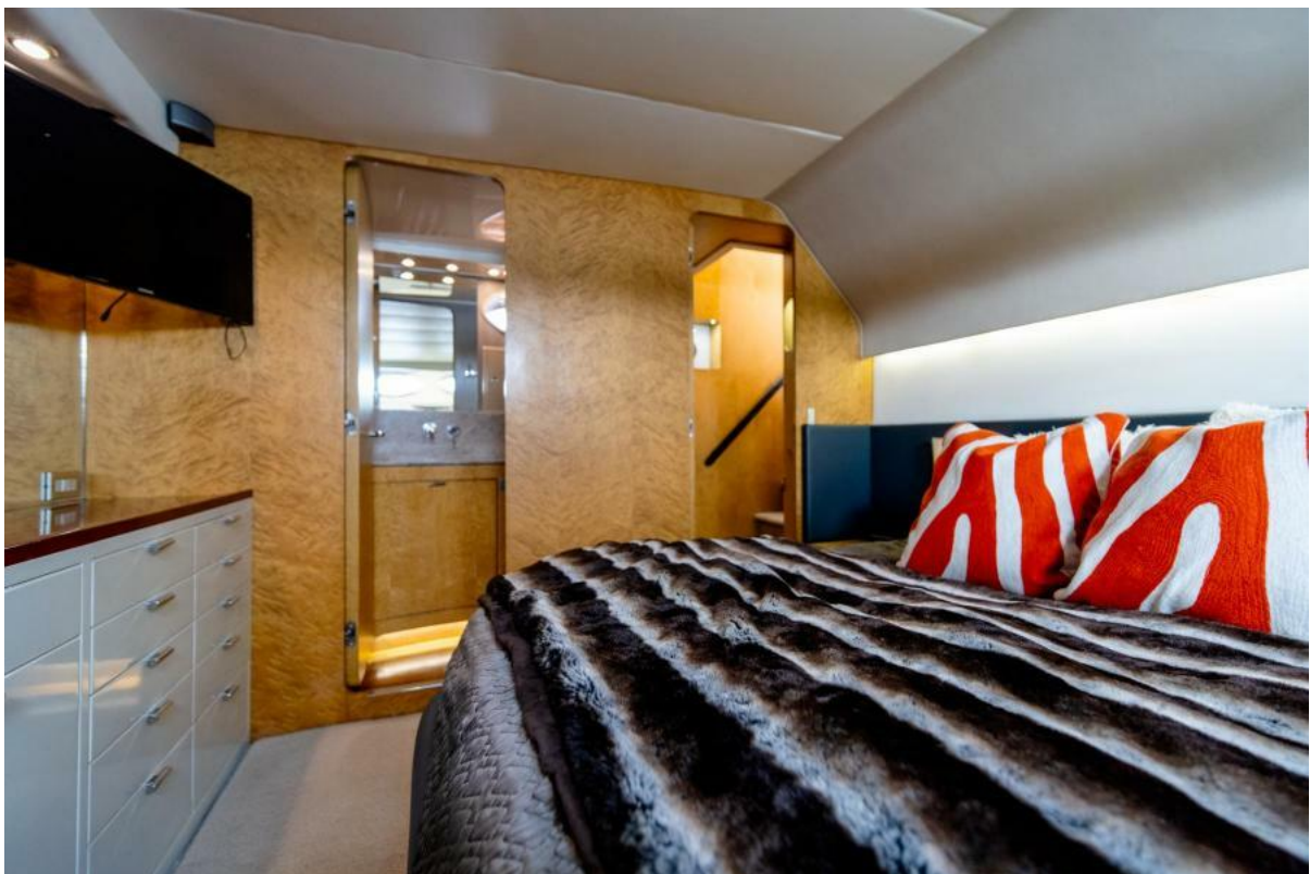
Aft Owner's Stateroom