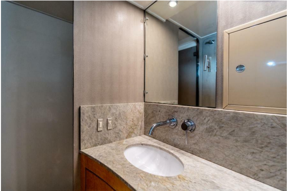
Aft Owner's Stateroom Ensuite