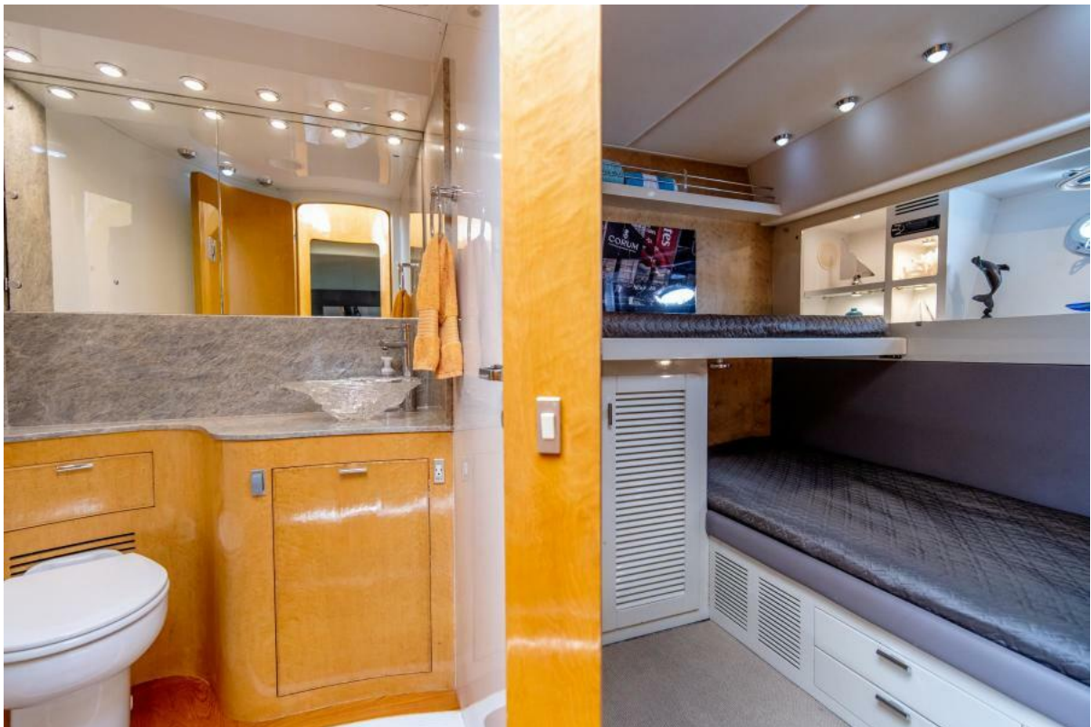
Twin Stateroom Ensuite