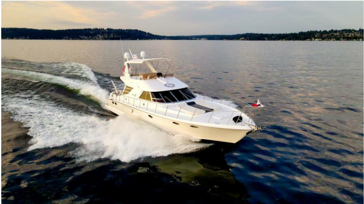
BRAVISSIMO, 60' (18.28m) Riva 1982