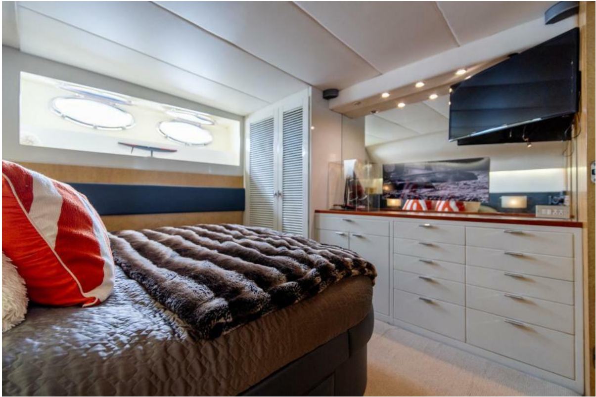
Aft Owner's Stateroom