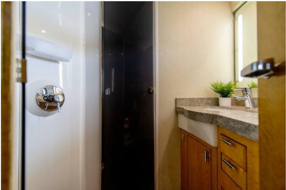
Forward Owner's Stateroom Ensuite