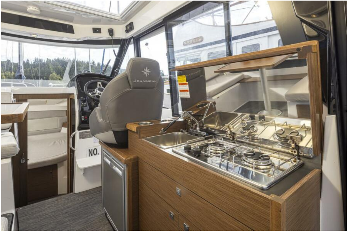
Salon & Galley