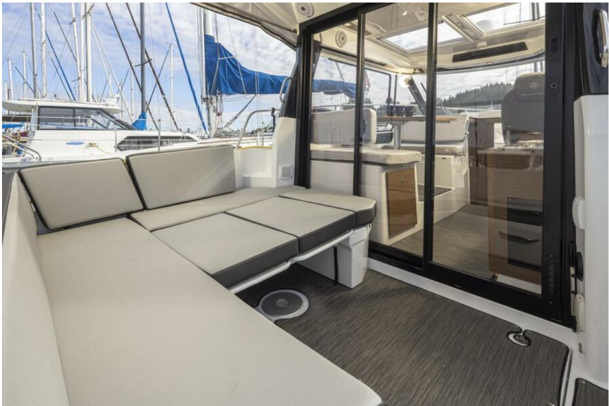
Aft Deck Convertible Berth