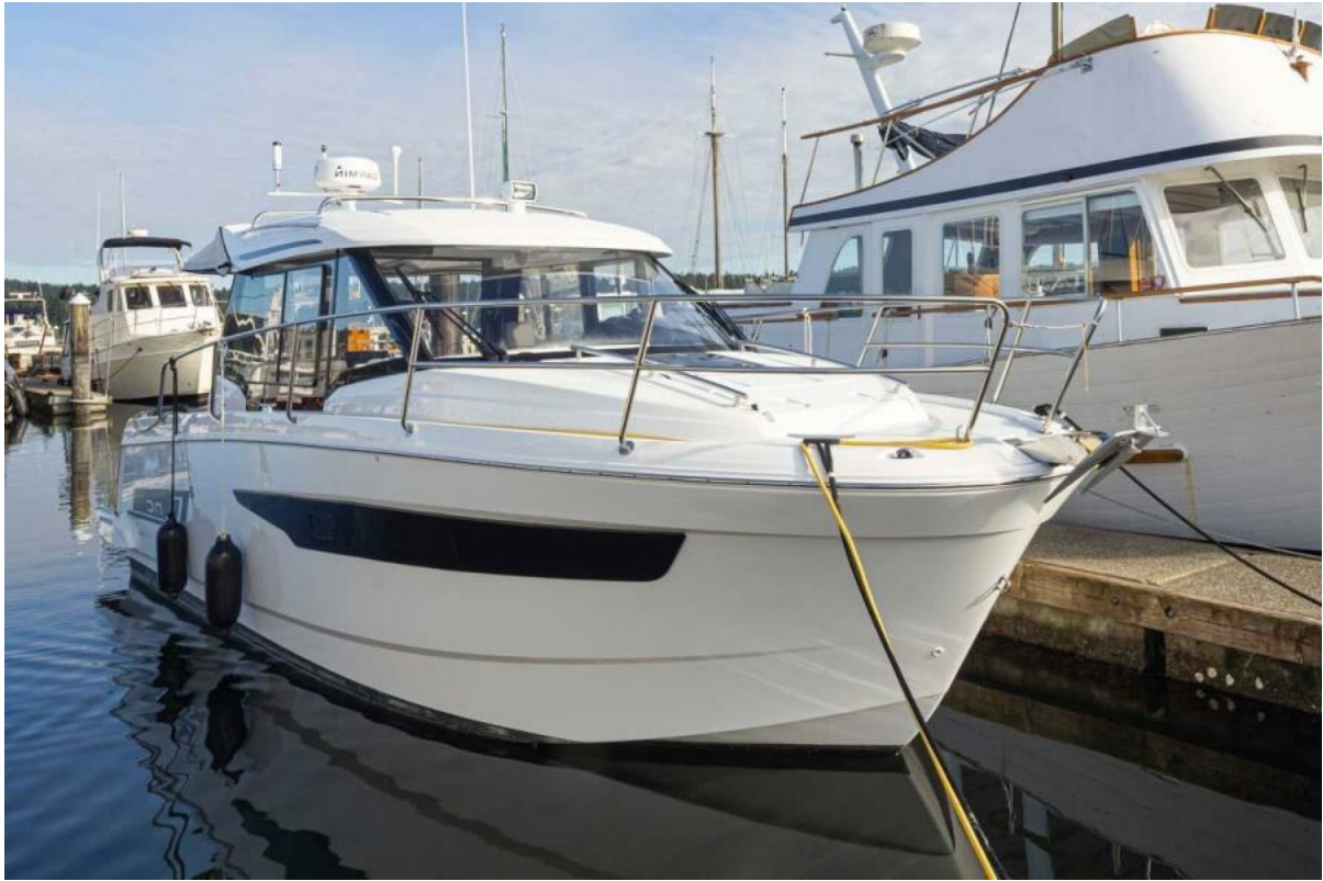
WOOSAH, 30' (9.41m) Jeanneau 2021