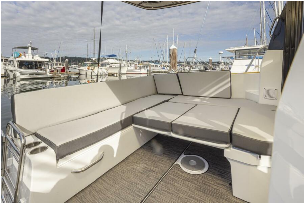
Aft Deck Convertible Berth