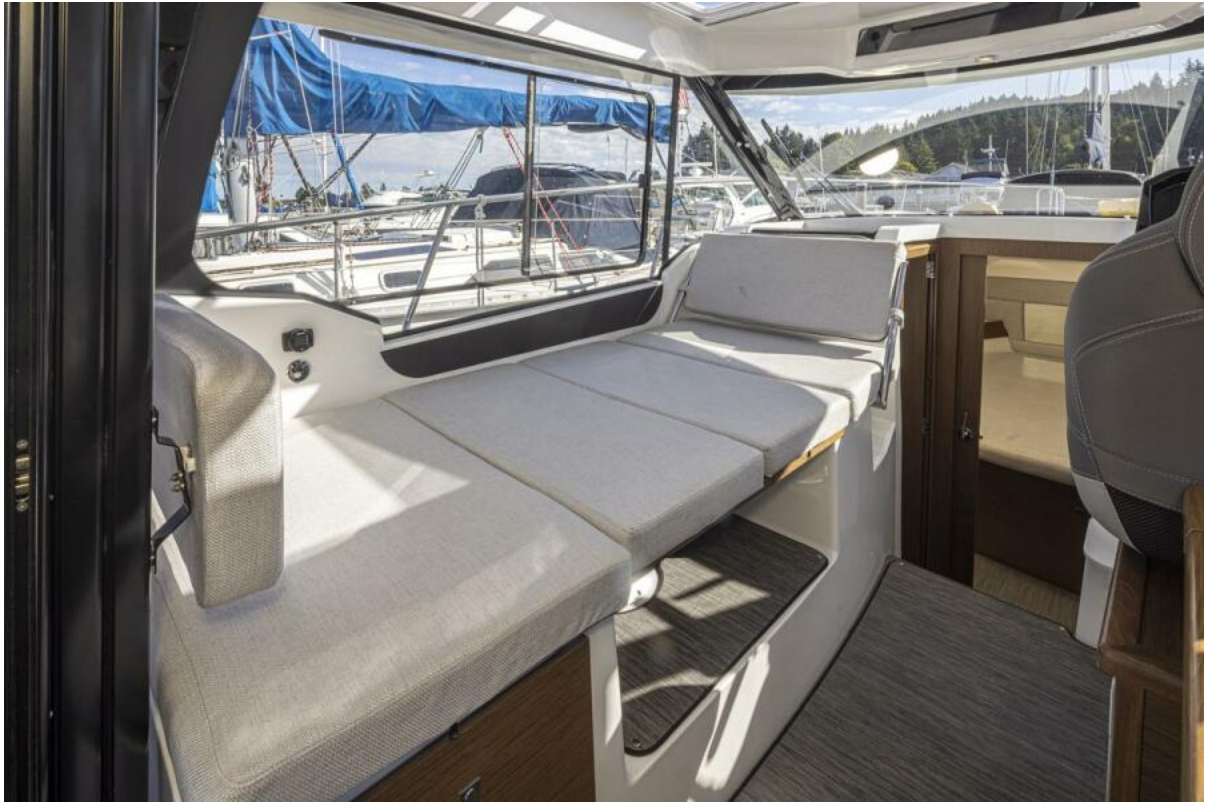
Salon Convertible Berth