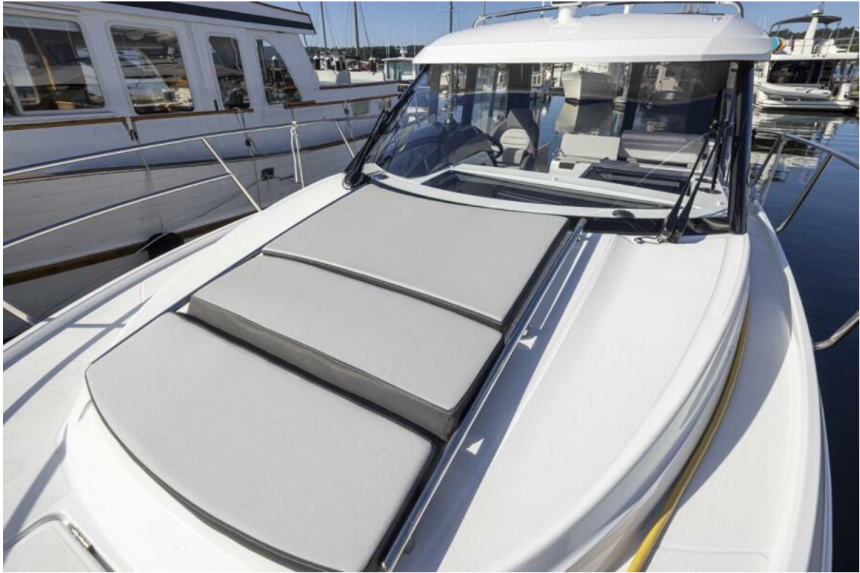
Bow Seating Area