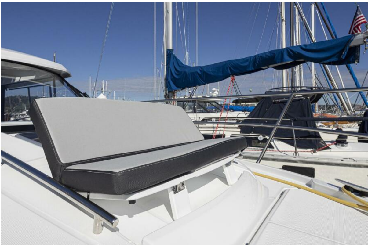
Bow Seating Area