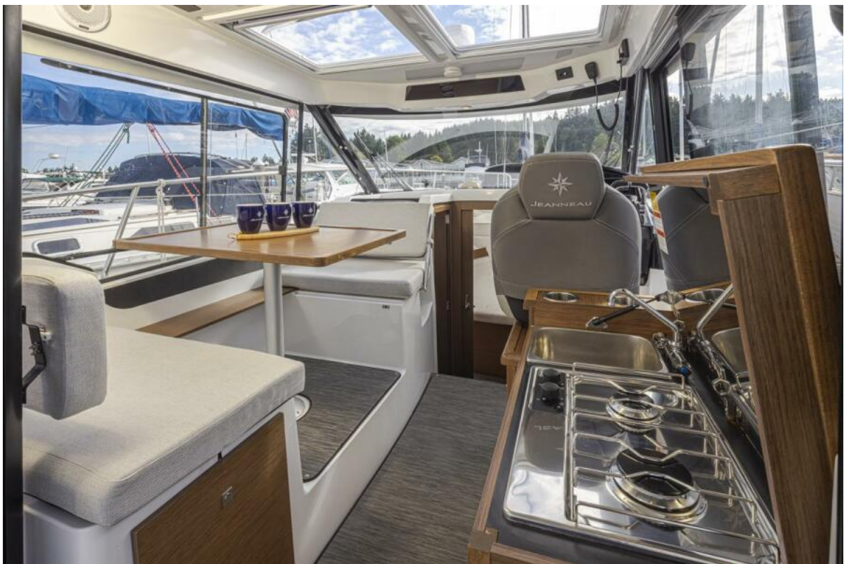
Salon & Galley