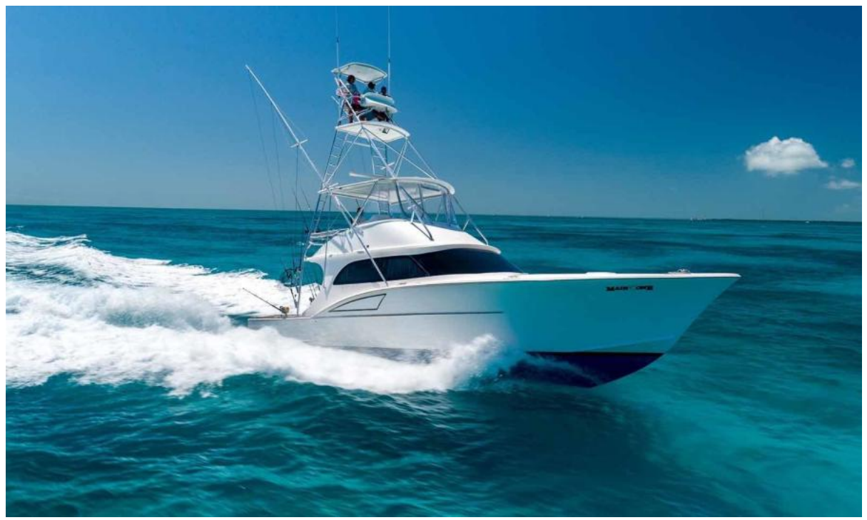
MAIN ONE - 49' Custom Carolina Wetsig Yachts Cape Fear 2000, MAIN ONE Edited