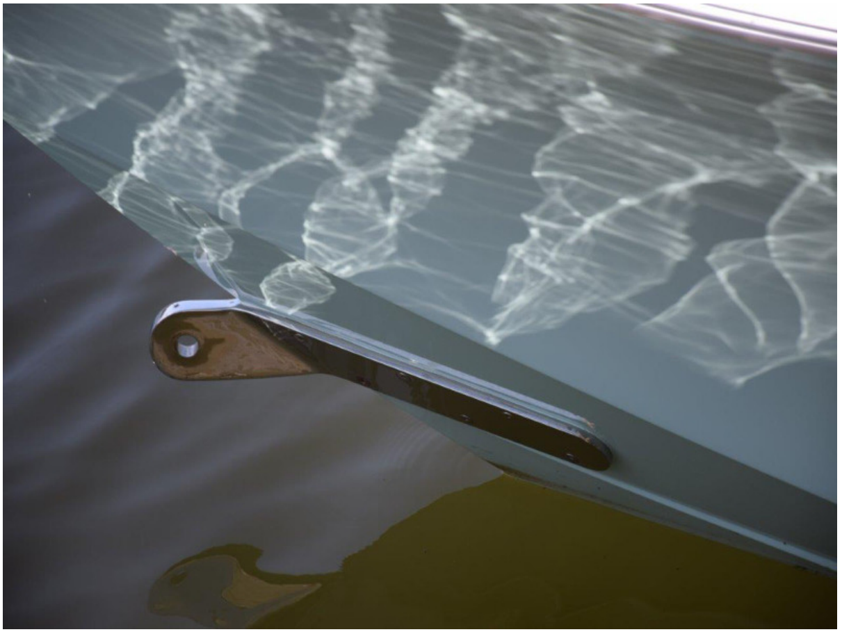
Tow Eye, factory installed