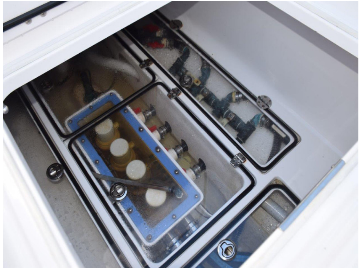
Livewell sea-chest box