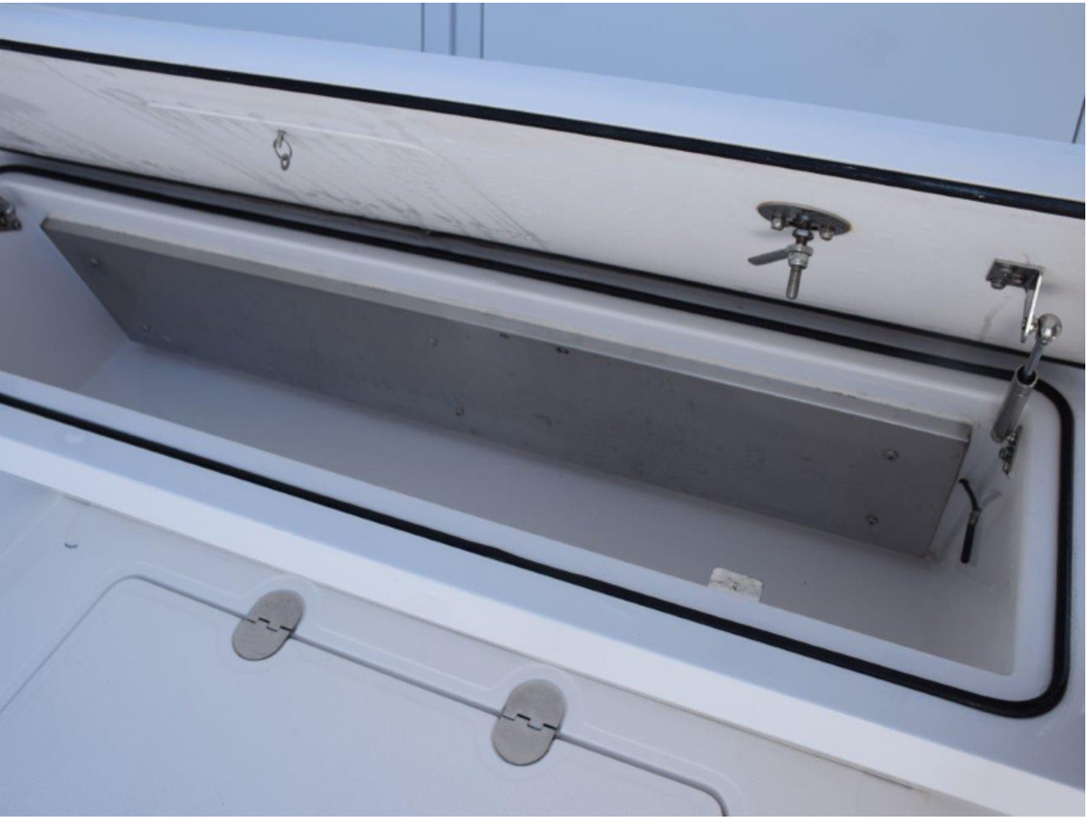
Refrigerated box beneath aft facing seat