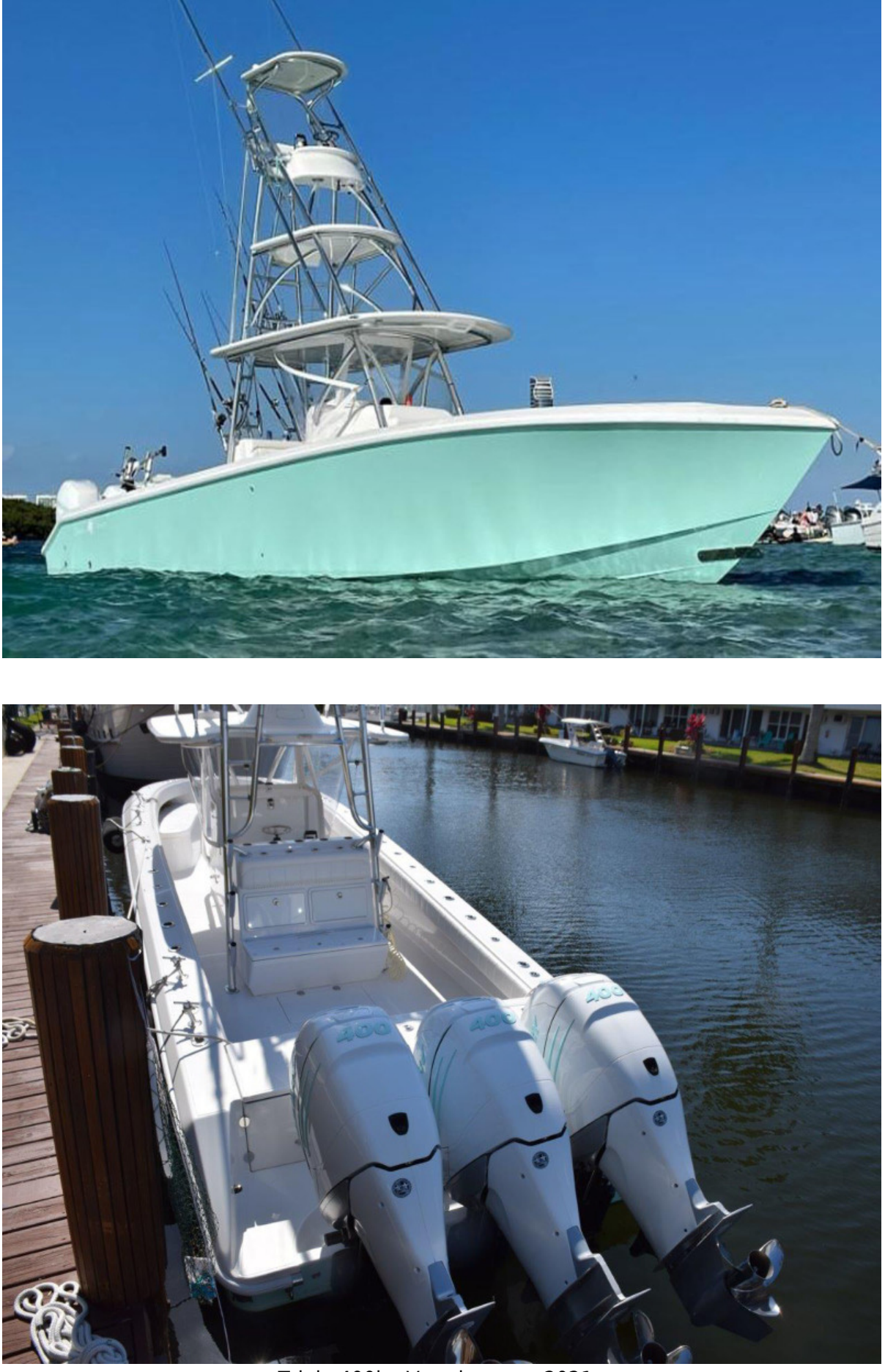
Triple 400hp Verados, new 2021