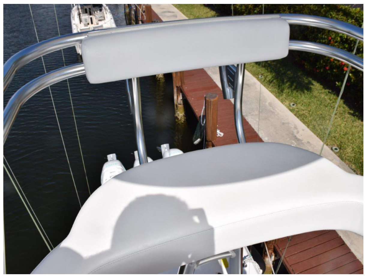
Tower seat with backrest