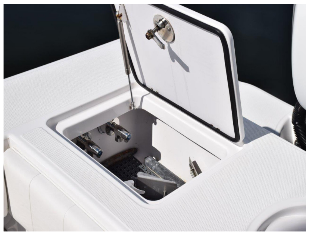
Transom sink and rigging station