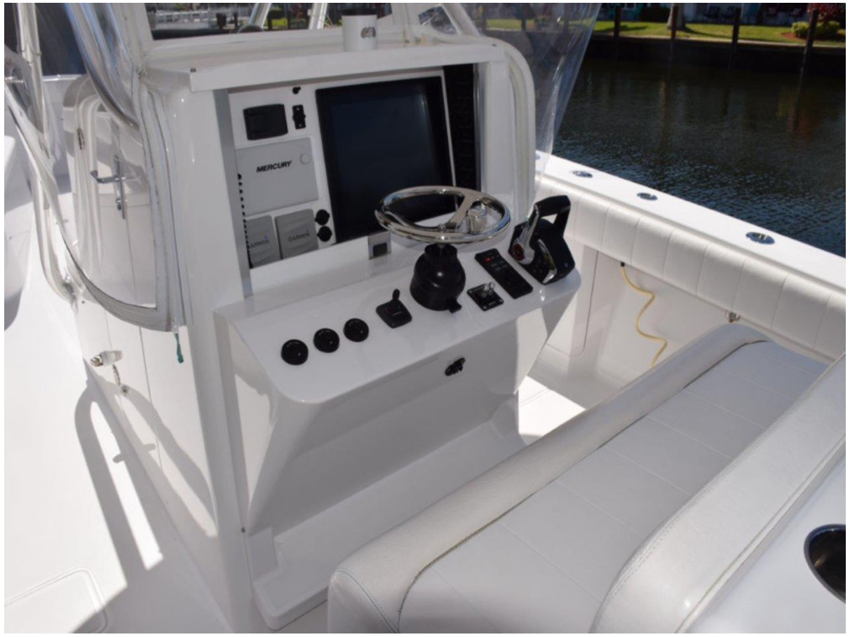
Panel cover slides down to disappear when open