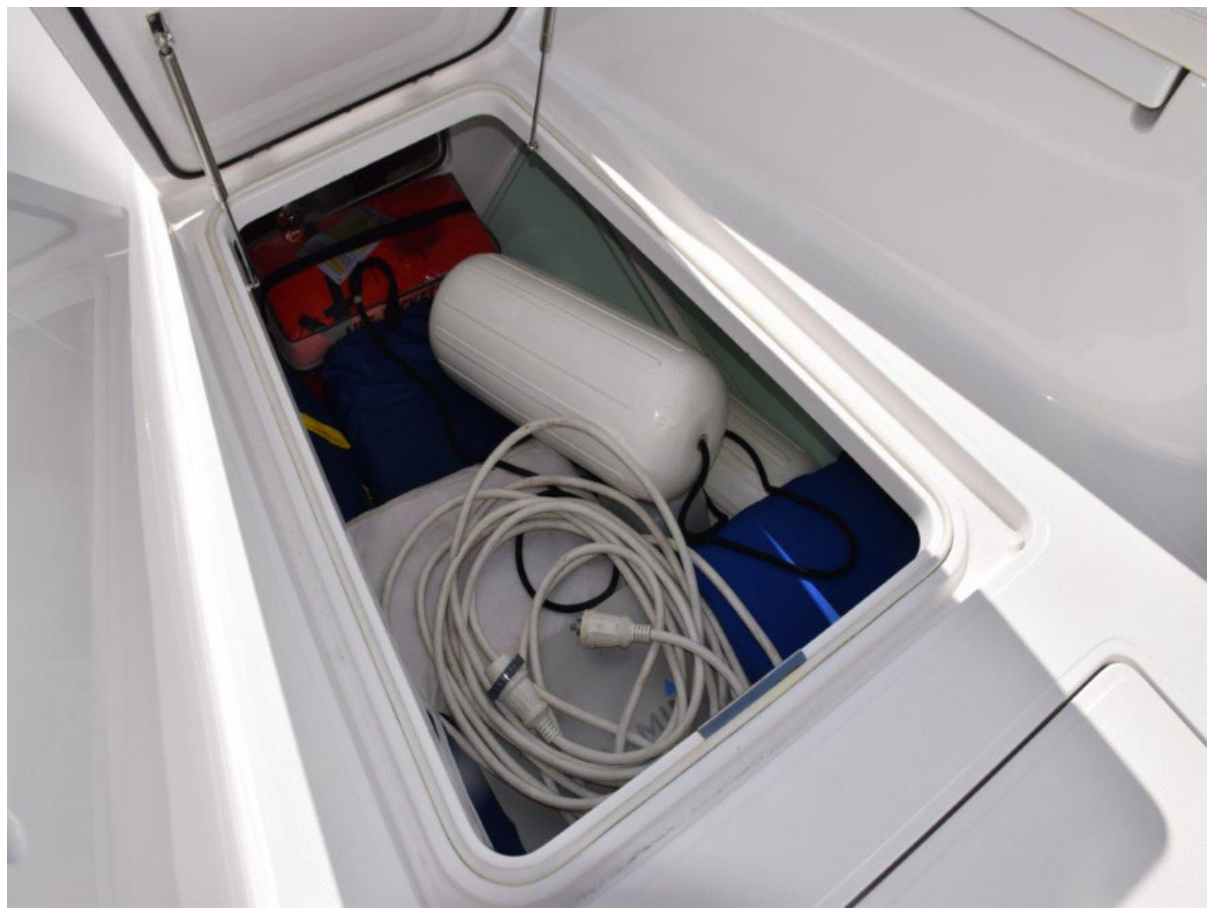
Large underdeck storage box forward