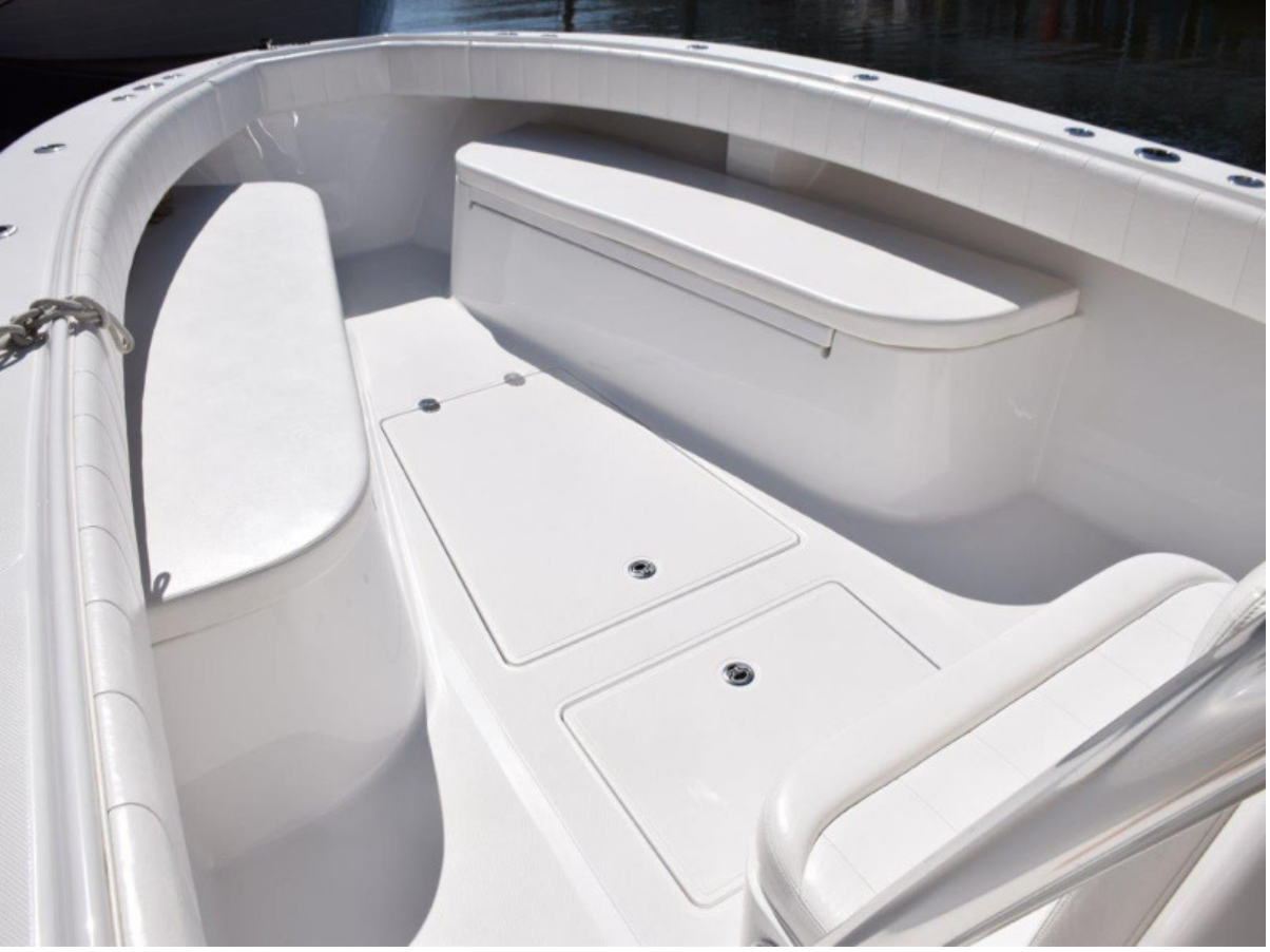
Forward seating, full coaming pads