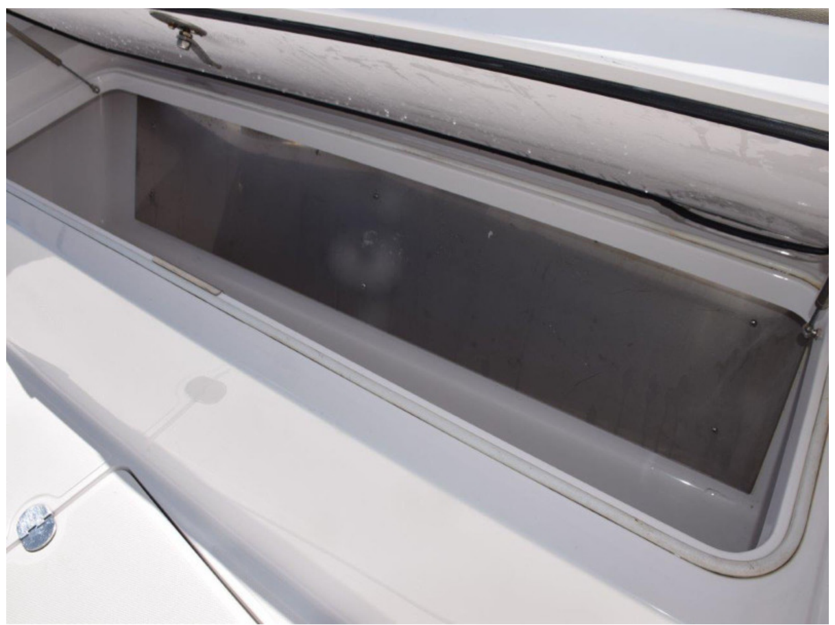
Refrigerated box beneath starboard forward seating lounge