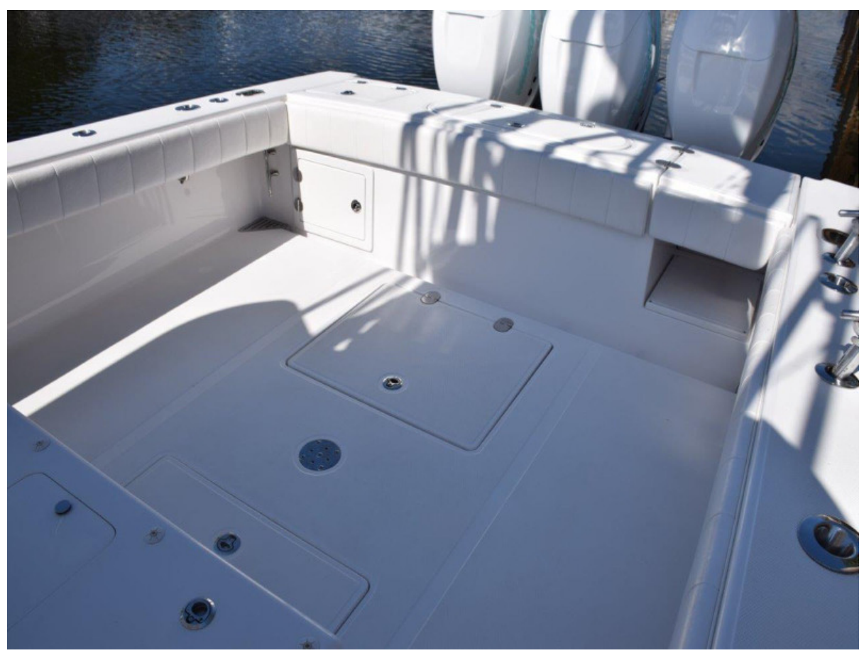
Nice size cockpit with transom door