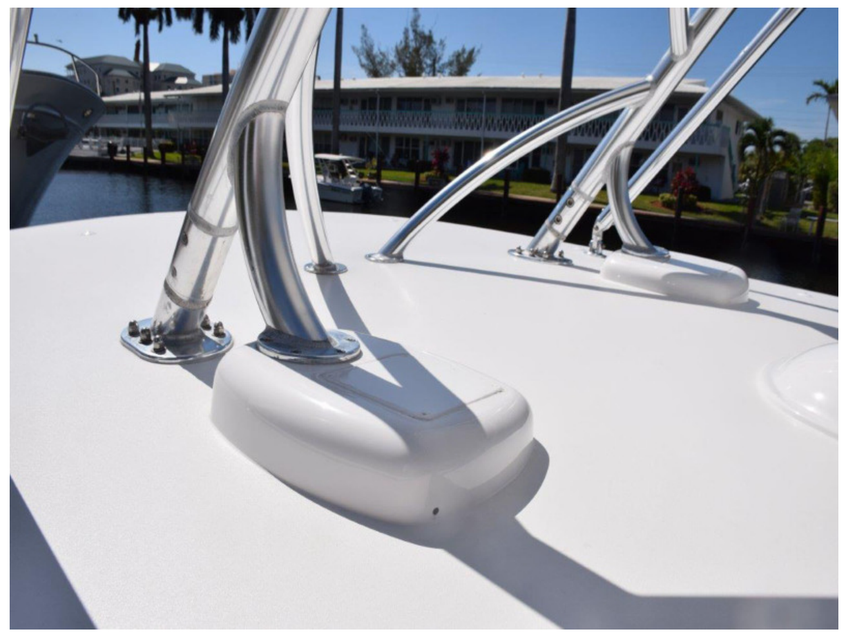
Tower can be removed with quick connects