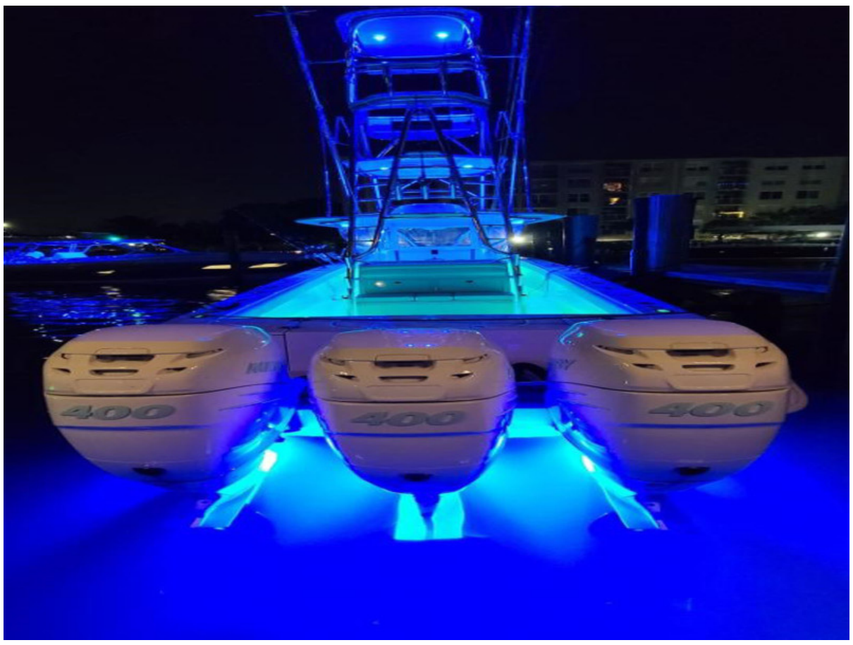
LED Night lighting