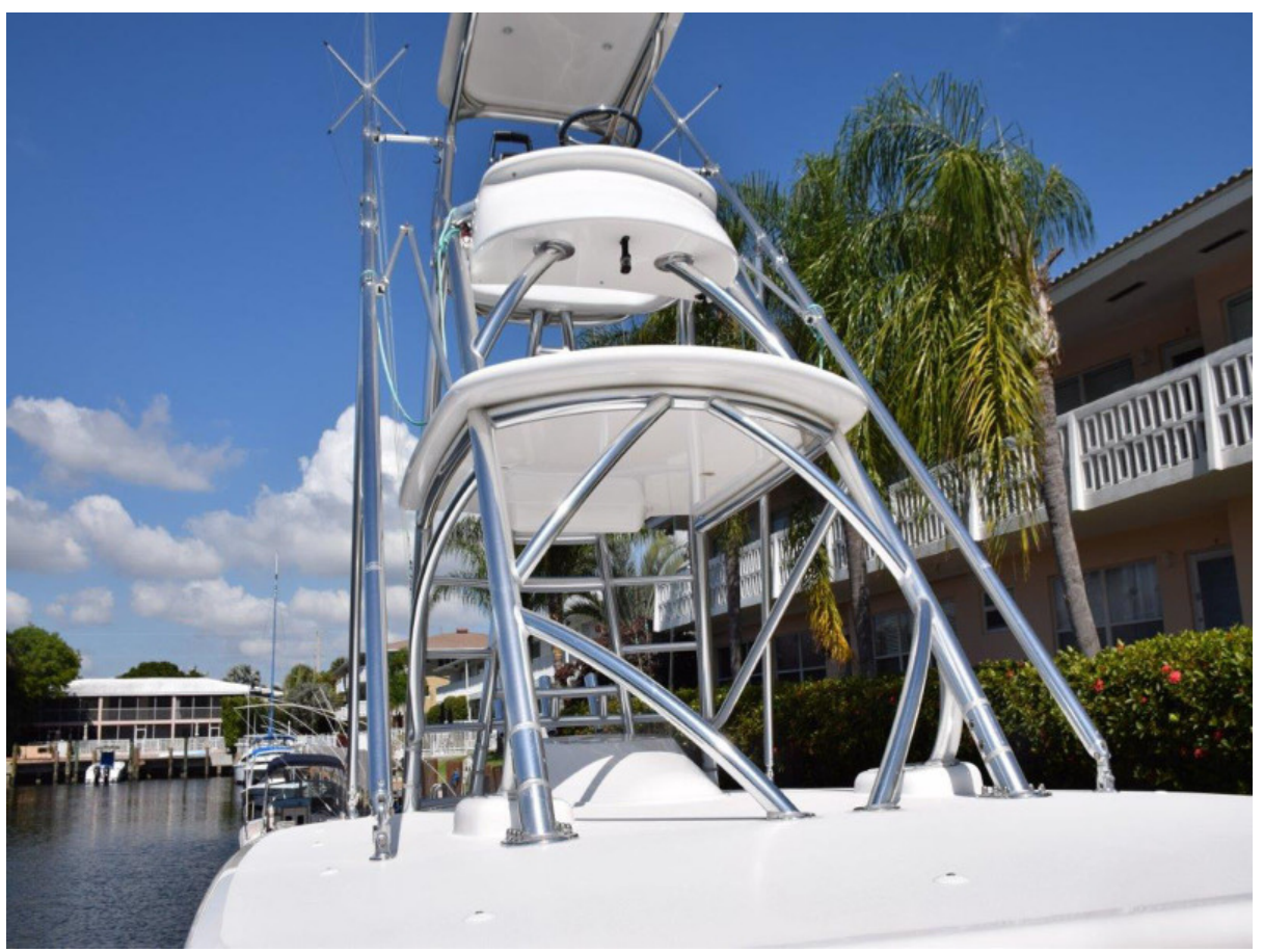
Palm Beach Towers, full upper helm