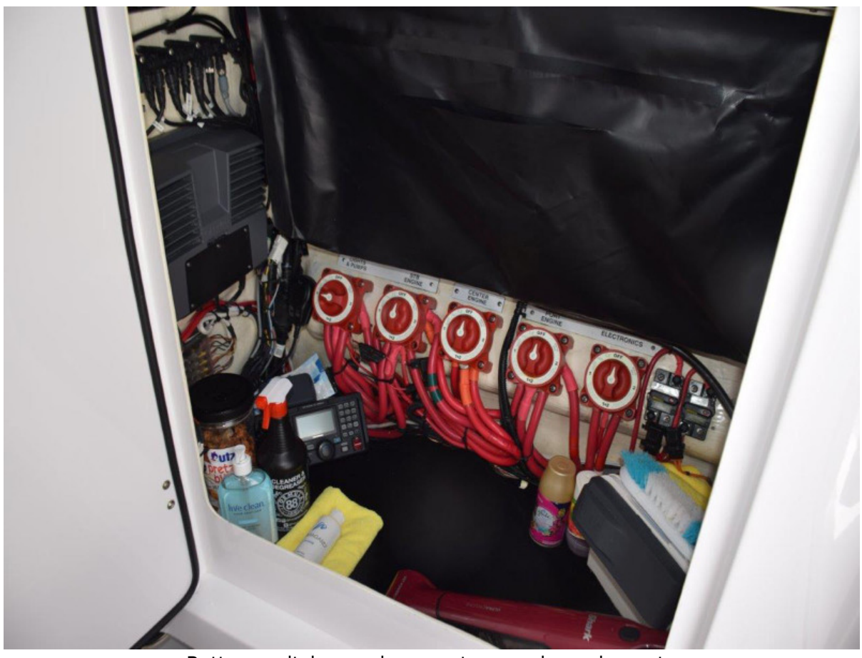
Battery switches and access to console equipment