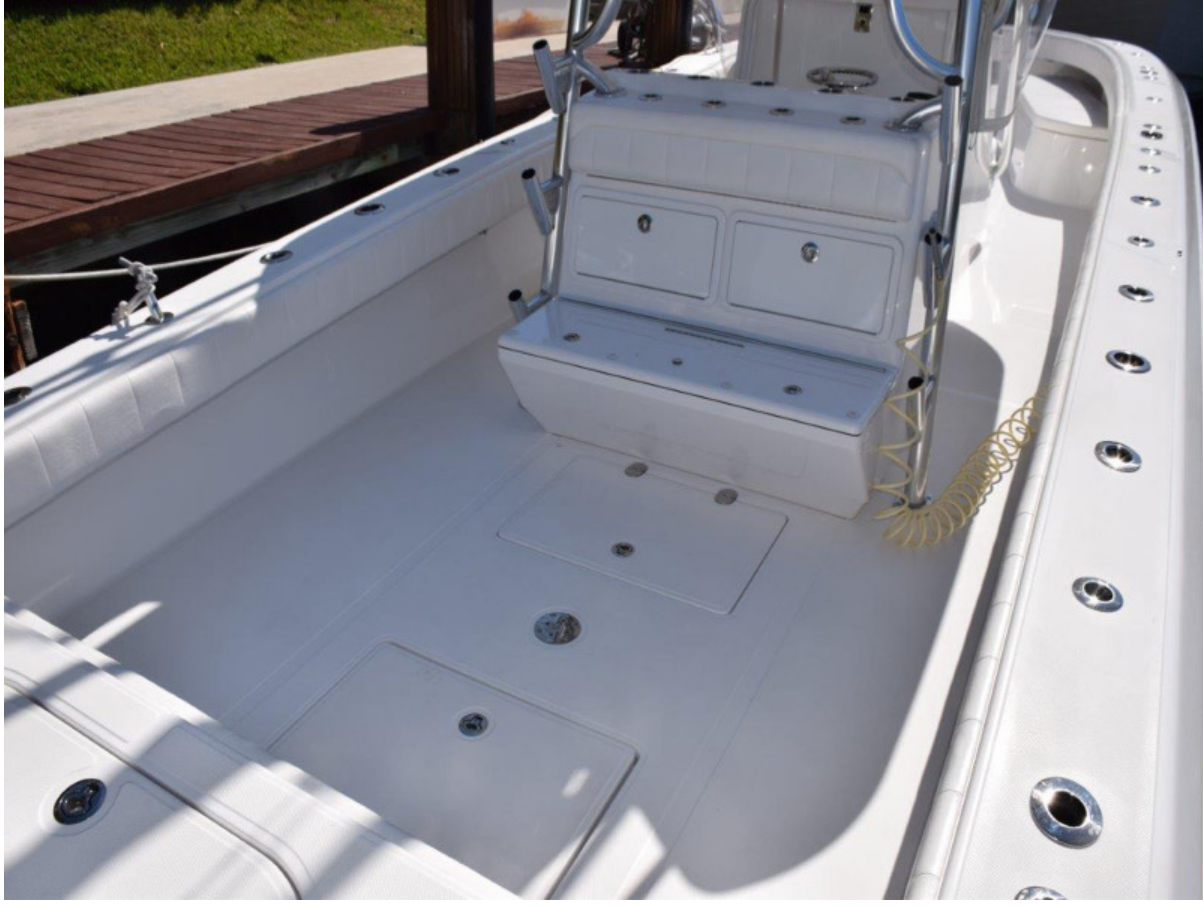
All the rod holders you could need