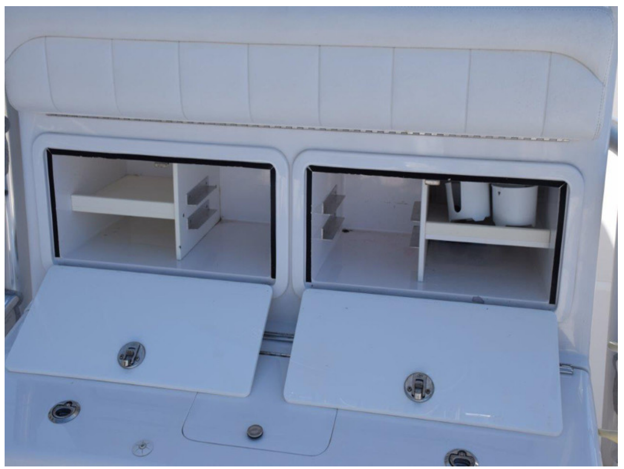
Tackle storage in backrest of rear facing seat