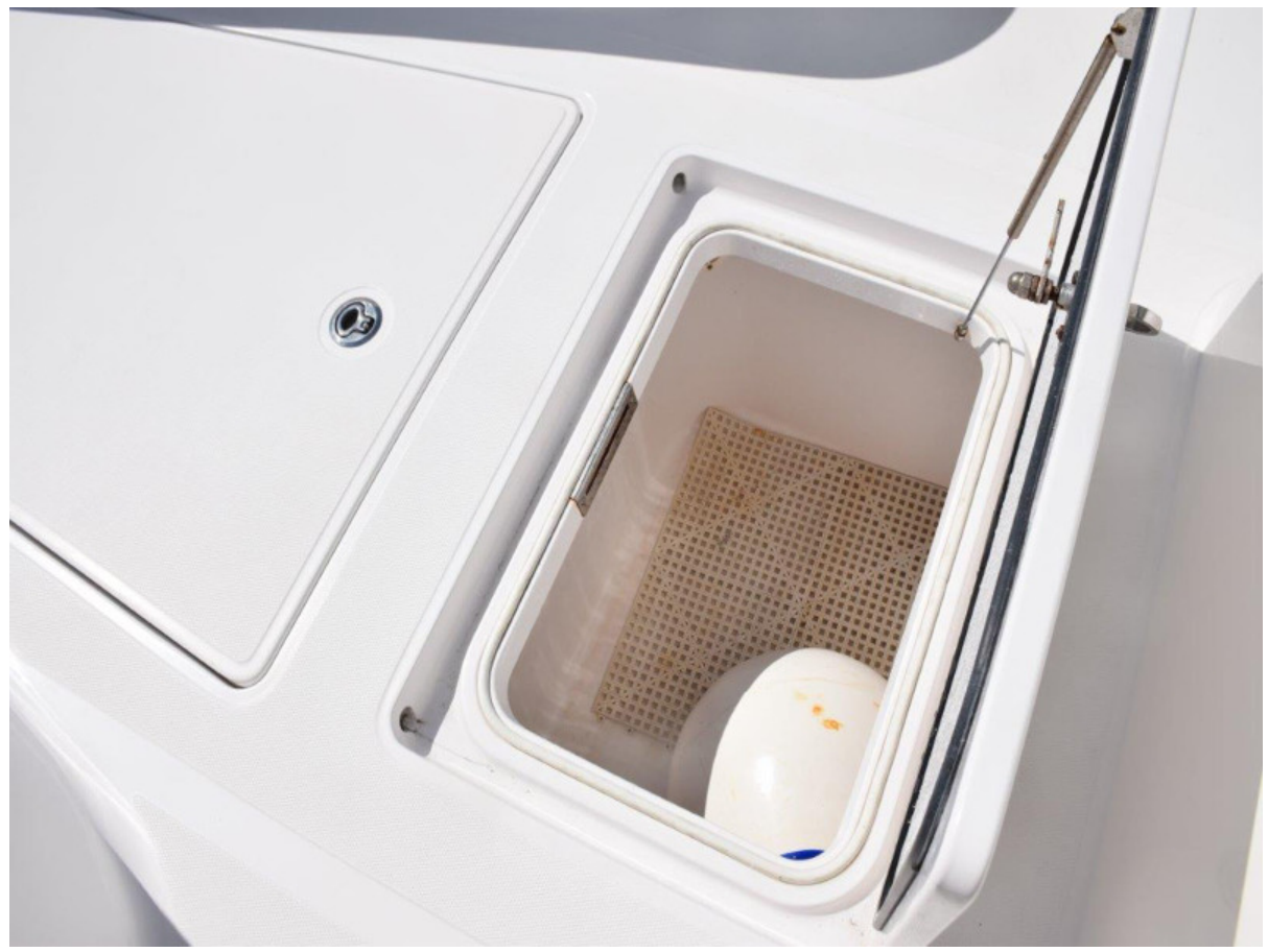
Forward livewell under deck