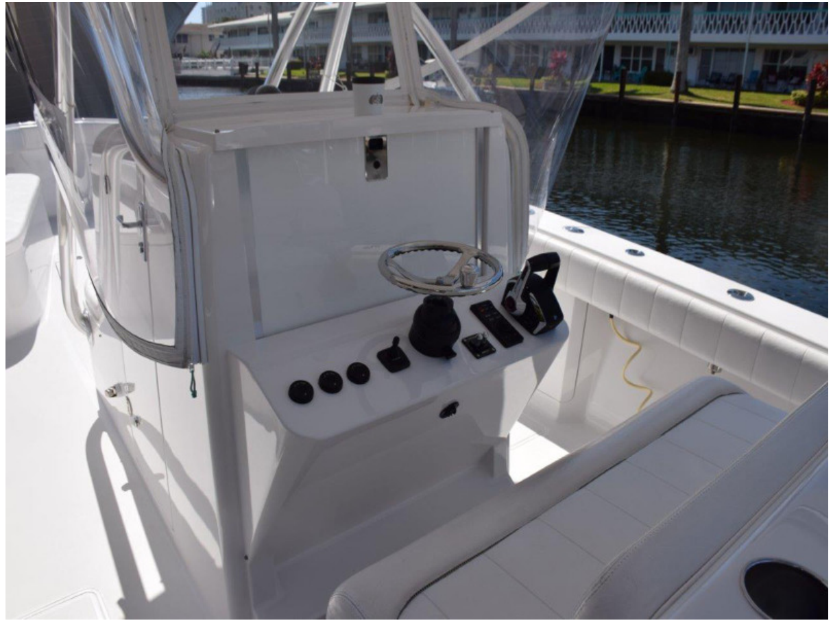
Locking electronics panel