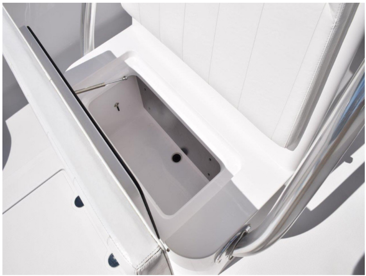
Refrigerated box beneath forward console seat