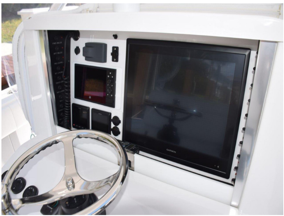
Large Garmin display