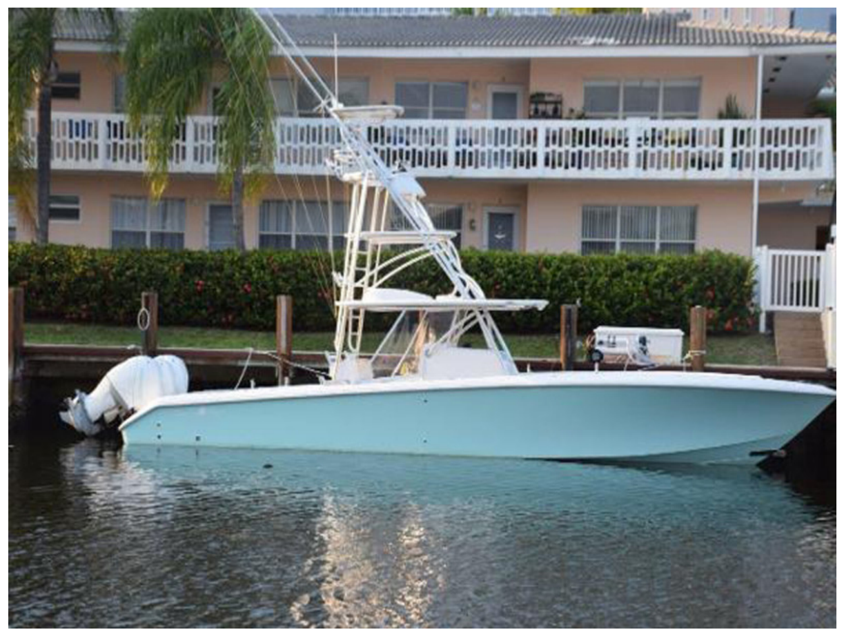
Starboard side at dock