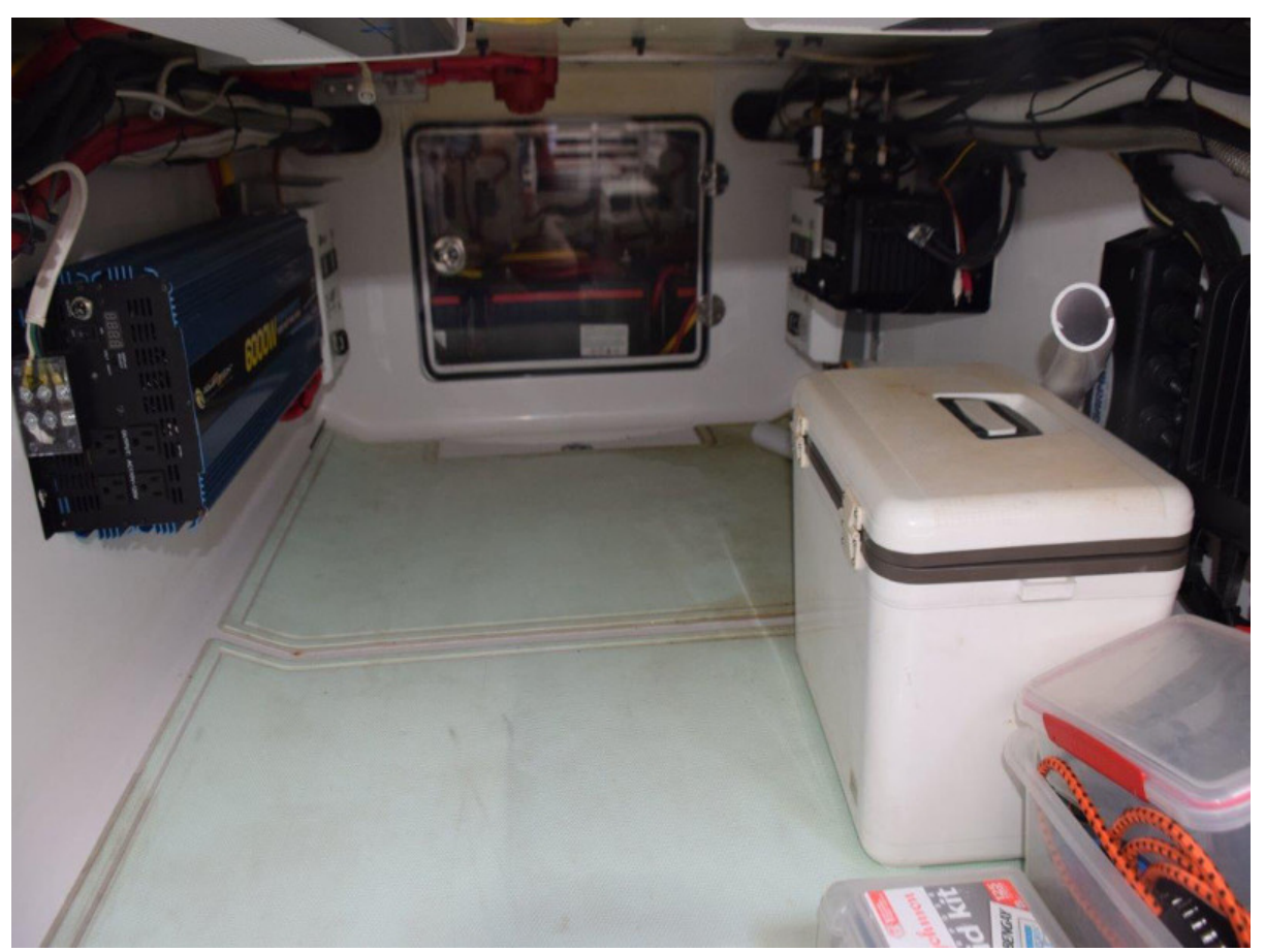
Large capacity inverter and dry storage beneath console