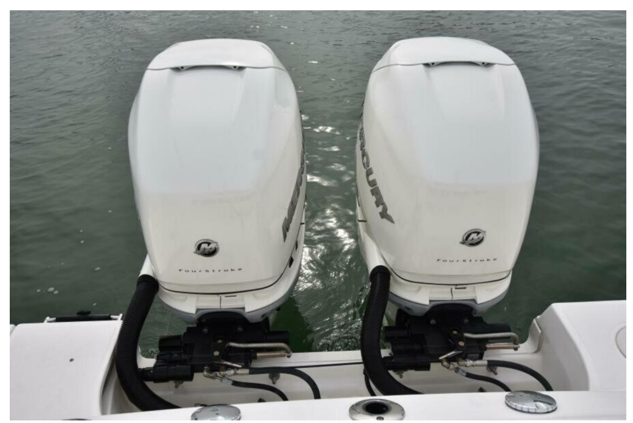
Mercury Verado 350's