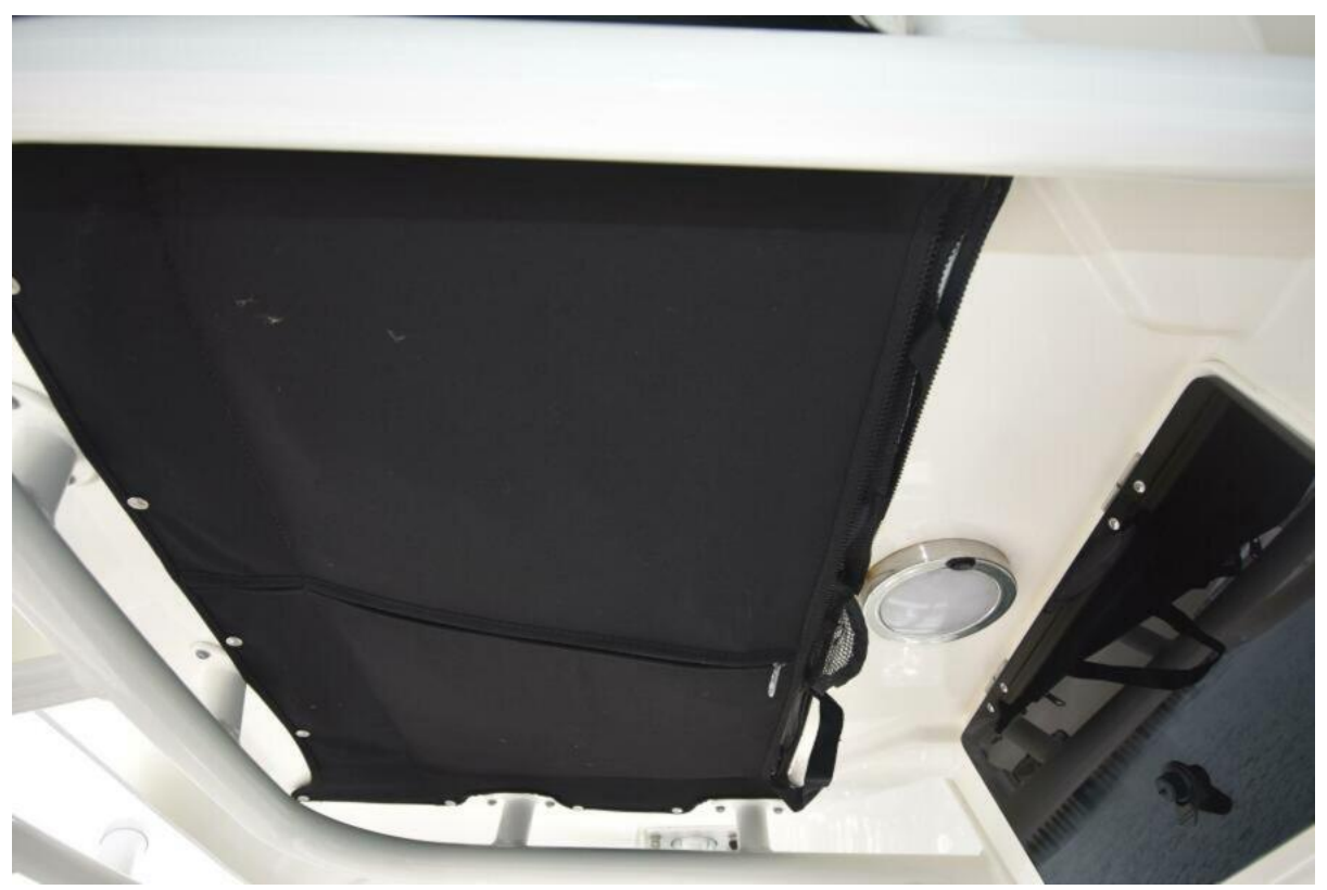
Life Jacket Storage