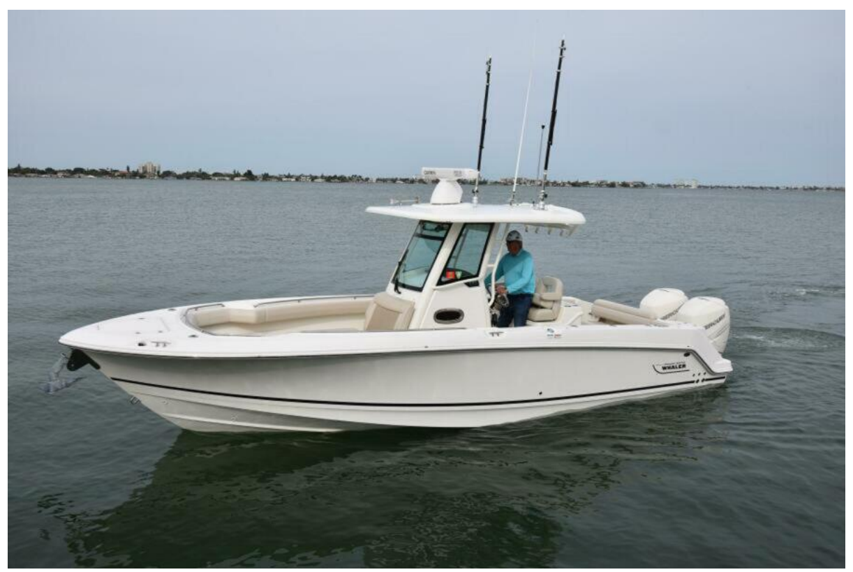
Alt Profile 2