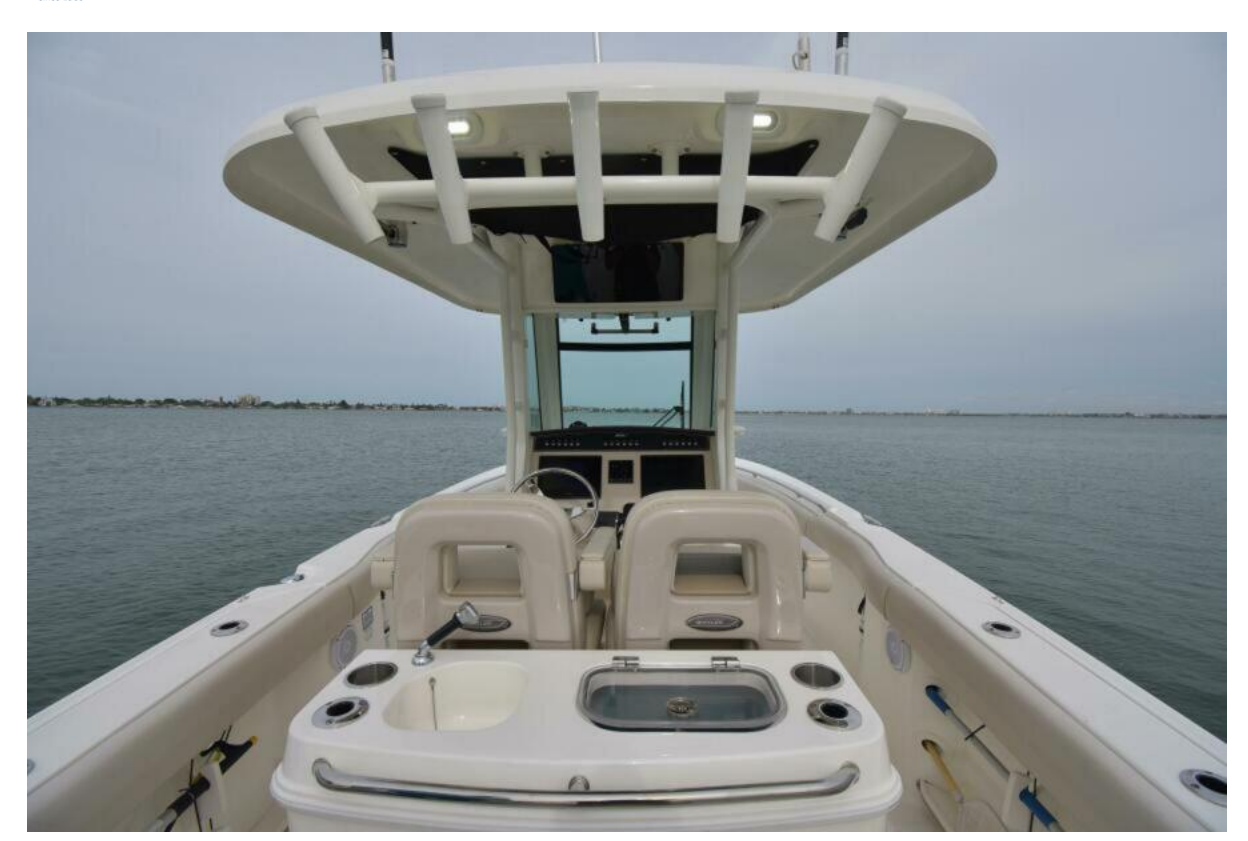
Aft Of Console