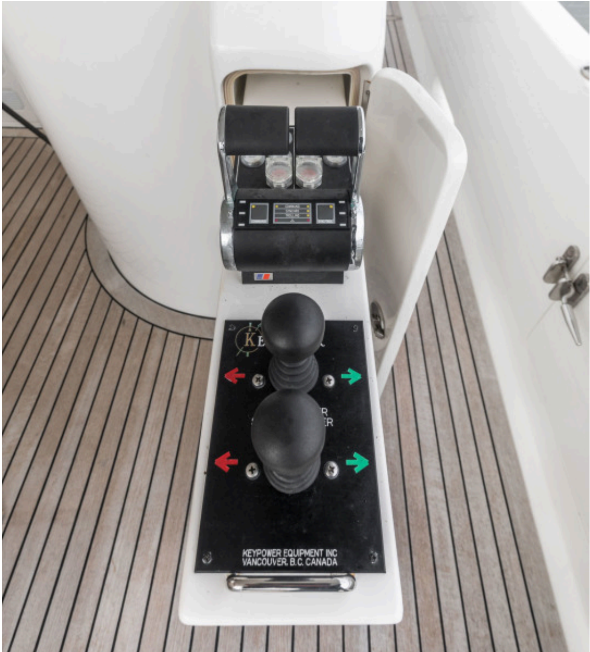
Starboard Aft Deck Docking System