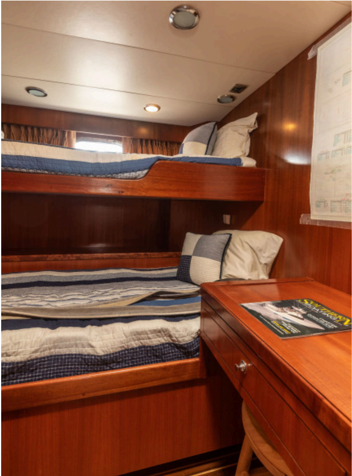
Aft Crew Cabin