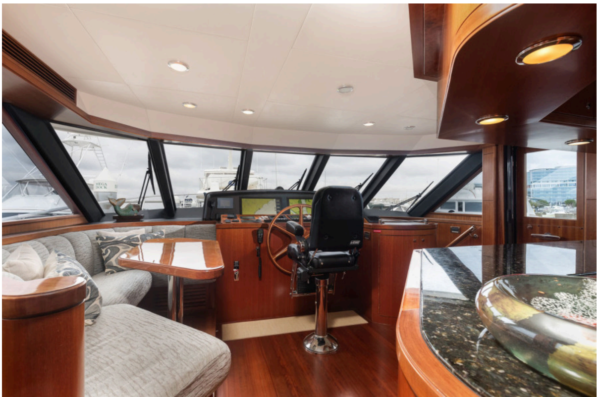
Lower Helm Galley Dinette