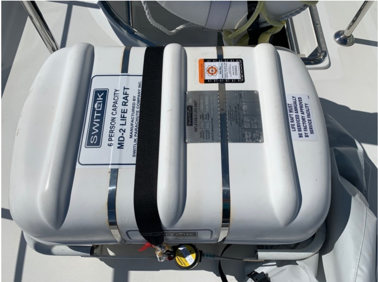
Canister Lift Raft (6) Man