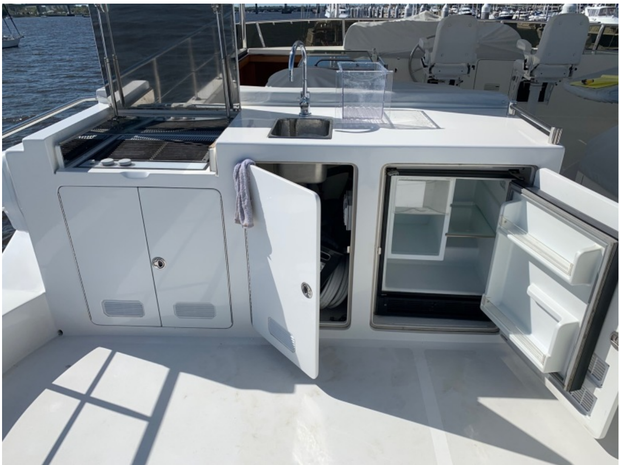
Flybridge Grill Center / Wet Bar