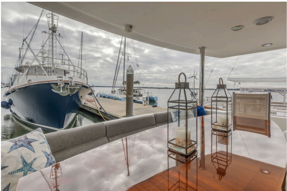
Aft Deck Settee Dining