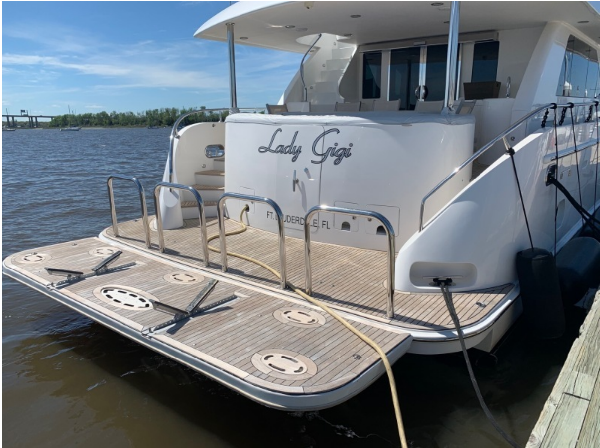
Transom with TNT Swim Platform