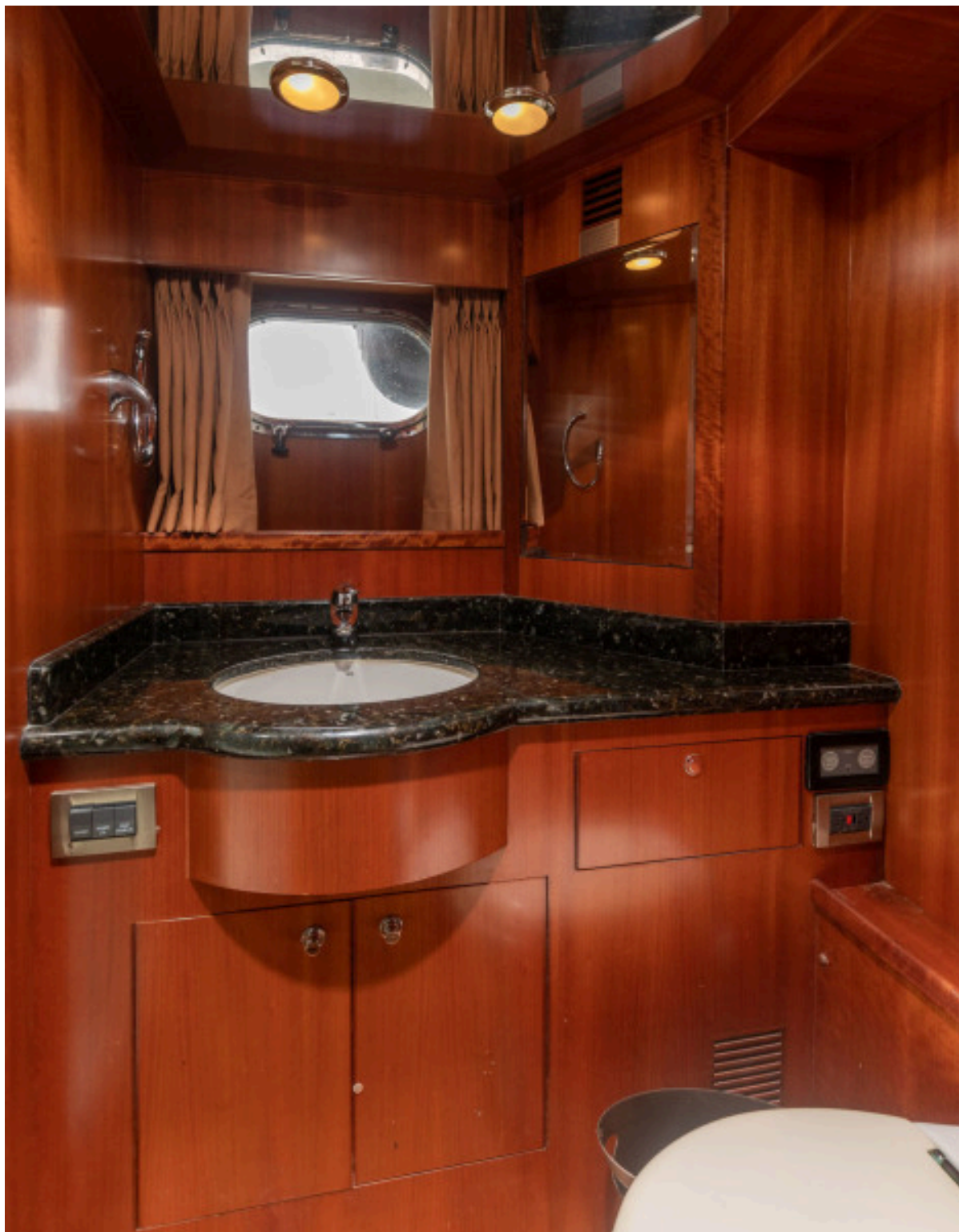
Aft Crew Head