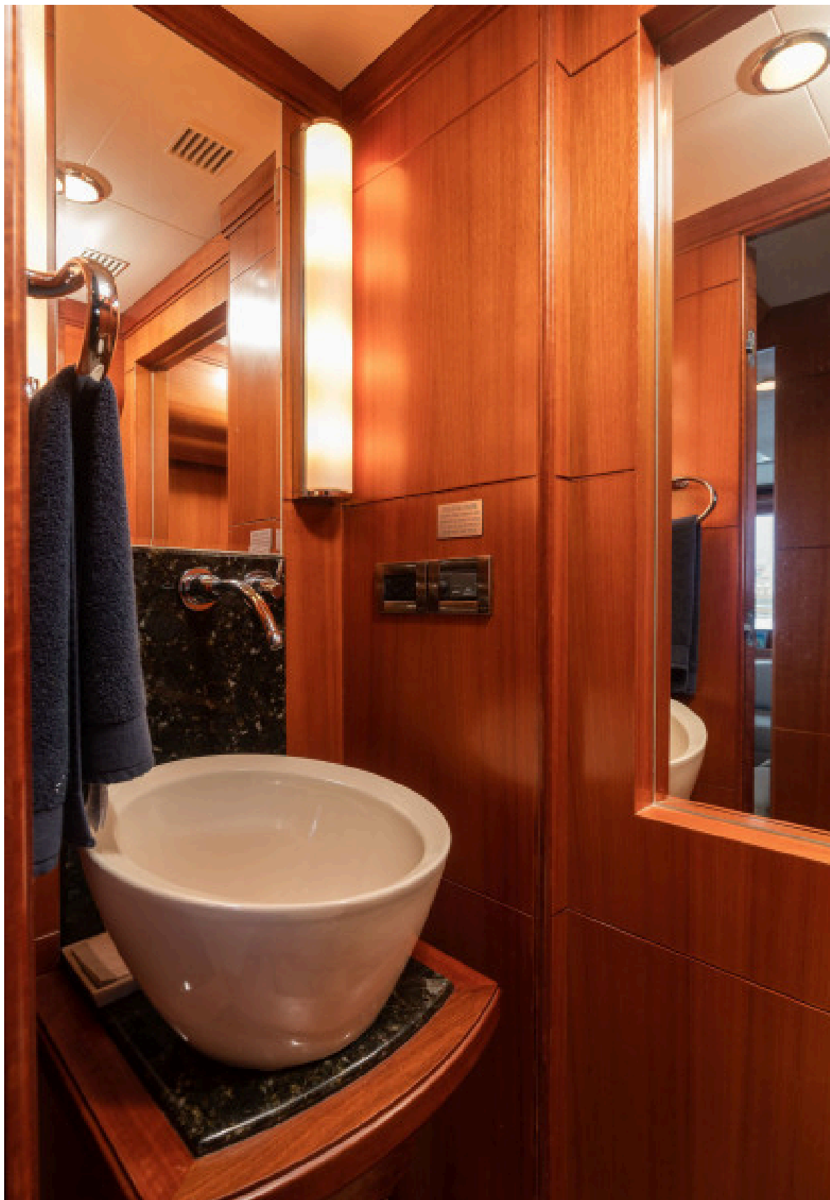
On Deck Day Head