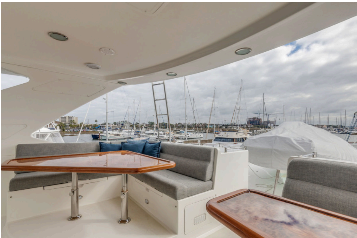
Starboard Settee w/Hi-Lo Table