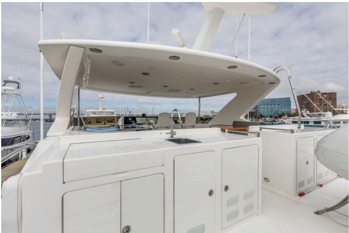
Flybridge Wet Bar / Grill Center