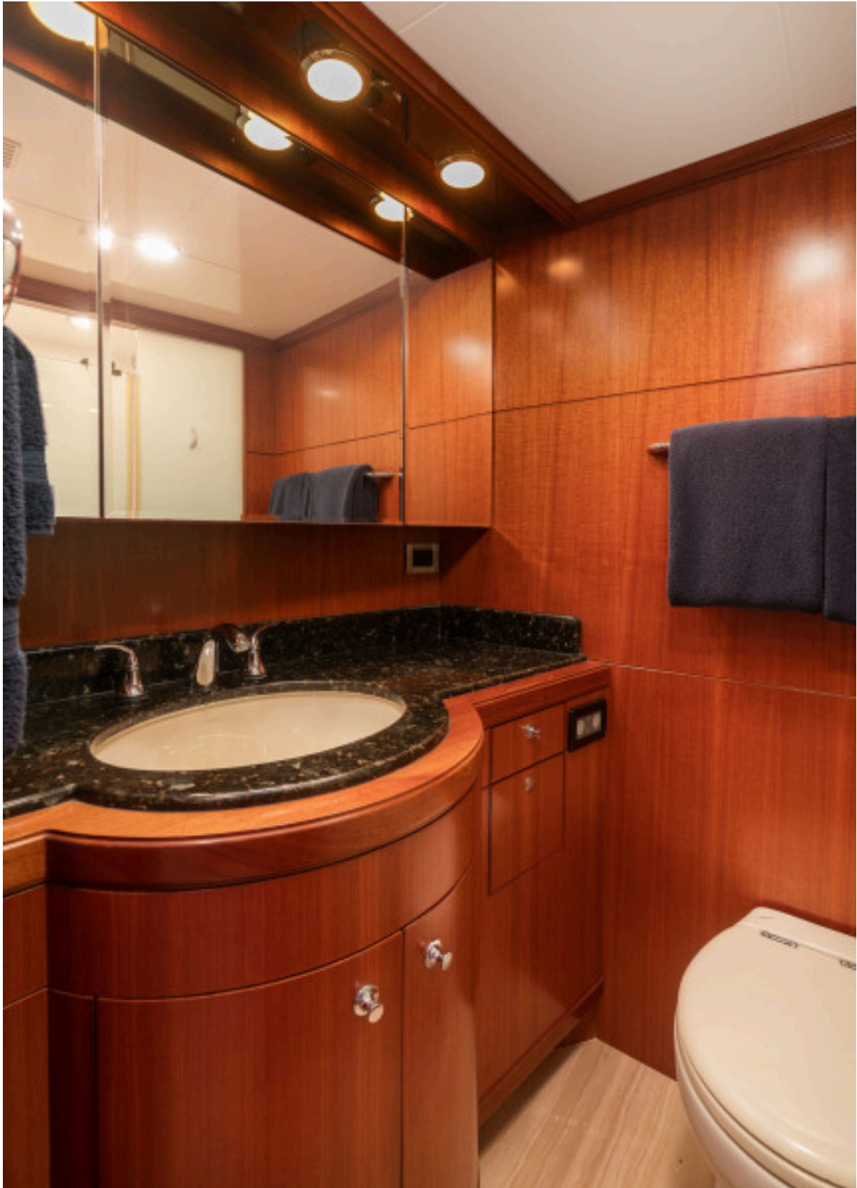
Port Guest Stateroom Ensuite Head