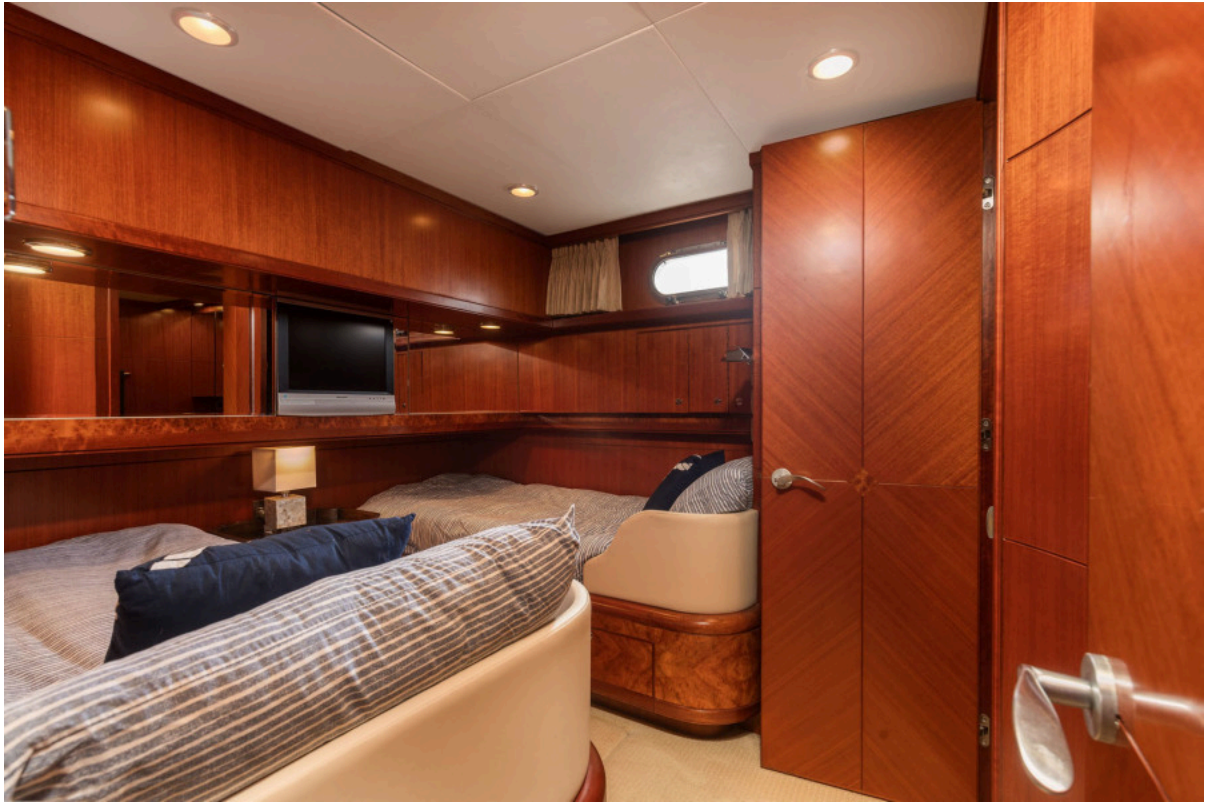
Port Twin Berth Guest Stateroom