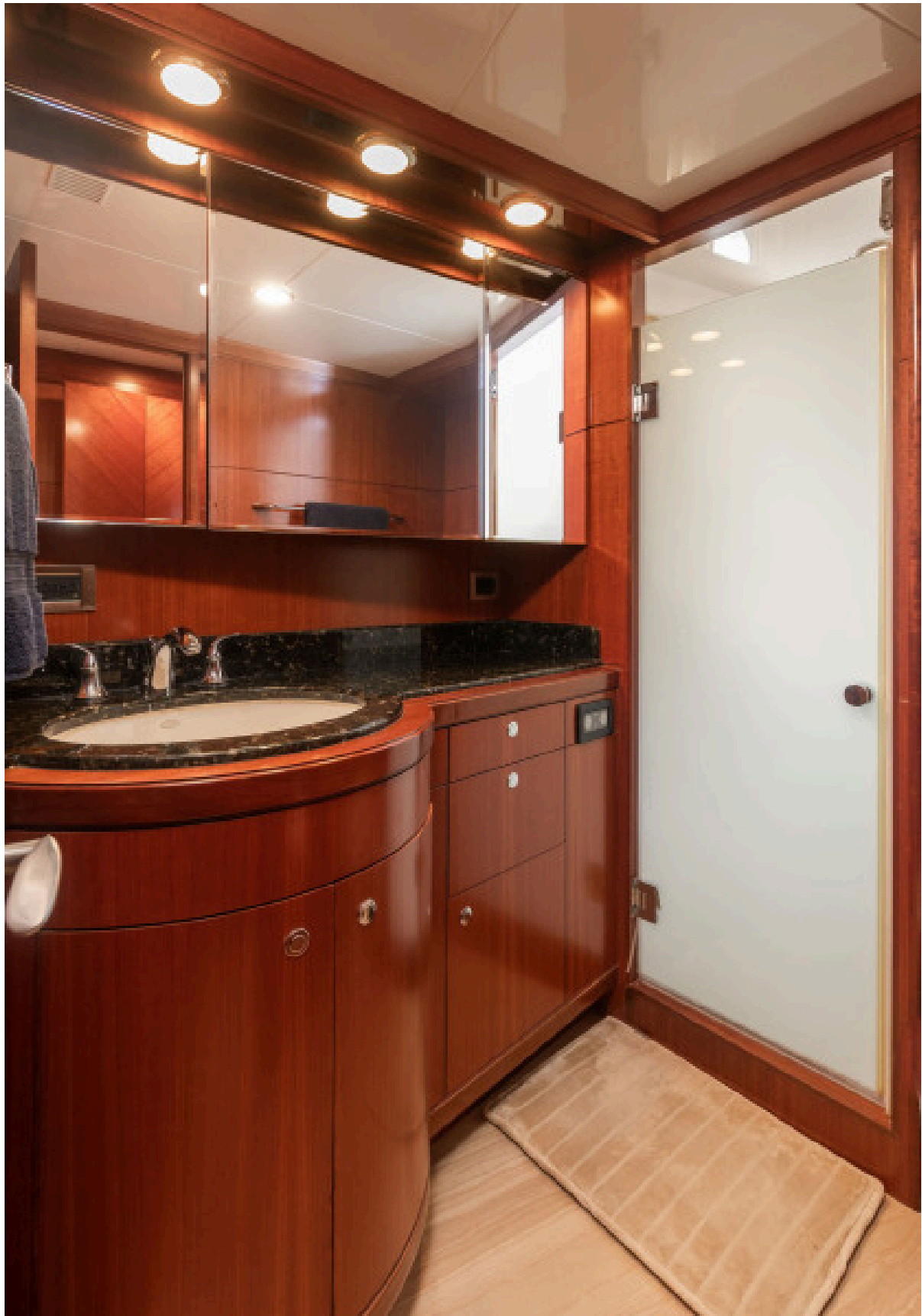
VIP Ensuite Head