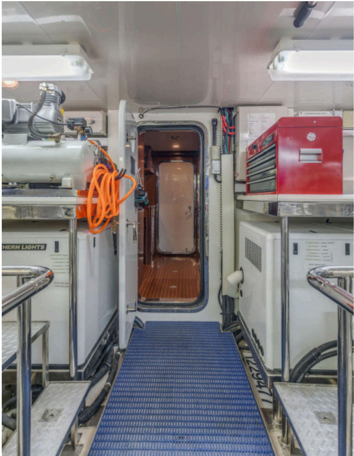
Engine Room Facing Aft to Crew Quarters