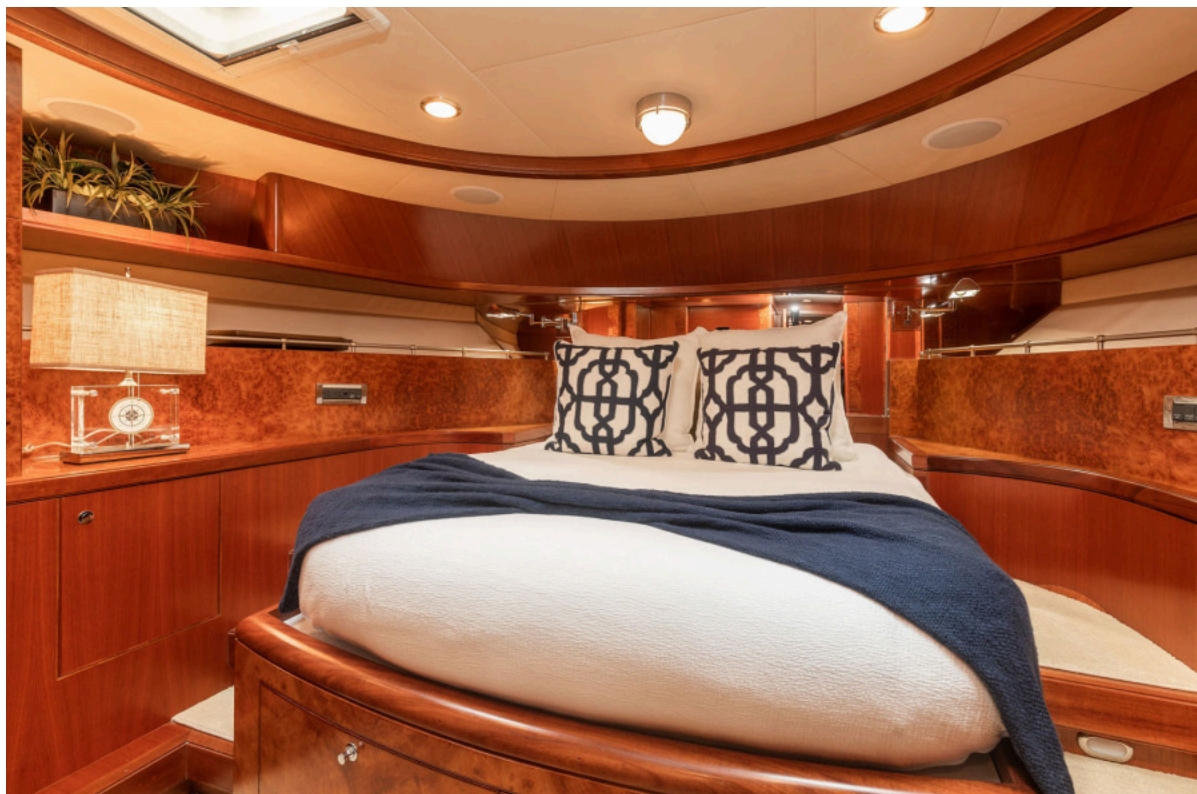
Forward Guest VIP Stateroom