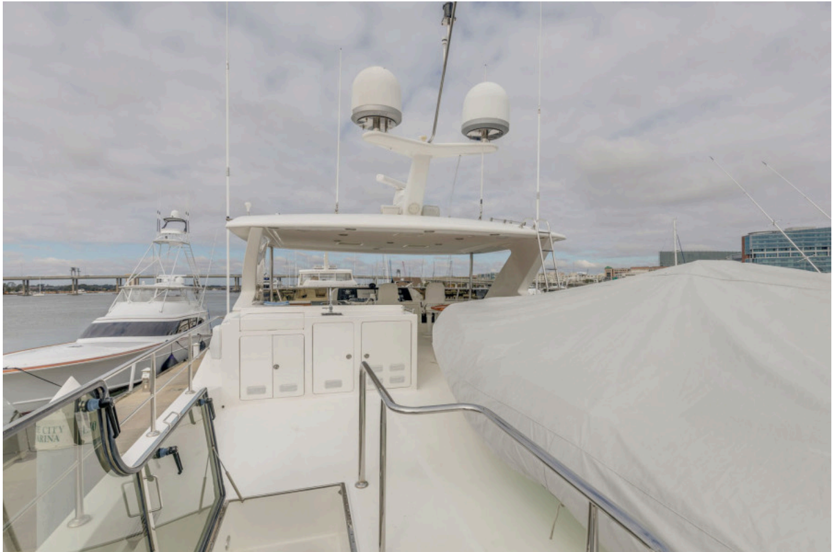
Boat Deck-Tender-Aft Deck Access to Bridge