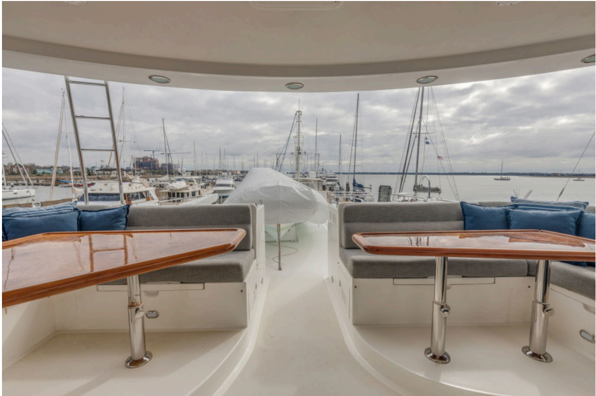
Flybridge Port and Starboard Settees with Hi-Lo Tables