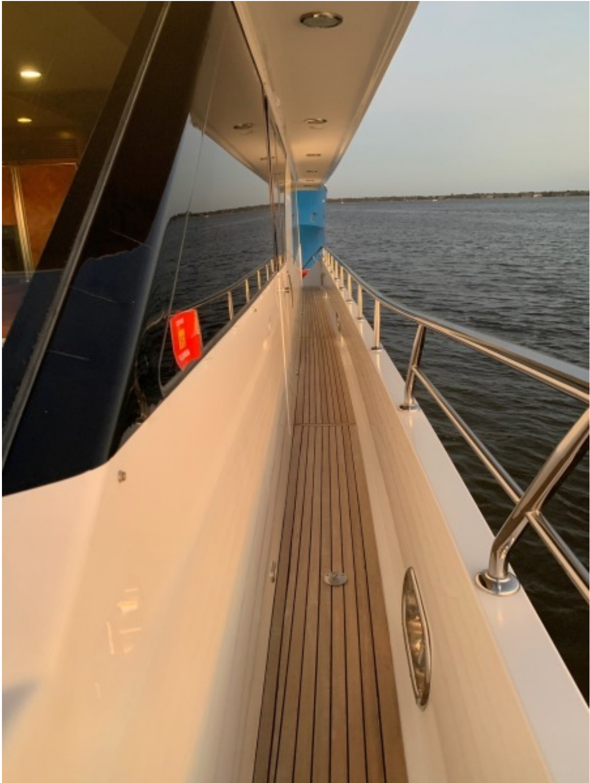
Walk Around Side Decks