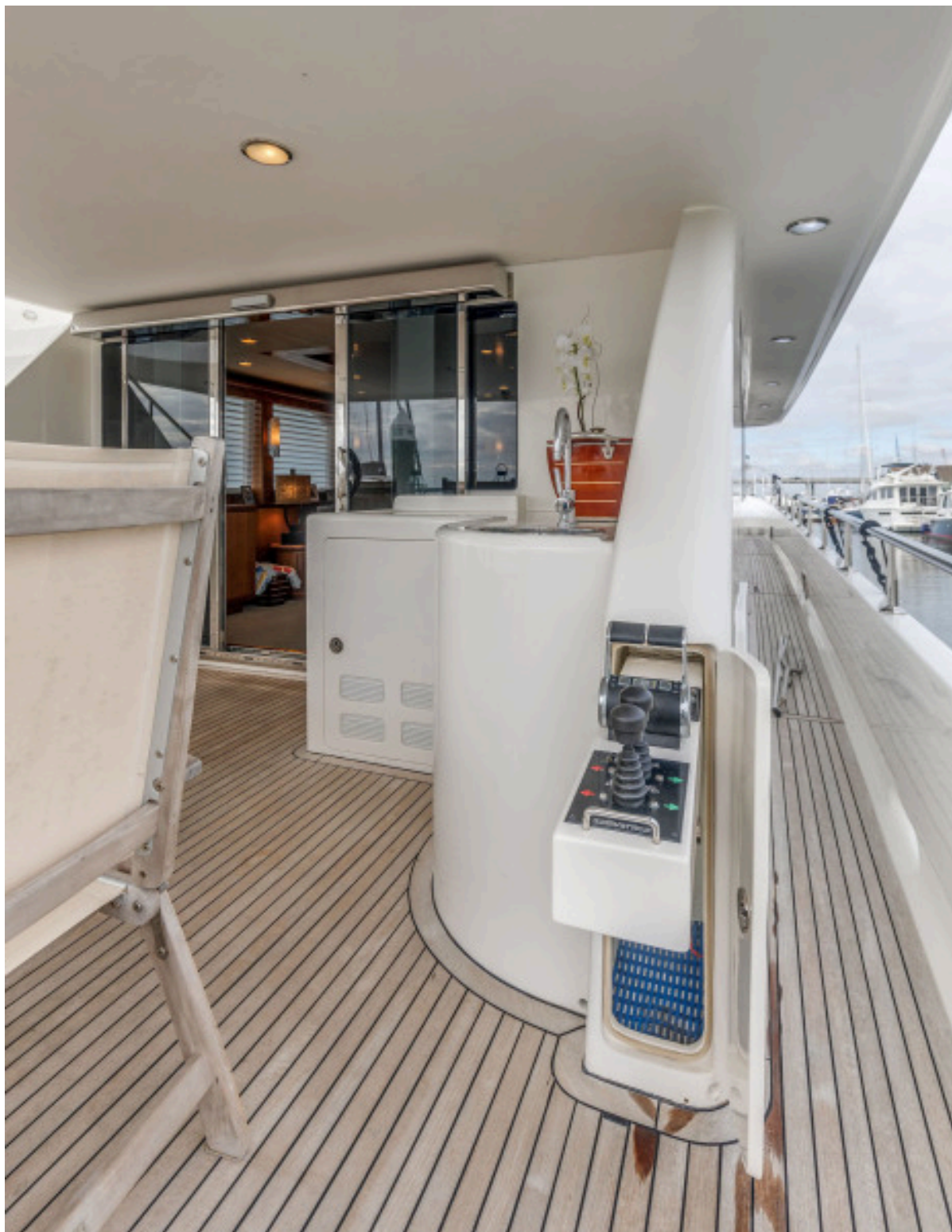
Aft Deck Flip up Docking System