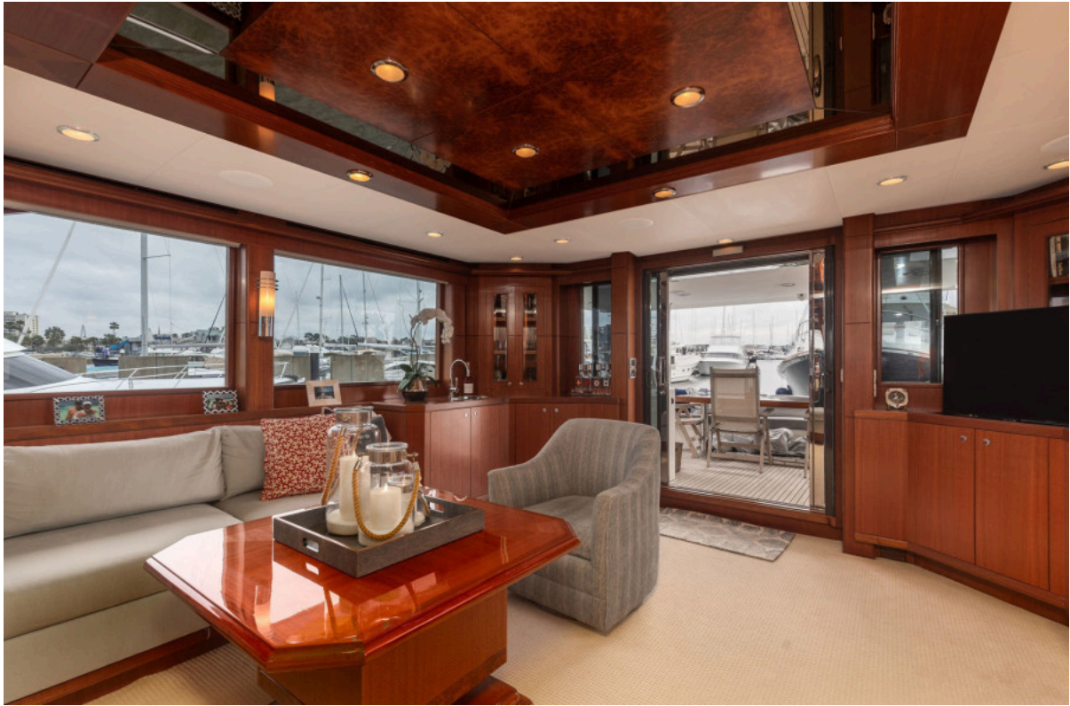
Main Salon Aft