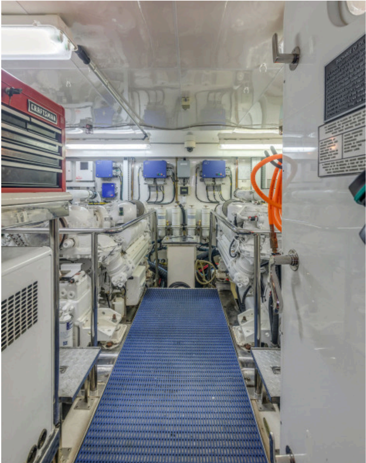
Engine Room Facing Forward