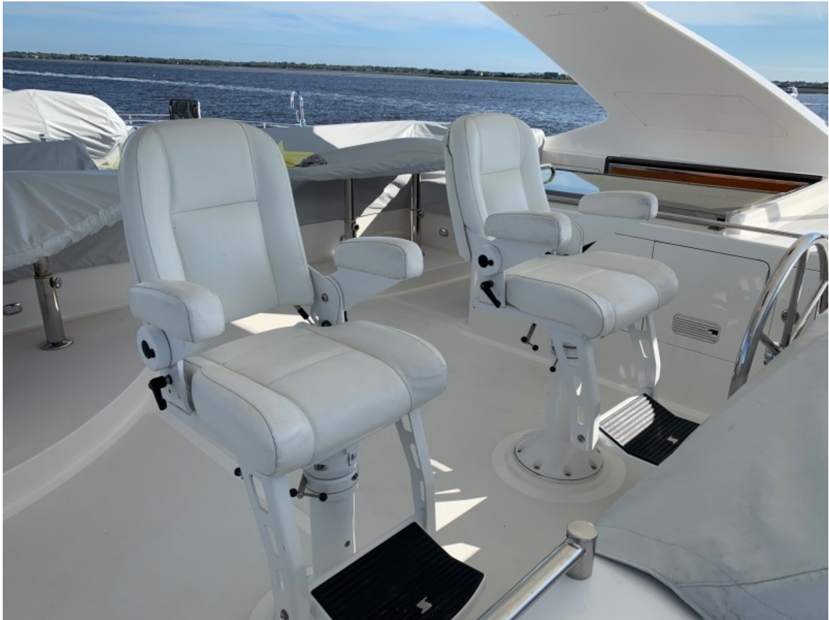
Flybridge Helm and Companion Seats