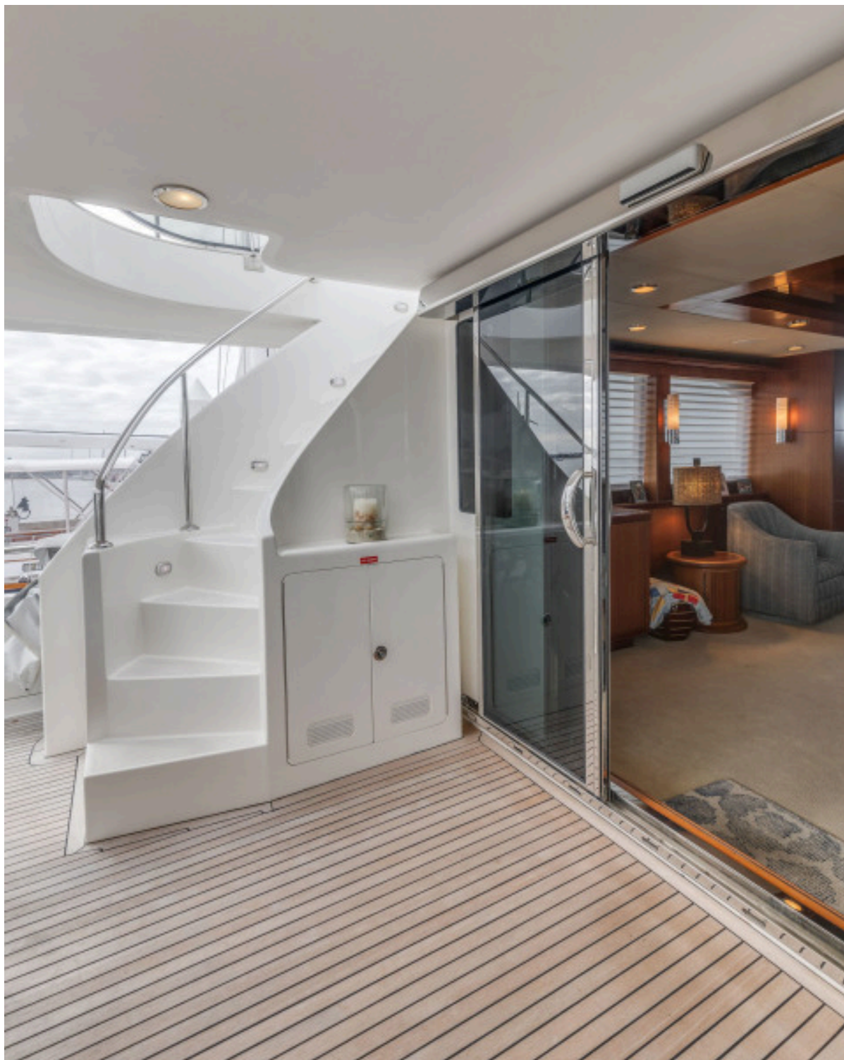
Aft Deck Stairwell to Flybridge