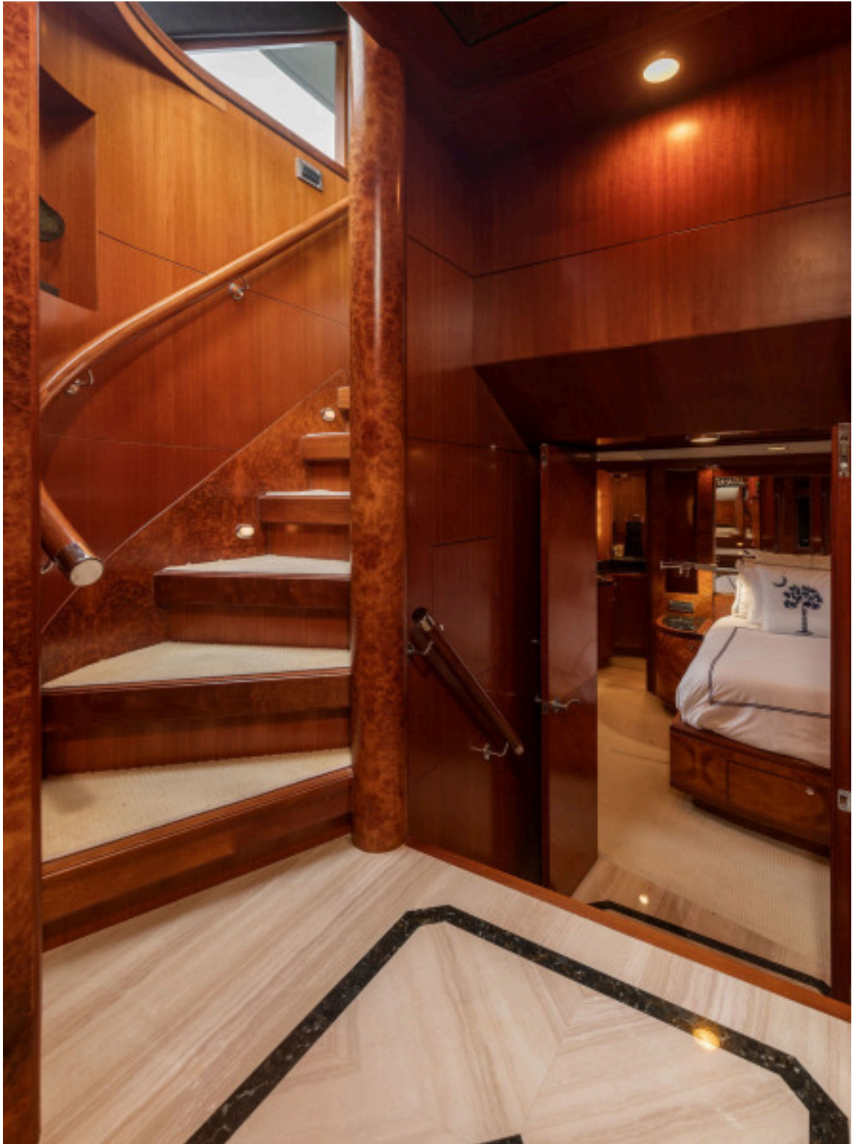
Stairwell from Pilothouse to Owner / Guest Staterooms