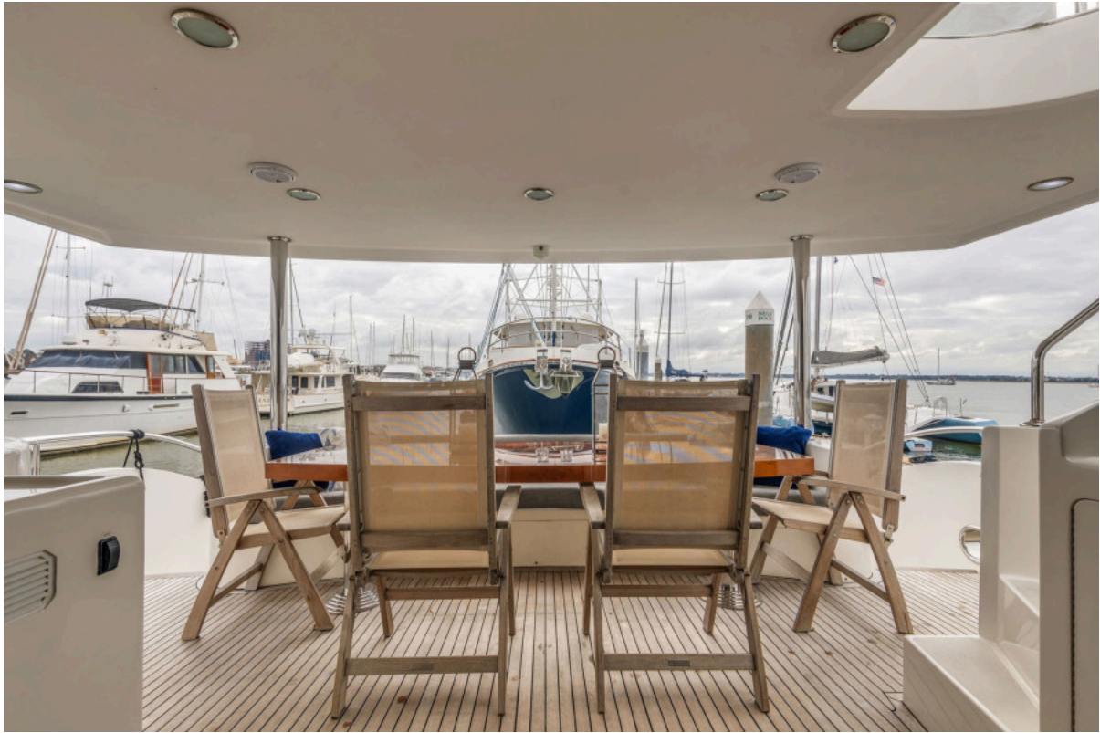
Aft Deck Dining