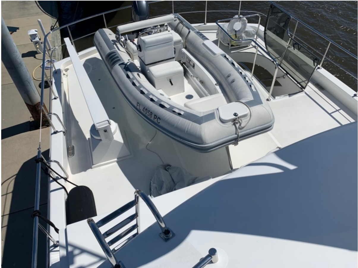
Tender 15' with 70 HP 2010 Novurania