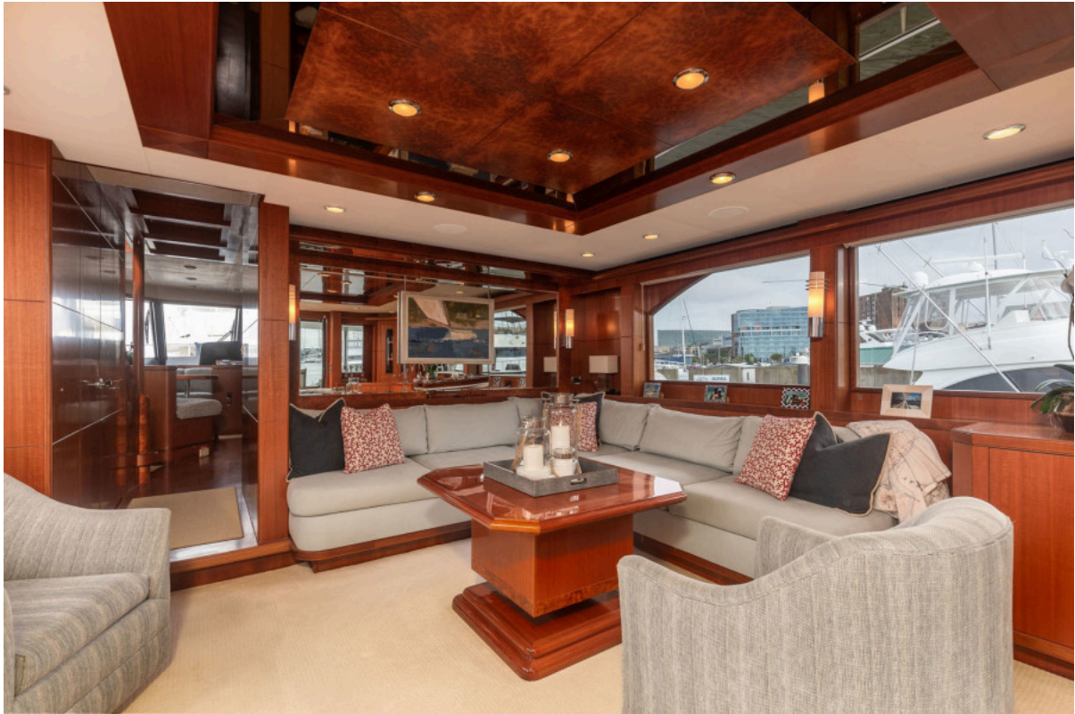
Forward Main Salon