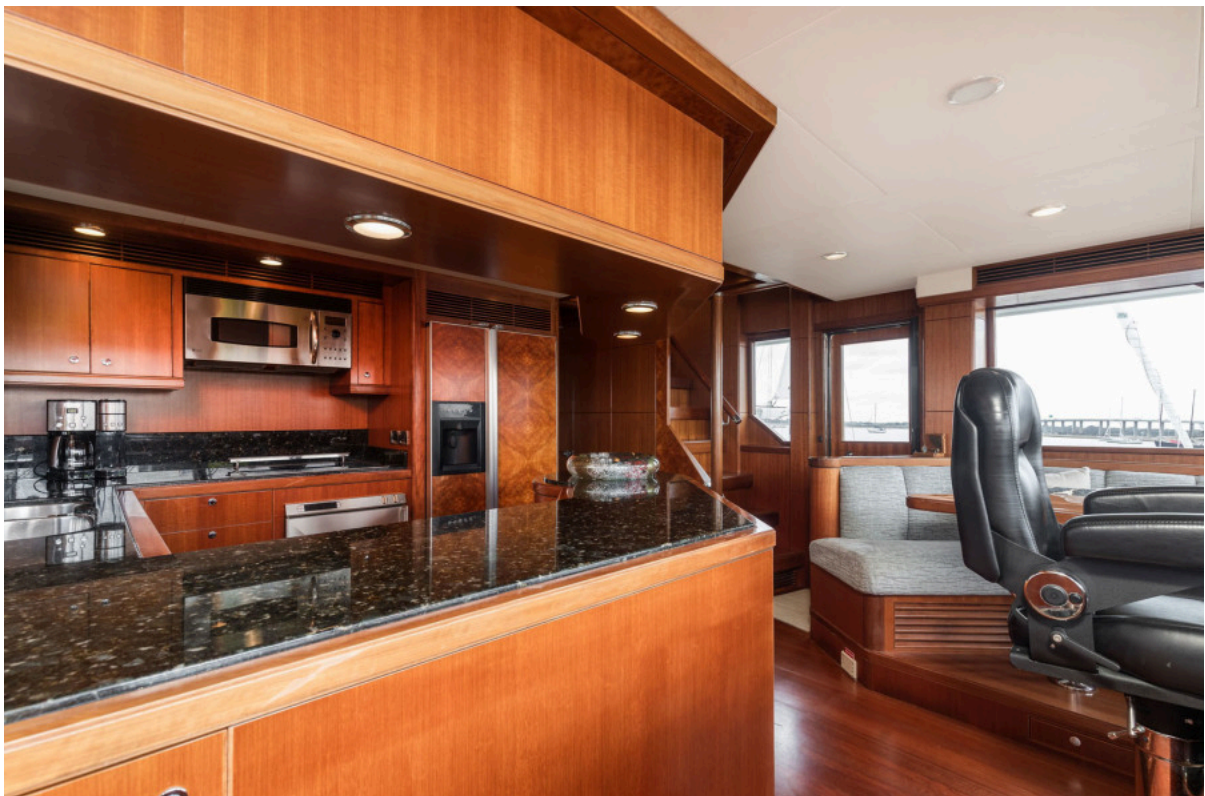
On Deck Galley