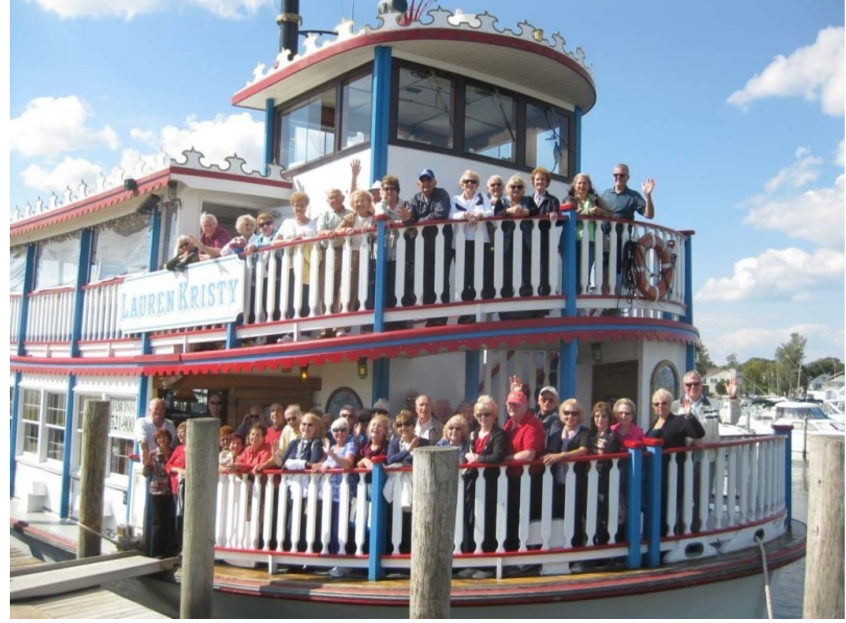
Passengers on the Bow