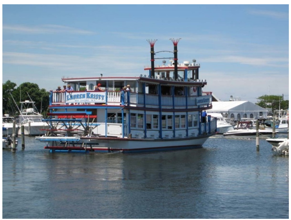
Starboard Aft Quarter