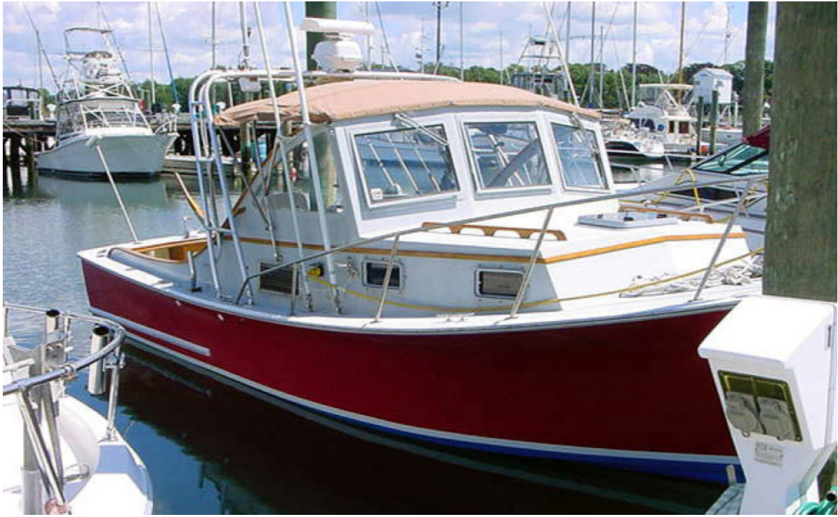
Starboard Profile At Dock