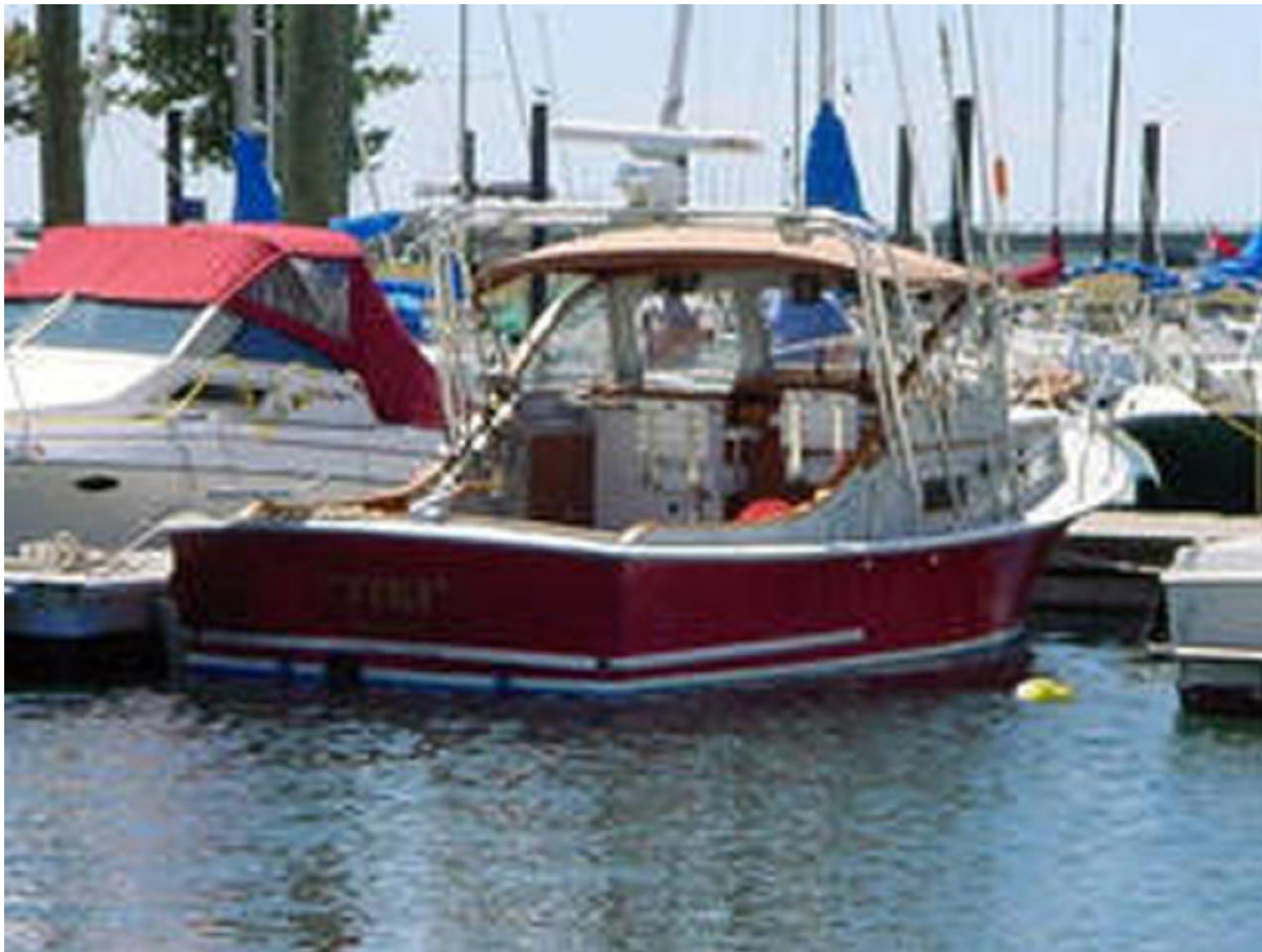
Starboard Aft Quarter