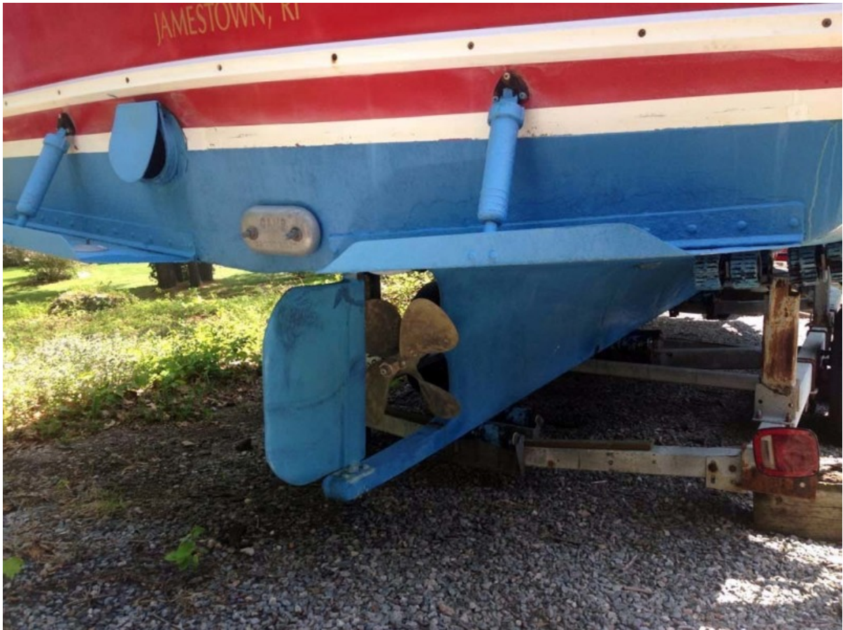
Skeg And Prop