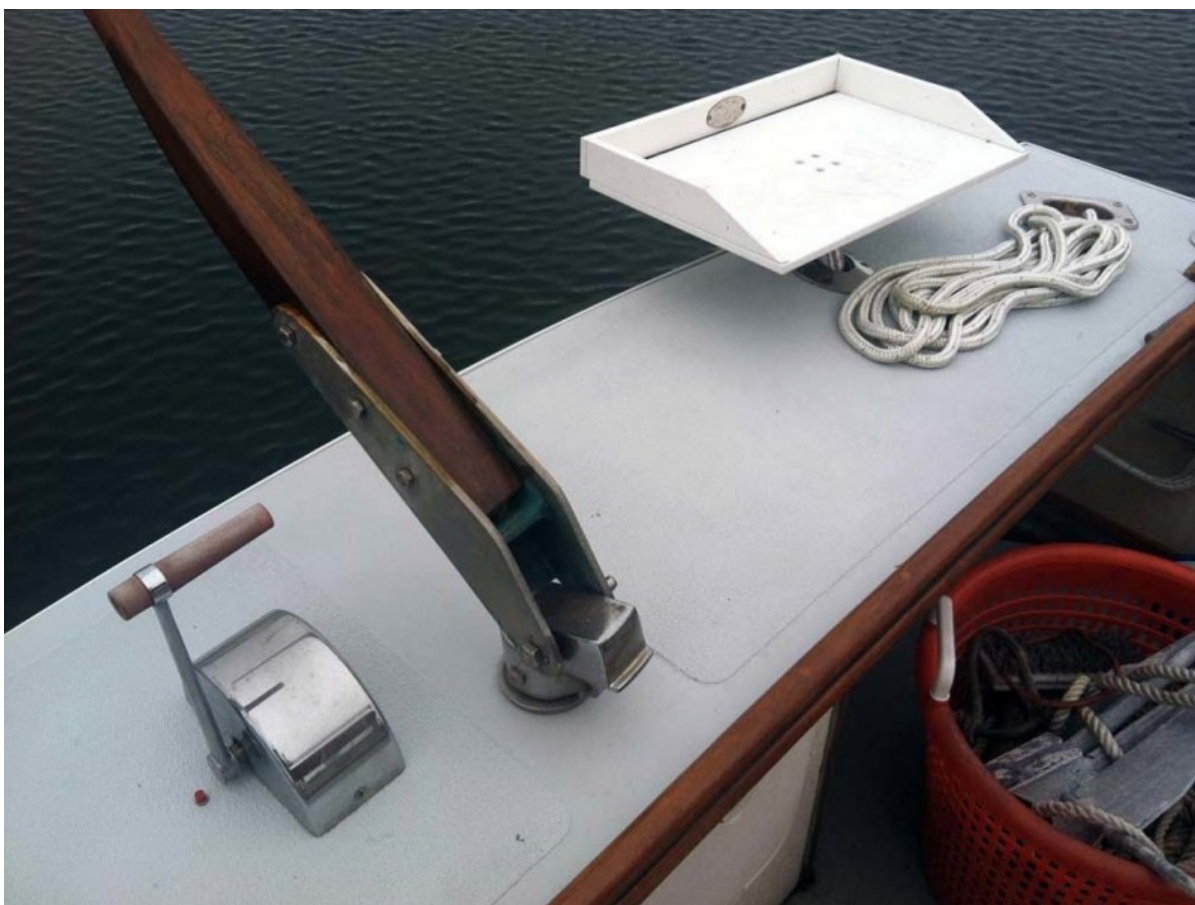
Stern Helm Tiller Steering