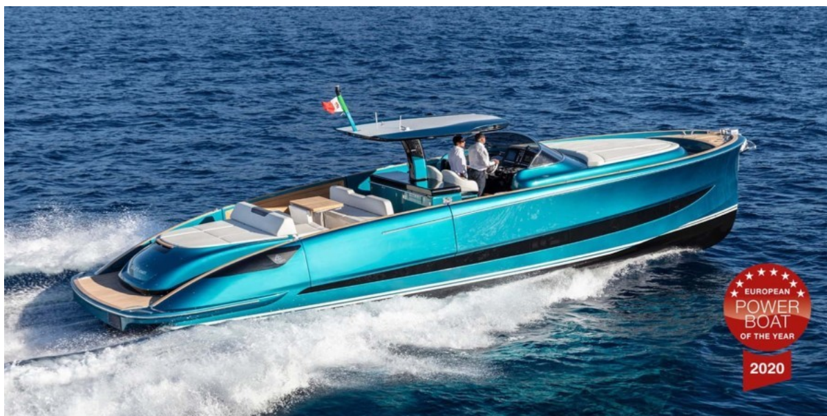
Starboard Side Running