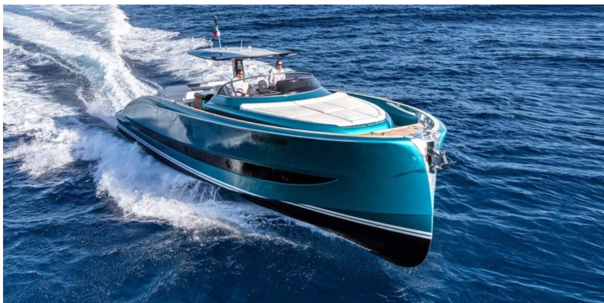
Starboard Bow Running