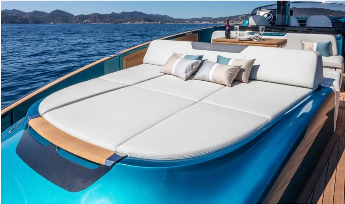
Stern Sunbathing Mattresses