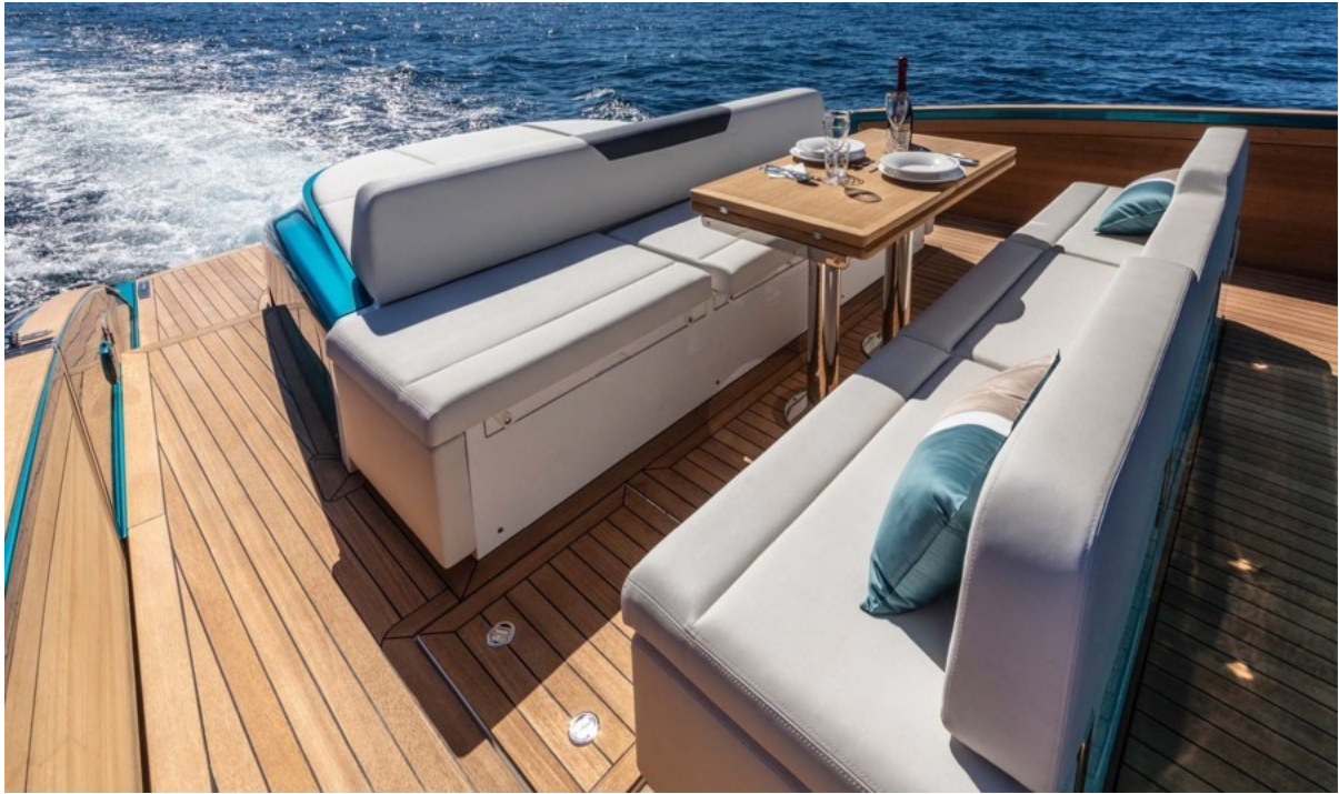
Deck Seating and Table