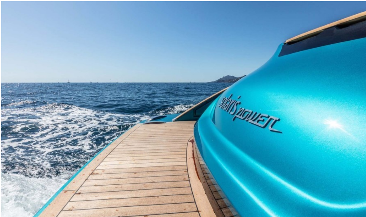
Swim Platform and Tender Garage