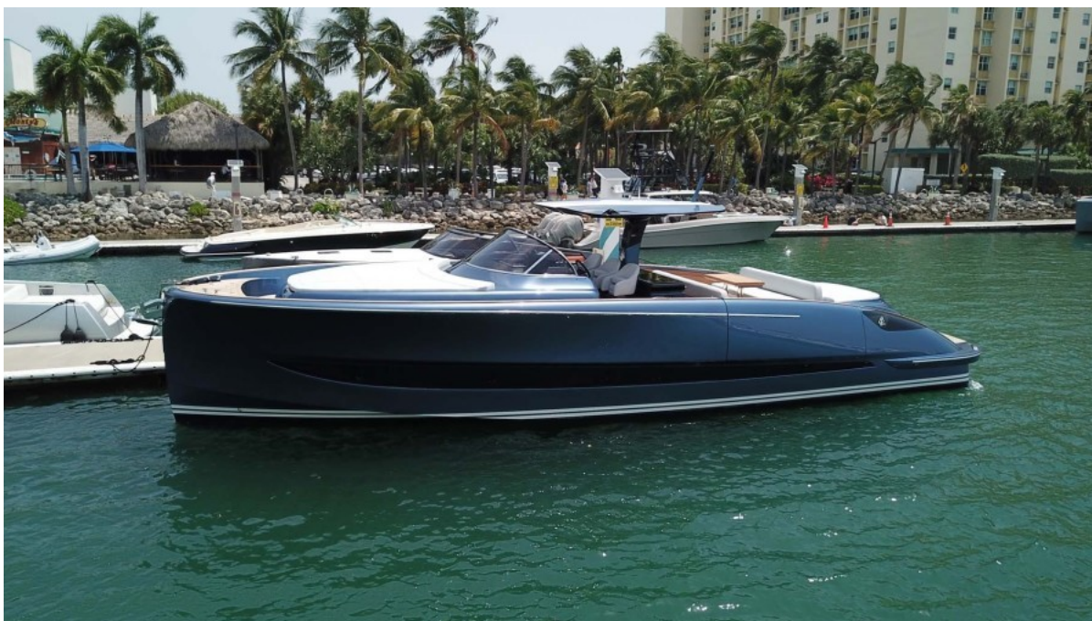
Portside at Dock