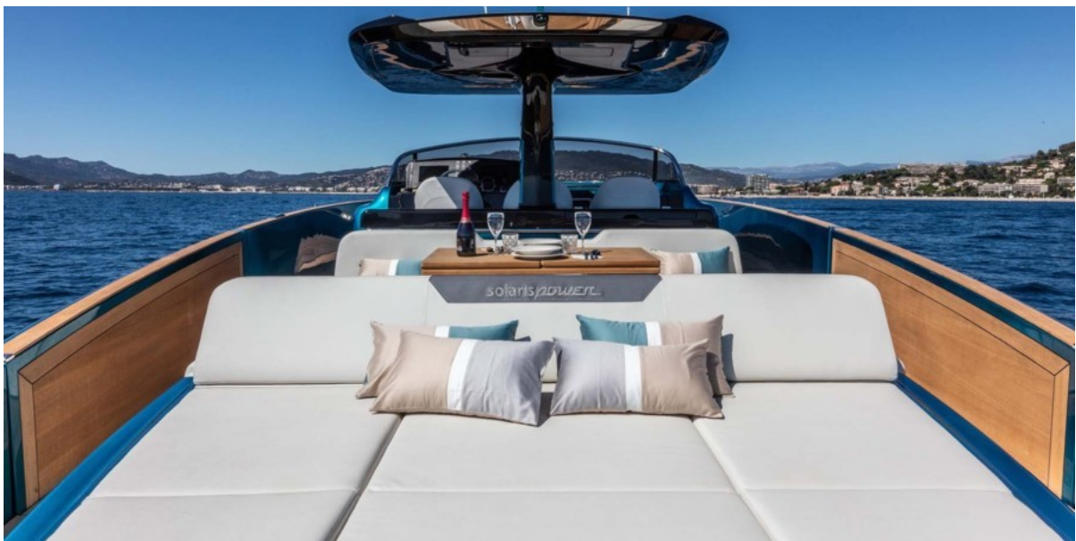
Stern Sunbathing Mattresses