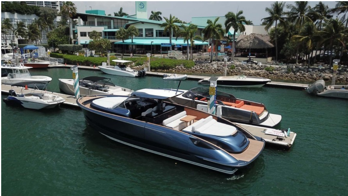
Port Aft View at Dock