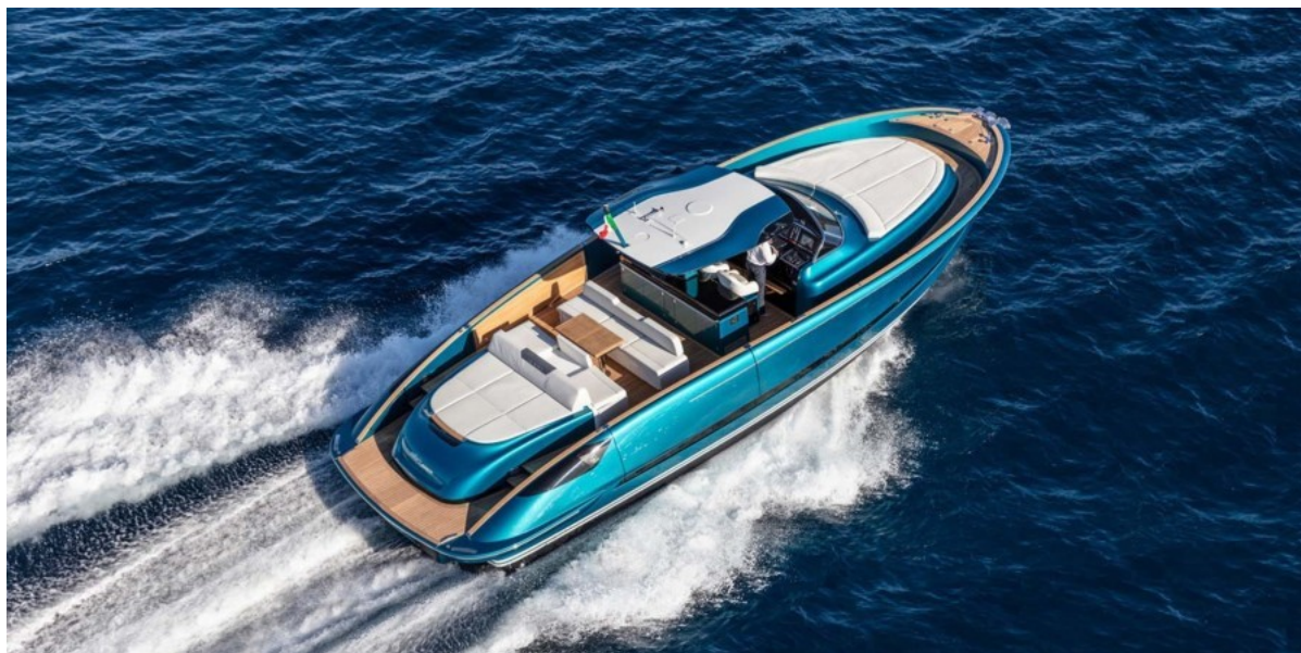
Starboard Aft Running