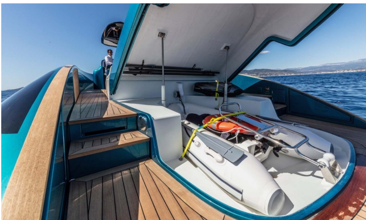
Tender in Garage