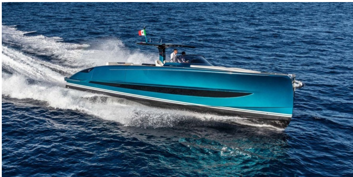
Starboard Profile Running