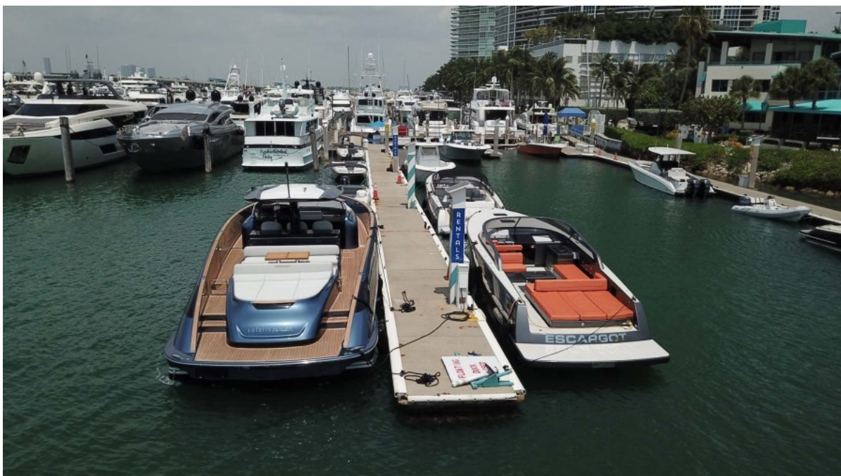
Stern View at Dock