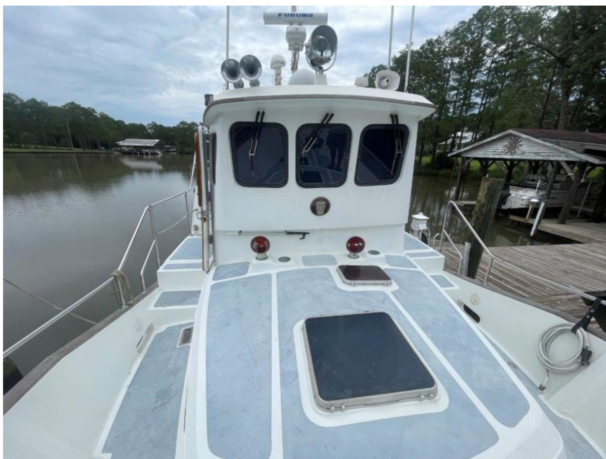
Pilothouse And Foredeck