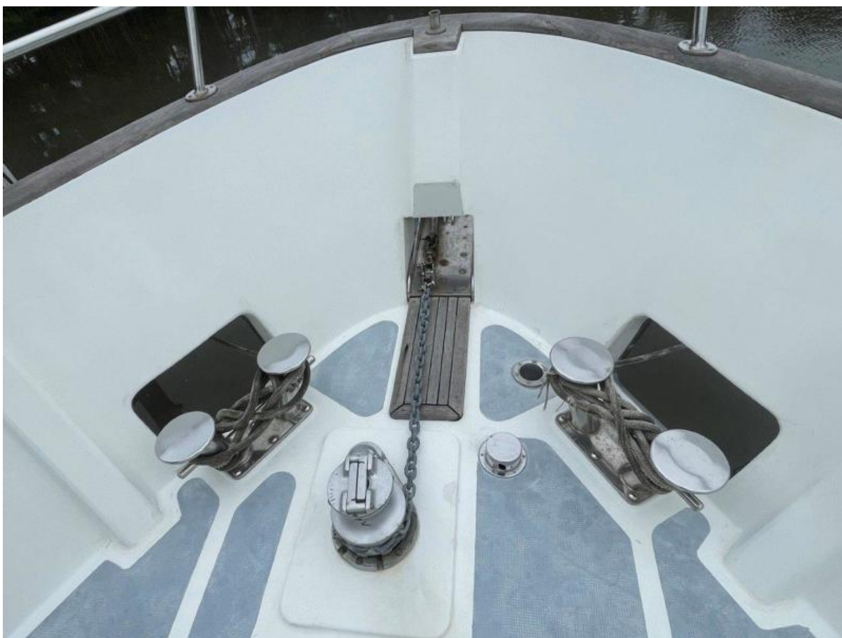
Windlass And Bow Area