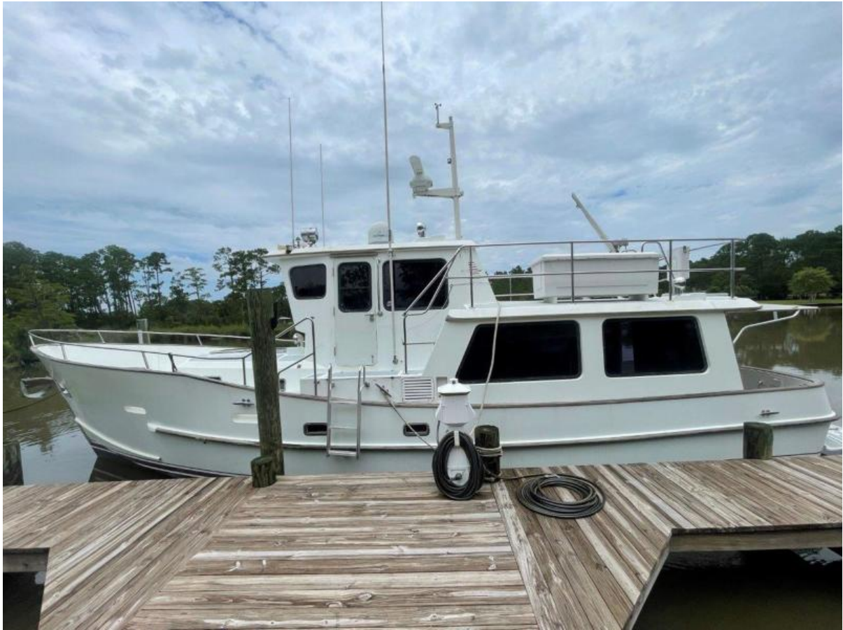
Profile At Dock