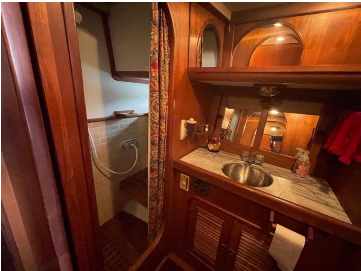
Guest Head With Shower Stall