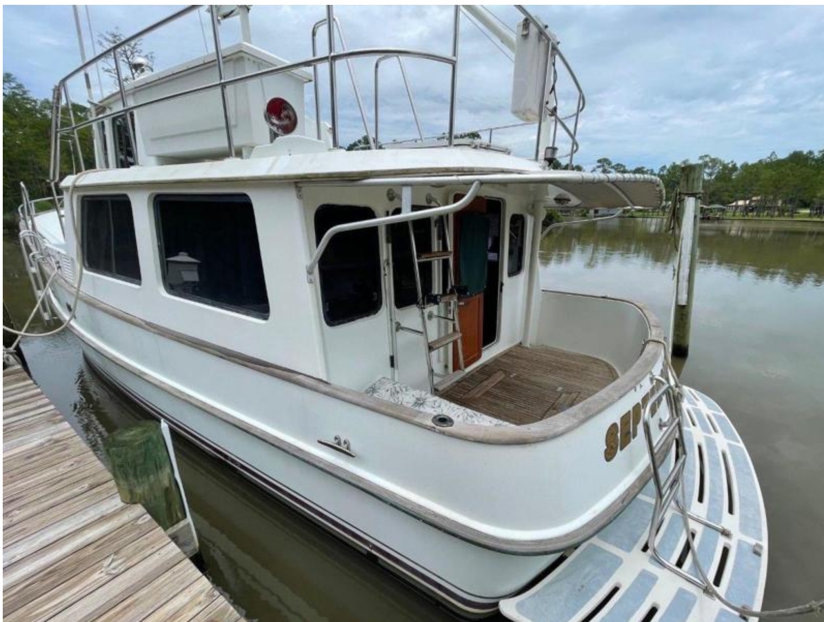
Aft Deck And Port Side