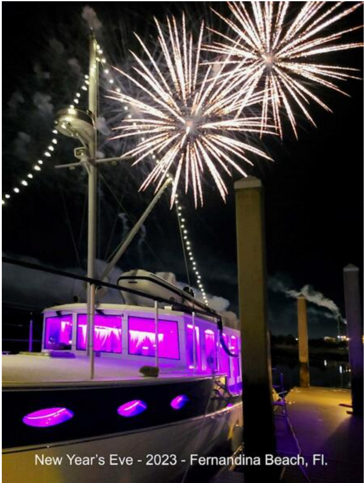
New Year's Eve - 2023 - Fernandina Beach, Fl.