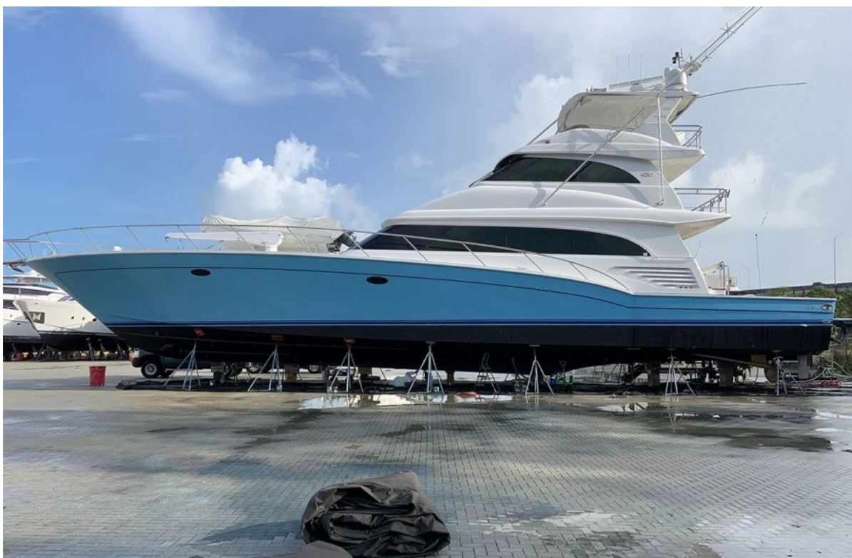
Bottom Job, Detail & Wax, New Blue Stripe Added - June 2021