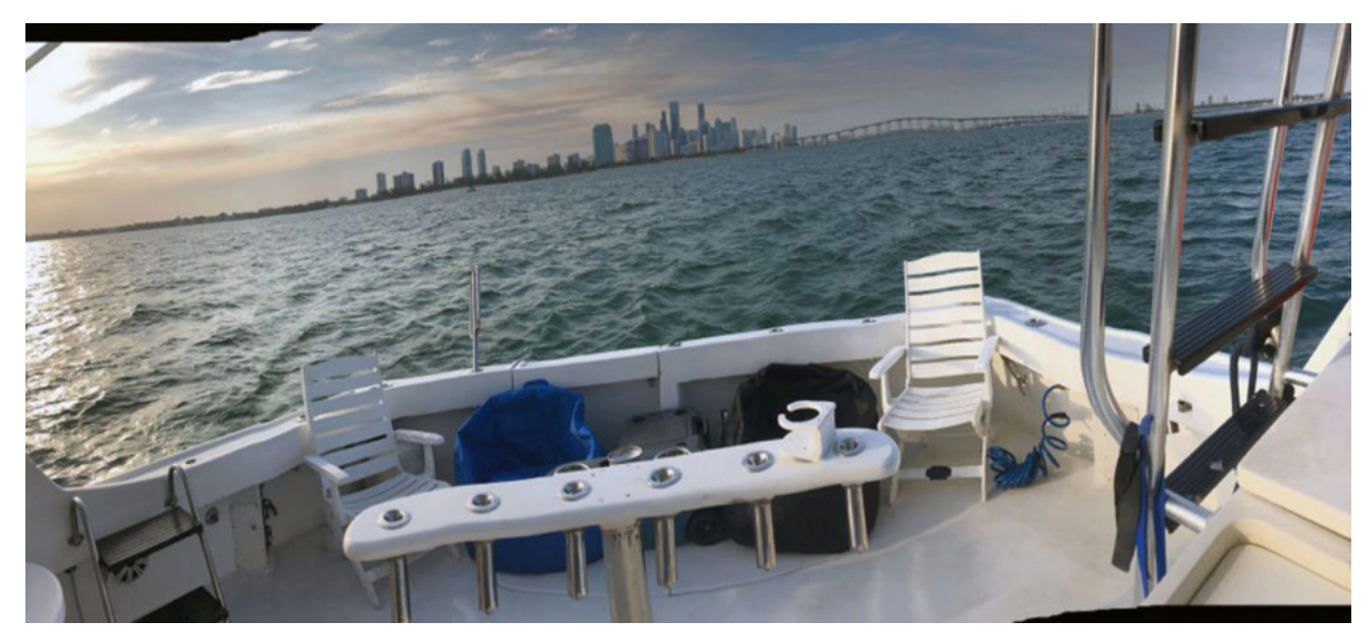
Cockpit To Aft