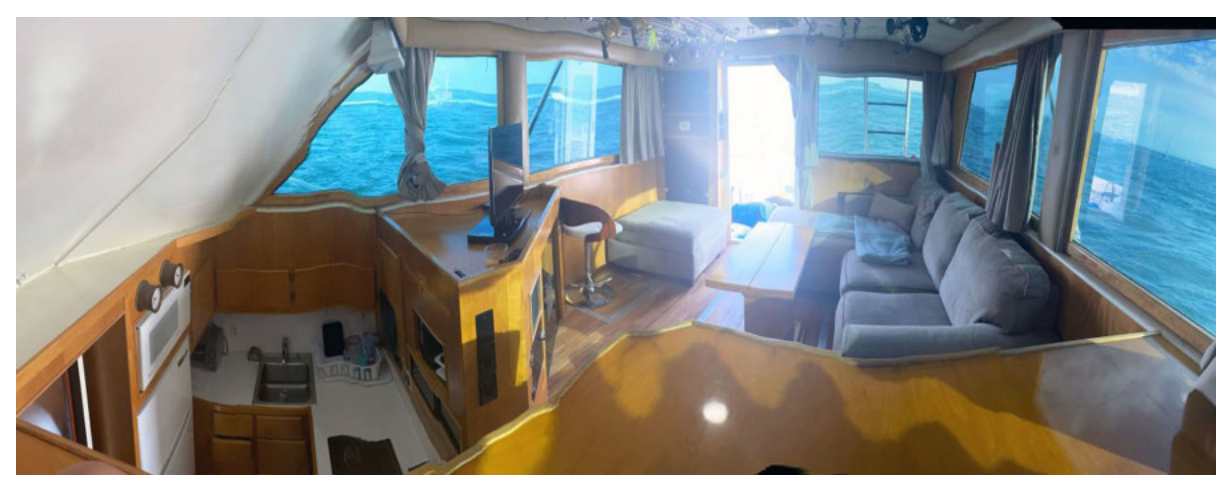
Galley Down, Salon Aft