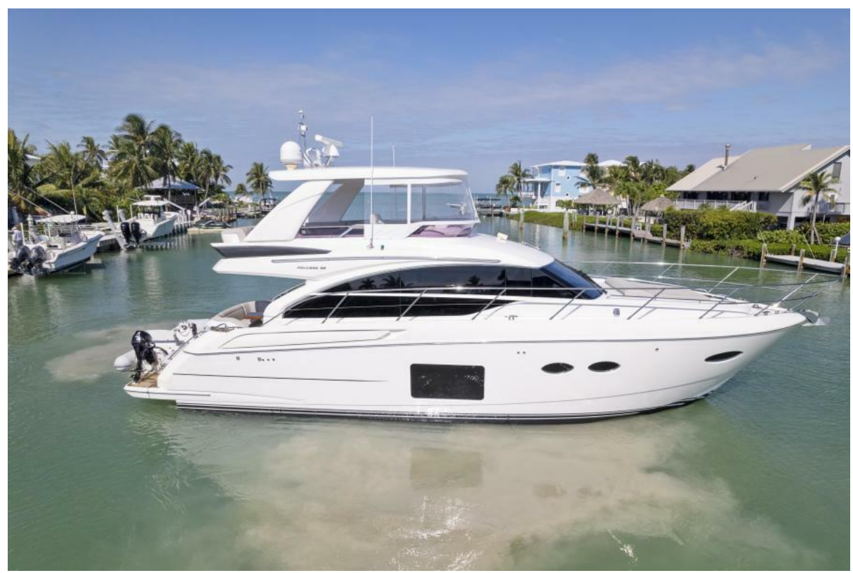
2016 Princess 52 Flybridge - Defiance