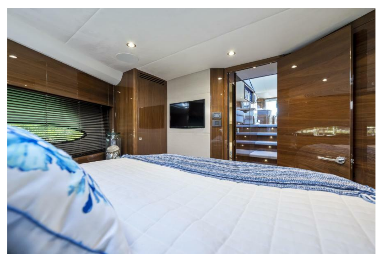
2016 Princess 52 Flybridge - Defiance