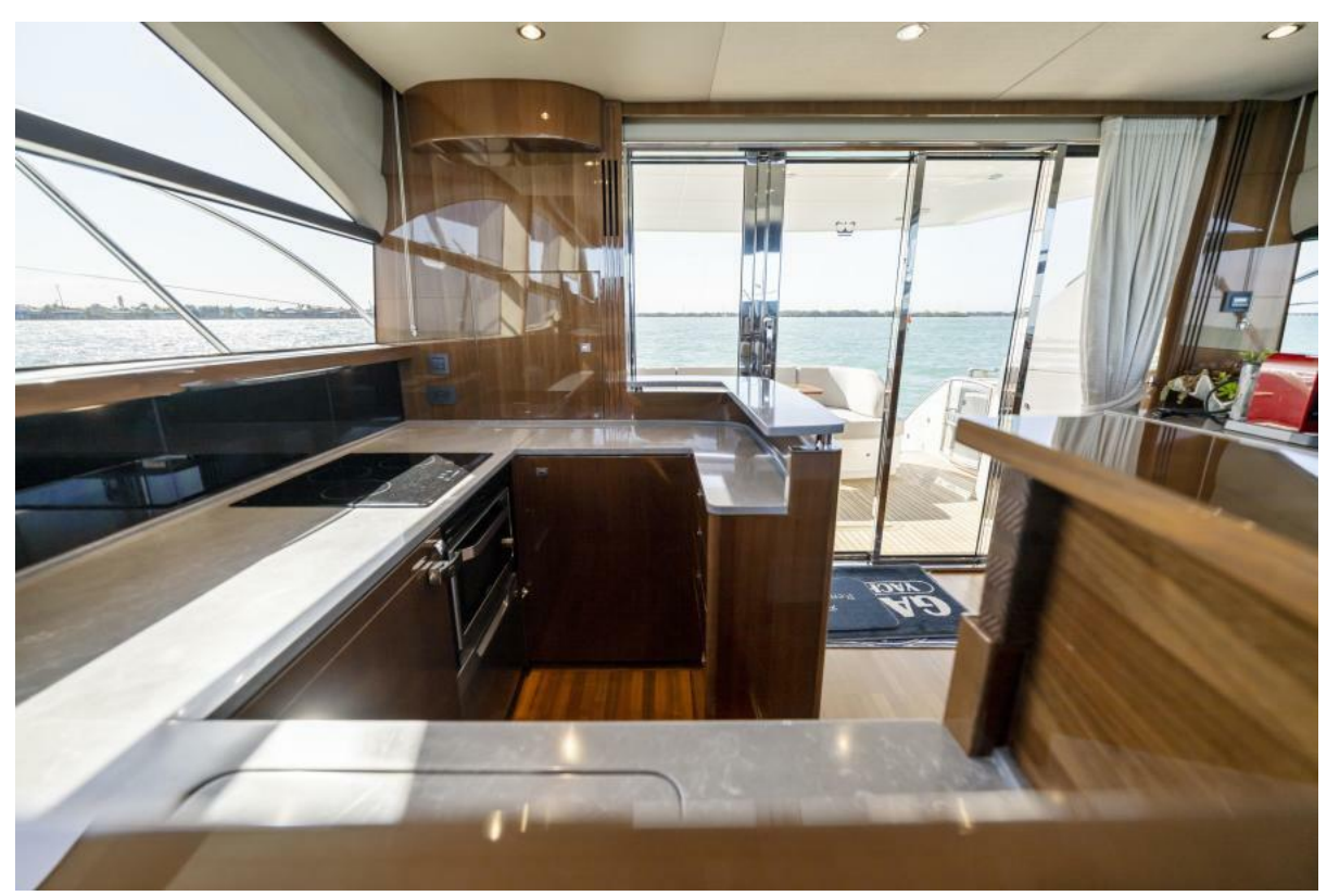
2016 Princess 52 Flybridge - Defiance