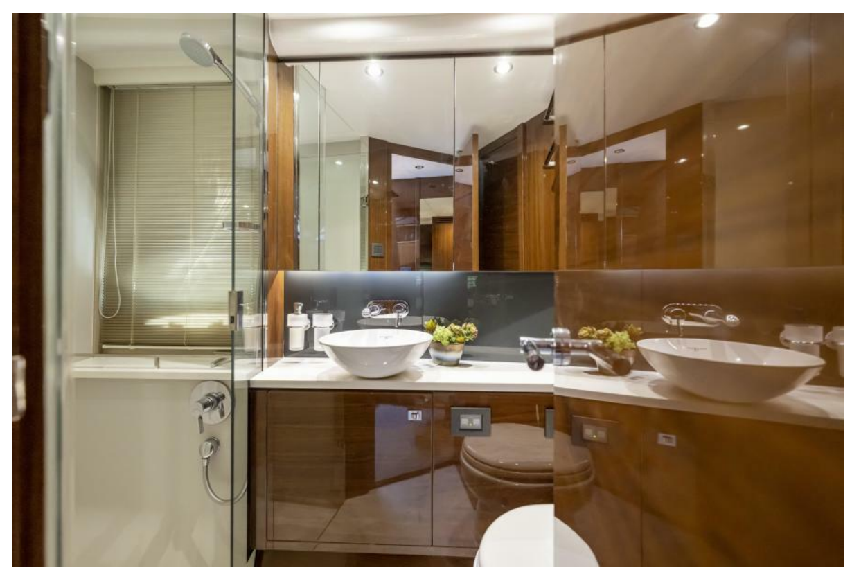
2016 Princess 52 Flybridge - Defiance