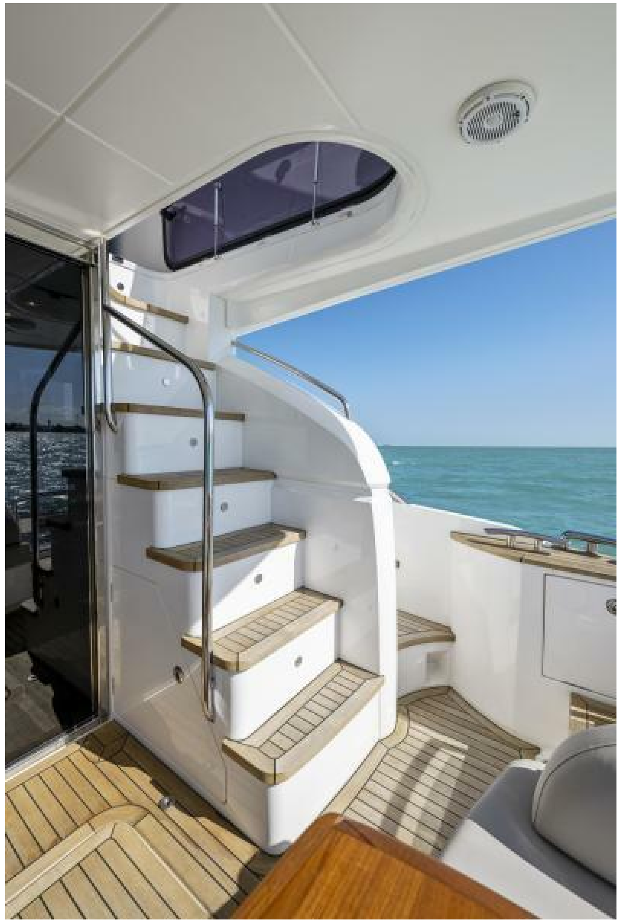
2016 Princess 52 Flybridge - Defiance