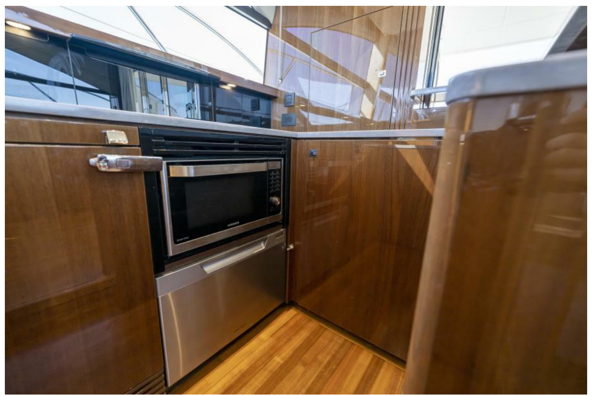
2016 Princess 52 Flybridge - Defiance