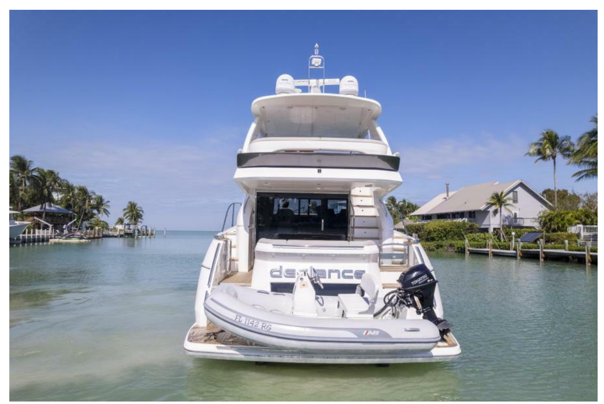
2016 Princess 52 Flybridge - Defiance