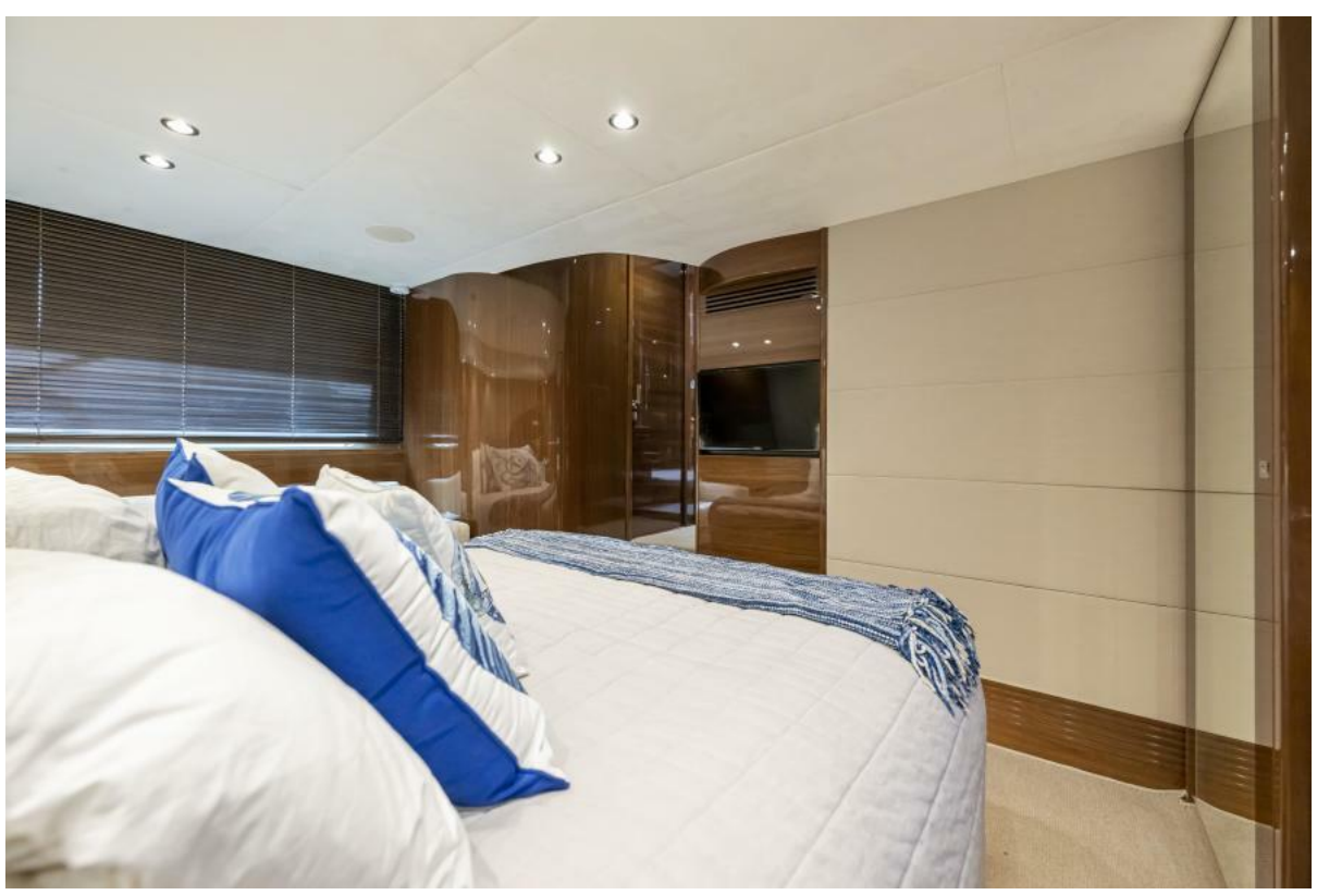
2016 Princess 52 Flybridge - Defiance