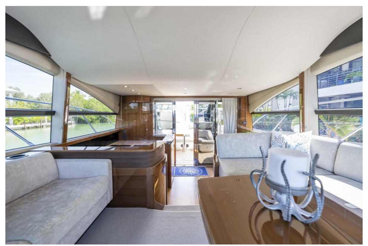
2016 Princess 52 Flybridge - Defiance