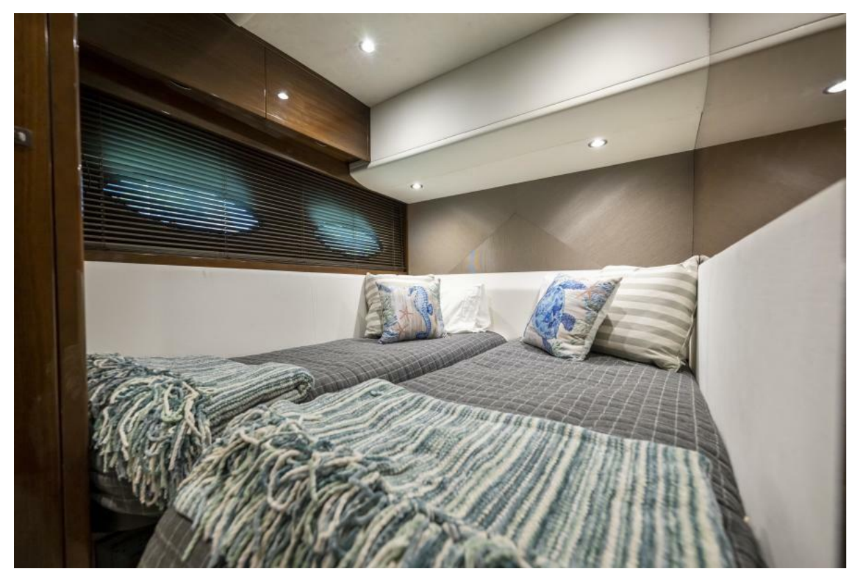
2016 Princess 52 Flybridge - Defiance