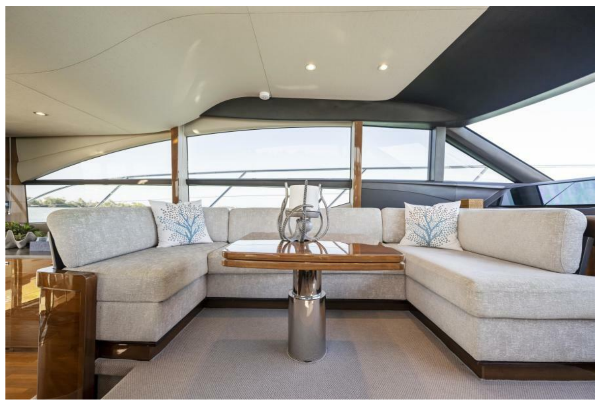
2016 Princess 52 Flybridge - Defiance