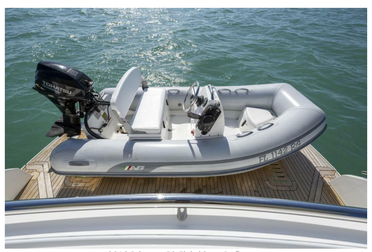
2016 Princess 52 Flybridge - Defiance