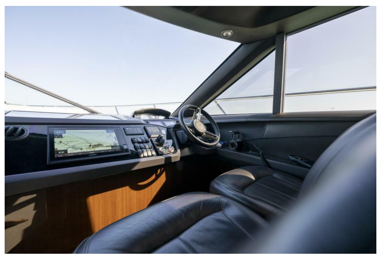
2016 Princess 52 Flybridge - Defiance