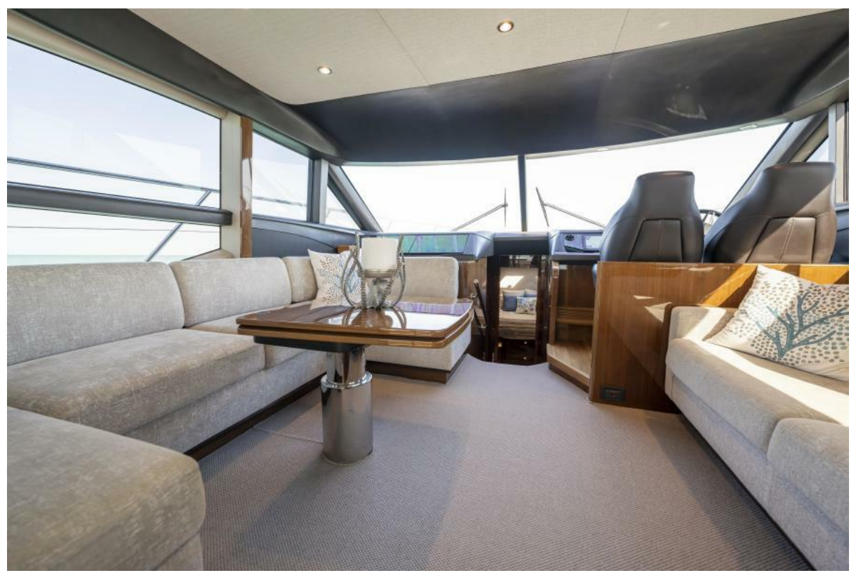
2016 Princess 52 Flybridge - Defiance