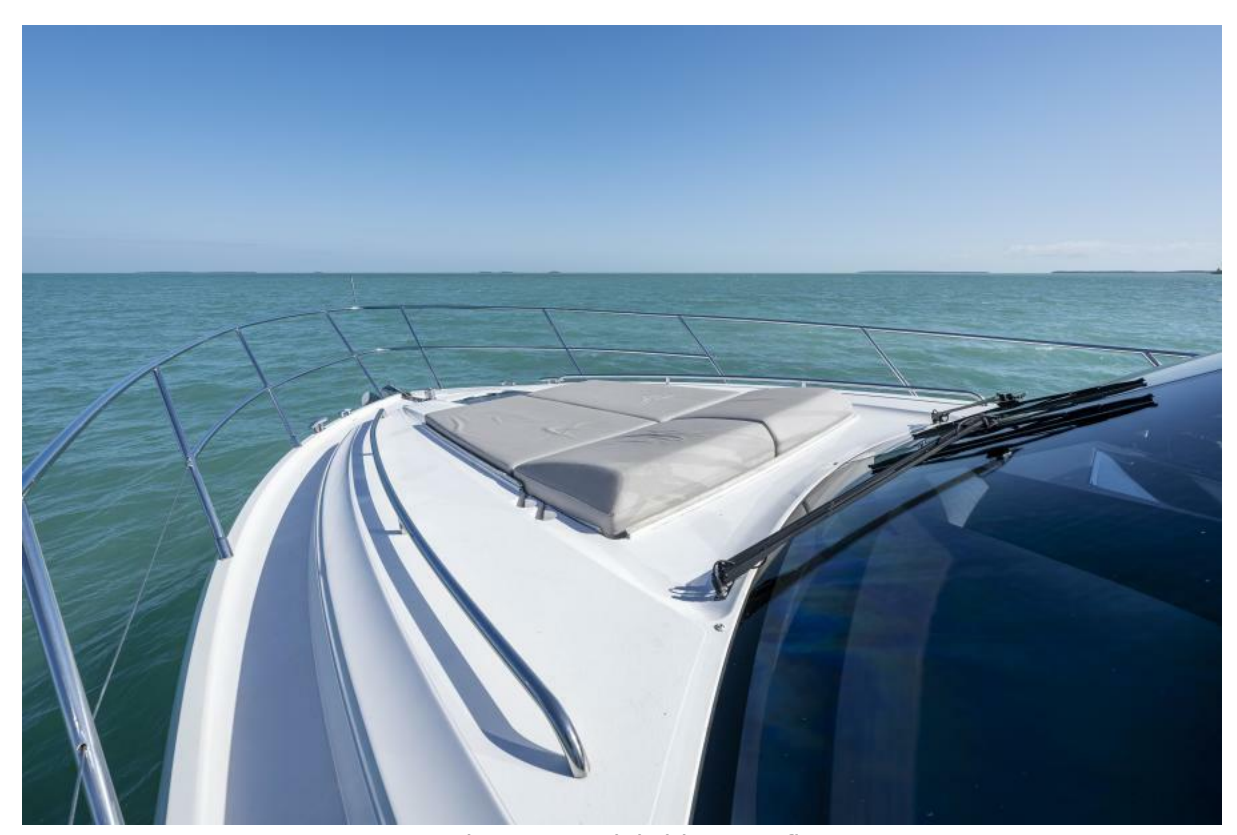
2016 Princess 52 Flybridge - Defiance