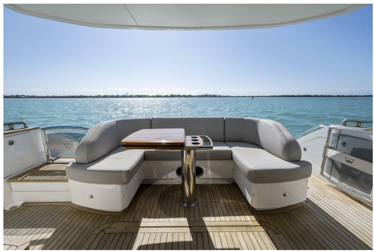
2016 Princess 52 Flybridge - Defiance