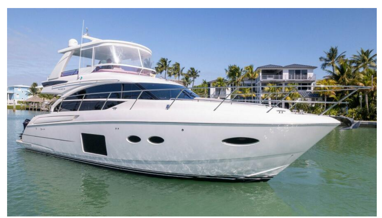
2016 Princess 52 Flybridge - Defiance