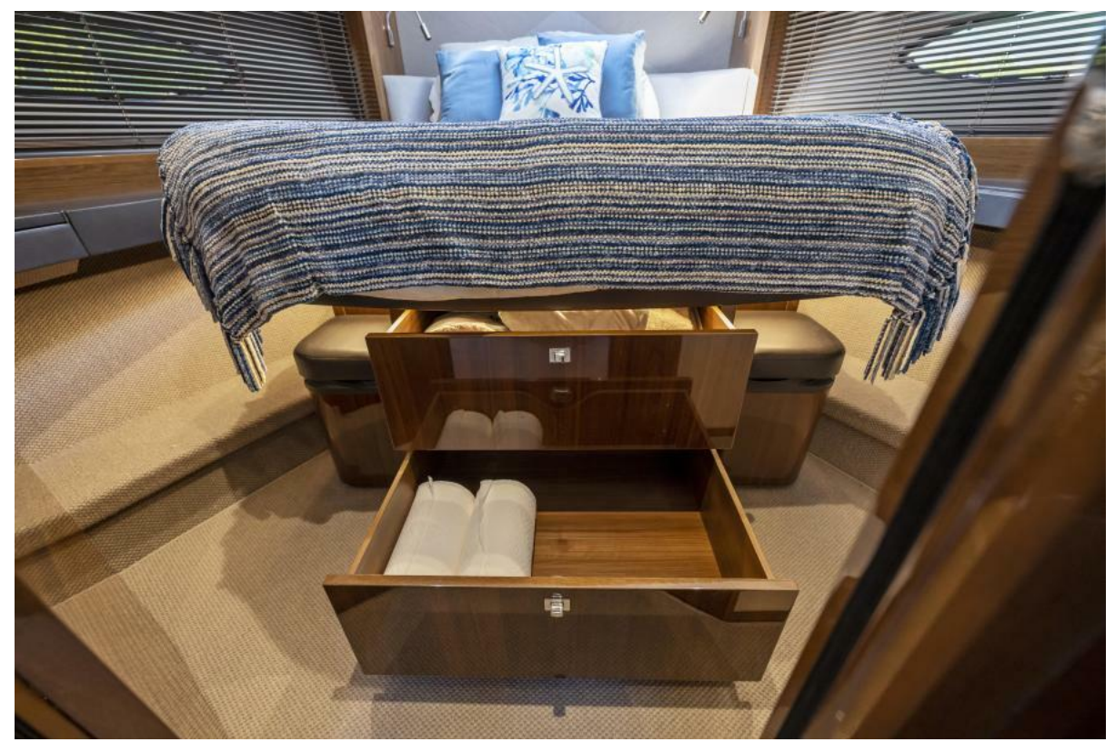
2016 Princess 52 Flybridge - Defiance