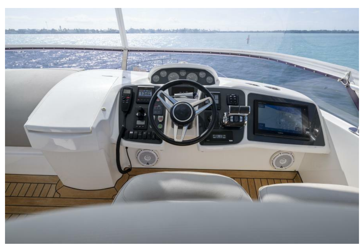
2016 Princess 52 Flybridge - Defiance