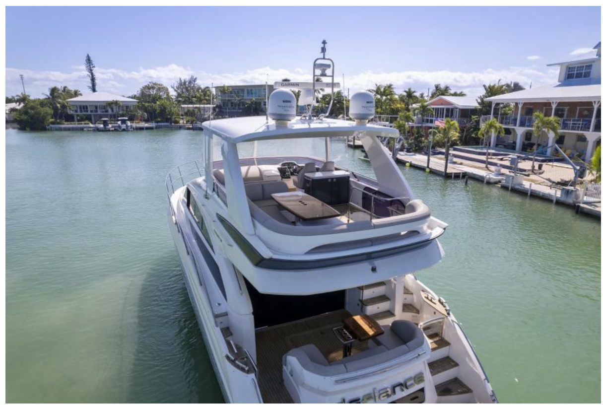
2016 Princess 52 Flybridge - Defiance