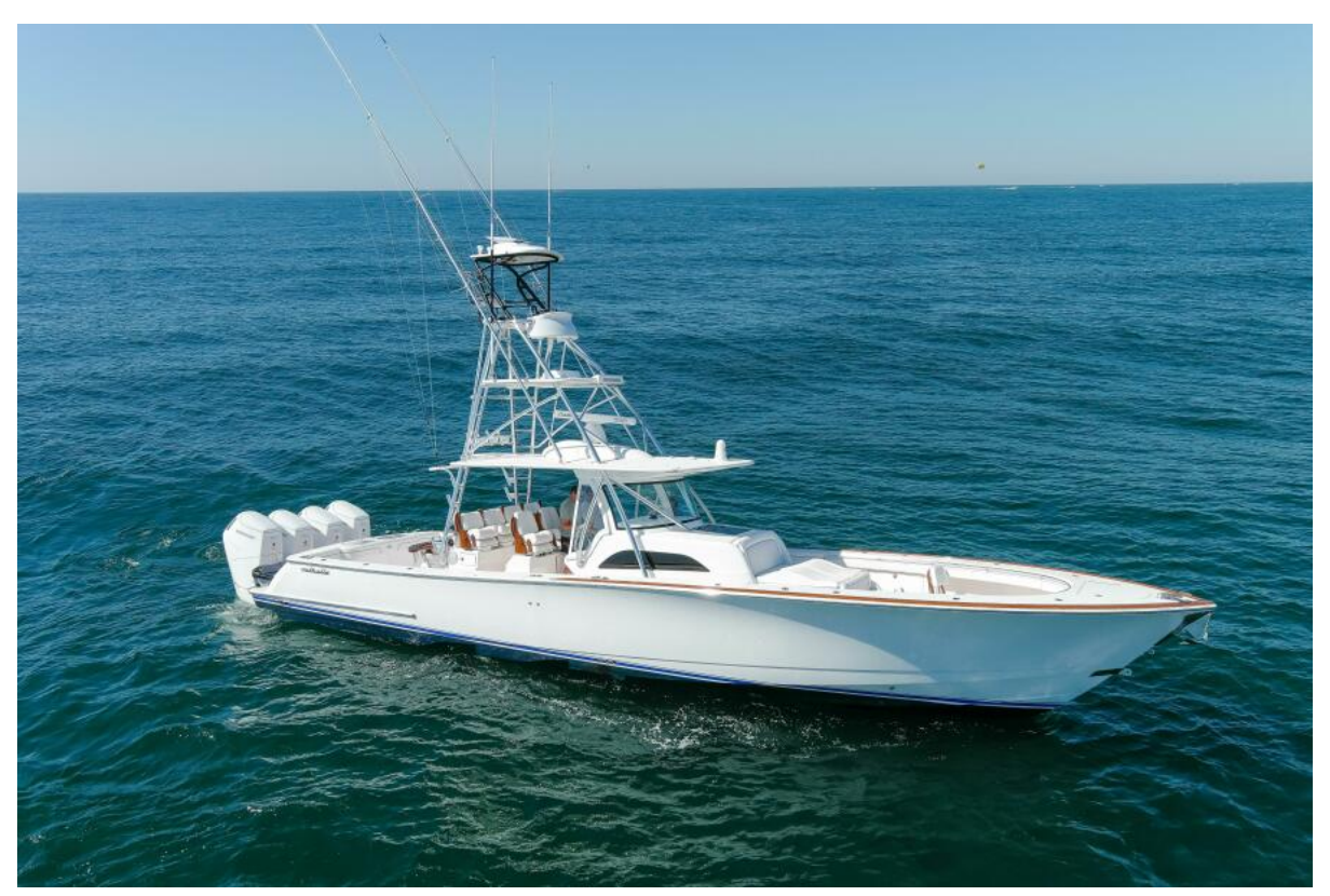
2024 Valhalla V46- SNAFU- STBD Profile