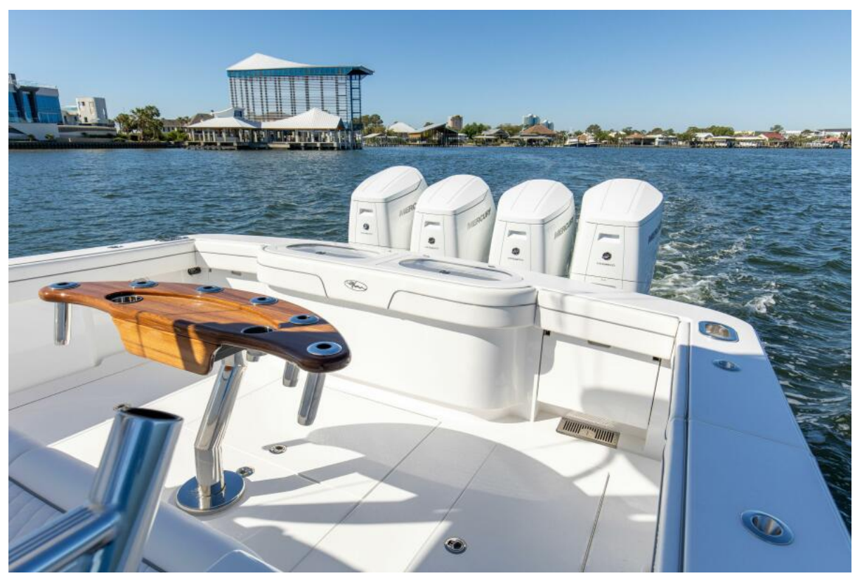
2024 Valhalla V46- SNAFU- Cockpit