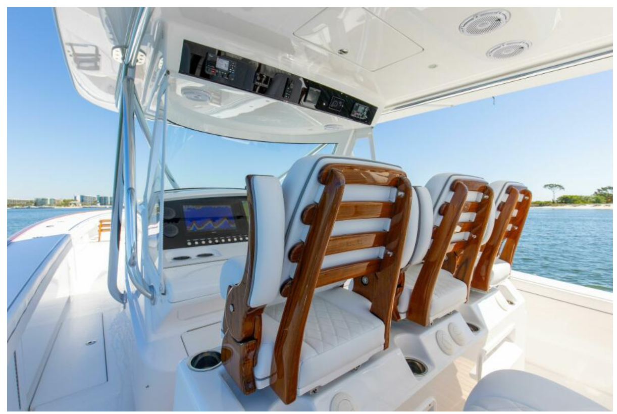
2024 Valhalla V46- SNAFU- Helm