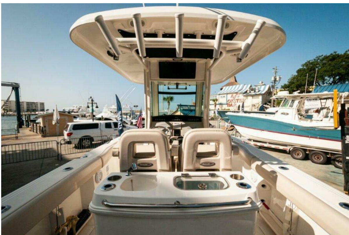
2018 Boston Whaler 280 Outrage Console 2