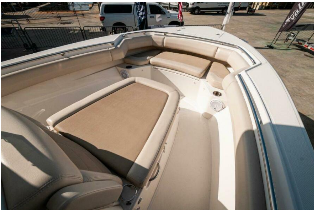
2018 Boston Whaler 280 Outrage Bow