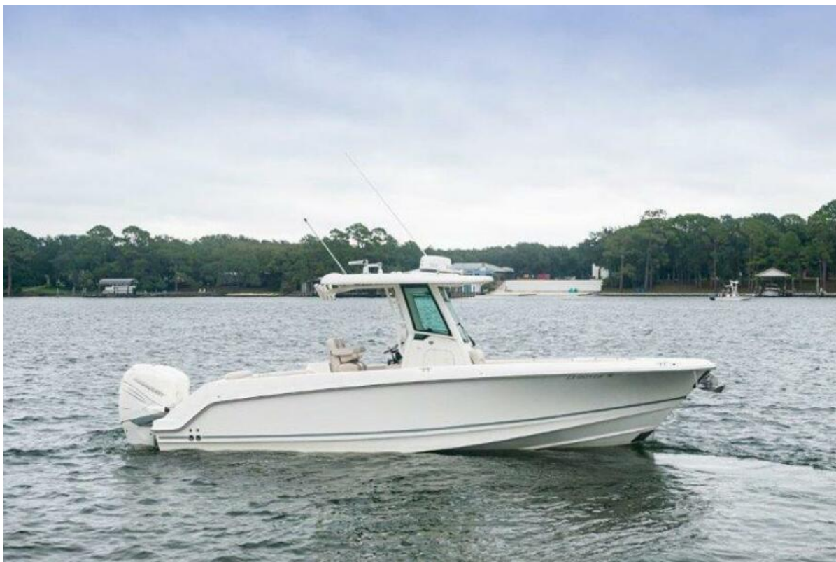
2018 Boston Whaler 280 Outrage STBD Profile 1