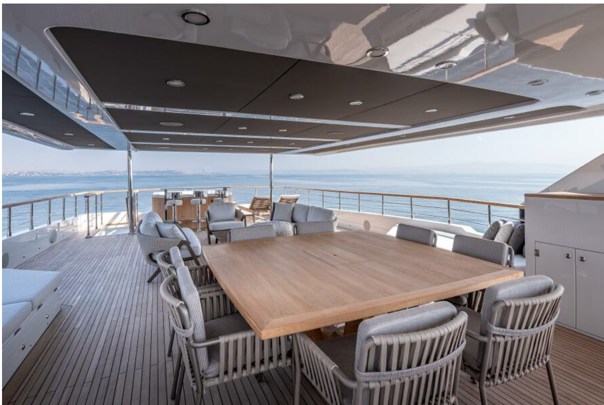
2023 Numarine 37XP ROCKIT Flybridge Deck Dining