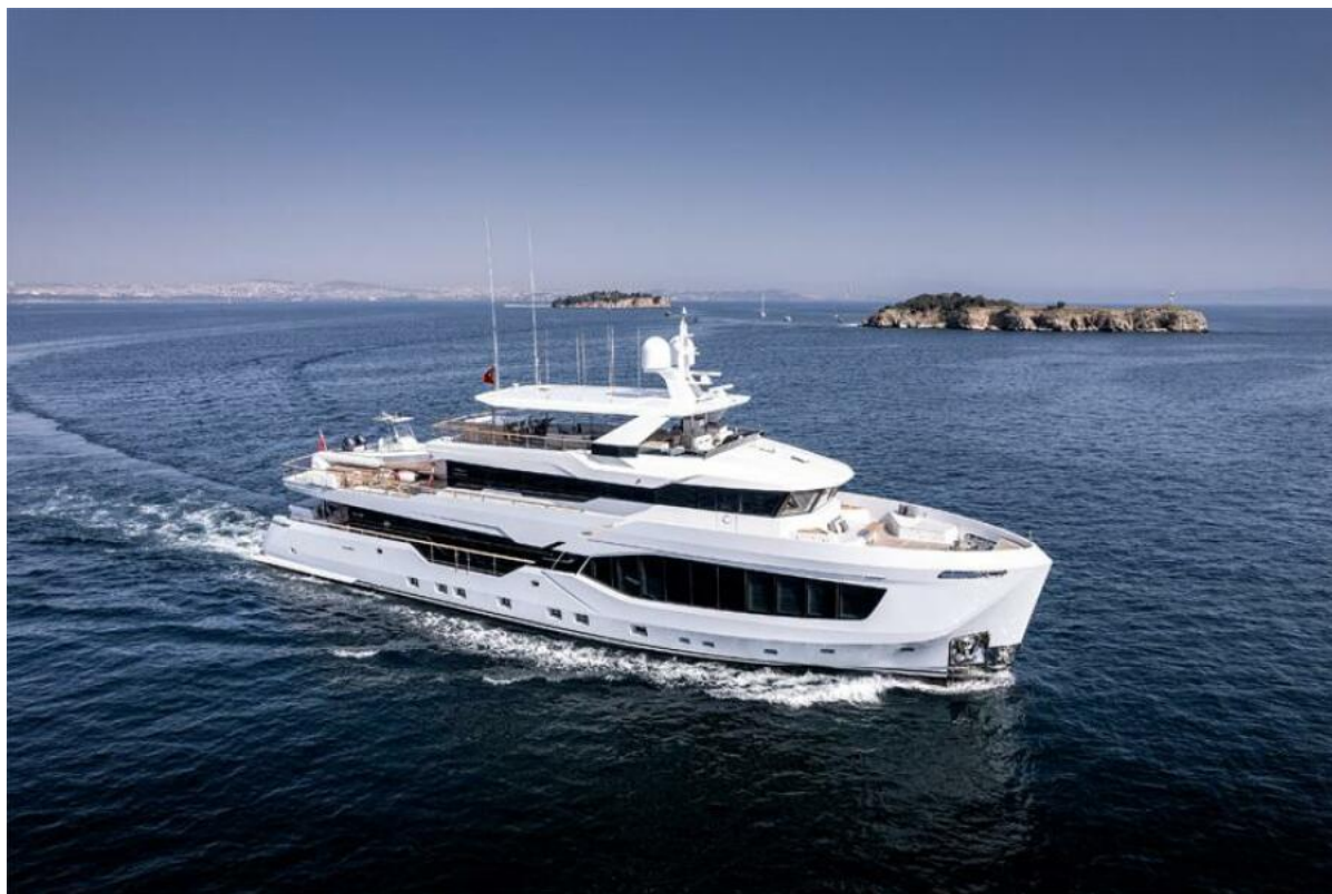
2023 Numarine 37XP 08 ROCKIT STBD Profile