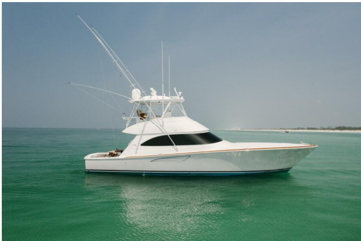
2017 52 Viking CNV Gas Money Main Profile