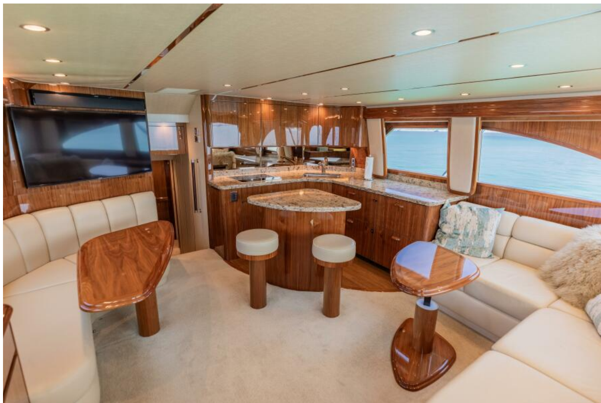
2017 52 Viking CNV Gas Money Galley And Salon (2)