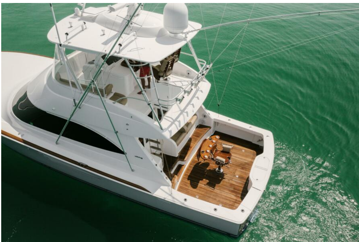
2017 52 Viking CNV Gas Money Cockpit (2)