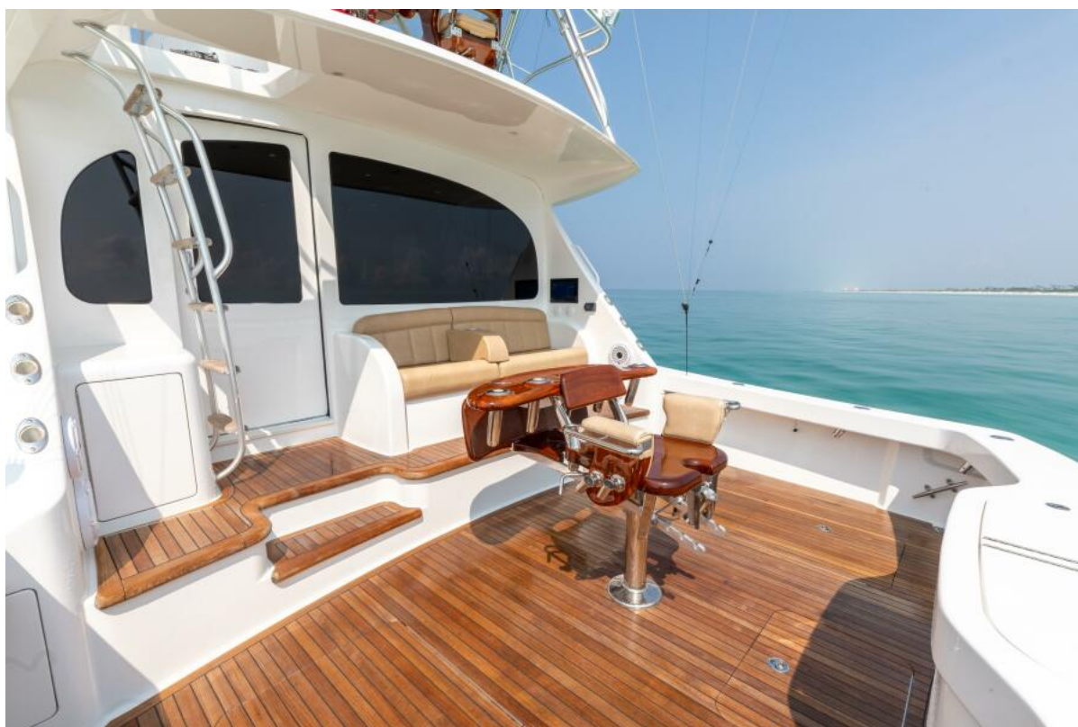
2017 52 Viking CNV Gas Money Cockpit (5)