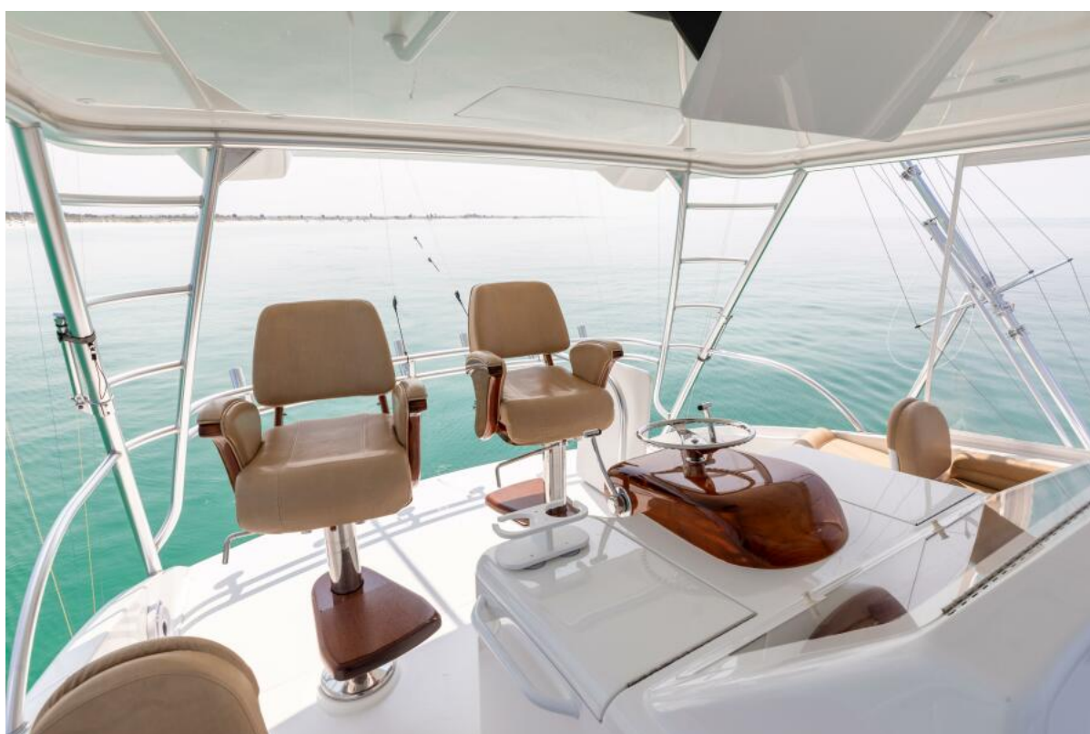
2017 52 Viking CNV Gas Money Flybridge (3)