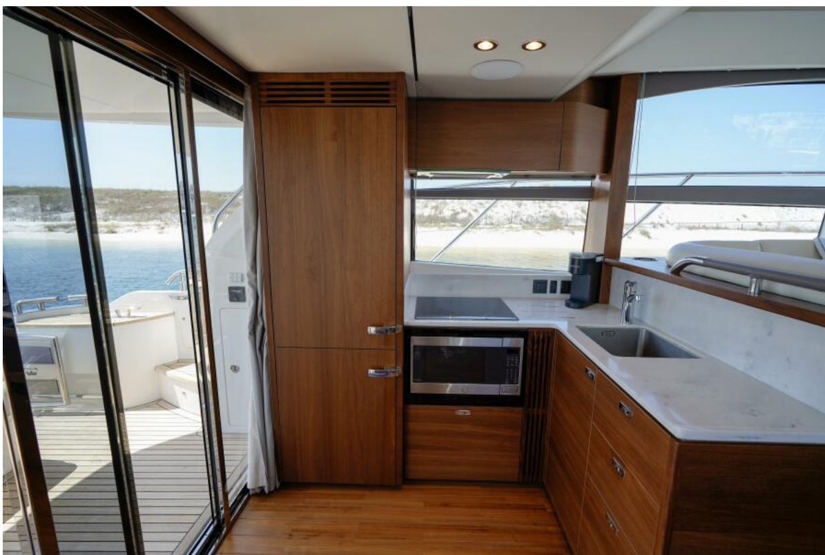
2021 Princess F50- MAKING TIME- Galley