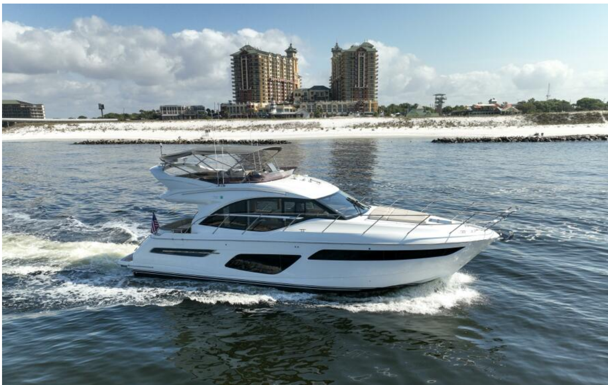
2021 Princess F50- MAKING TIME- STBD Profile