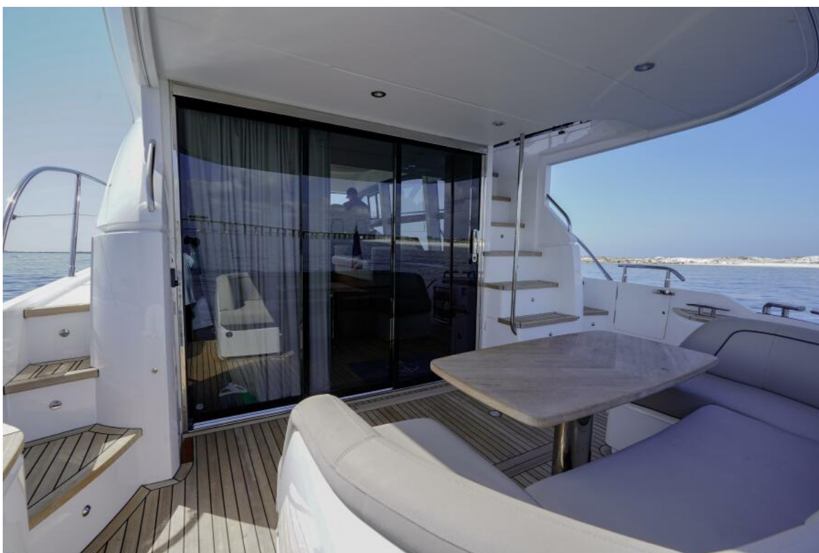
2021 Princess F50- MAKING TIME- Cockpit