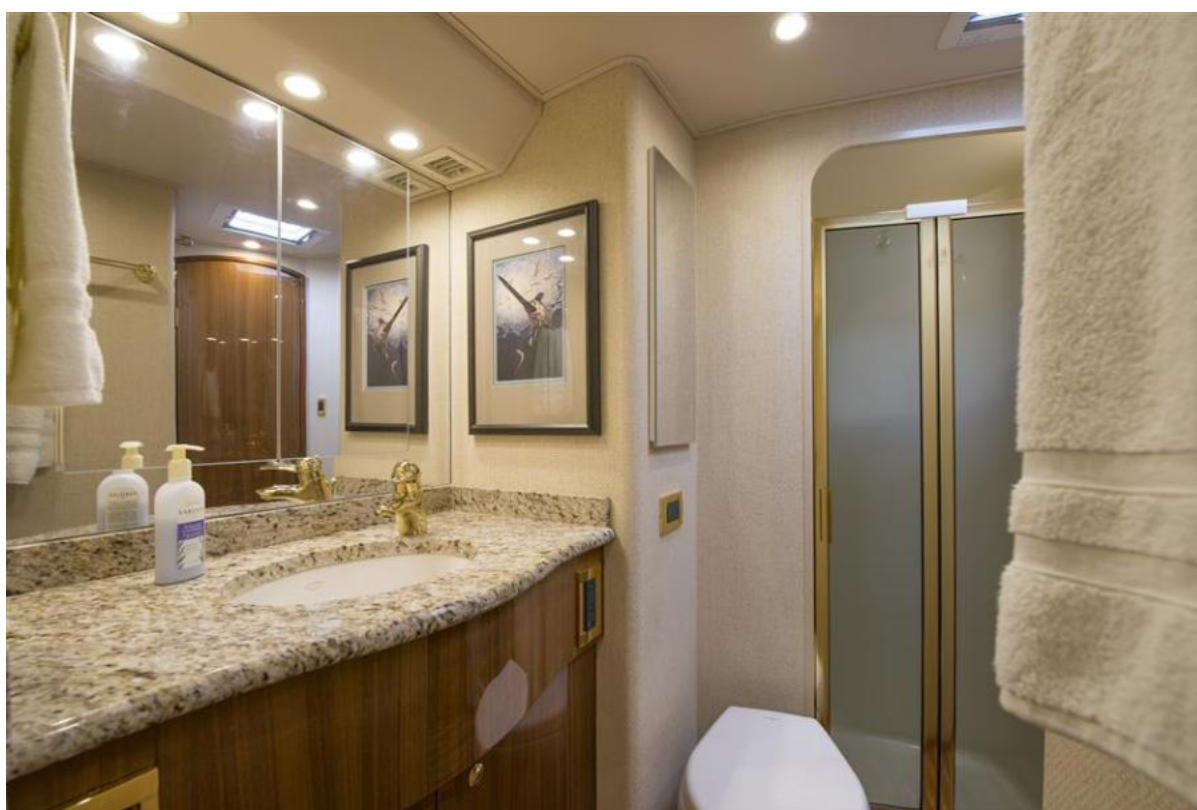
2008 Viking 52 Sport Coupe She's All Hooked Up