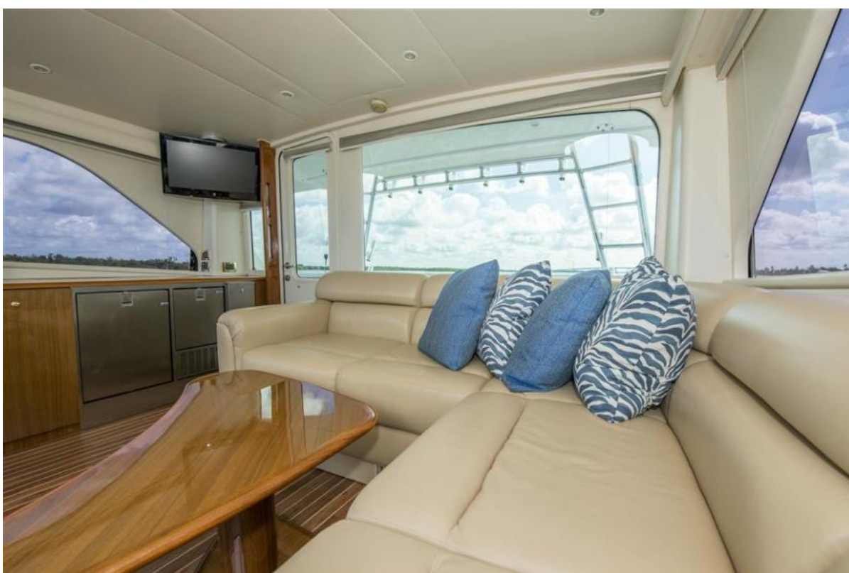
2008 Viking 52 Sport Coupe She's All Hooked Up