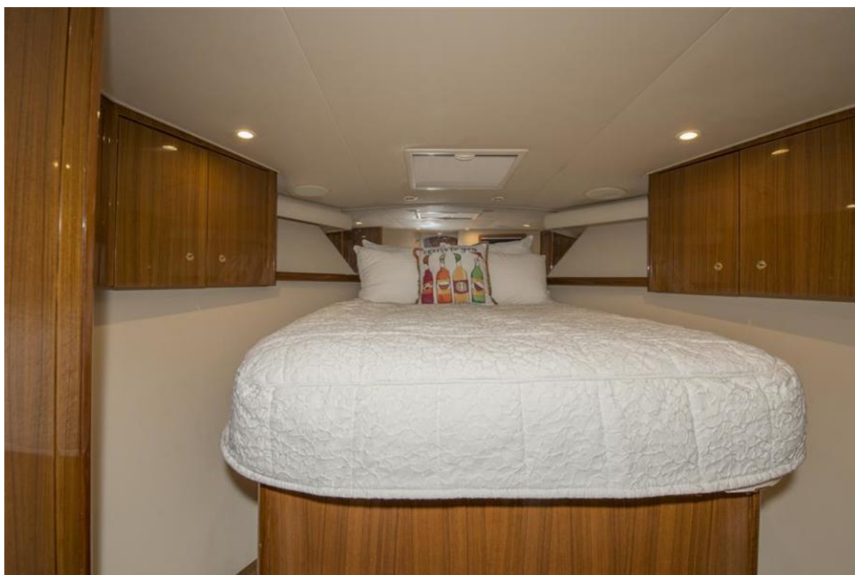
2008 Viking 52 Sport Coupe She's All Hooked Up