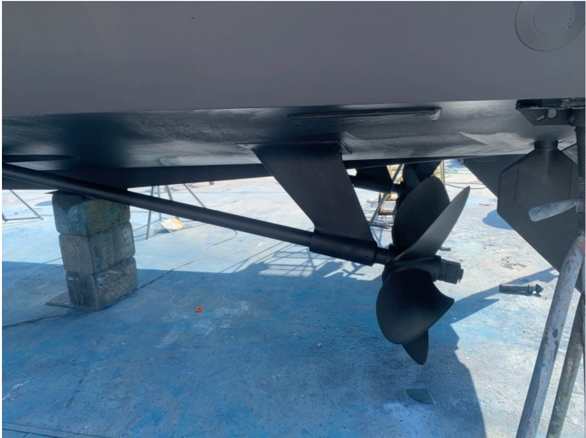
2008 Viking 52 Sport Coupe She's All Hooked Up