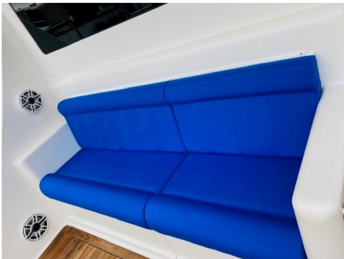
2008 Viking 52 Sport Coupe She's All Hooked Up