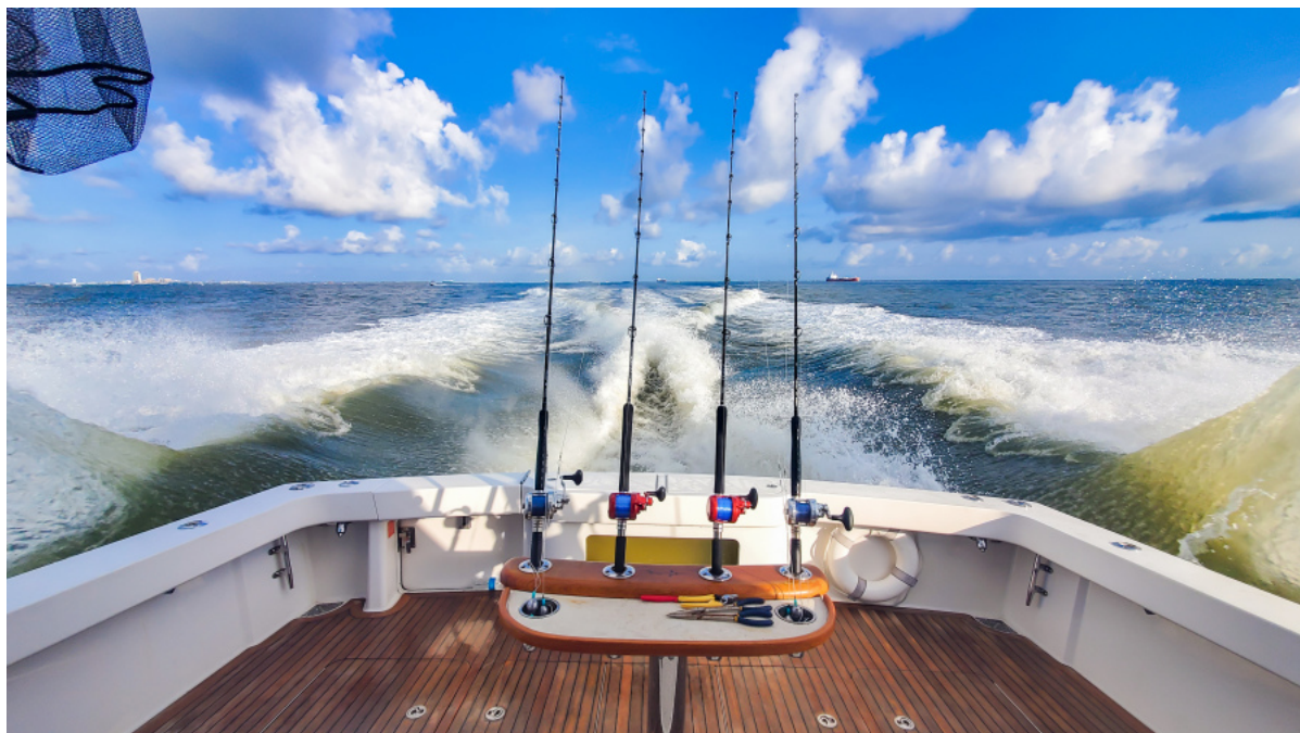
2008 Viking 52 Sport Coupe She's All Hooked Up