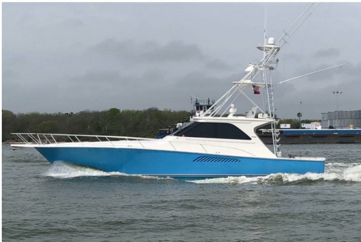
2008 Viking 52 Sport Coupe She's All Hooked Up