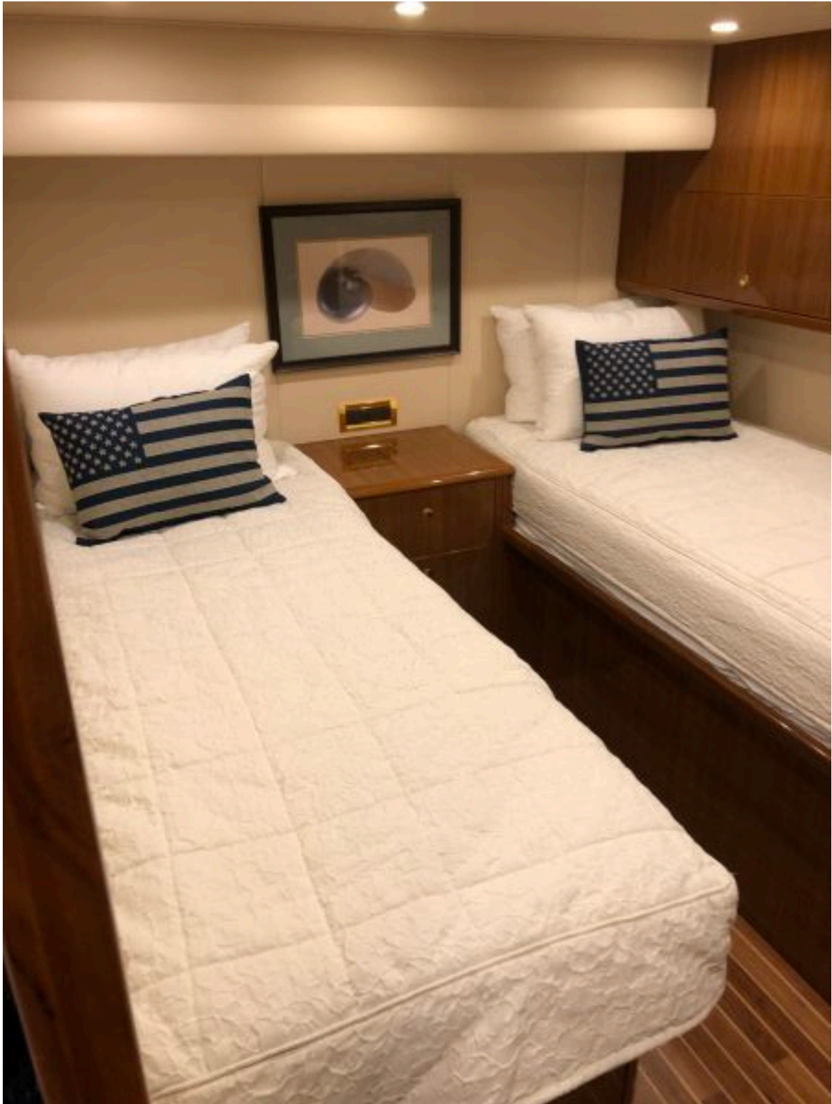
2008 Viking 52 Sport Coupe She's All Hooked Up