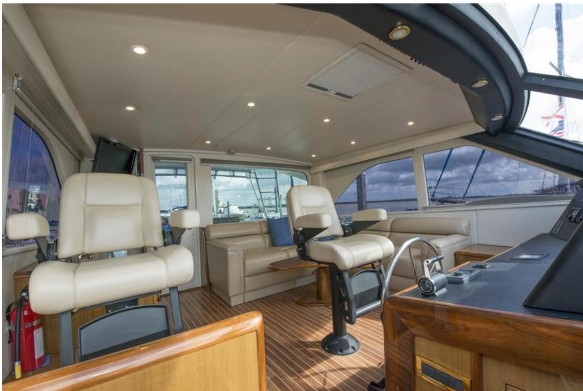
2008 Viking 52 Sport Coupe She's All Hooked Up