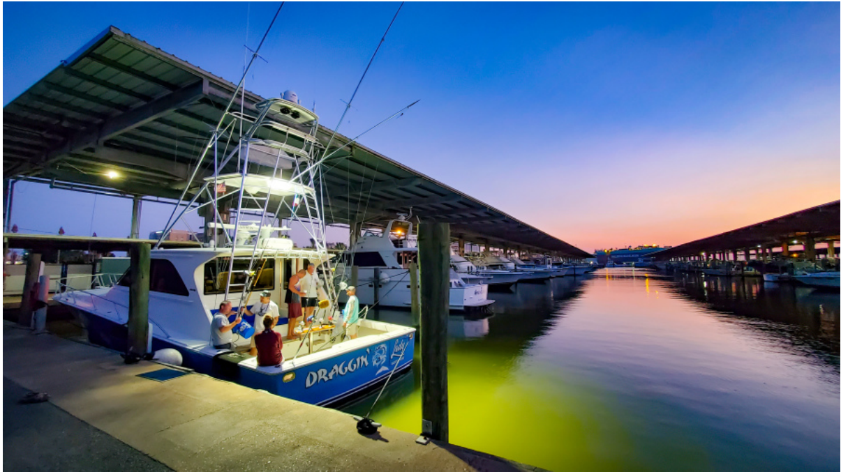
2008 Viking 52 Sport Coupe She's All Hooked Up