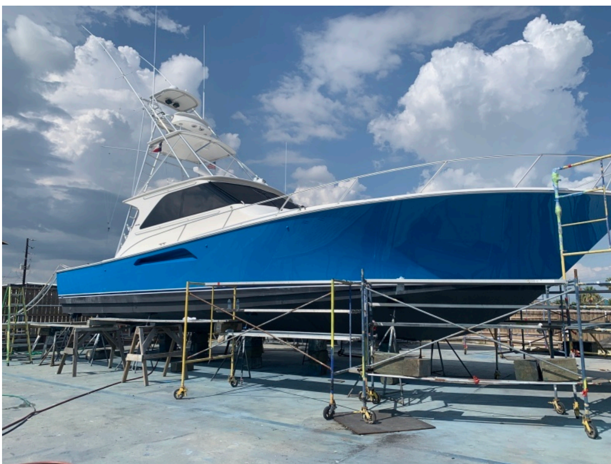
2008 Viking 52 Sport Coupe She's All Hooked Up