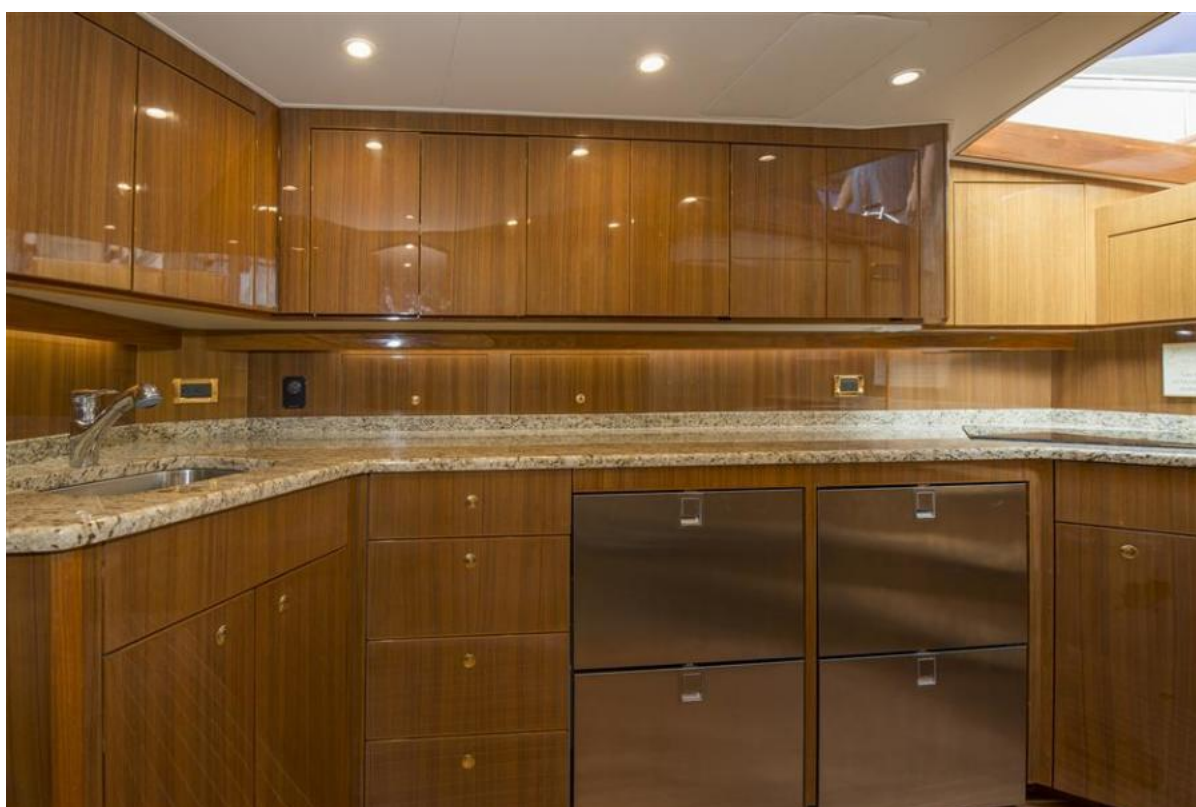
2008 Viking 52 Sport Coupe She's All Hooked Up