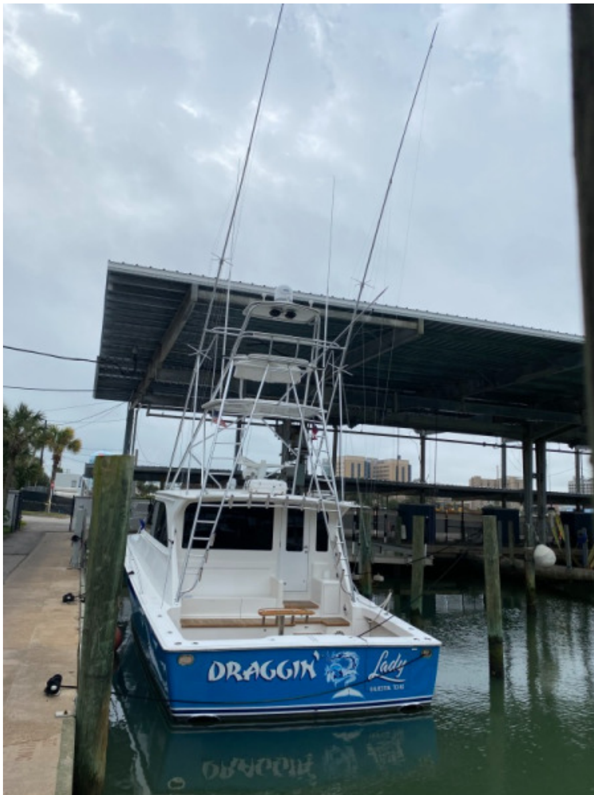
2008 Viking 52 Sport Coupe She's All Hooked Up