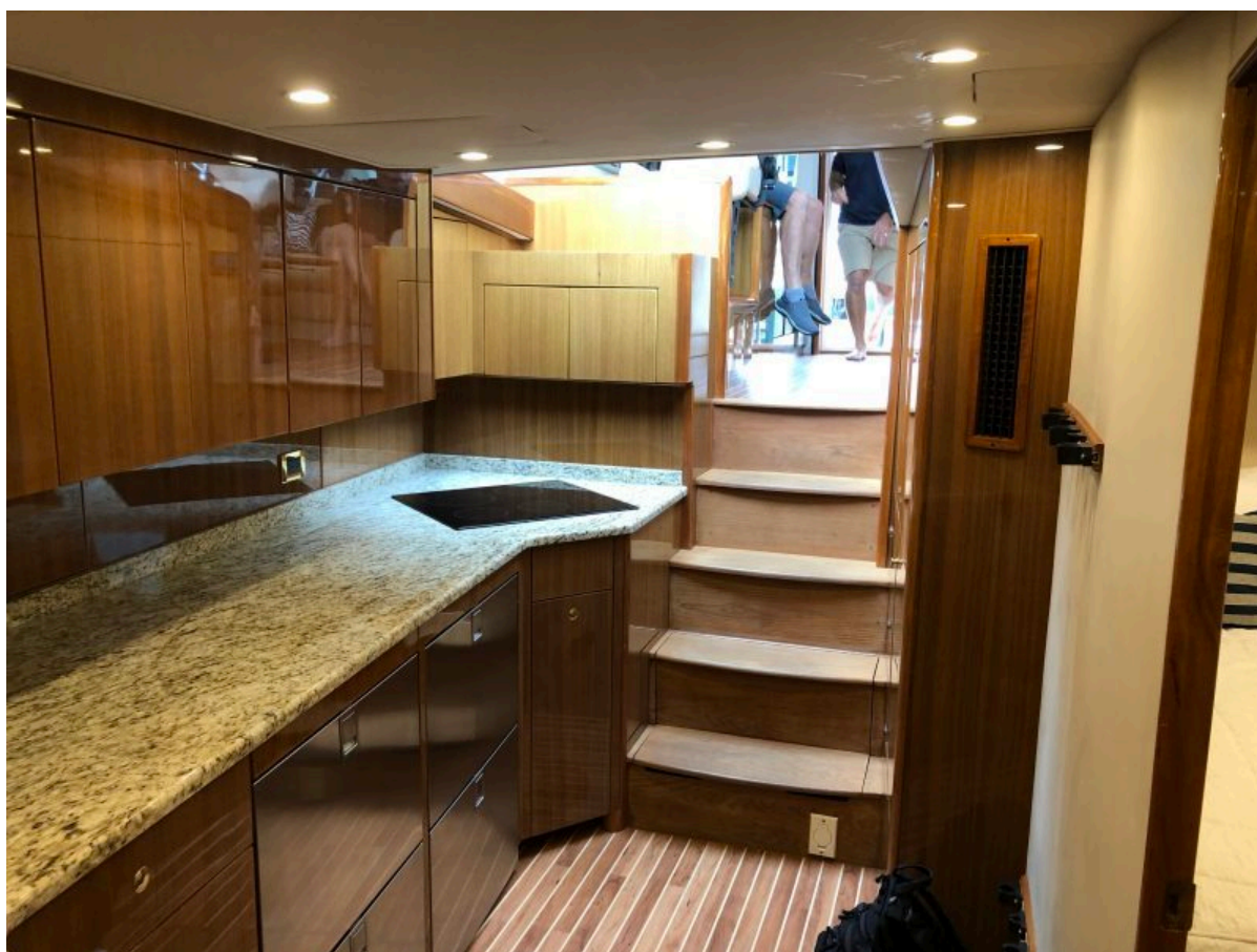
2008 Viking 52 Sport Coupe She's All Hooked Up