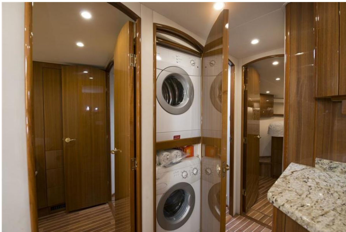
2008 Viking 52 Sport Coupe She's All Hooked Up