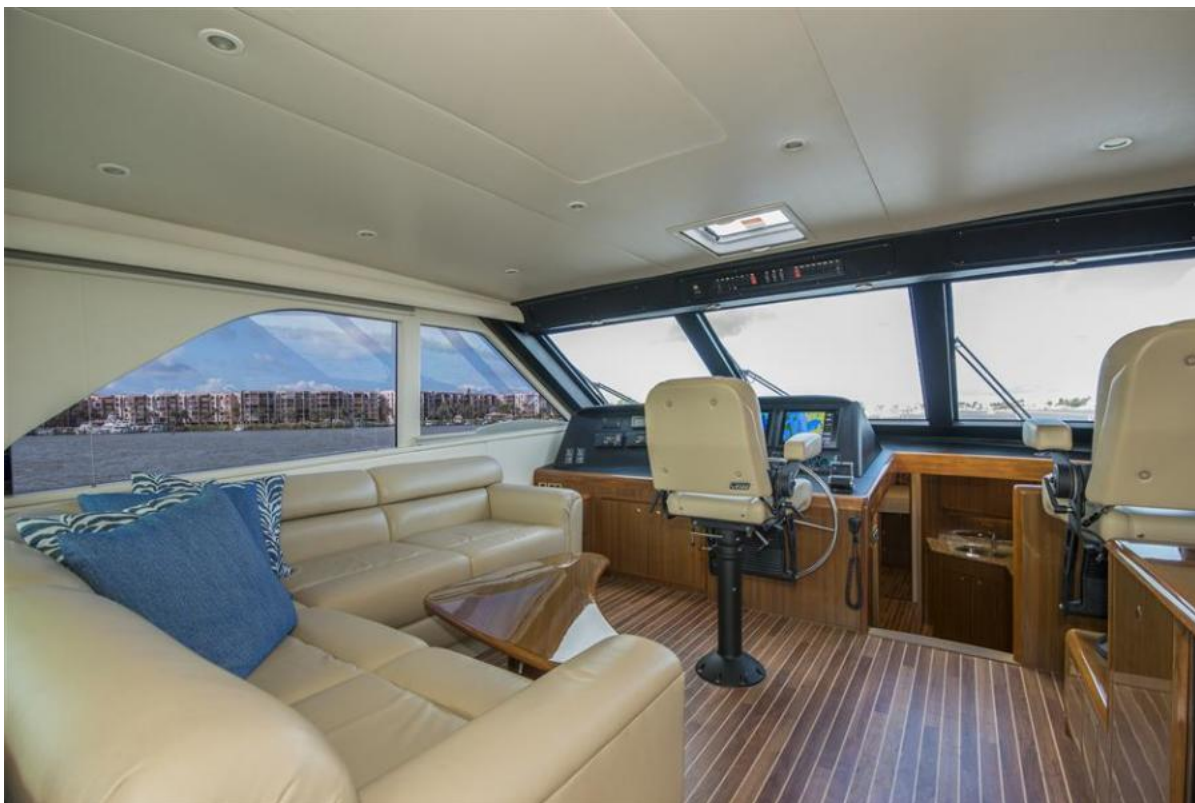
2008 Viking 52 Sport Coupe She's All Hooked Up