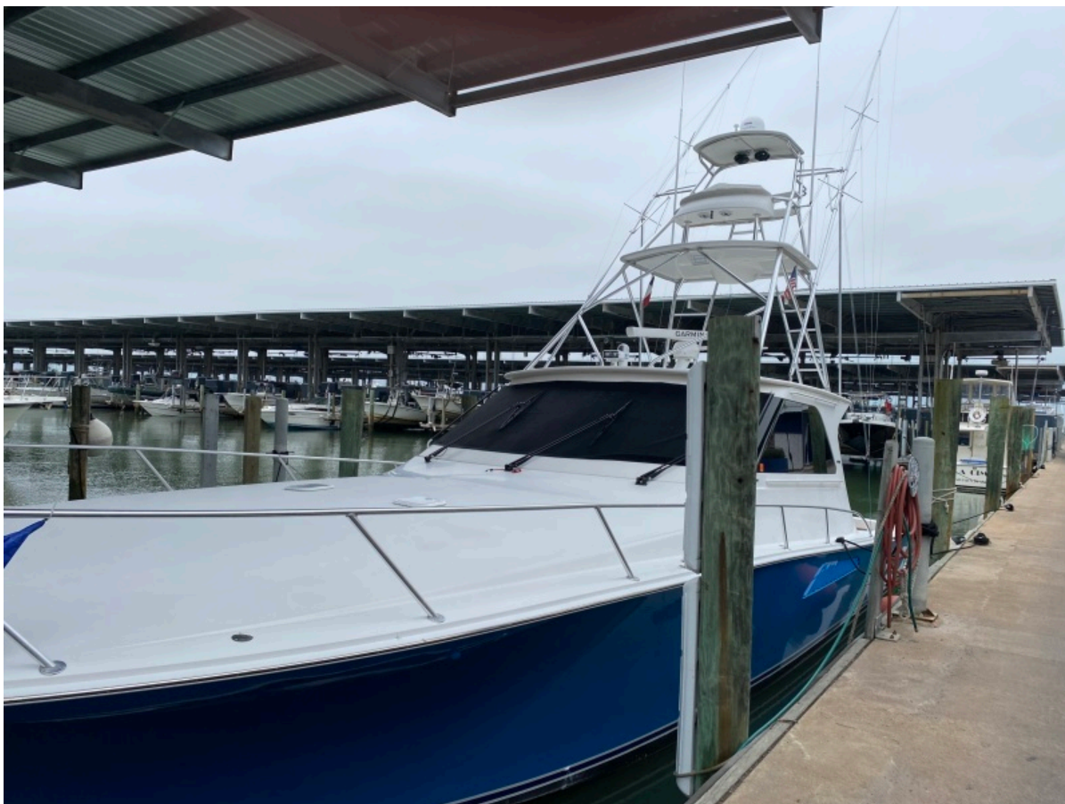
2008 Viking 52 Sport Coupe She's All Hooked Up