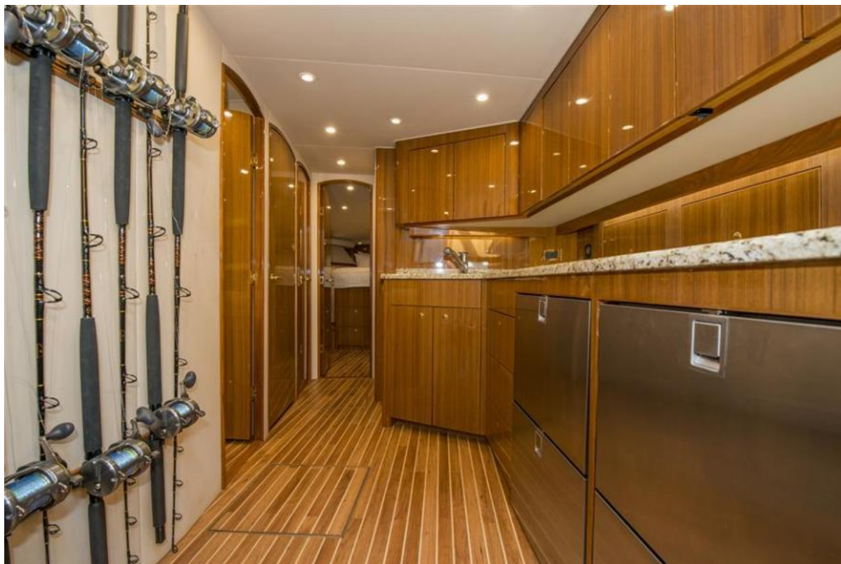
2008 Viking 52 Sport Coupe She's All Hooked Up