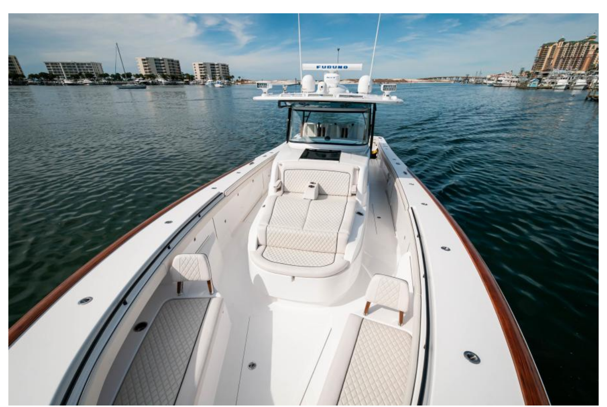
2022 Valhalla Boatworks V46