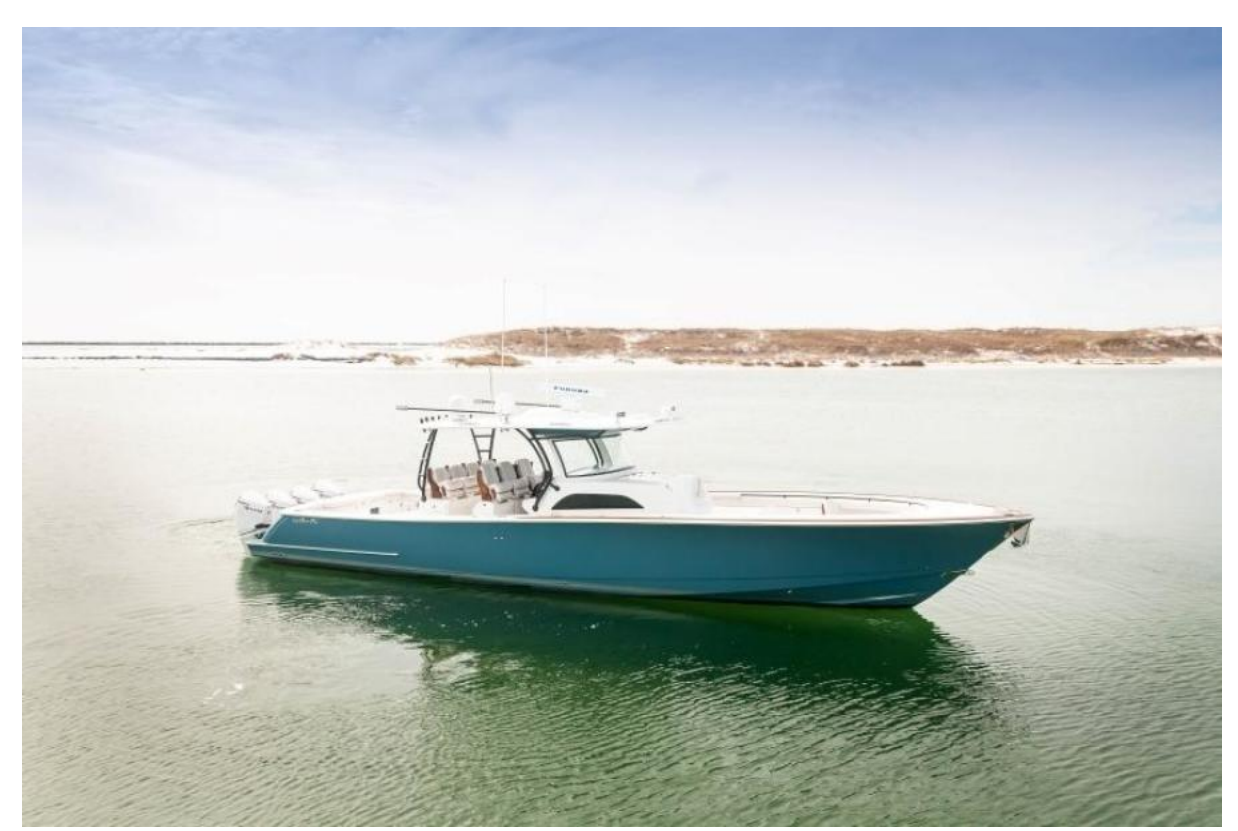
2022 Valhalla Boatworks V46 Raptor Profile