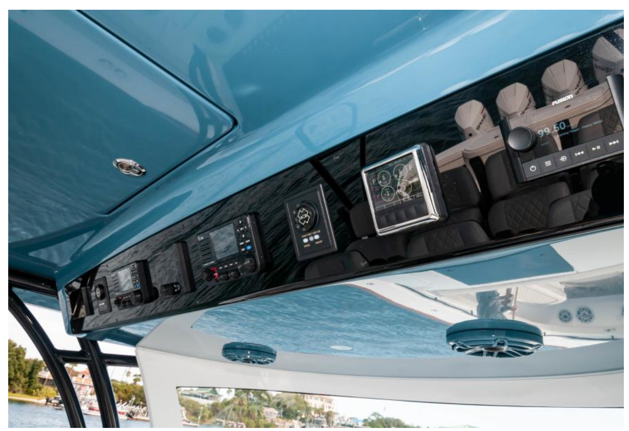
2022 Valhalla Boatworks V46