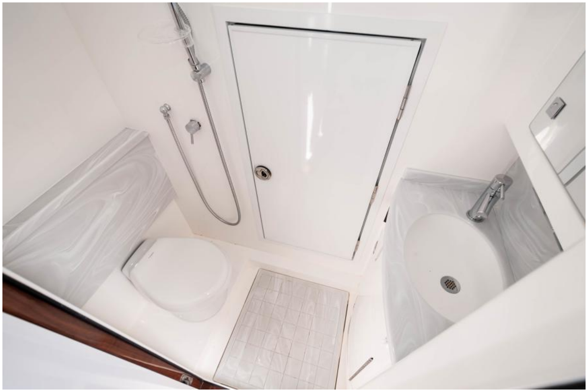
2022 Valhalla Boatworks V46 Head