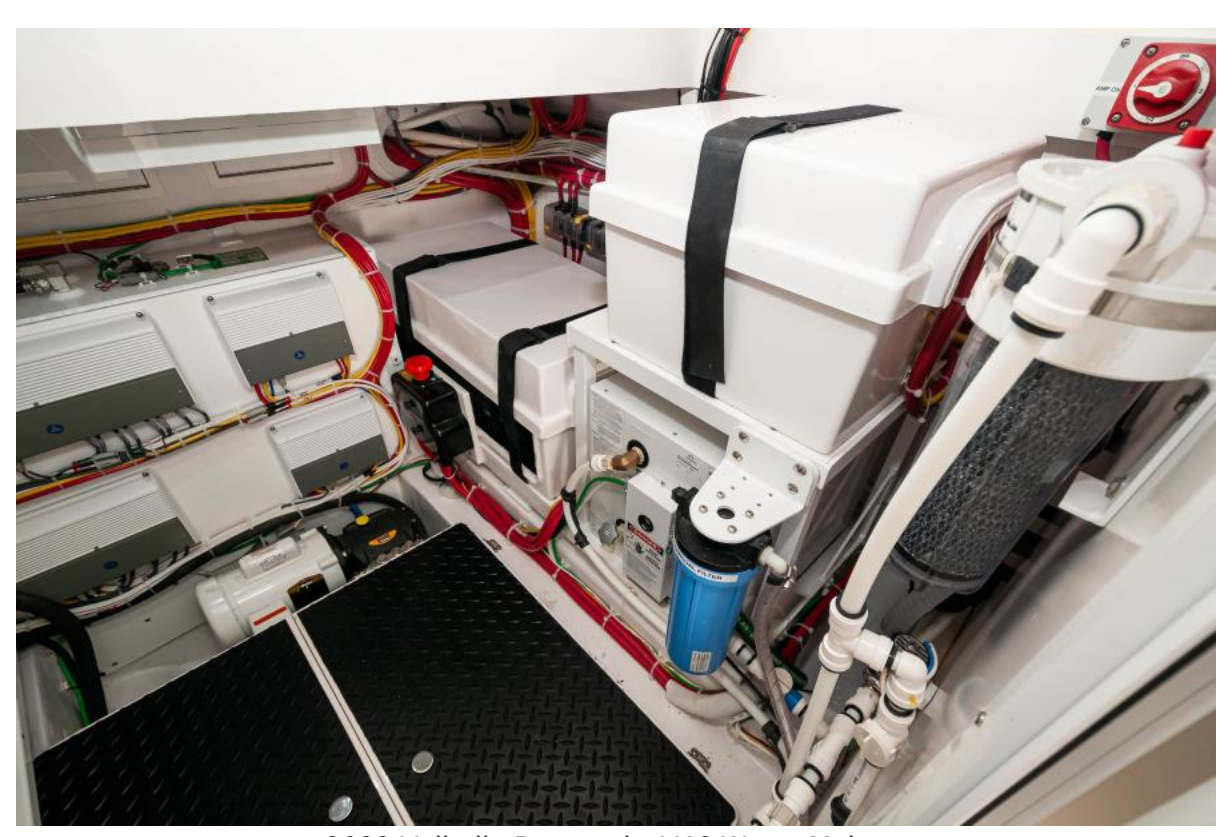
2022 Valhalla Boatworks V46 Water Maker