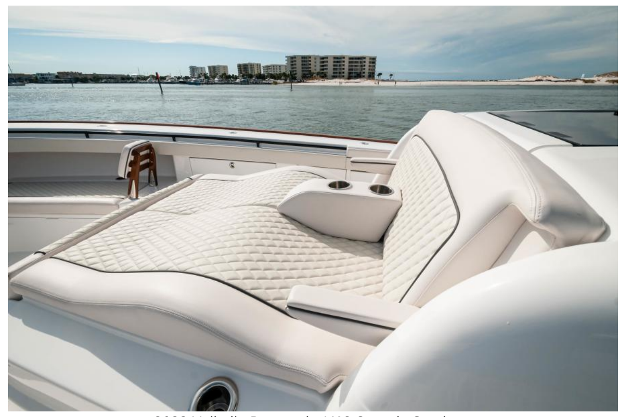
2022 Valhalla Boatworks V46 Console Seating