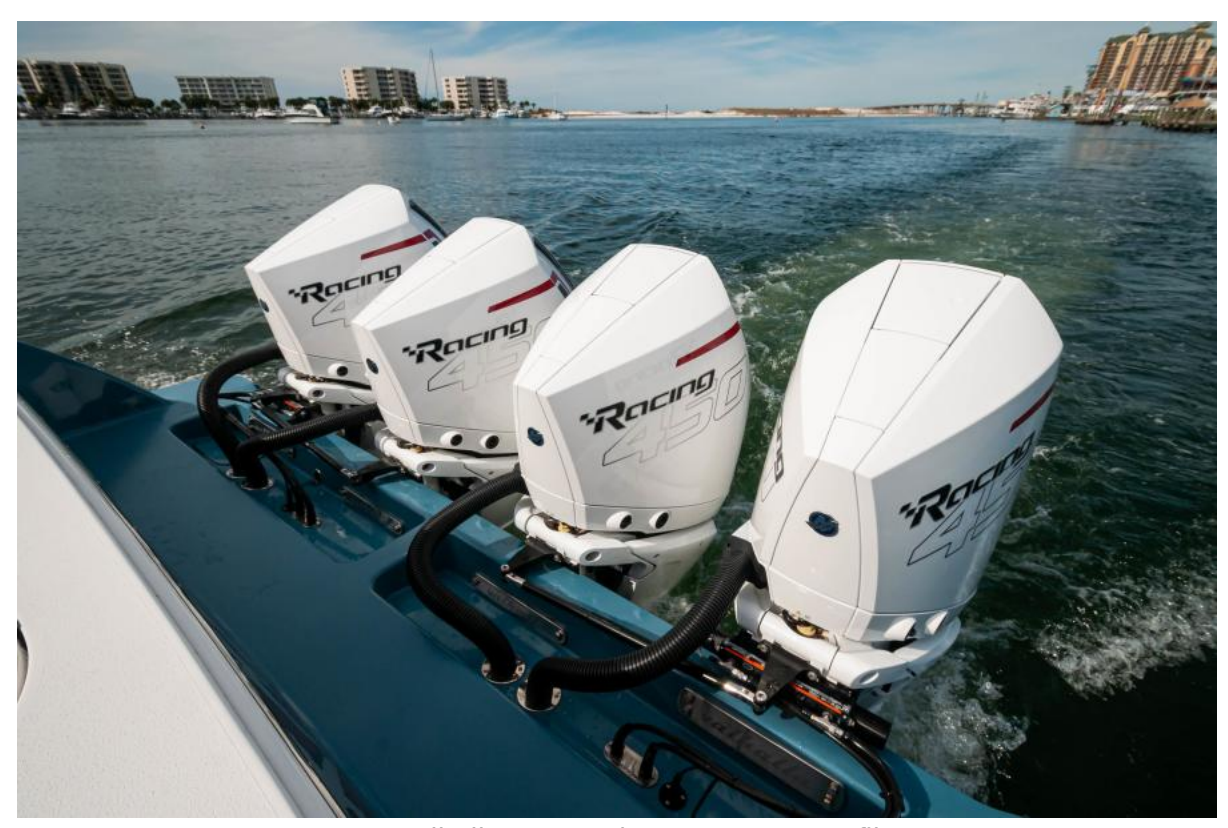
2022 Valhalla Boatworks V46 Raptor Profile