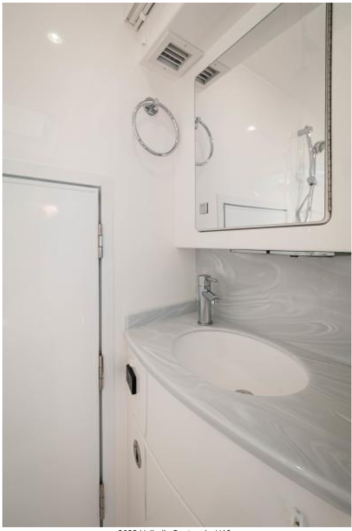
2022 Valhalla Boatworks V46