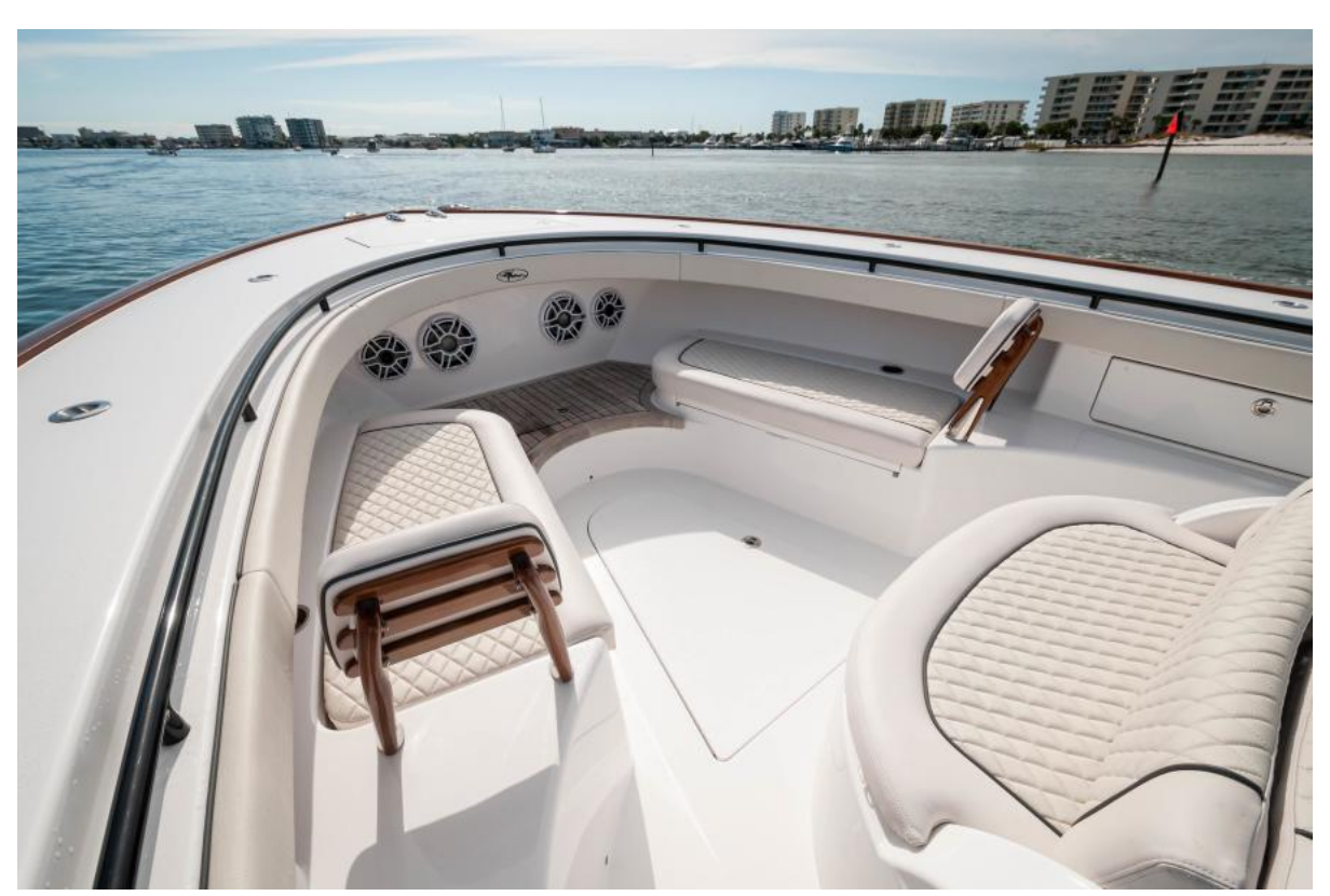
2022 Valhalla Boatworks V46 Bow