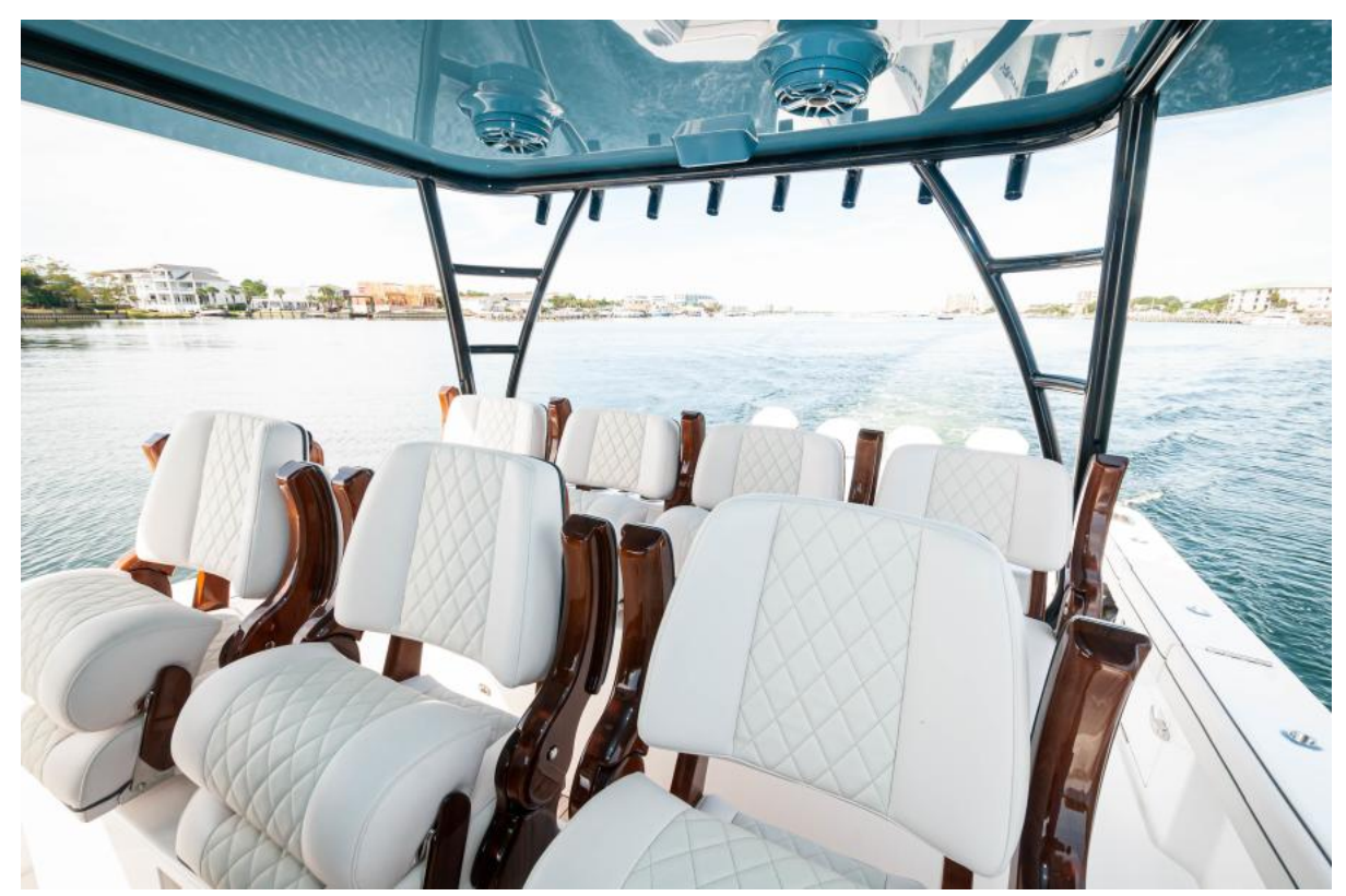
2022 Valhalla Boatworks V46 Helm