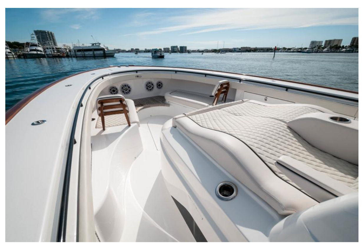
2022 Valhalla Boatworks V46 Bow