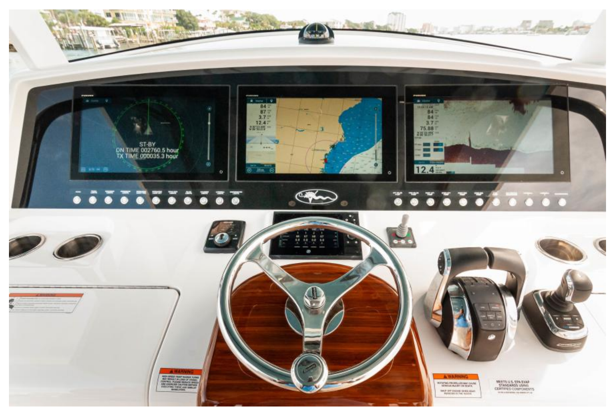
2022 Valhalla Boatworks V46 Helm