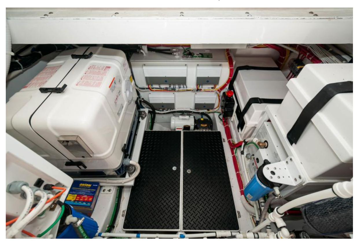
2022 Valhalla Boatworks V46 Mechanical Room