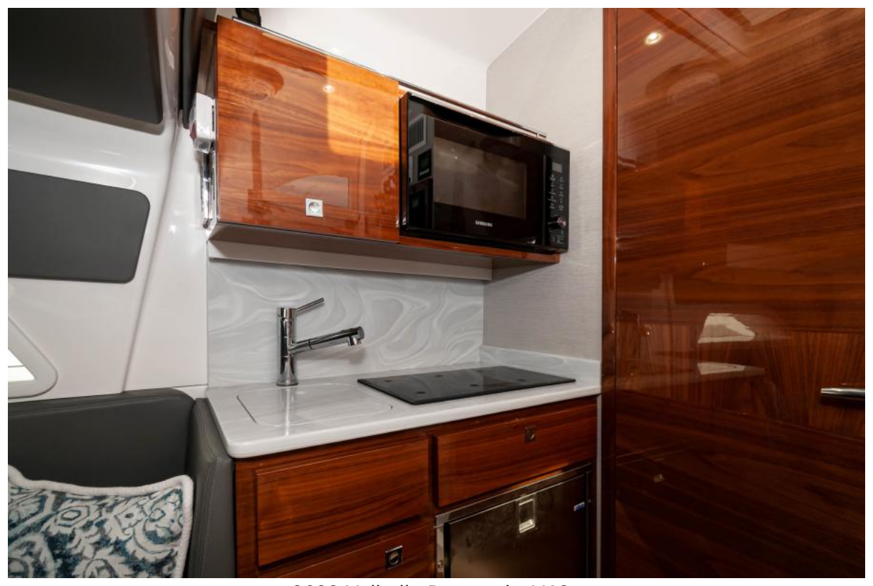
2022 Valhalla Boatworks V46