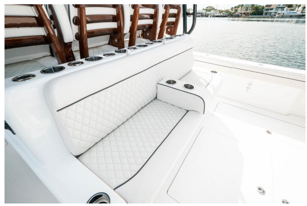
2022 Valhalla Boatworks V46 Mezzanine Seating