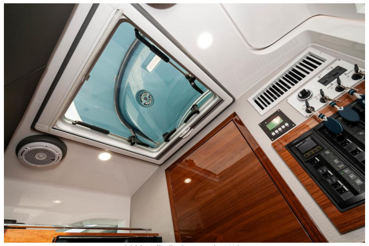
2022 Valhalla Boatworks V46