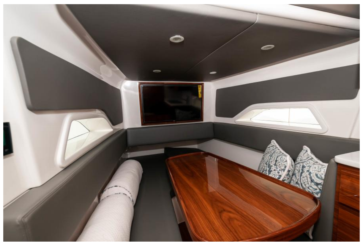
2022 Valhalla Boatworks V46 Cabin