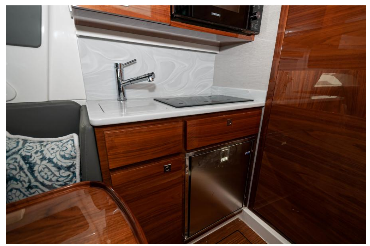
2022 Valhalla Boatworks V46