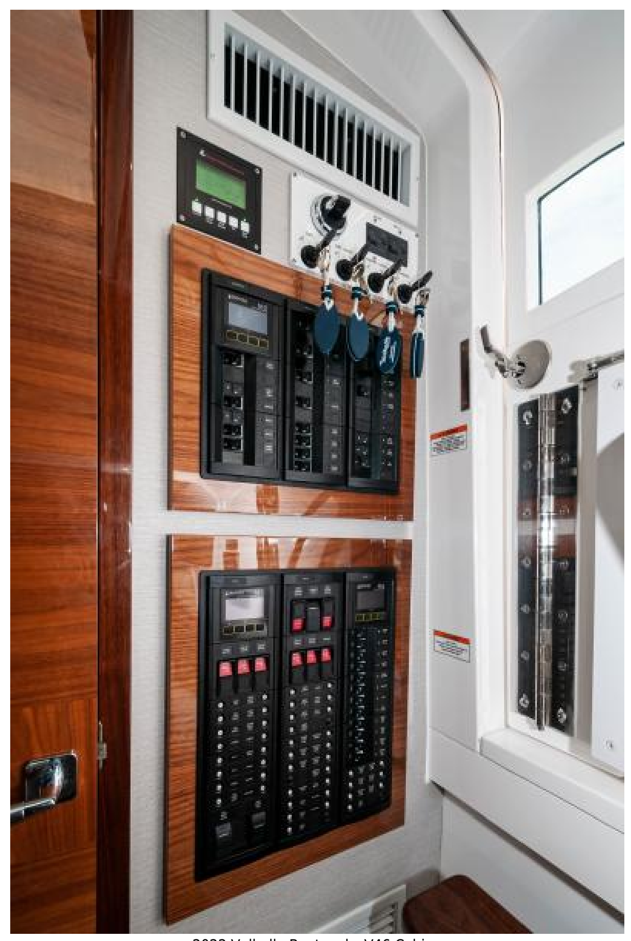
2022 Valhalla Boatworks V46 Cabin