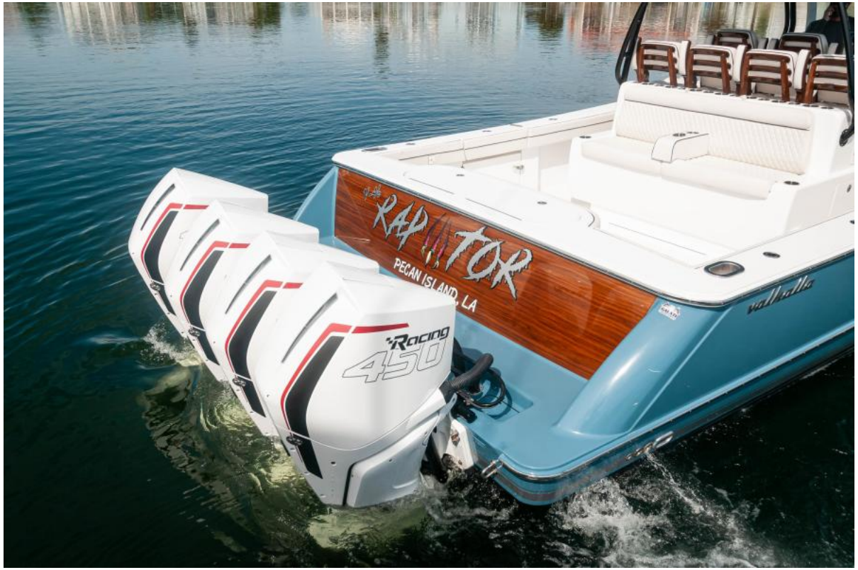
2022 Valhalla Boatworks V46 Transom