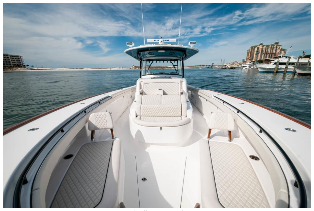
2022 Valhalla Boatworks V46