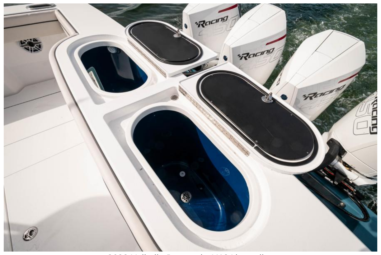
2022 Valhalla Boatworks V46 Livewells