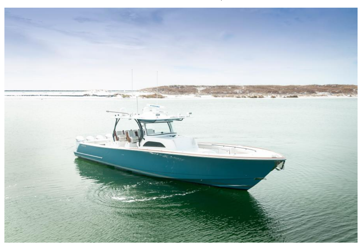
2022 Valhalla Boatworks V46 Raptor Profile