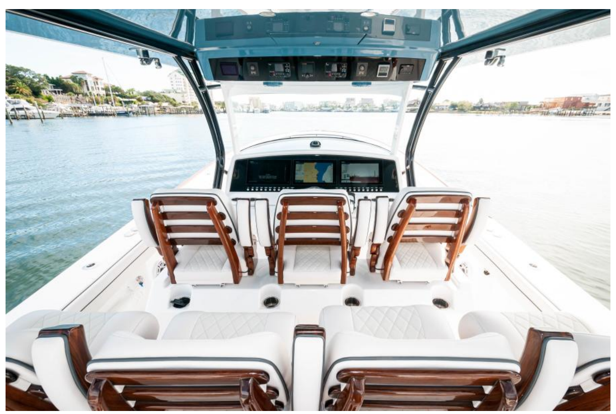
2022 Valhalla Boatworks V46