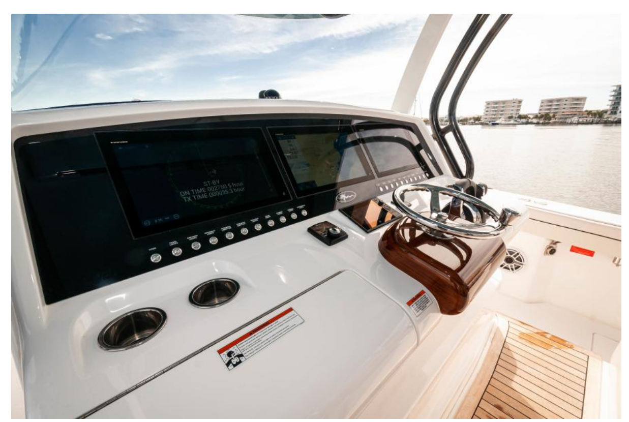
2022 Valhalla Boatworks V46