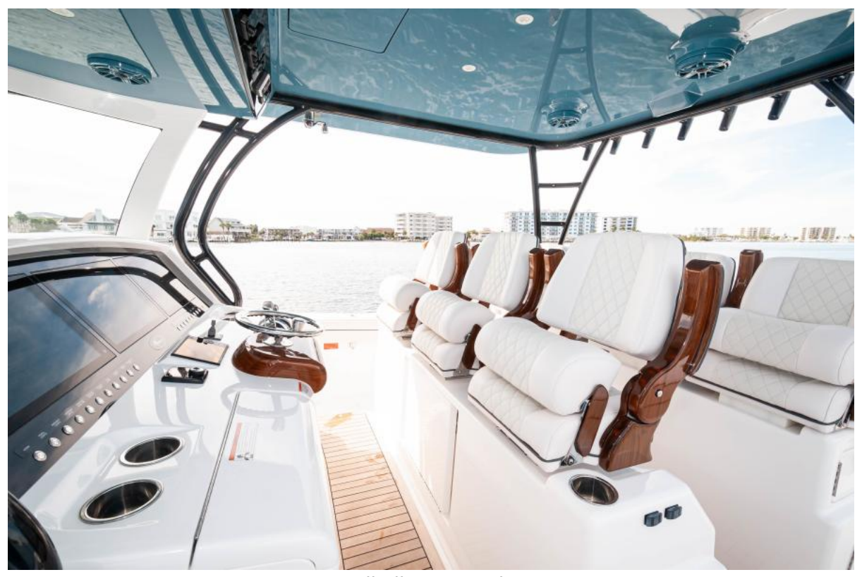
2022 Valhalla Boatworks V46