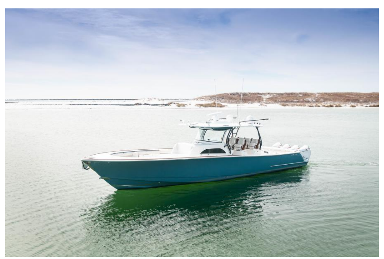
2022 Valhalla Boatworks V46 Raptor Profile