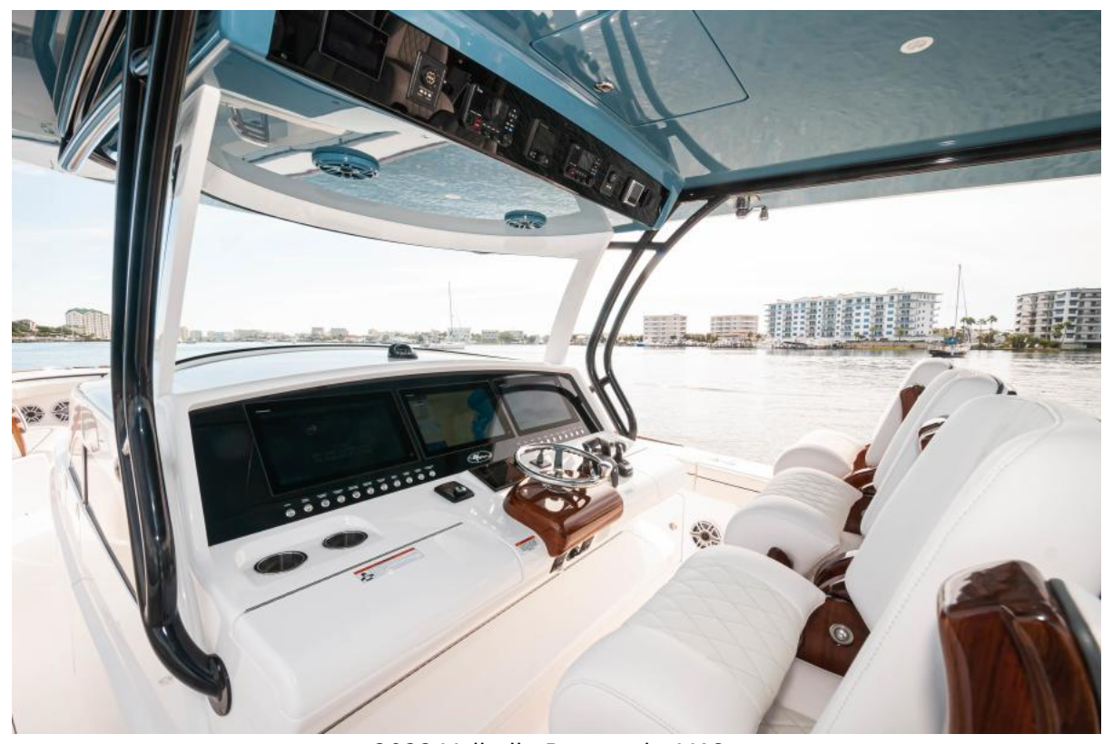
2022 Valhalla Boatworks V46