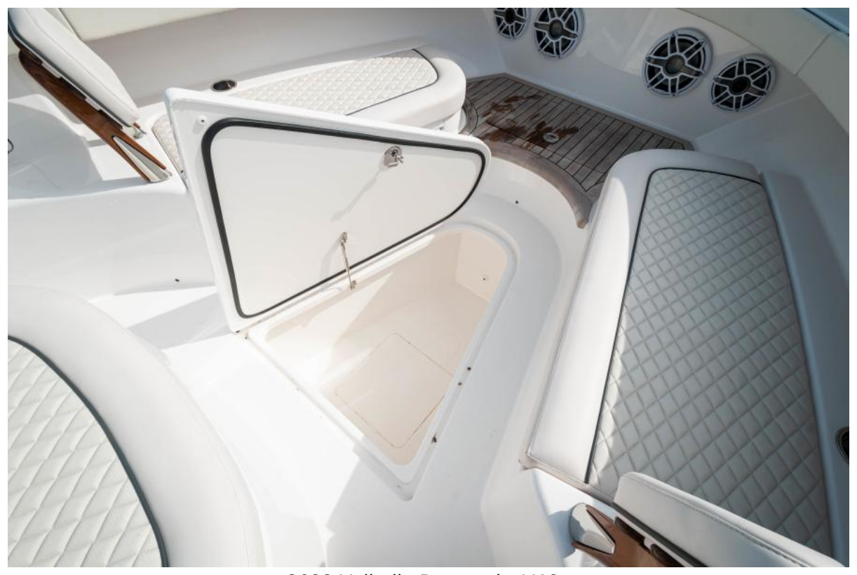
2022 Valhalla Boatworks V46