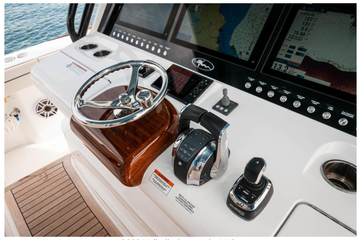
2022 Valhalla Boatworks V46