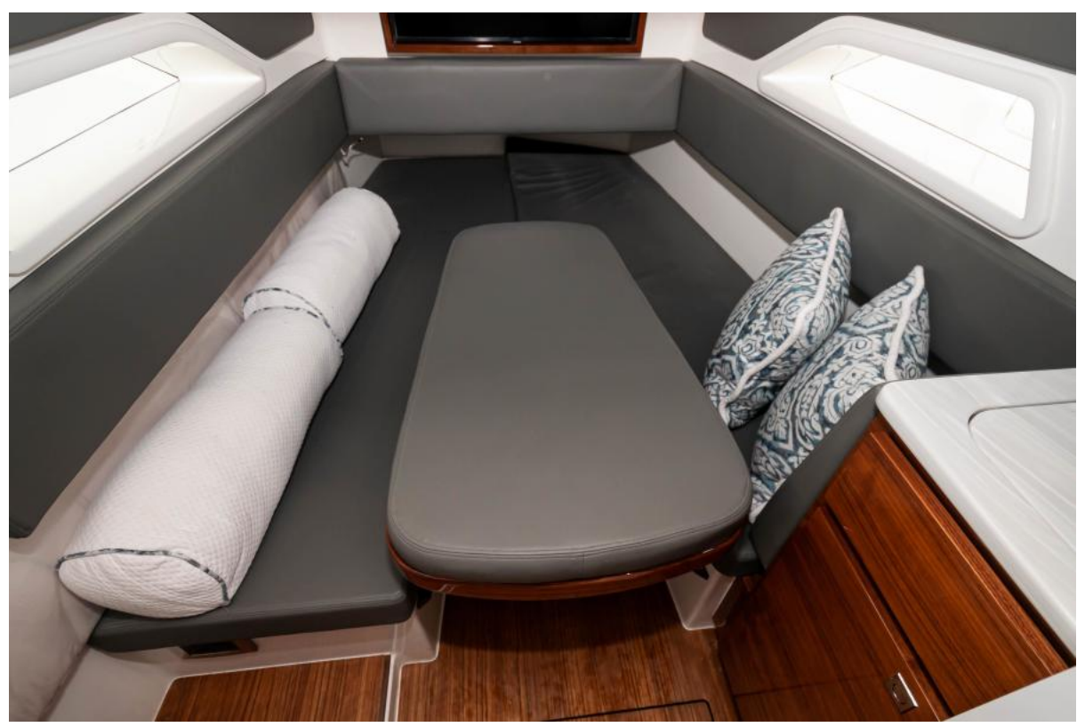
2022 Valhalla Boatworks V46