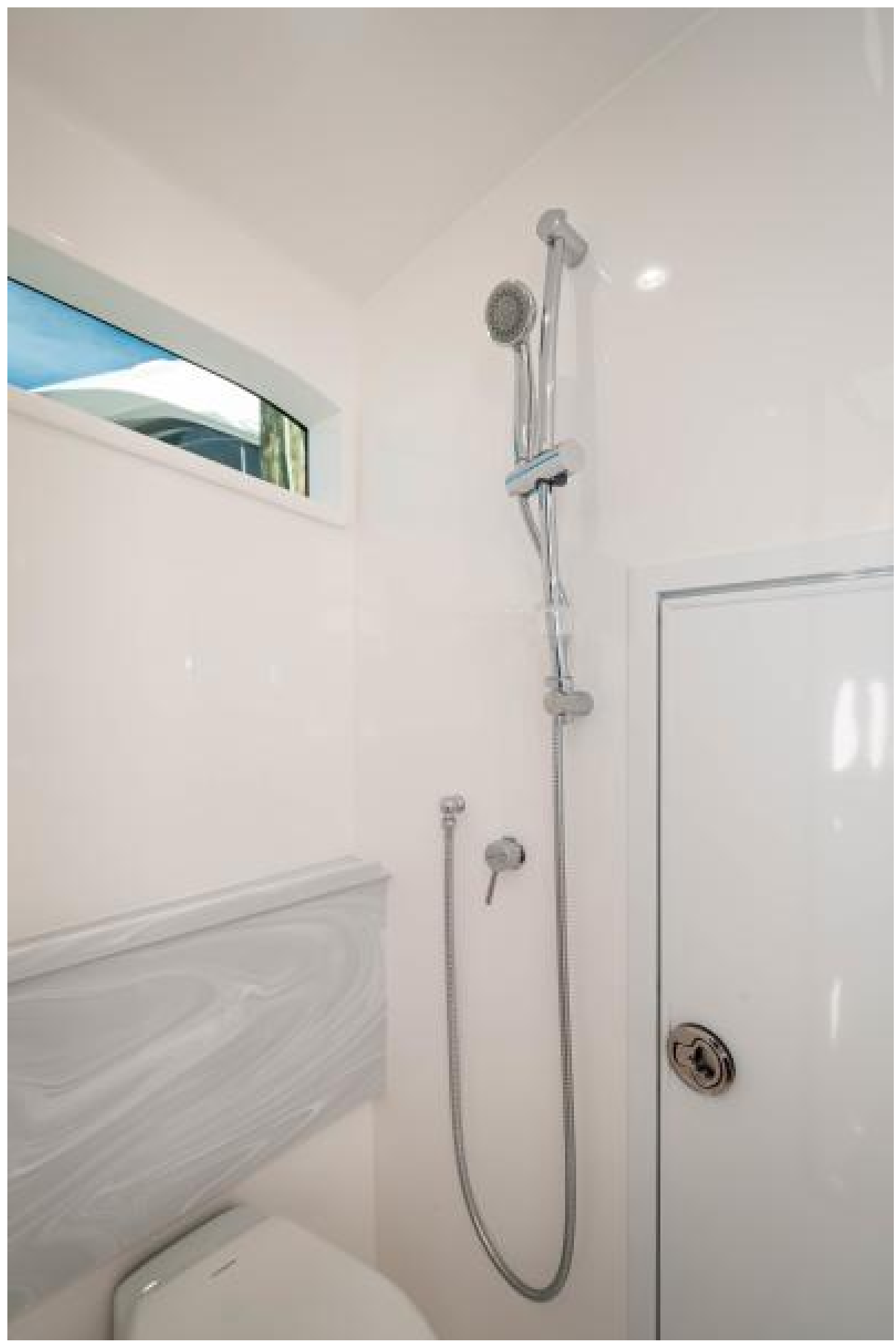
2022 Valhalla Boatworks V46