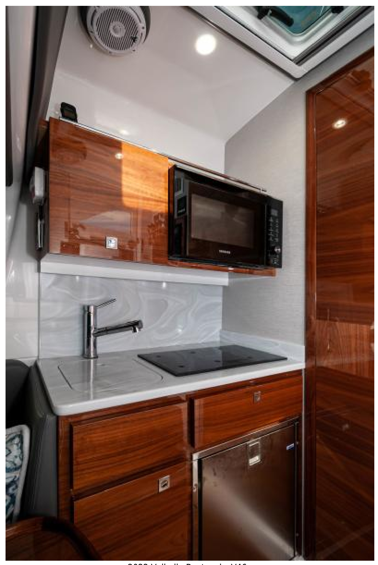
2022 Valhalla Boatworks V46