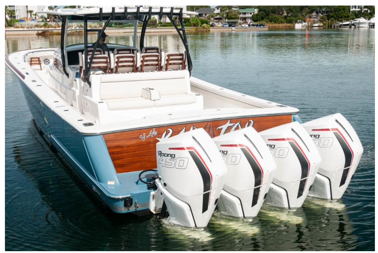
2022 Valhalla Boatworks V46