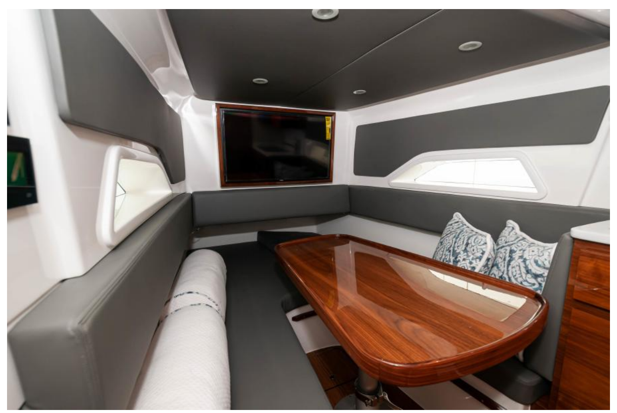
2022 Valhalla Boatworks V46