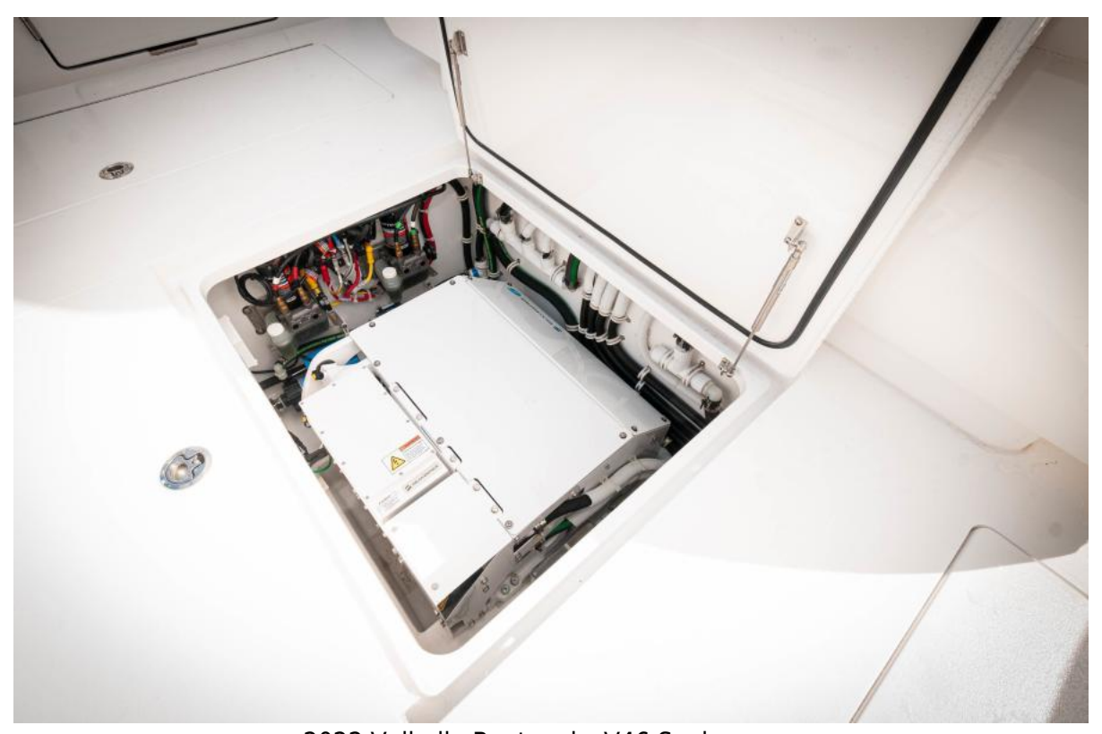
2022 Valhalla Boatworks V46 Seakeeper