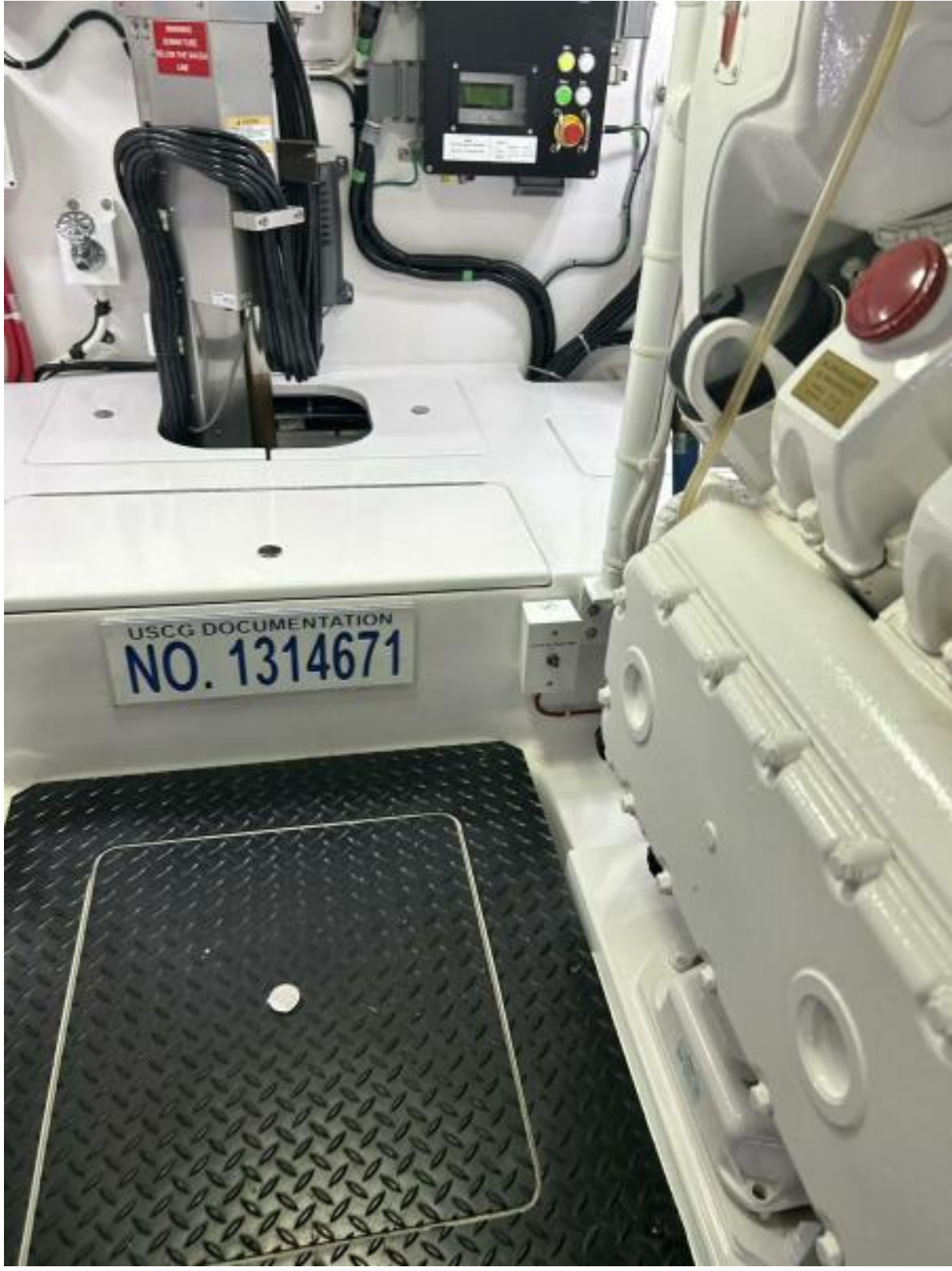
2021 Viking 54 Convertible Blue Rush