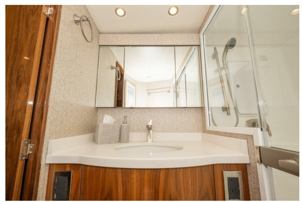
2021 Viking 54 Convertible Blue Rush