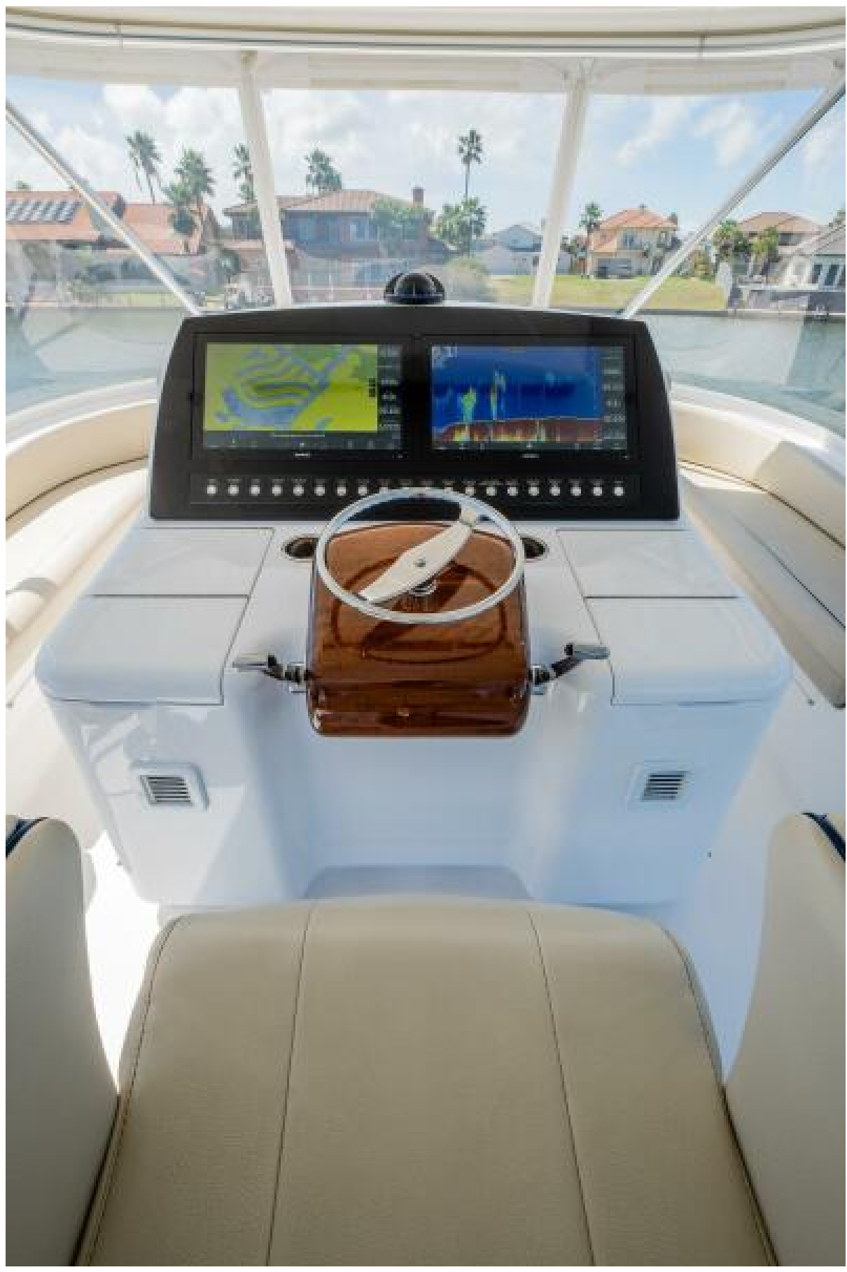
2021 Viking 54 Convertible Blue Rush