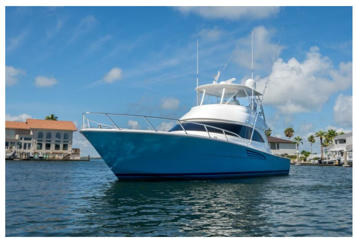
2021 Viking 54 Convertible Blue Rush