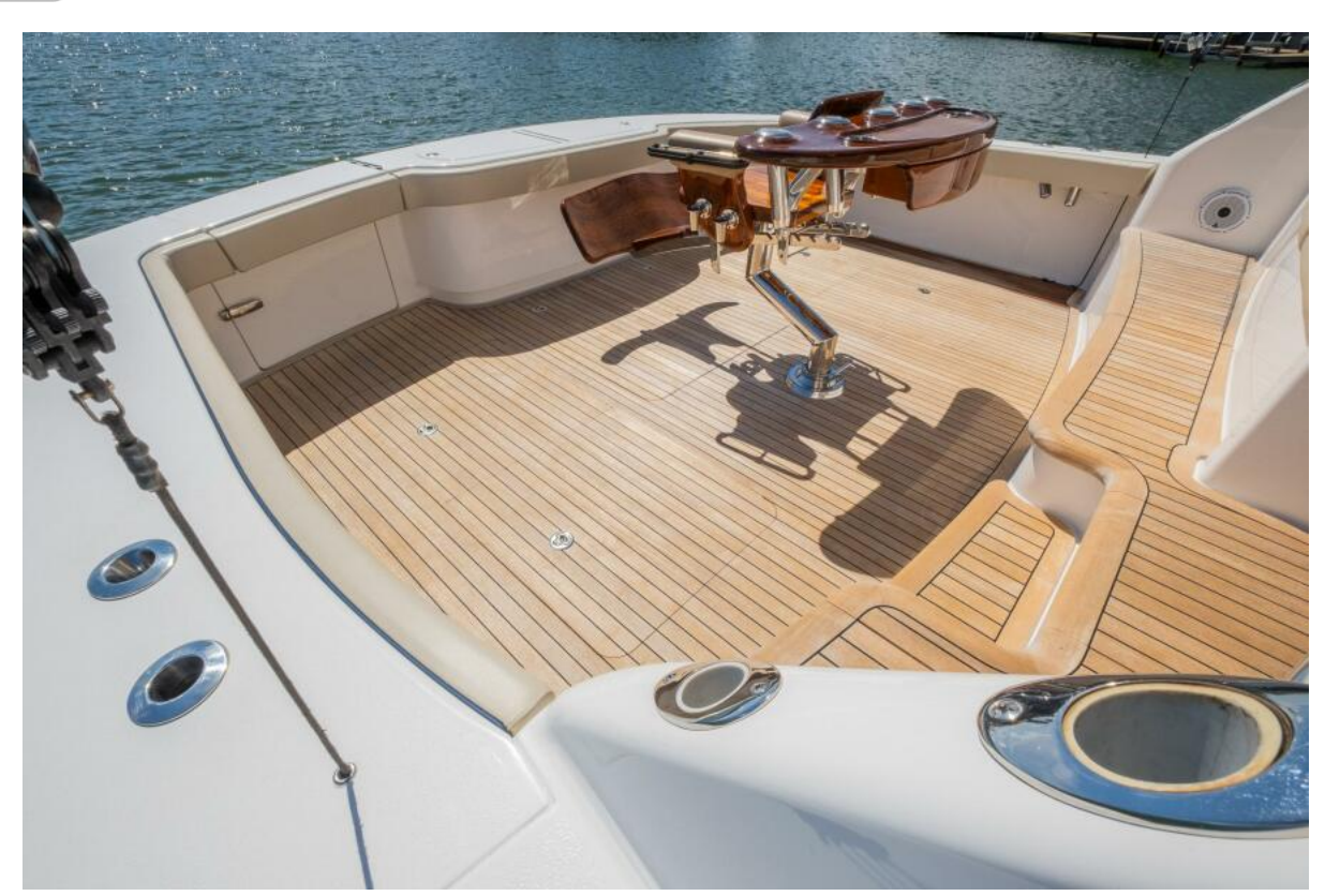
2021 Viking 54 Convertible Blue Rush