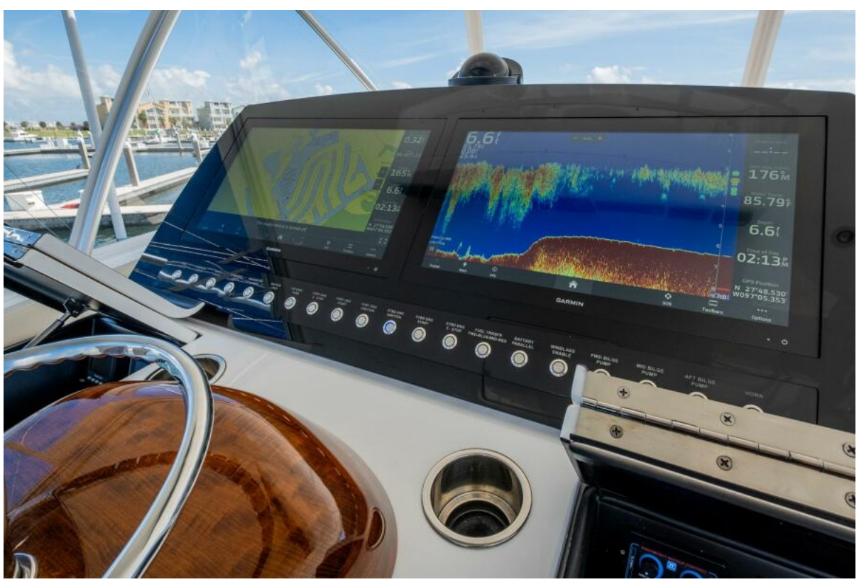
2021 Viking 54 Convertible Blue Rush