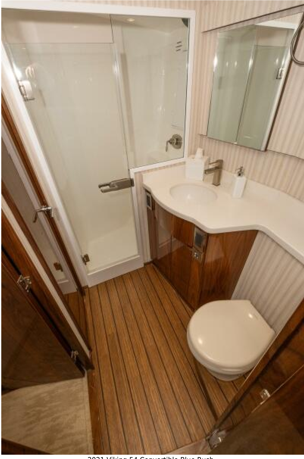
2021 Viking 54 Convertible Blue Rush