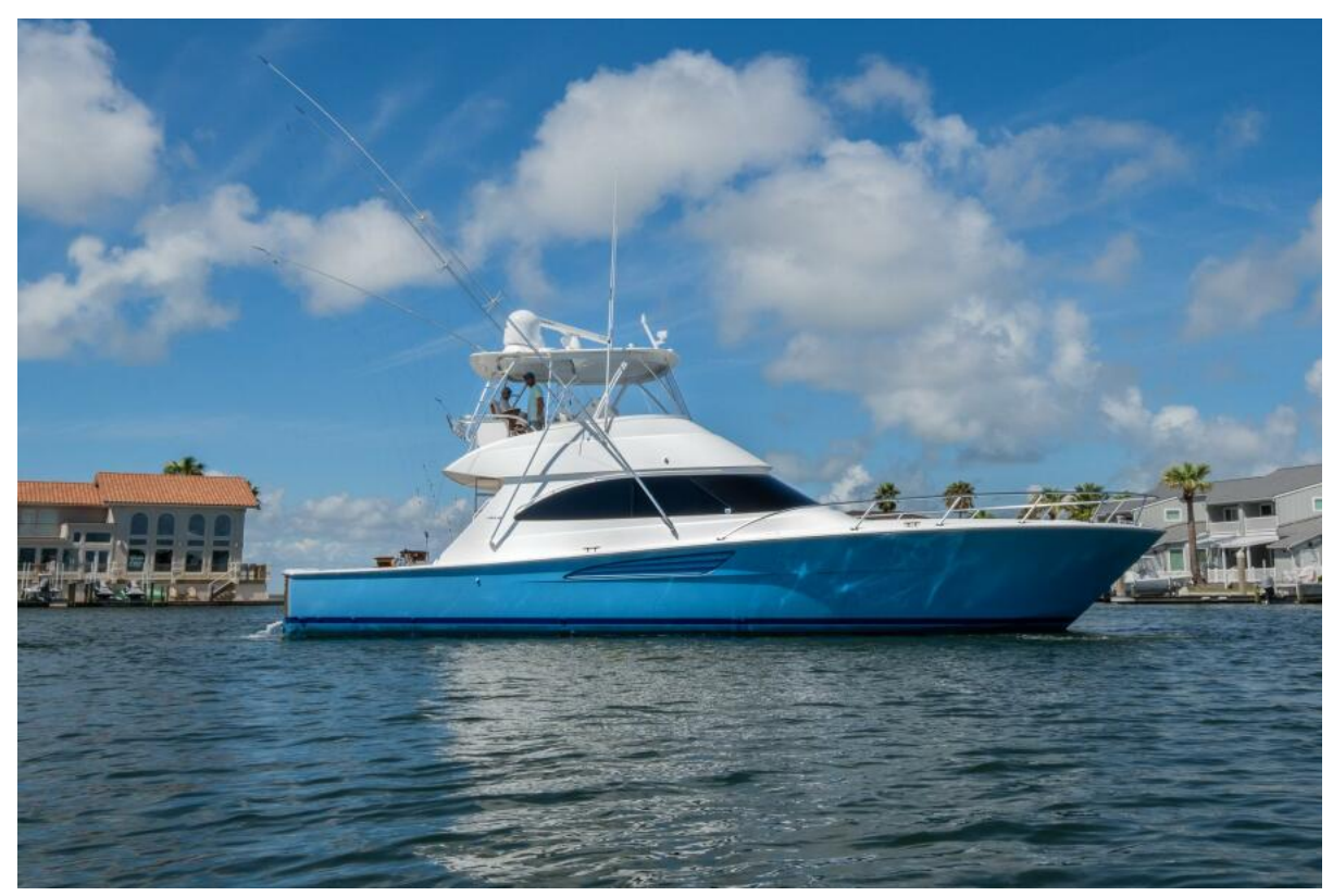
2021 Viking 54 Convertible Blue Rush