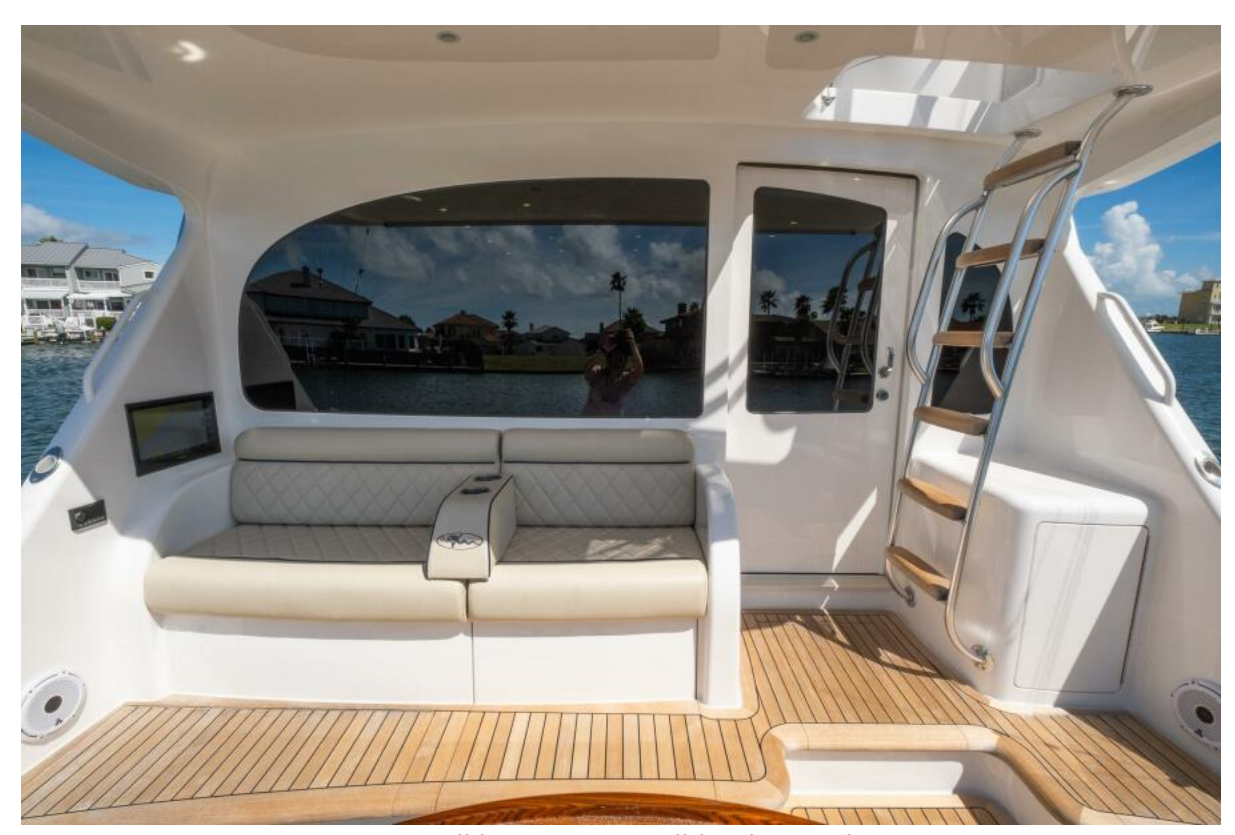
2021 Viking 54 Convertible Blue Rush