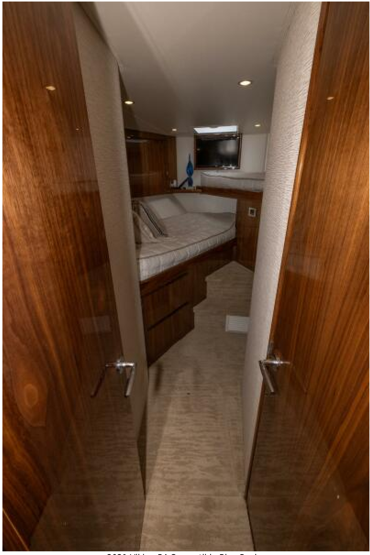
2021 Viking 54 Convertible Blue Rush