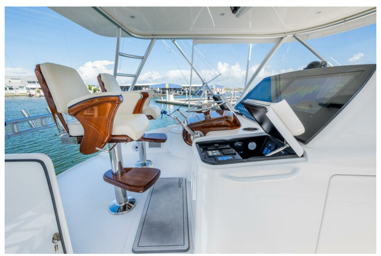
2021 Viking 54 Convertible Blue Rush