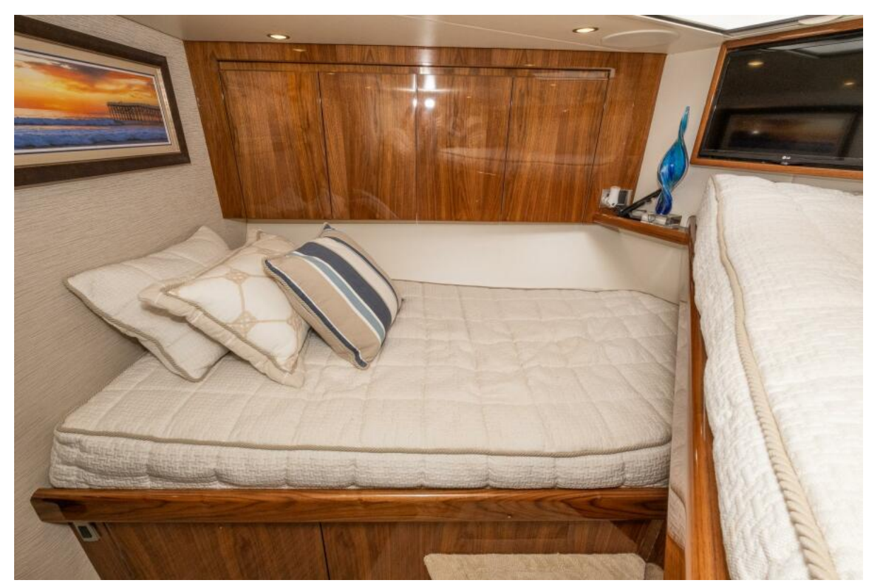
2021 Viking 54 Convertible Blue Rush