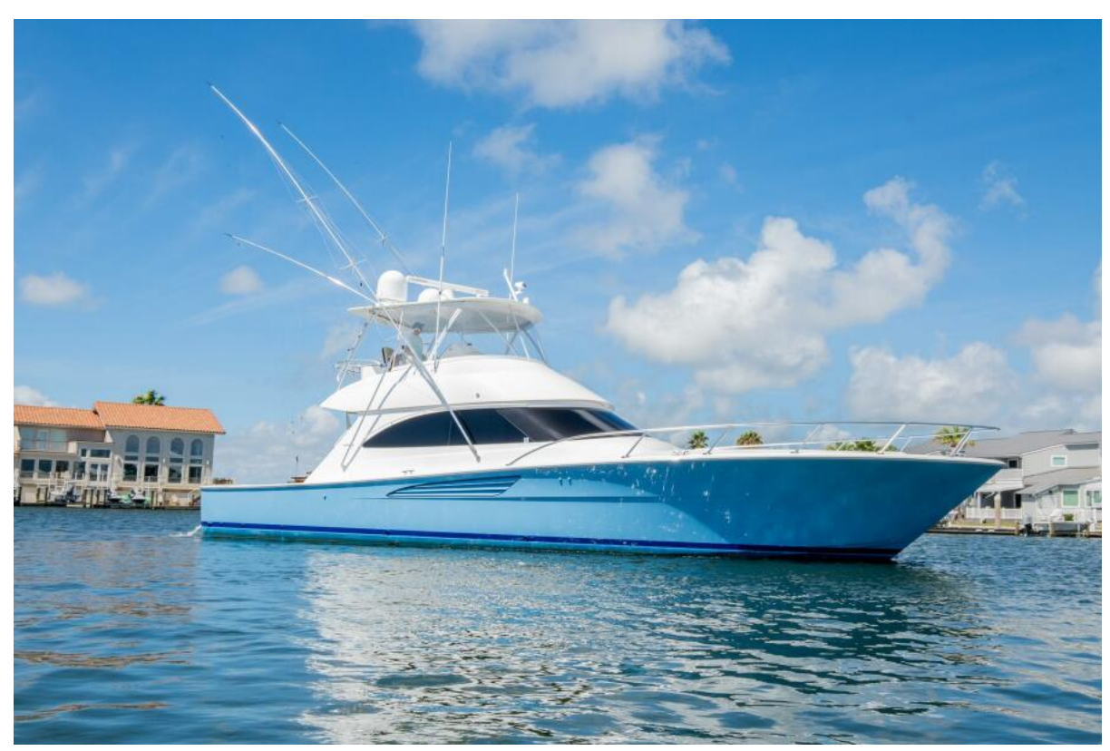
2021 Viking 54 Convertible Blue Rush