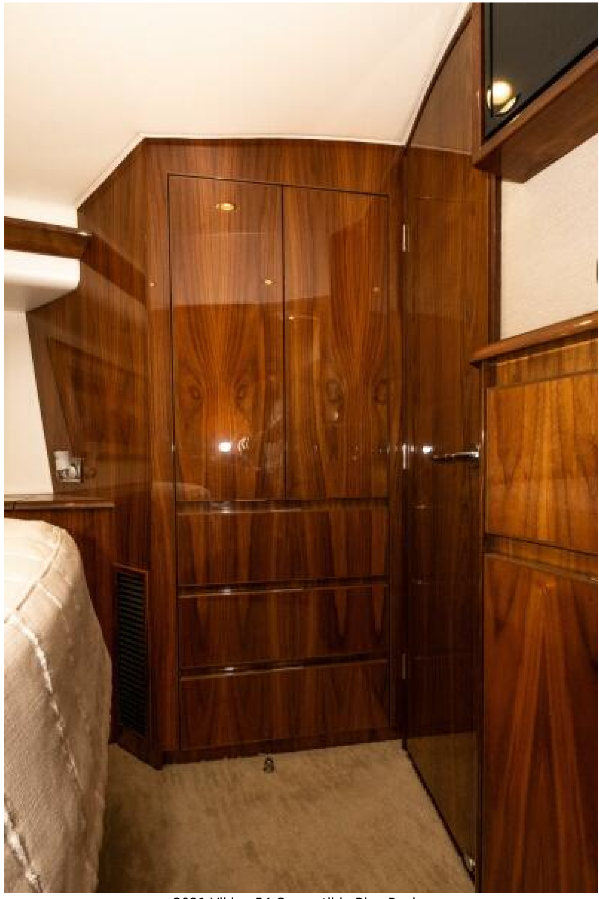
2021 Viking 54 Convertible Blue Rush