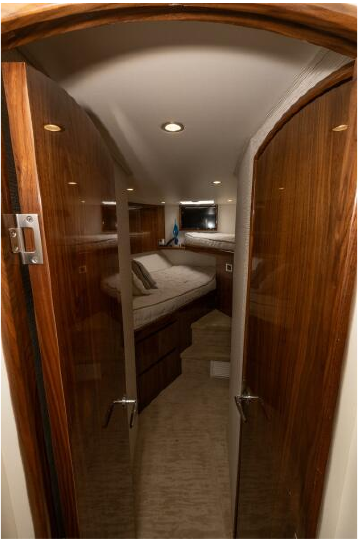
2021 Viking 54 Convertible Blue Rush