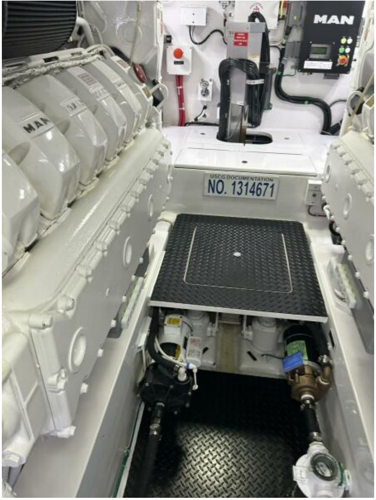
2021 Viking 54 Convertible Blue Rush