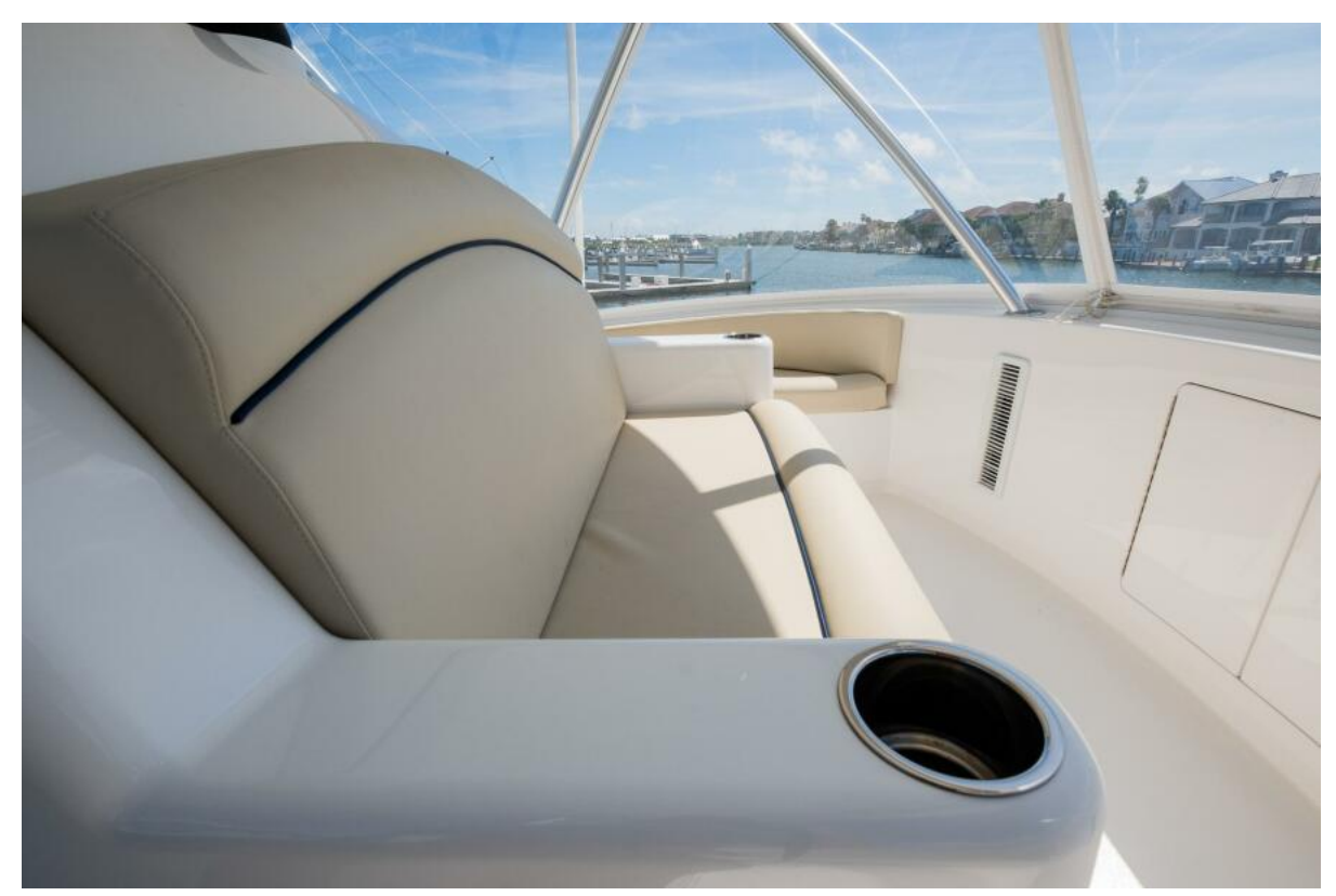
2021 Viking 54 Convertible Blue Rush