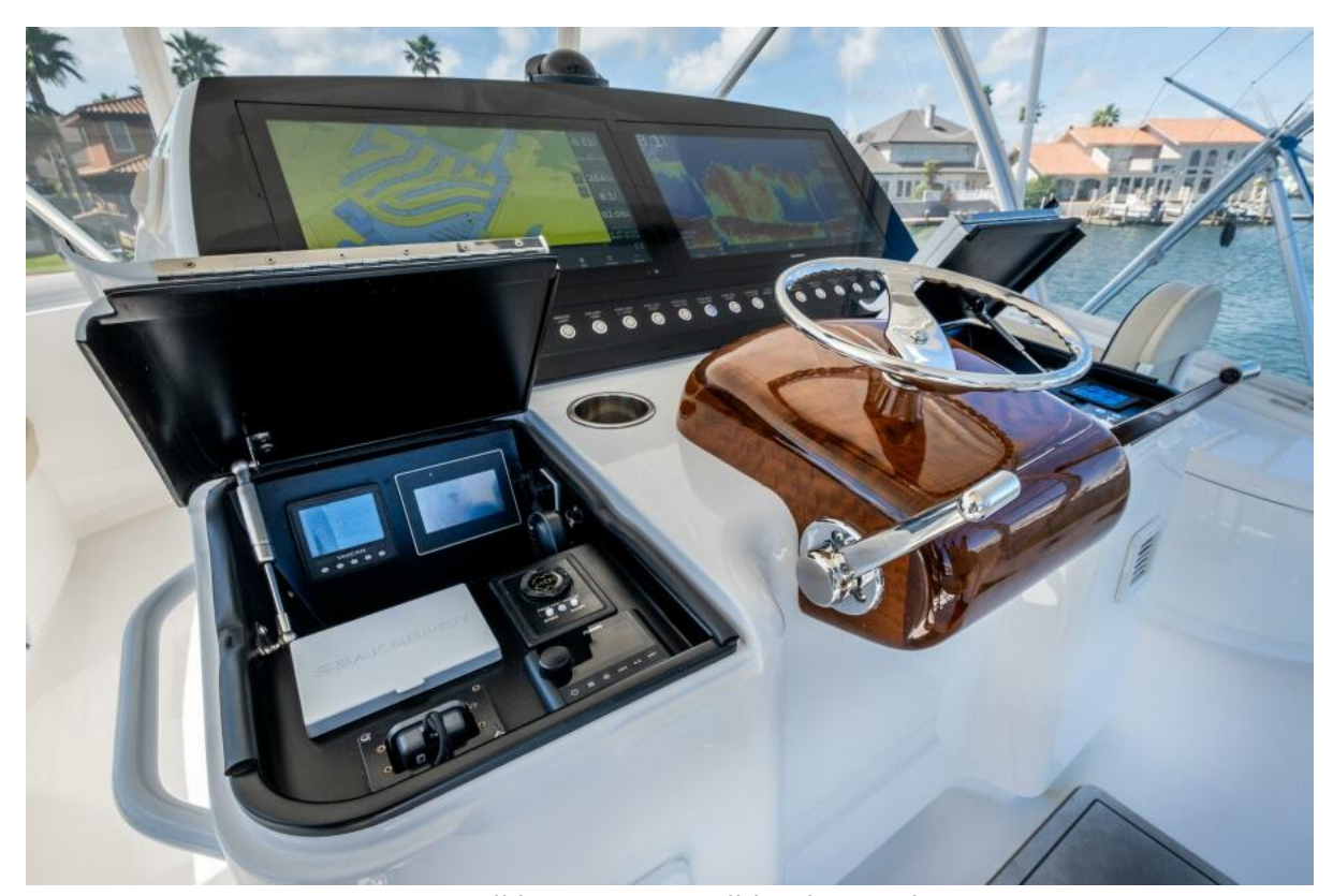
2021 Viking 54 Convertible Blue Rush