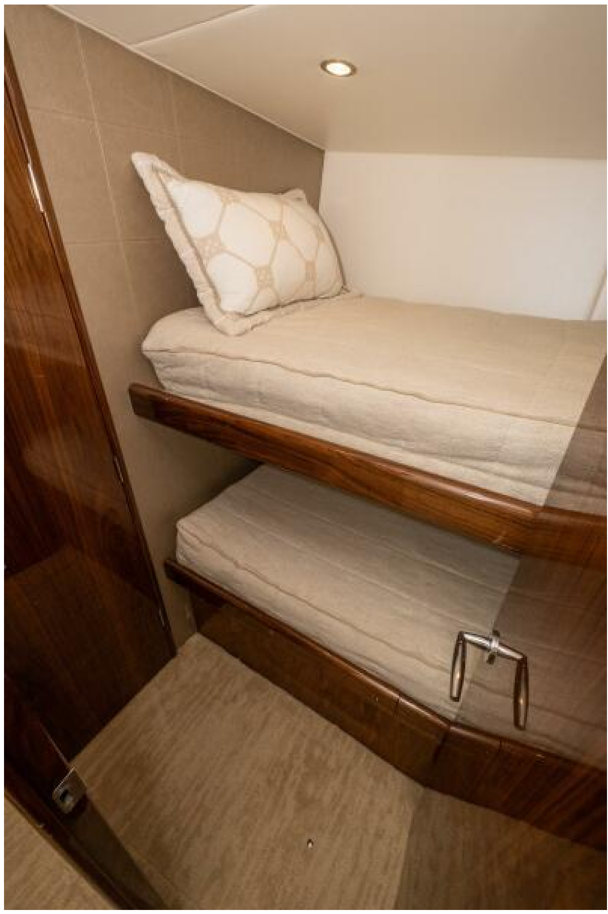
2021 Viking 54 Convertible Blue Rush