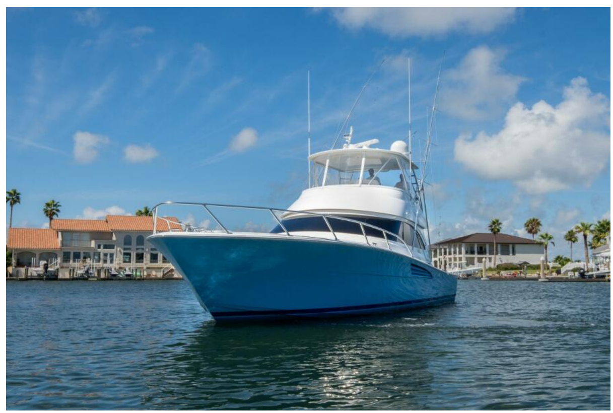
2021 Viking 54 Convertible Blue Rush