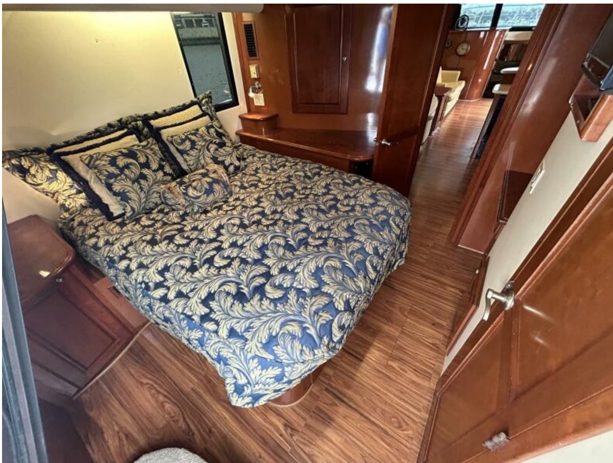
2007 Bluewater Yachts 5200 Custom