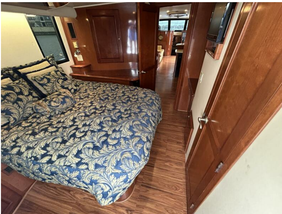
2007 Bluewater Yachts 5200 Custom