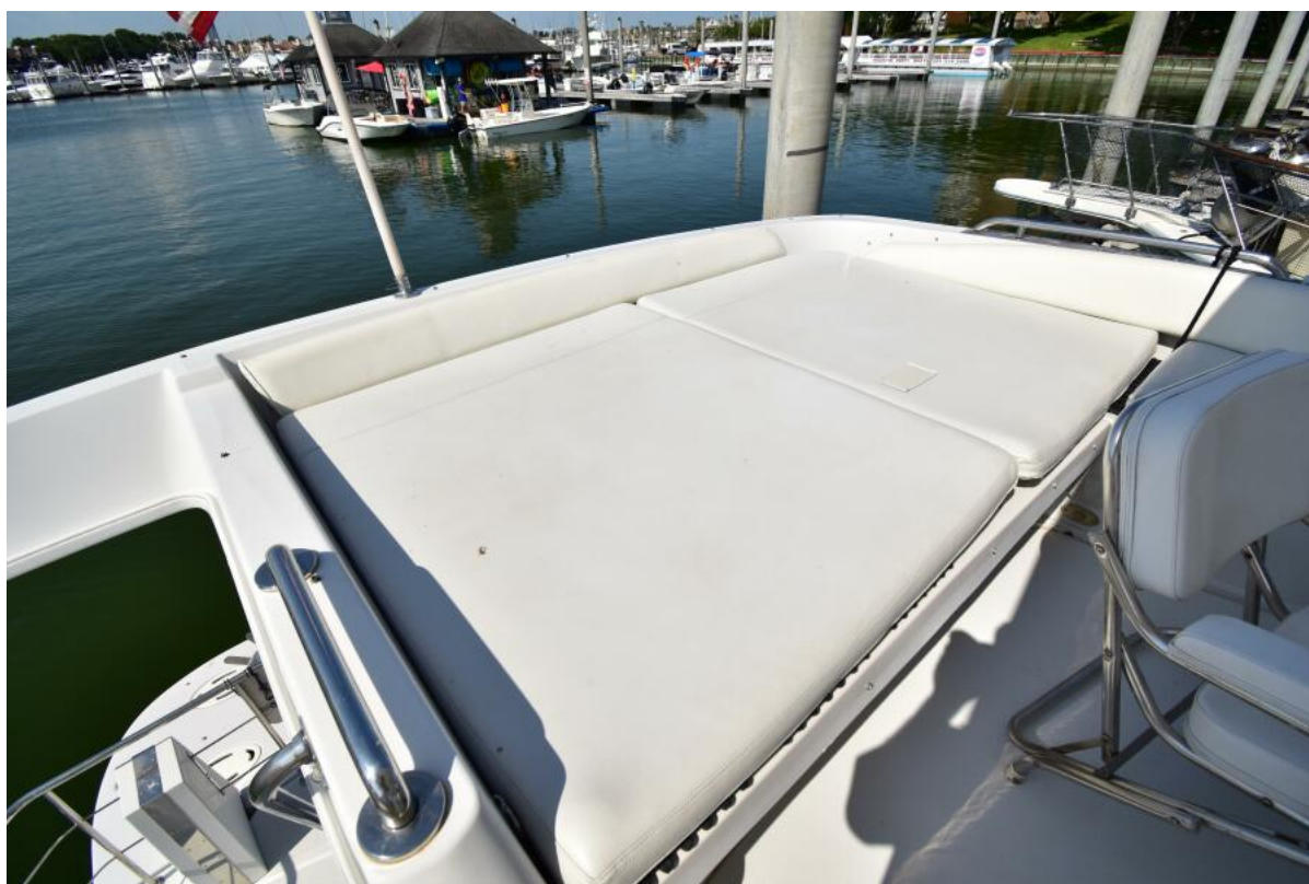
2007 Bluewater Yachts 5200 Custom