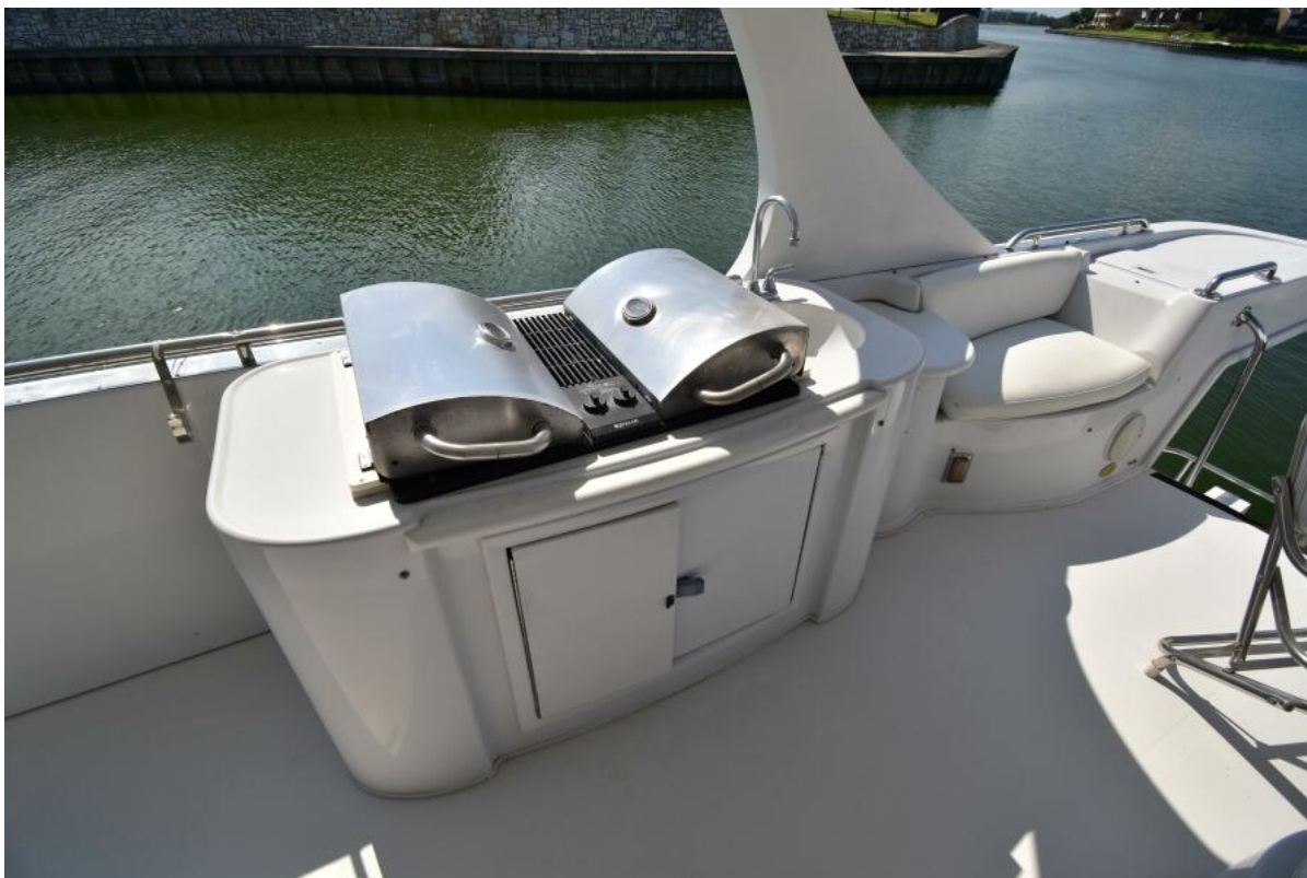
2007 Bluewater Yachts 5200 Custom