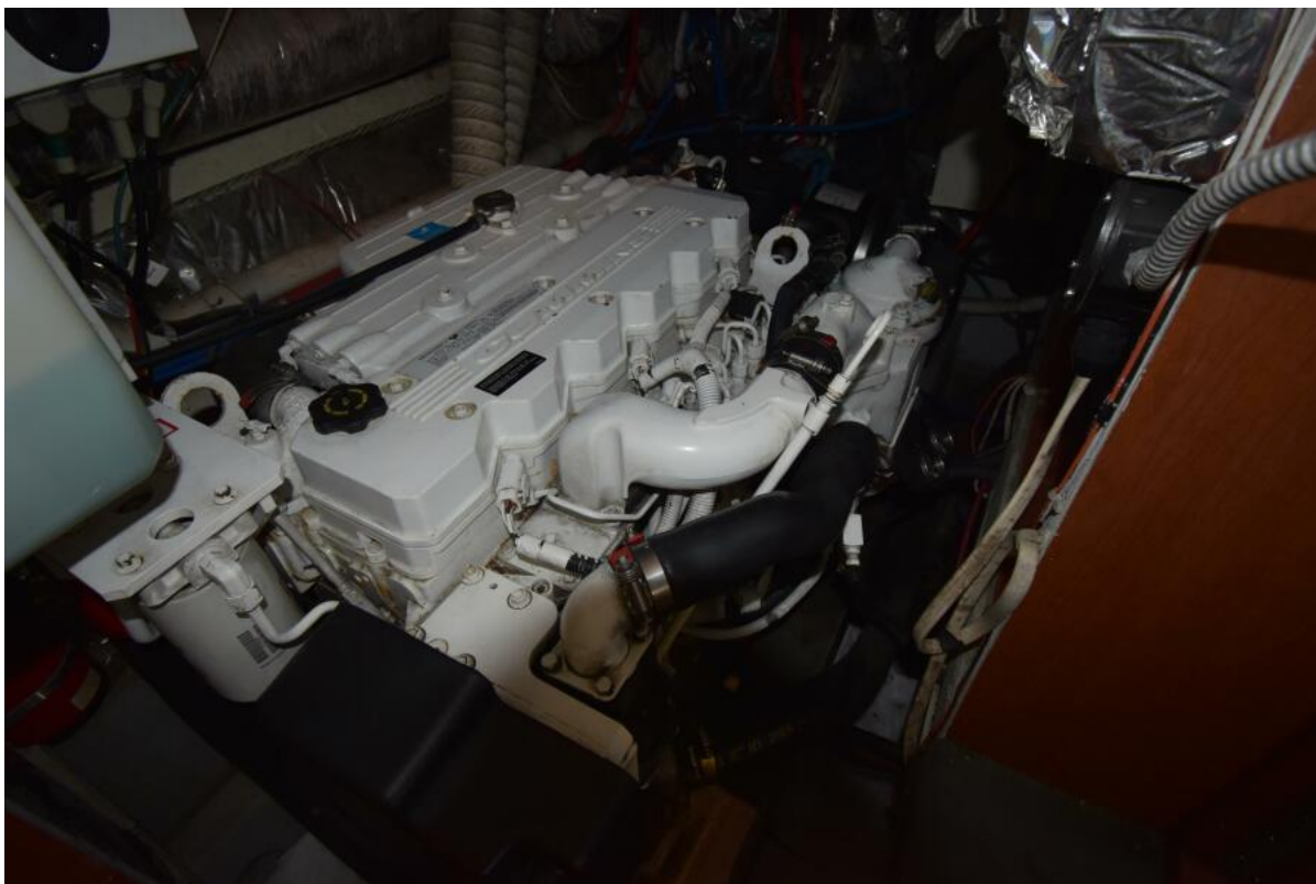
2007 Bluewater Yachts 5200 Custom