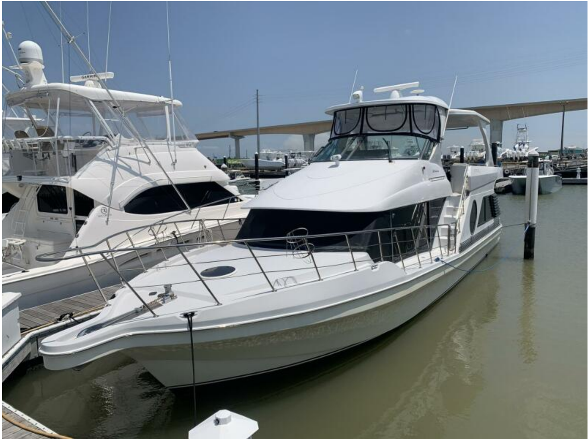
“And Praise the Lord!” is a 2007 Bluewater Yachts 5200 w/Cummins Diesel Power Hydraulic Lift Platform Side Power Bow Thruster Fiberglass Hard Top over Flybridge Three Sided Strata Enclosure Large 2 Stateroom 2 Head Layout Washer/Dryer Combo Only 14’5” to T