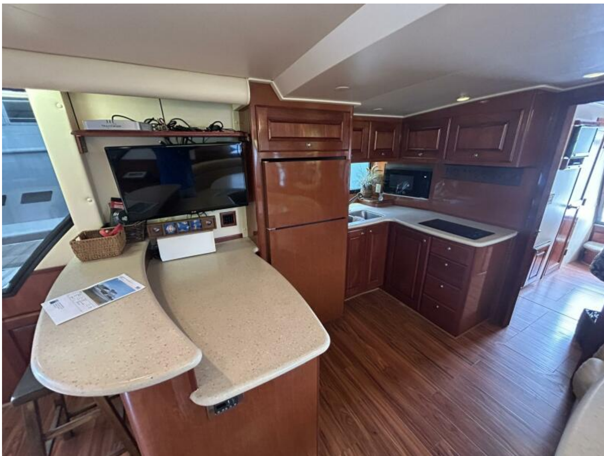
2007 Bluewater Yachts 5200 Custom