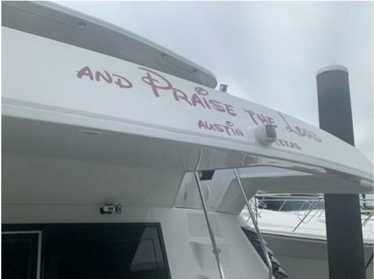
“And Praise the Lord!” is a 2007 Bluewater Yachts 5200 w/Cummins Diesel Power Hydraulic Lift Platform Side Power Bow Thruster Fiberglass Had Top over Flybridge Three Sided Strata Enclosure Large 2 Stateroom 2 Head Layout Washer/Dryer Combo Only 14’5” to T