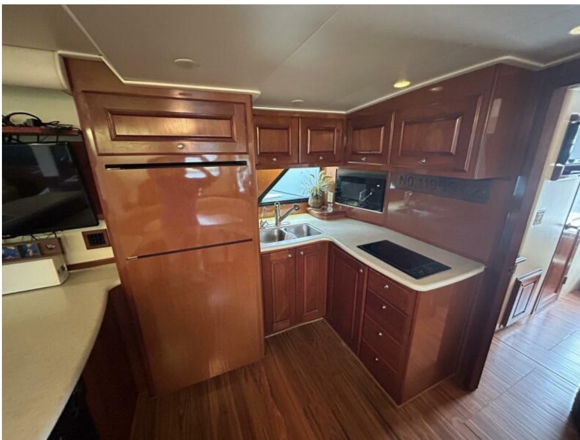
2007 Bluewater Yachts 5200 Custom