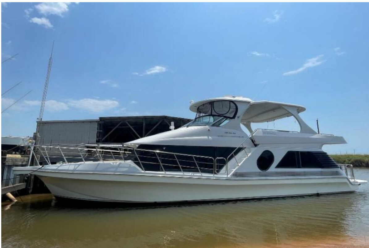
2007 Bluewater Yachts 5200 Custom "And Praise The Lord"