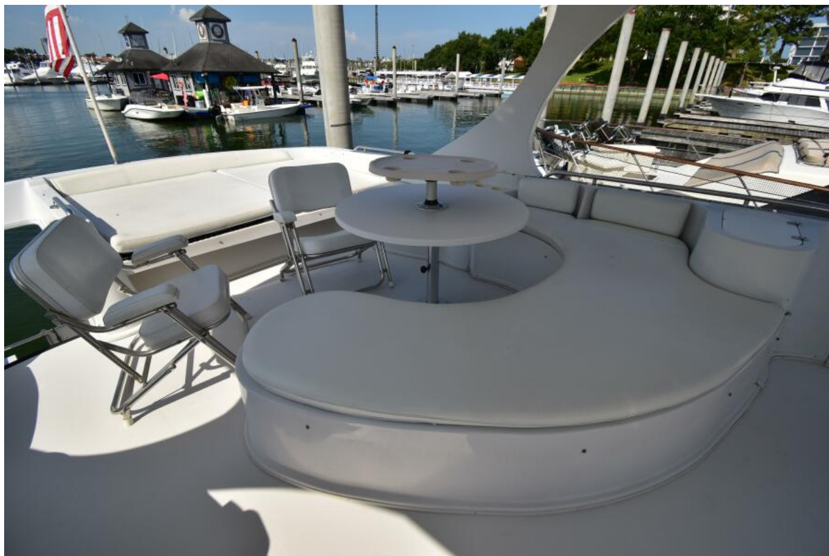
2007 Bluewater Yachts 5200 Custom