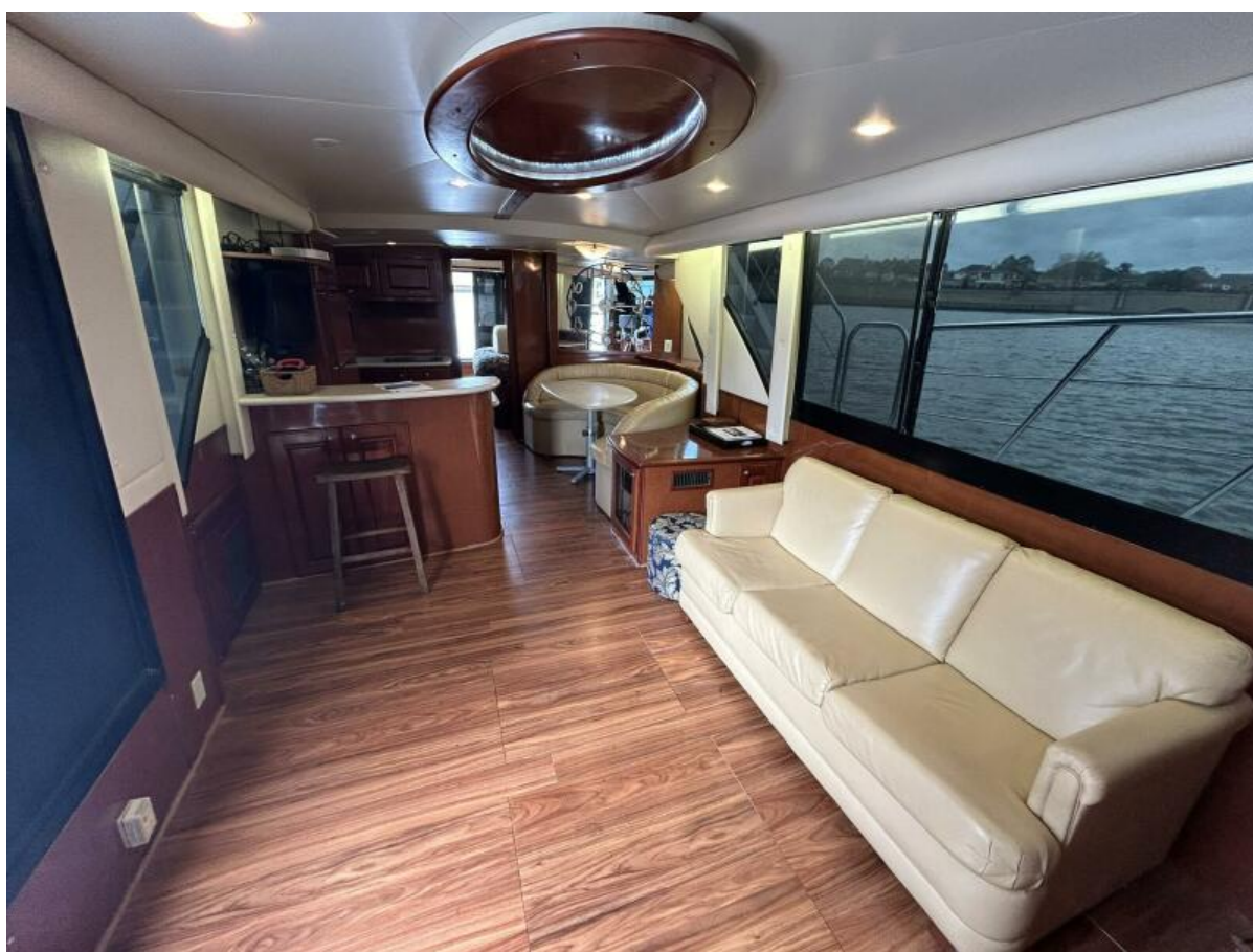
2007 Bluewater Yachts 5200 Custom