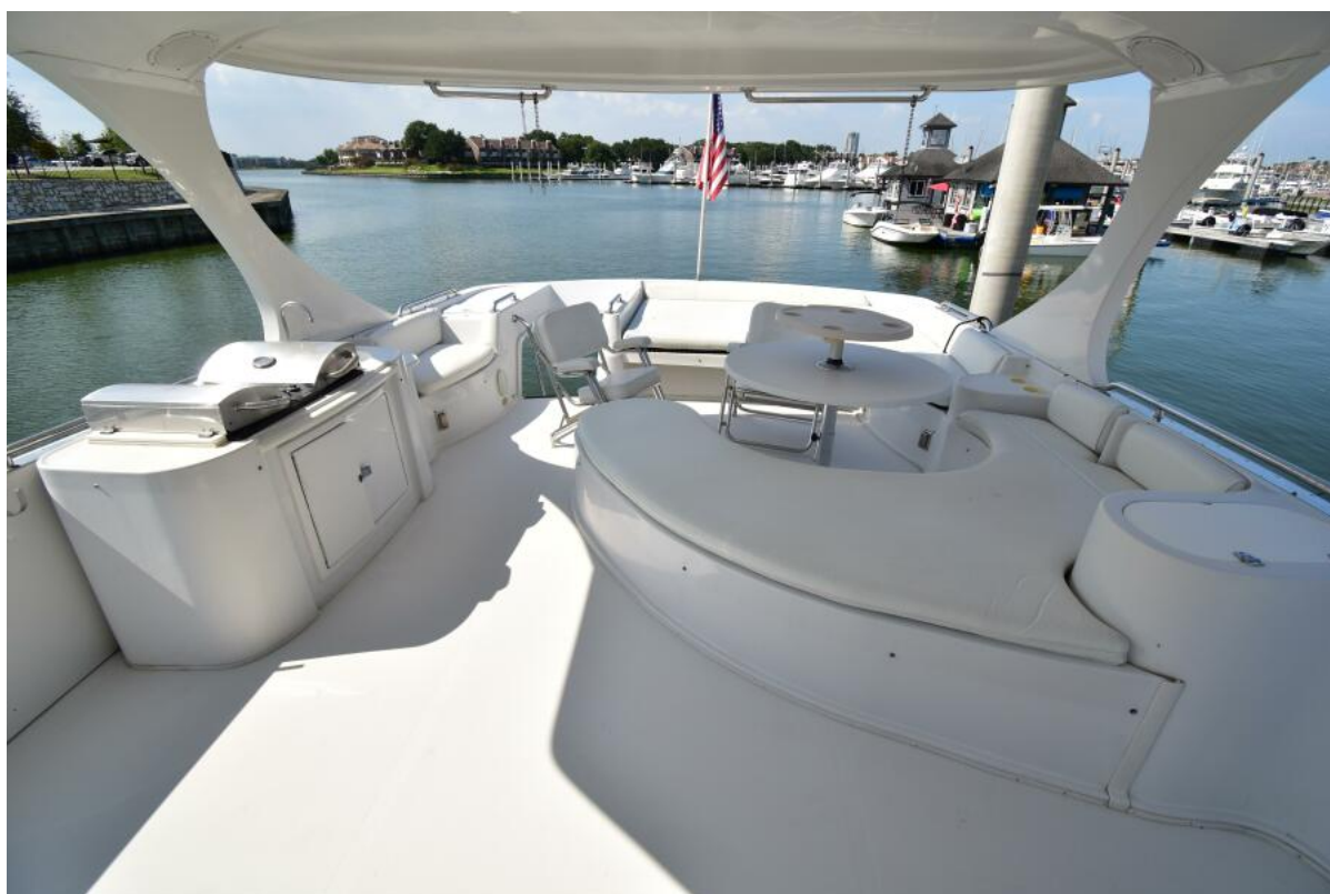
2007 Bluewater Yachts 5200 Custom