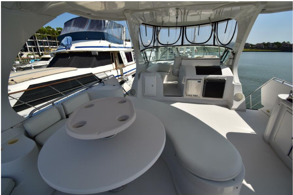
2007 Bluewater Yachts 5200 Custom