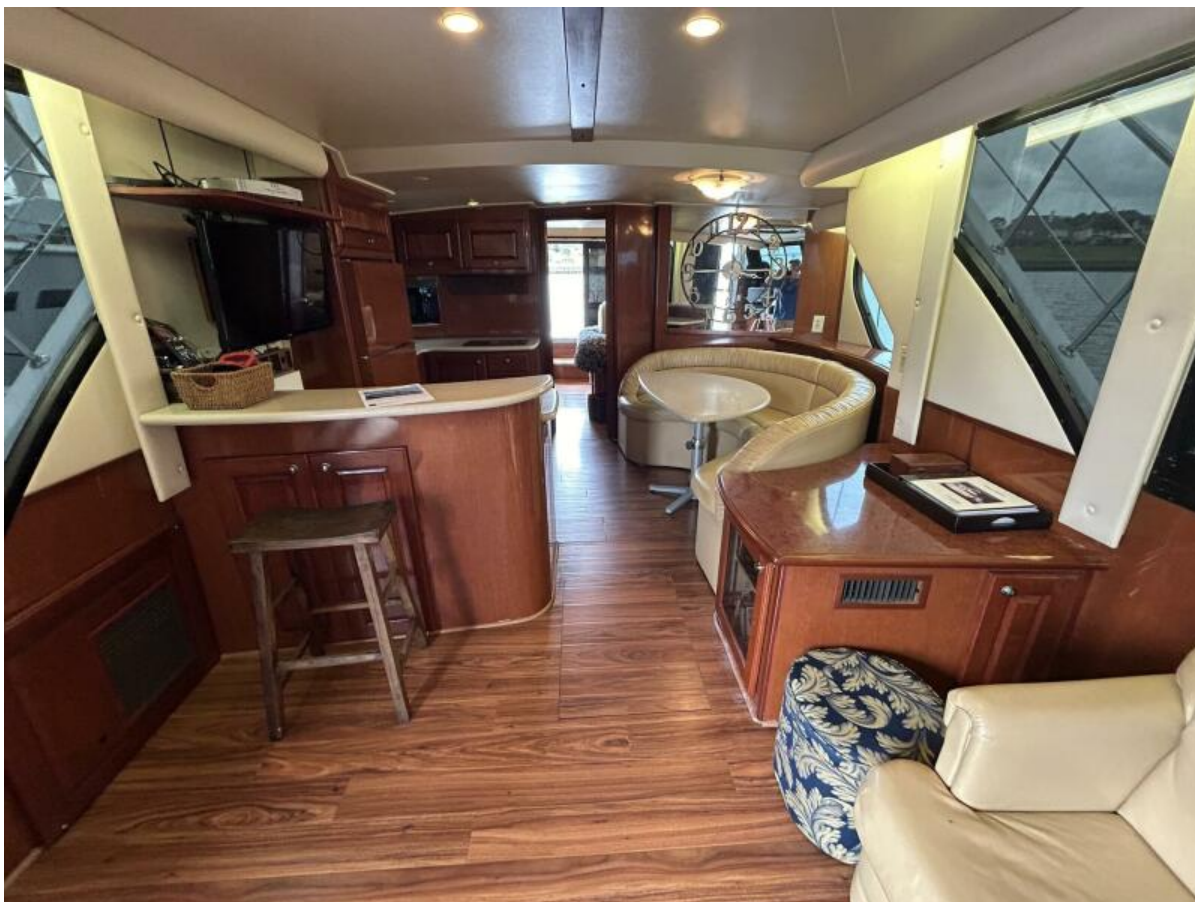
2007 Bluewater Yachts 5200 Custom