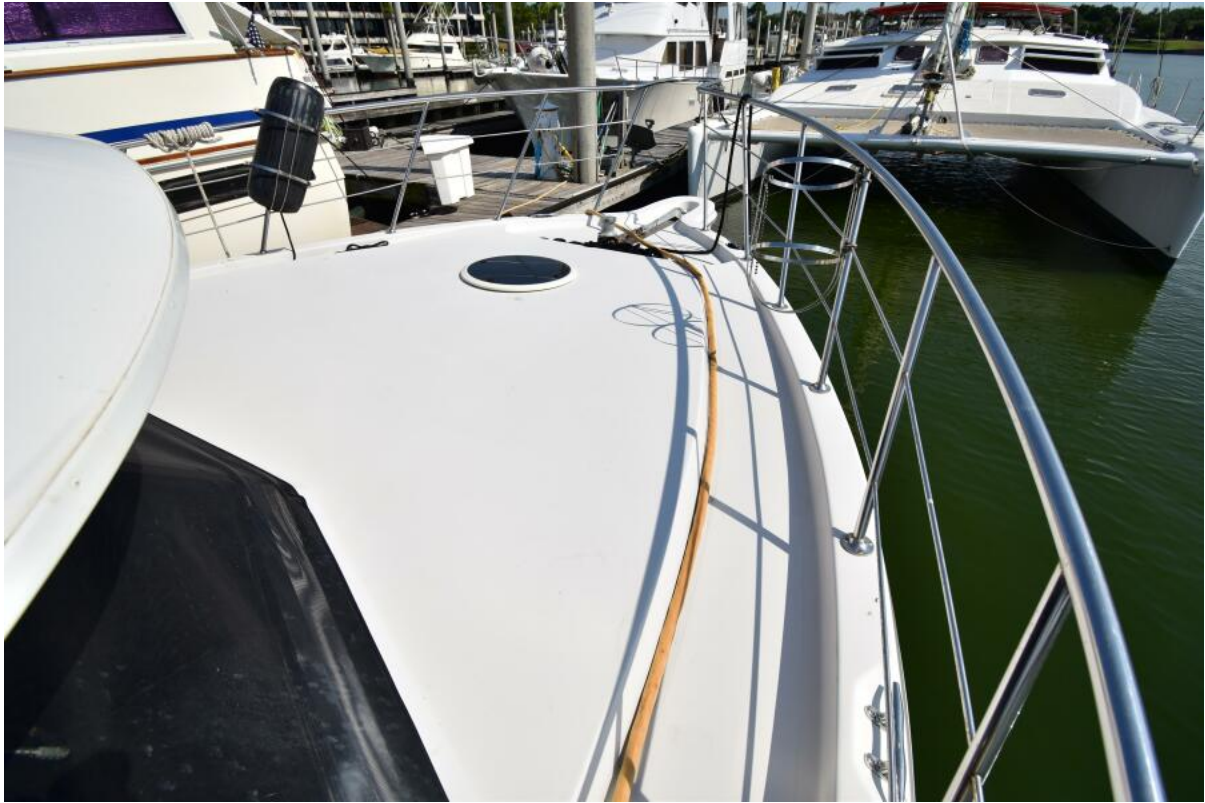
2007 Bluewater Yachts 5200 Custom