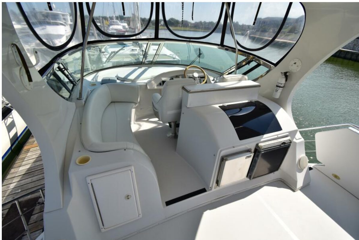
2007 Bluewater Yachts 5200 Custom