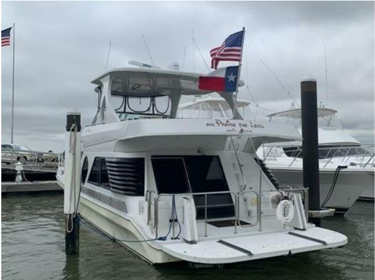
“And Praise the Lord!” is a 2007 Bluewater Yachts 5200 w/Cummins Diesel Power Hydraulic Lift Platform Side Power Bow Thruster Fiberglass Hard Top over Flybridge Three Sided Strata Enclosure Large 2 Stateroom 2 Head Layout Washer/Dryer Combo Only 14’5” to T