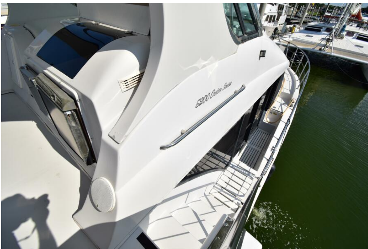
2007 Bluewater Yachts 5200 Custom