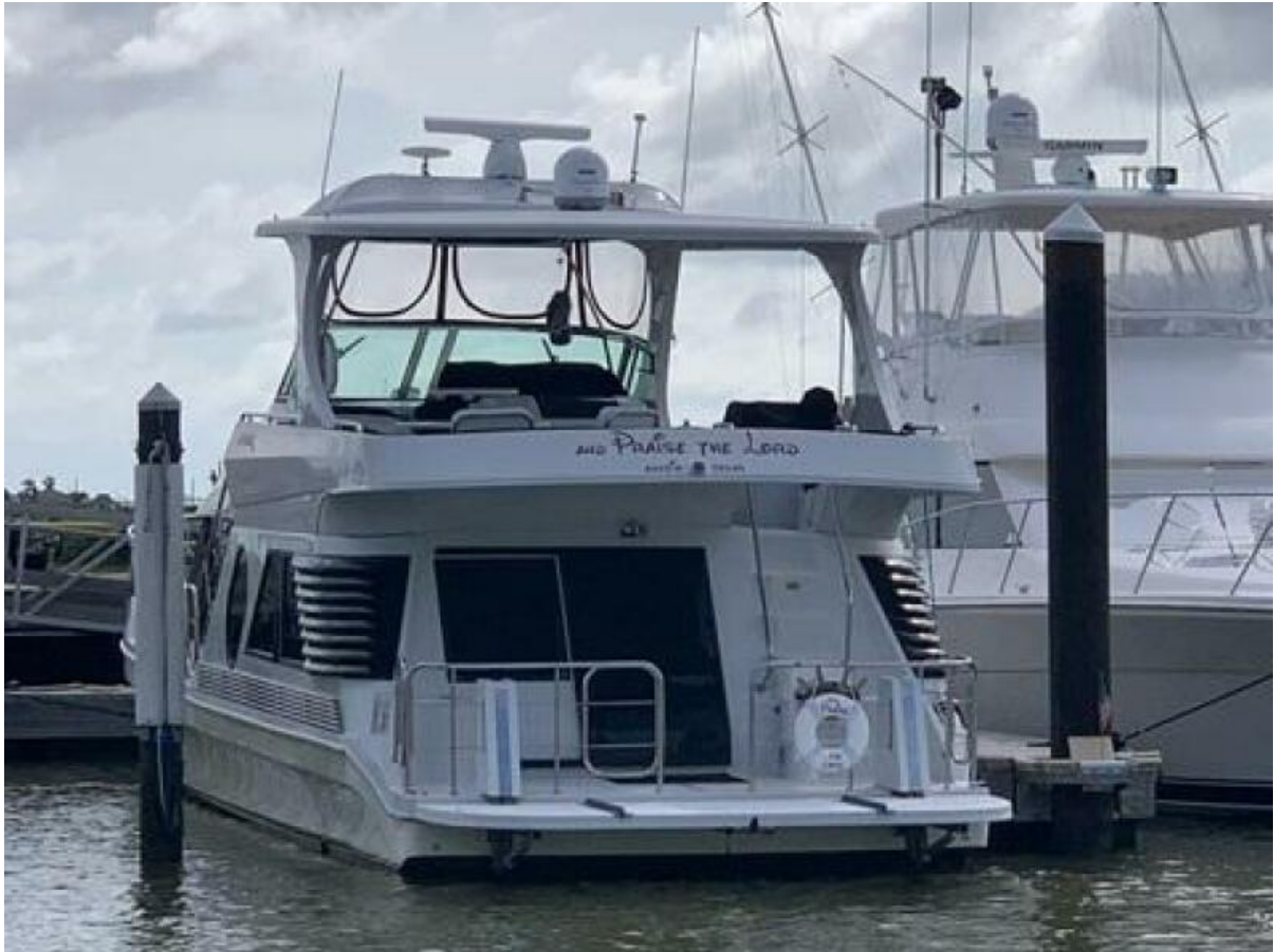
"And Praise the Lord!" is a 2007 Bluewater Yachts 5200 w/Cummins Diesel Power Hydraulic Lift Platform Side Power Bow Thruster Fiberglass Hard Top over Flybridge Three Sided Strata Enclosure Large 2 Stateroom 2 Head Layout Washer/Dryer Combo Only 14'5" to T