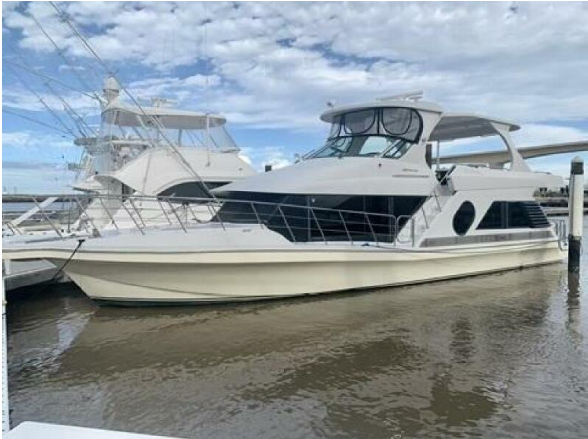
“And Praise the Lord!” is a 2007 Bluewater Yachts 5200 w/Cummins Diesel Power Hydraulic Lift Platform Side Power Bow Thruster Fiberglass Had Top over Flybridge Three Sided Strata Enclosure Large 2 Stateroom 2 Head Layout Washer/Dryer Combo Only 14’5” to T