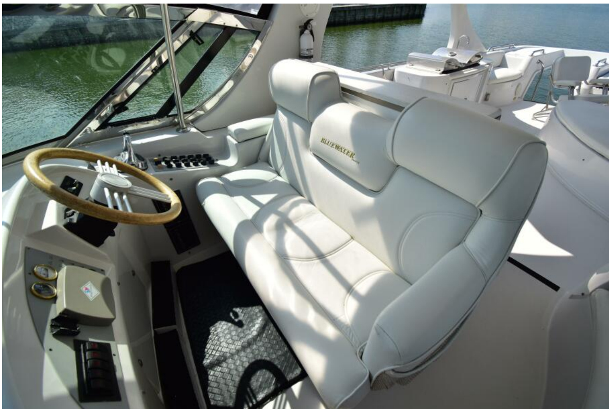
2007 Bluewater Yachts 5200 Custom