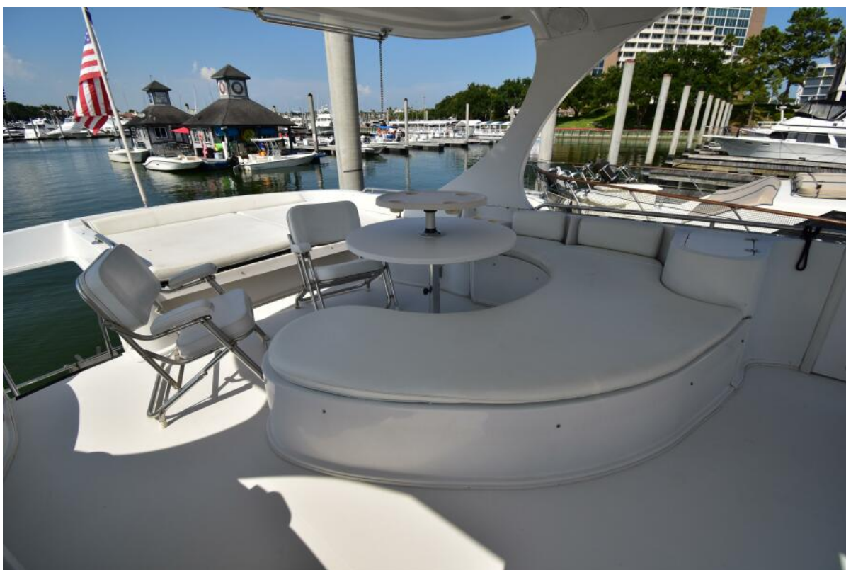
2007 Bluewater Yachts 5200 Custom