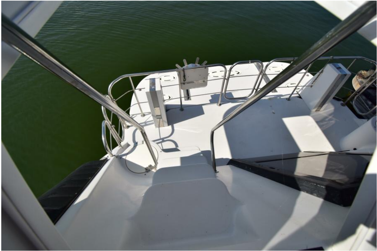
2007 Bluewater Yachts 5200 Custom