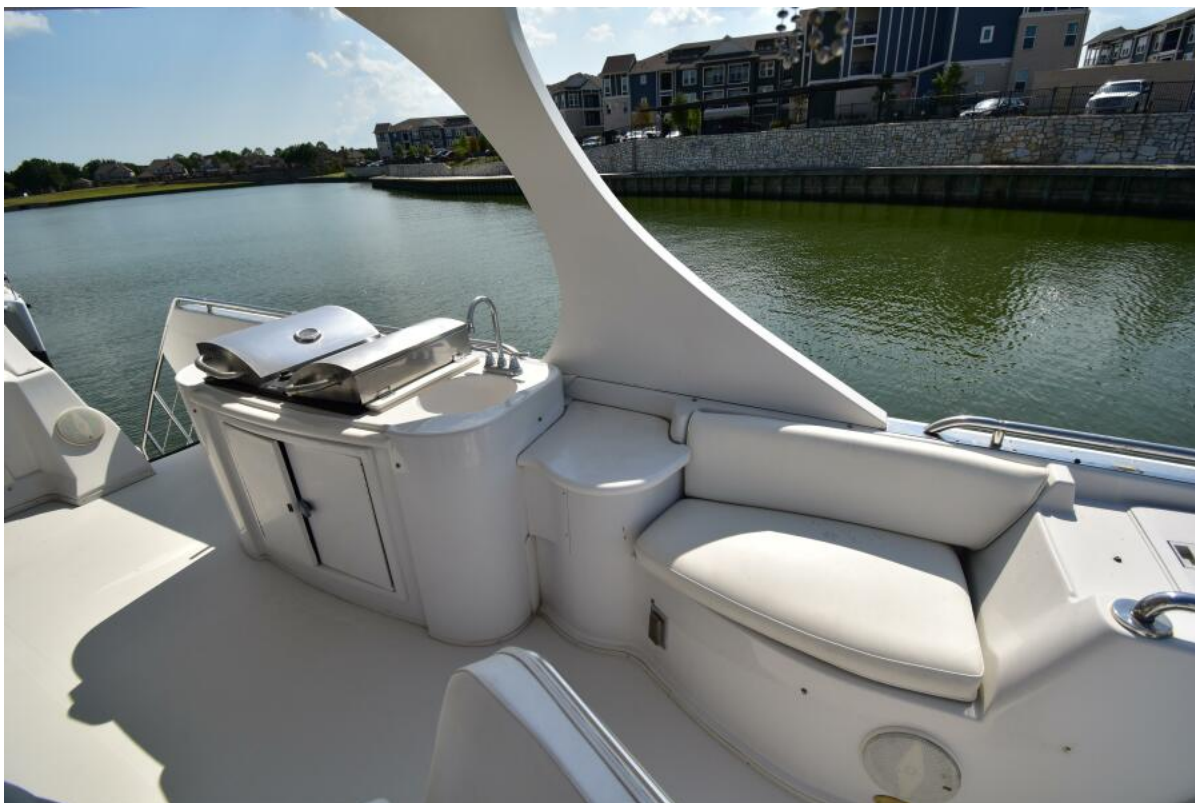
2007 Bluewater Yachts 5200 Custom