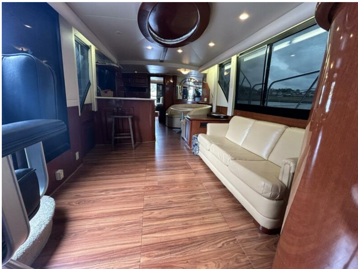
2007 Bluewater Yachts 5200 Custom