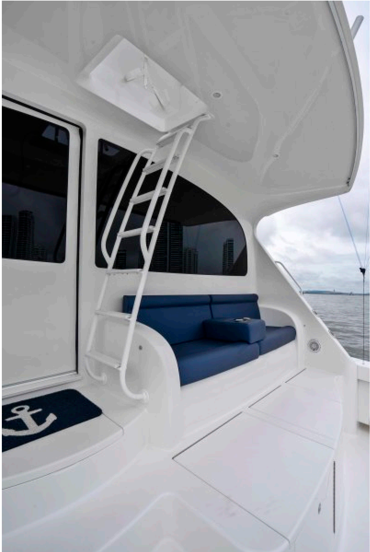
2011 Viking 70 Enclosed Bridge - Last Call - Cockpit to Bridge