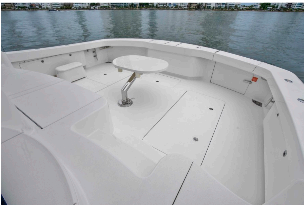
2011 Viking 70 Enclosed Bridge - Last Call - Cockpit