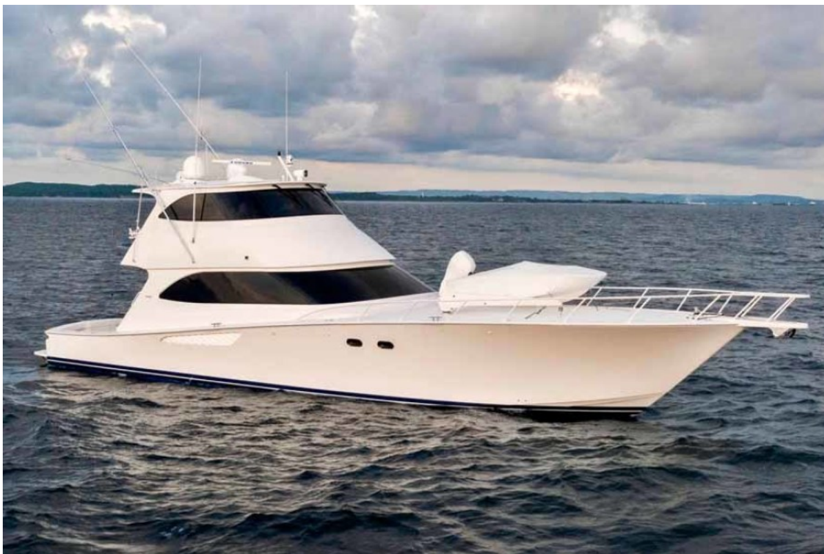
2011 Viking 70 Enclosed Bridge - Last Call