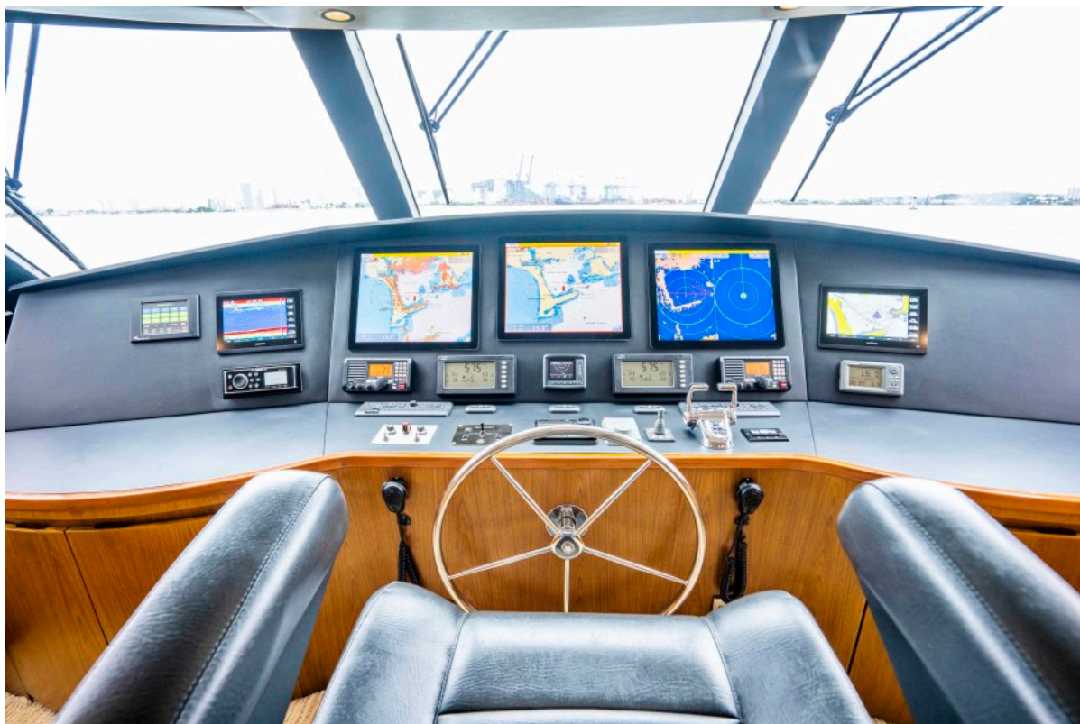
2011 Viking 70 Enclosed Bridge - Last Call - Enclosed Bridge