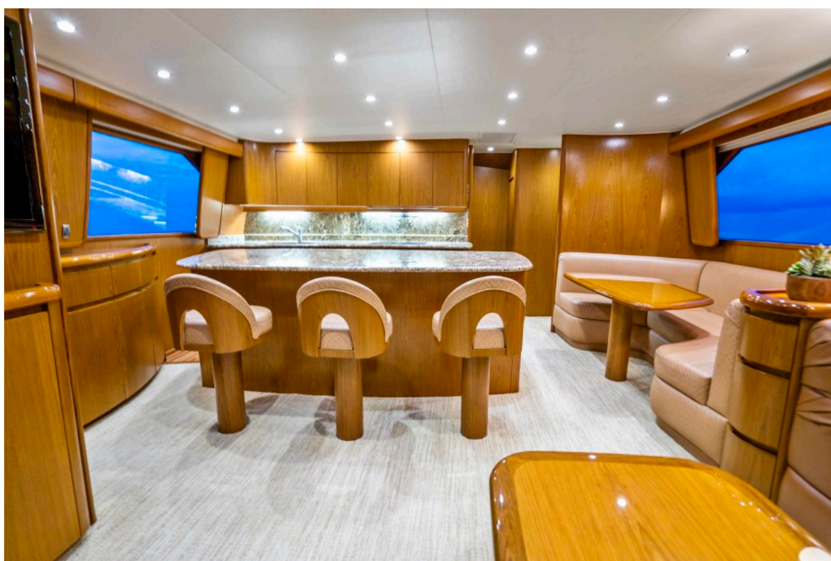
2011 Viking 70 Enclosed Bridge - Last Call - Salon