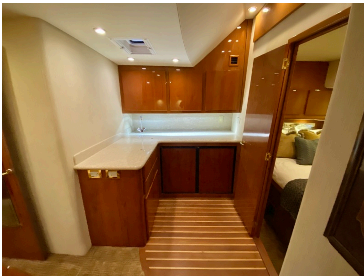
2007 Buddy Davis 52 Express