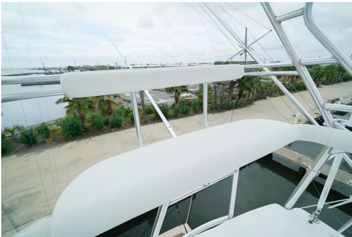
2007 Buddy Davis 52 Express