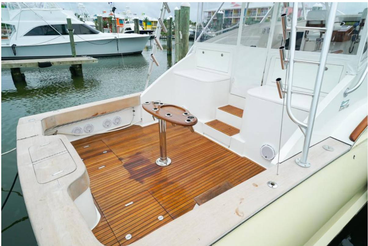
2007 Buddy Davis 52 Express