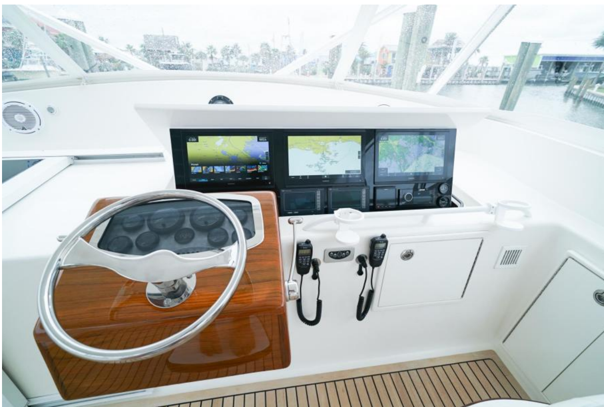
2007 Buddy Davis 52 Express