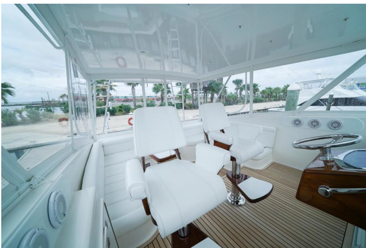
2007 Buddy Davis 52 Express