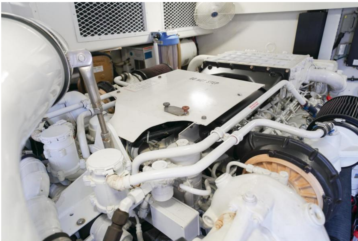
2007 Buddy Davis 52 Express