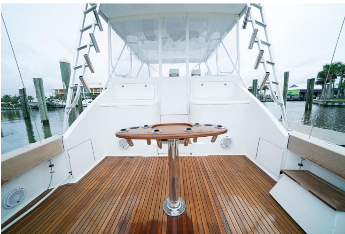
2007 Buddy Davis 52 Express