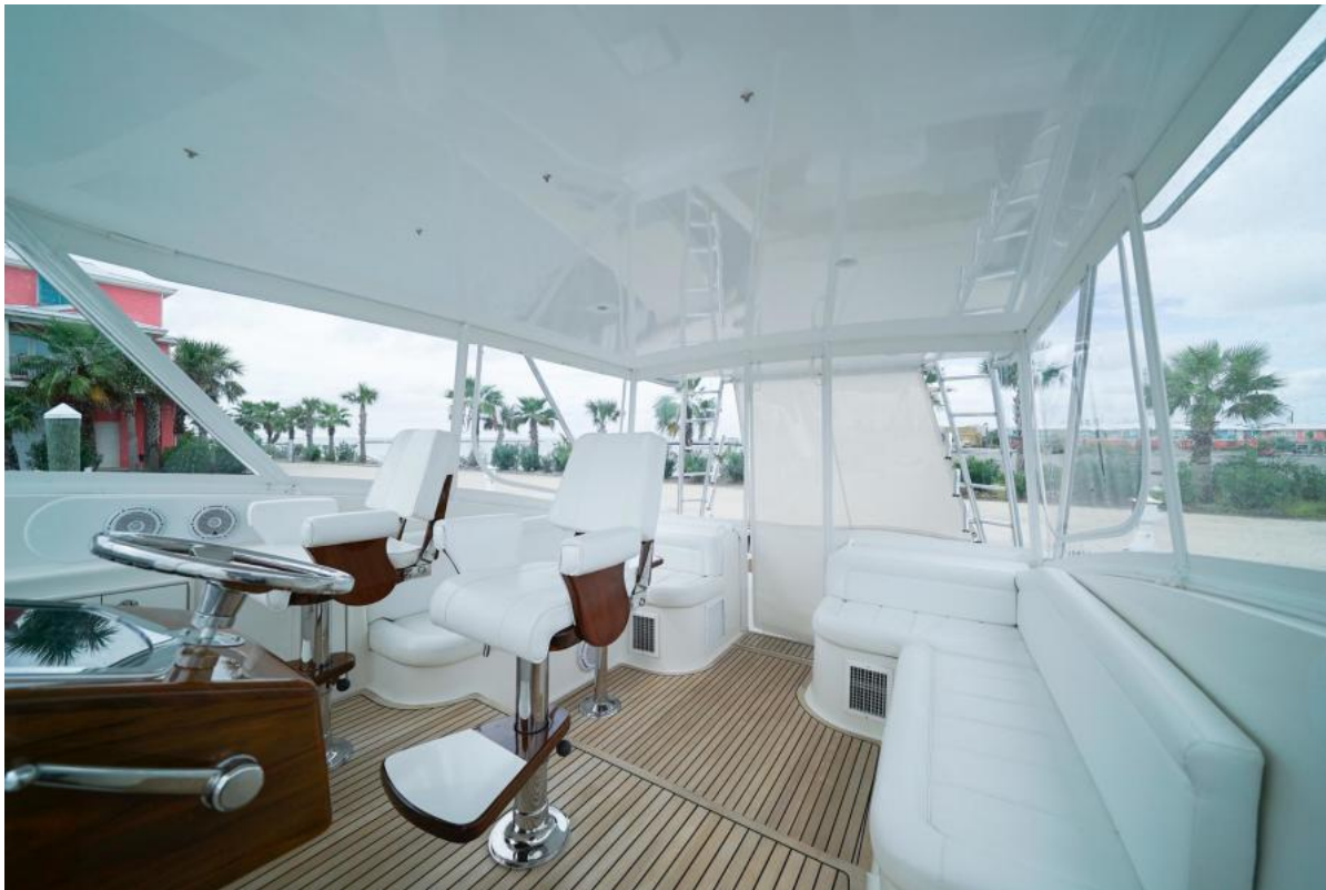
2007 Buddy Davis 52 Express