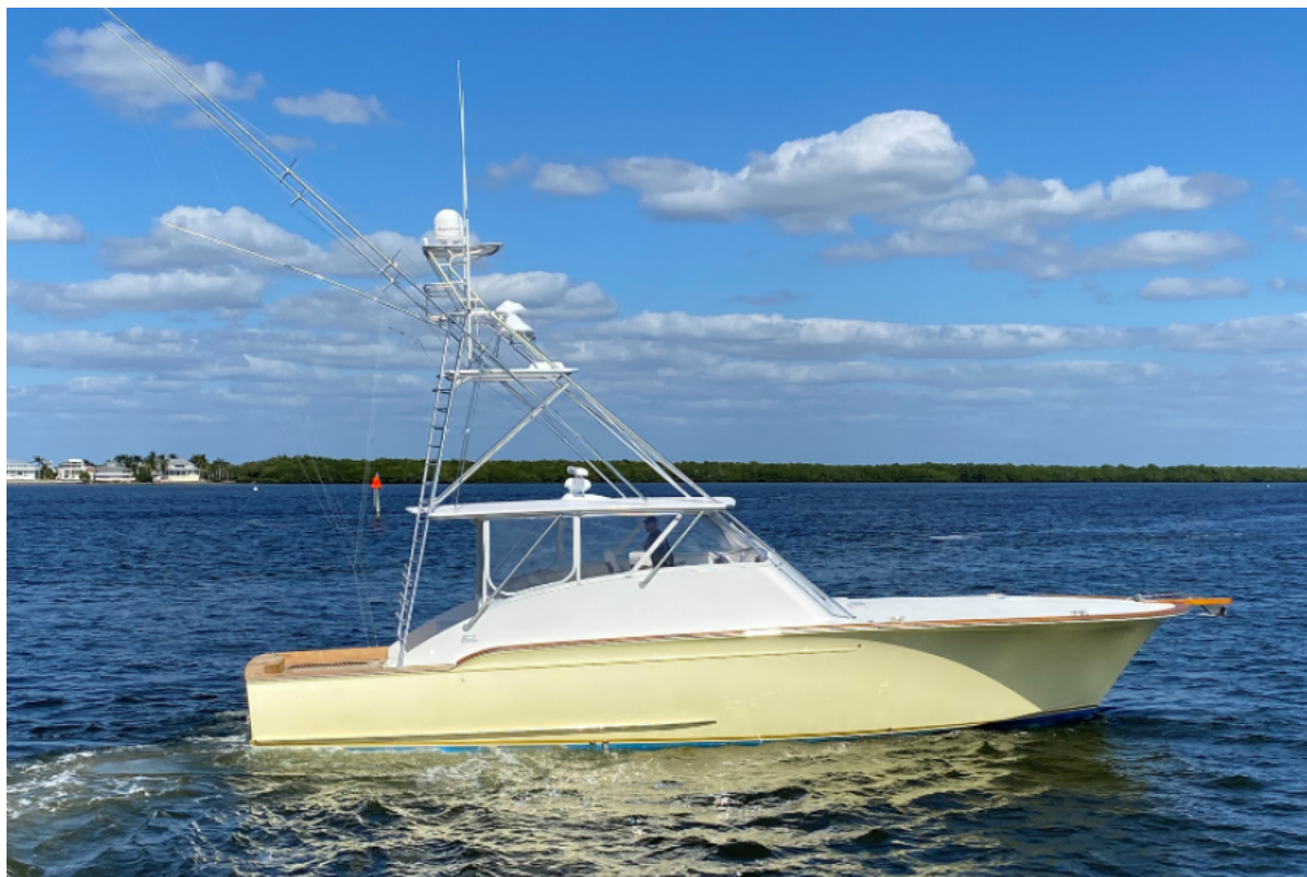
2007 Buddy Davis 52 Express