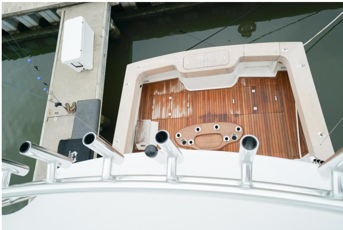
2007 Buddy Davis 52 Express