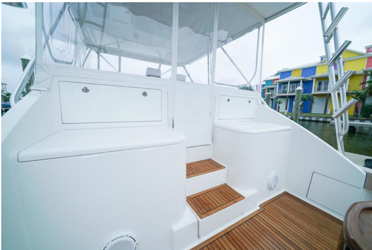
2007 Buddy Davis 52 Express