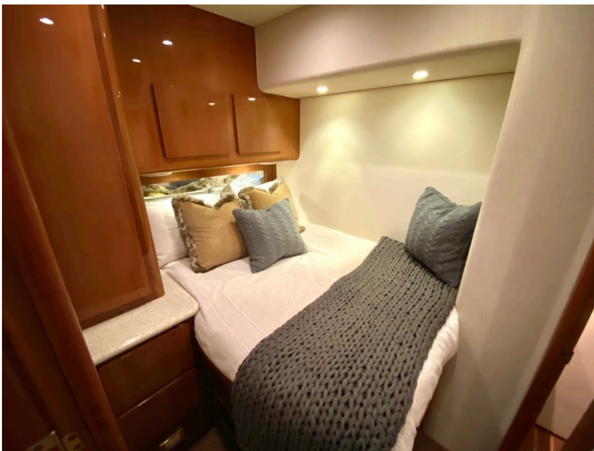
2007 Buddy Davis 52 Express