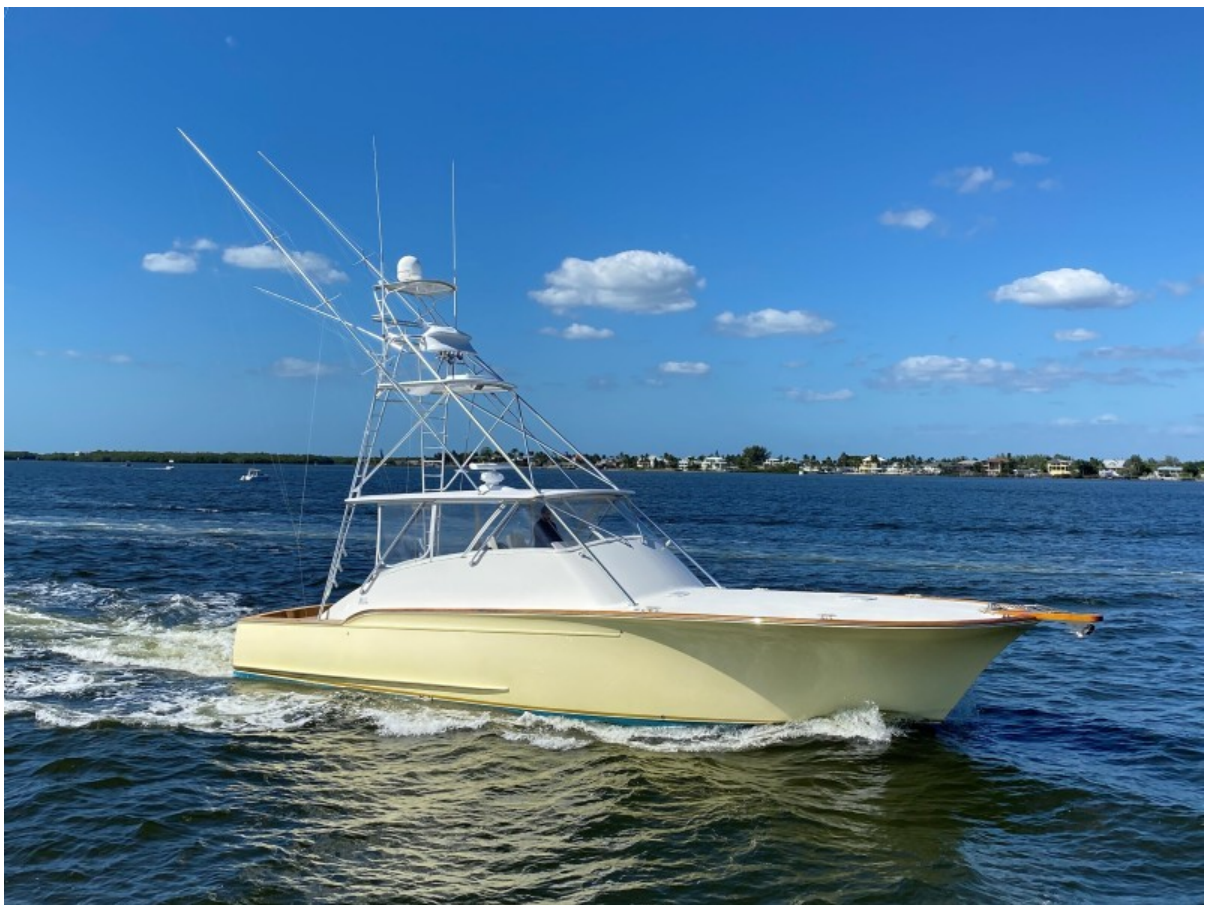
2007 Buddy Davis 52 Express