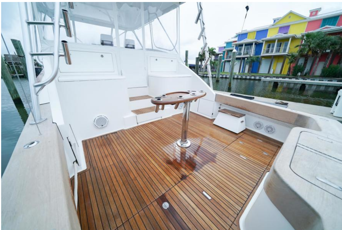
2007 Buddy Davis 52 Express