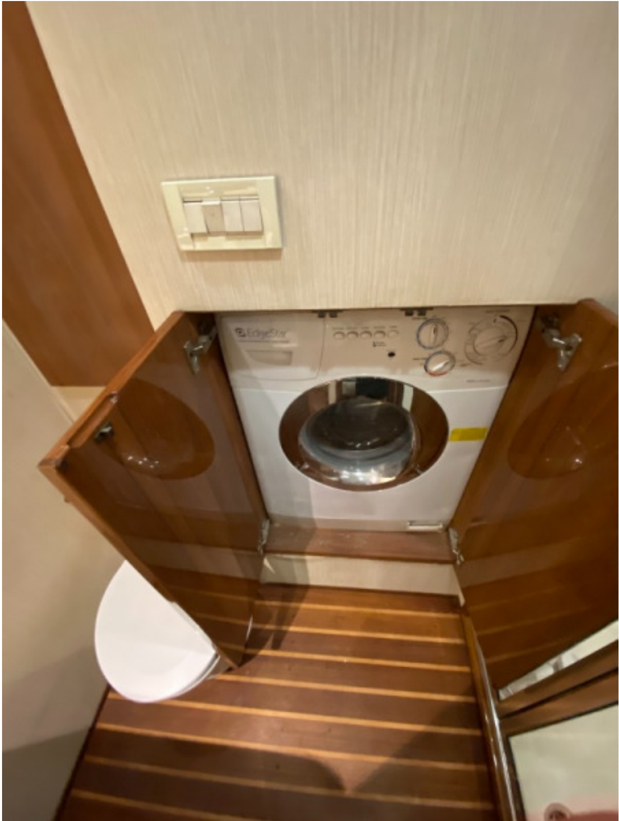
2007 Buddy Davis 52 Express