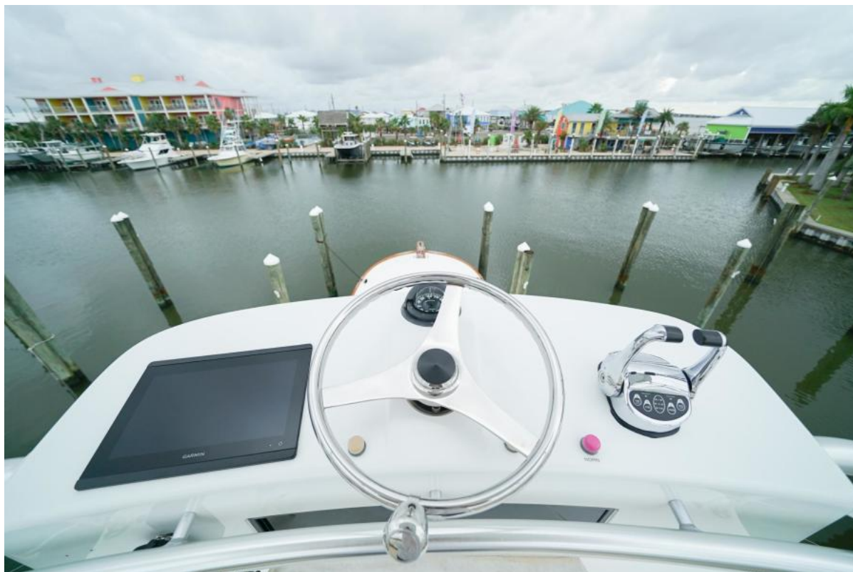
2007 Buddy Davis 52 Express