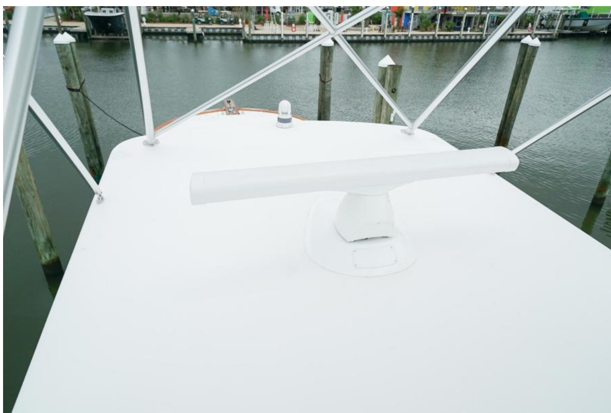
2007 Buddy Davis 52 Express