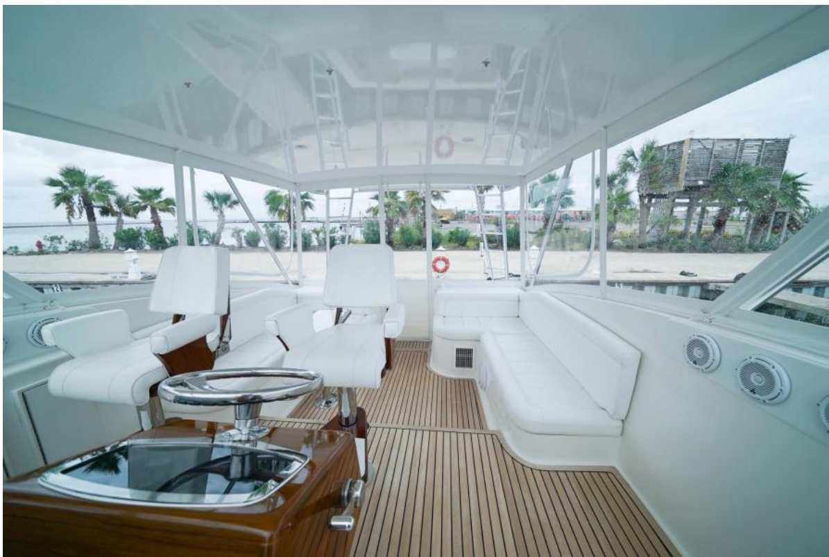
2007 Buddy Davis 52 Express