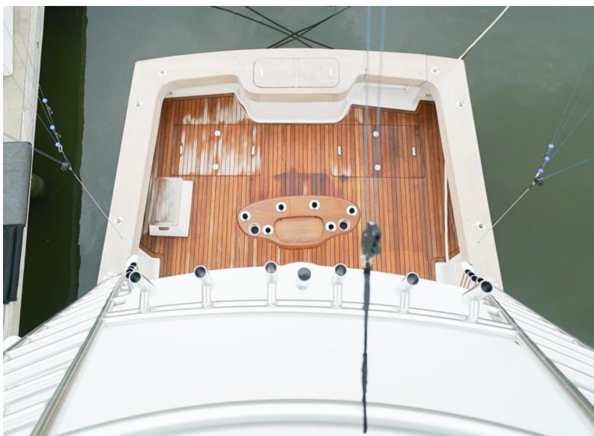
2007 Buddy Davis 52 Express