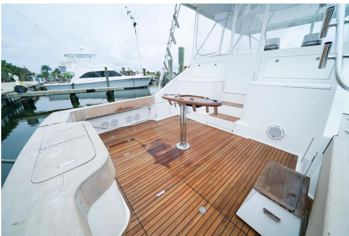
2007 Buddy Davis 52 Express