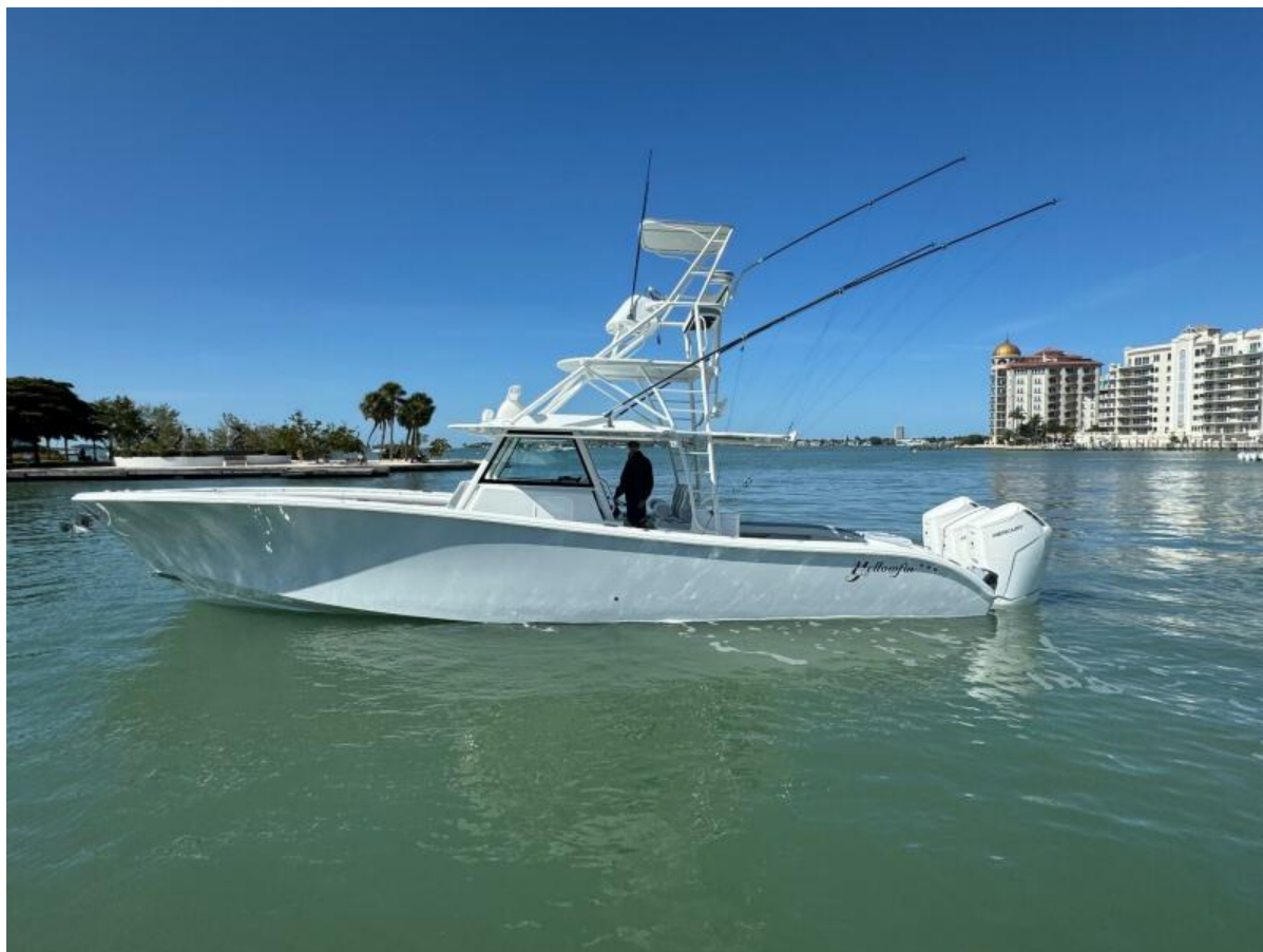
2022 Yellowfin 42 Center Console