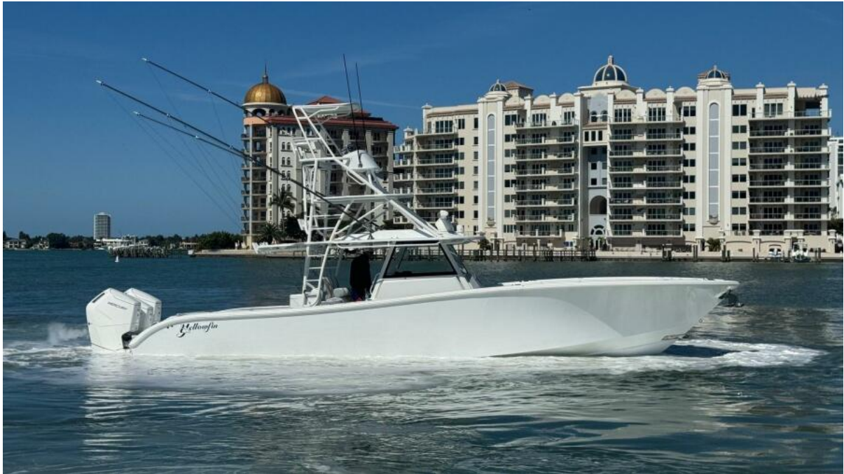
2022 Yellowfin 42 Center Console