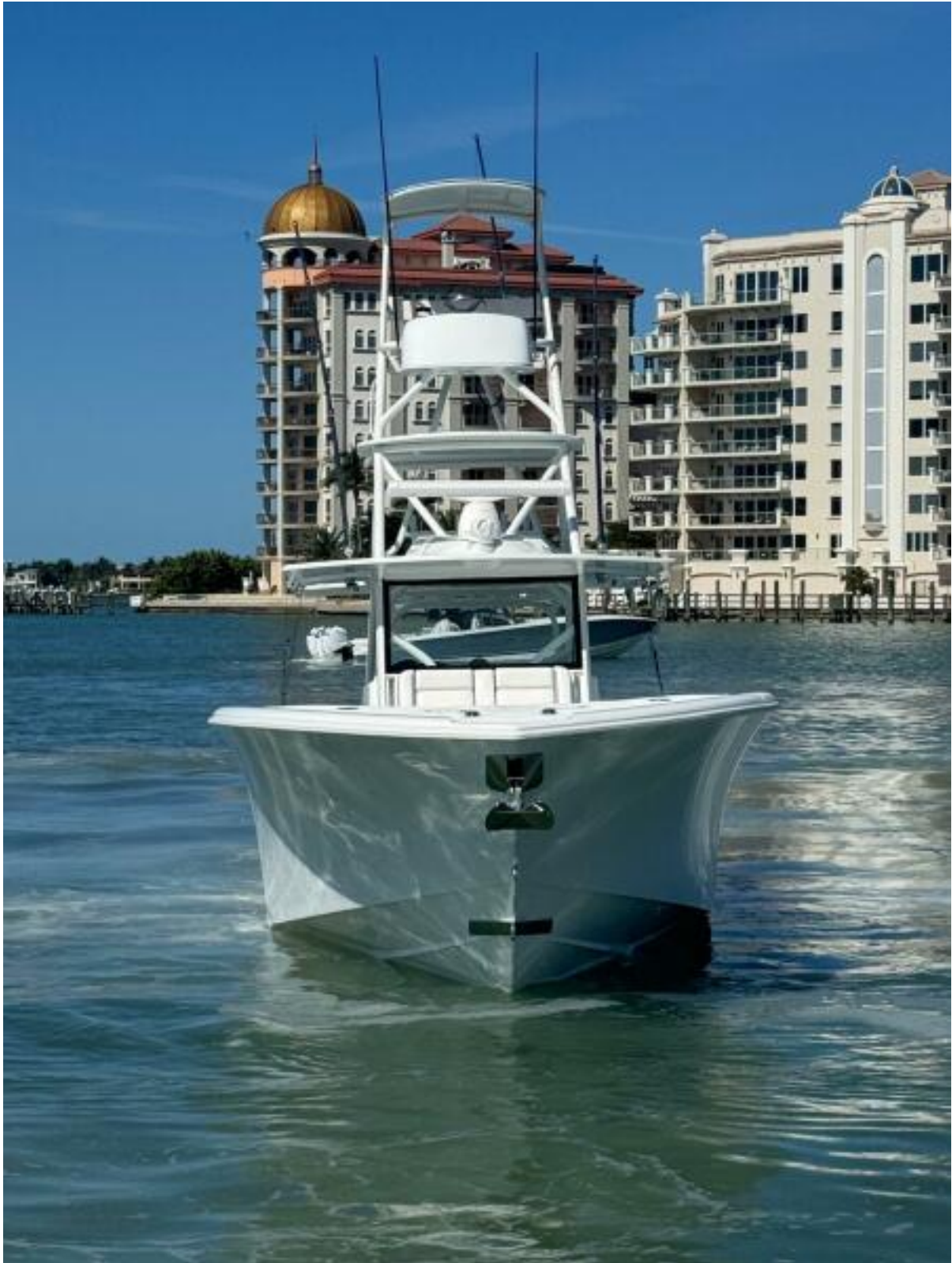
2022 Yellowfin 42 Center Console Tower & Bow Towing Eye