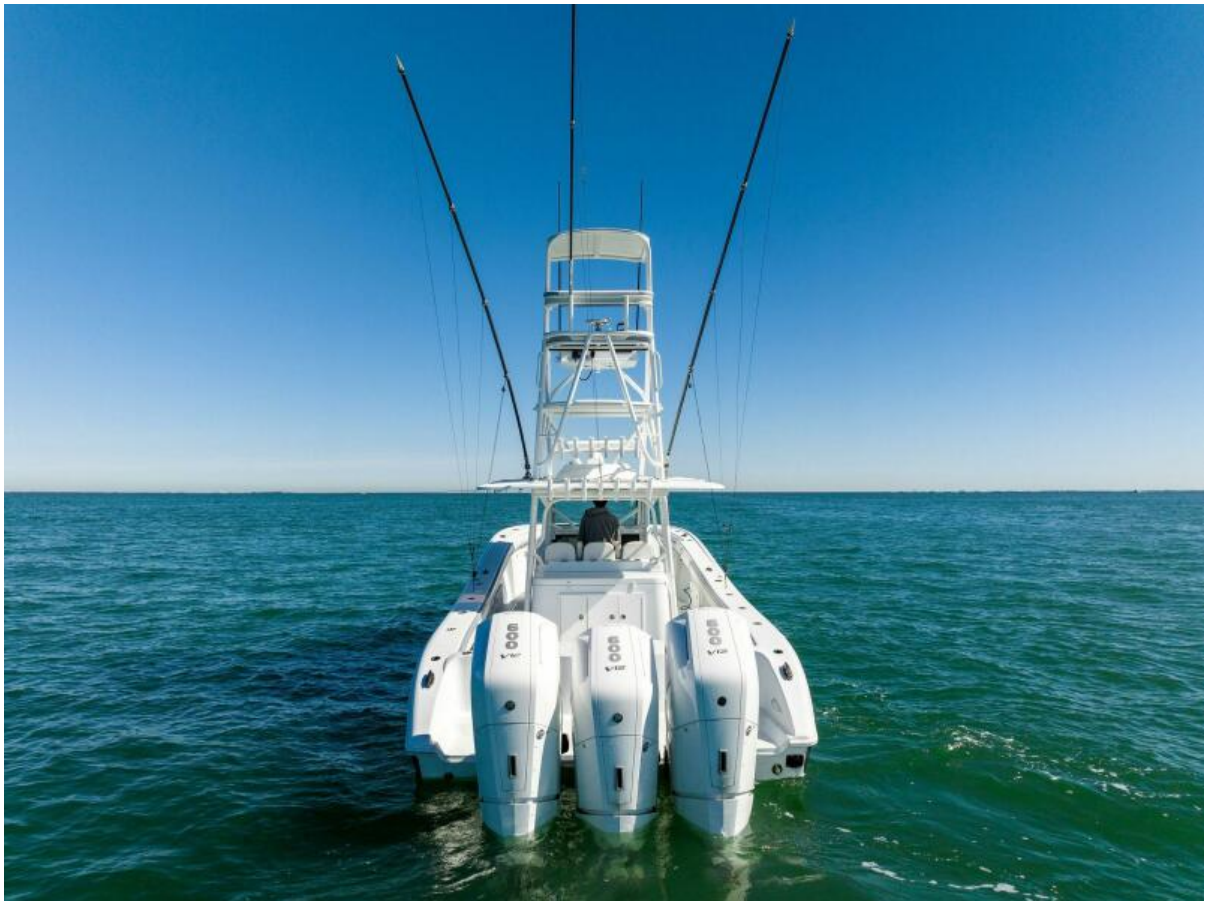
2022 Yellowfin 42 Center Console Triple Mercury 600s