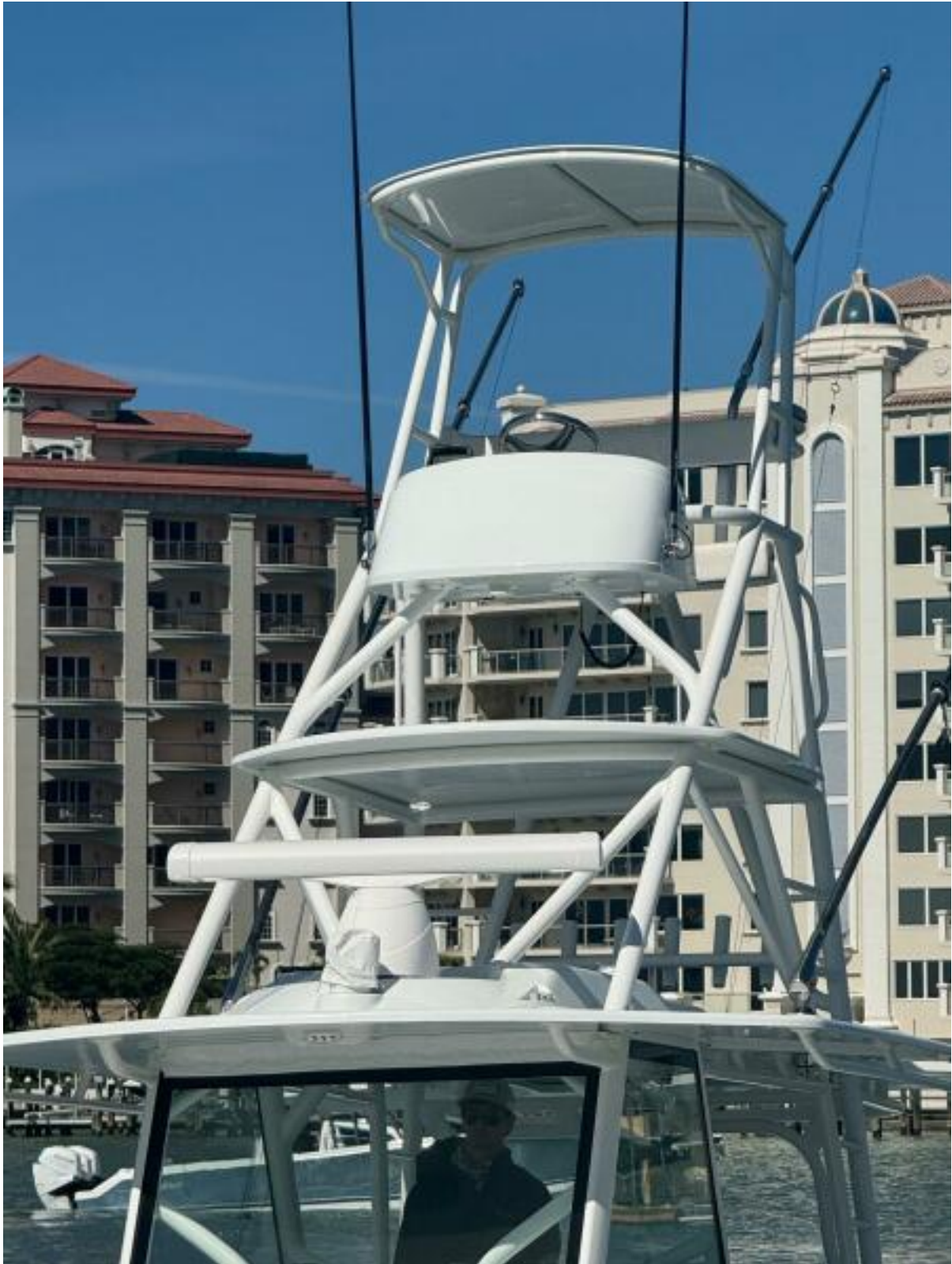
2022 Yellowfin 42 Center Console Tower