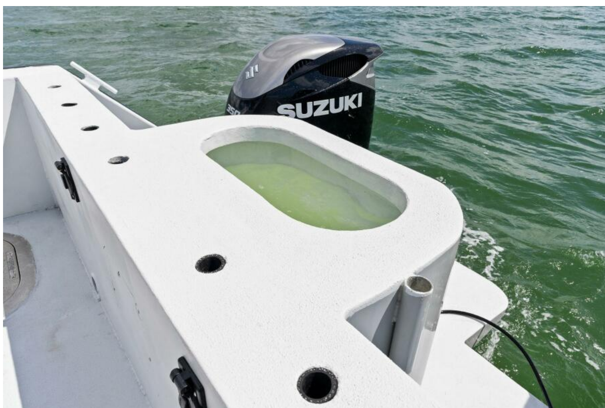
2015 Fin Cat 40 Catamaran 'Double Nickel' Stern