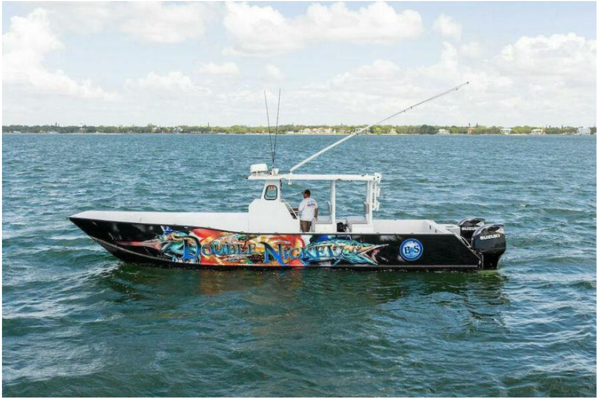
2015 Fin Cat 40 Catamaran 'Double Nickel'