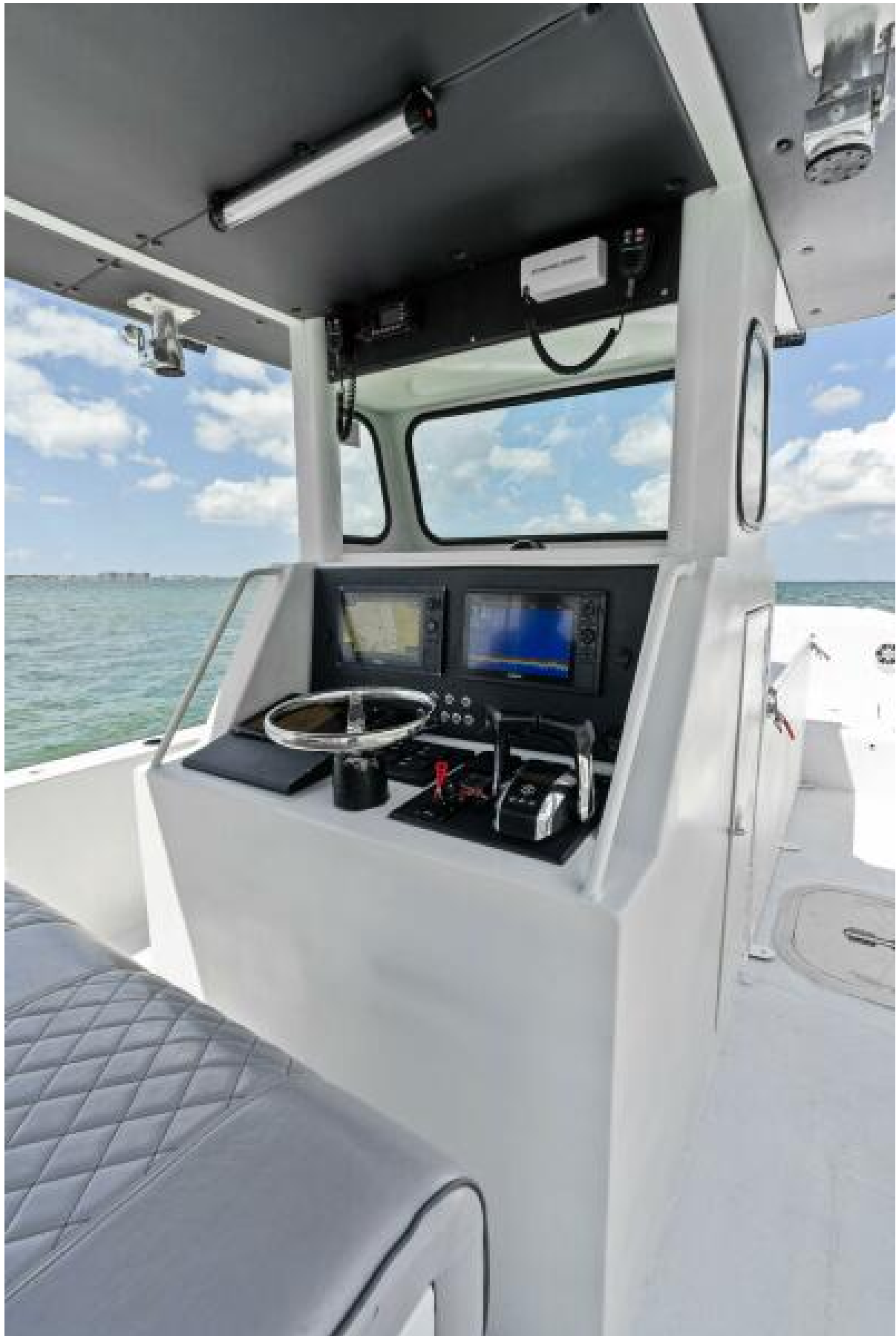
2015 Fin Cat 40 Catamaran 'Double Nickel' Helm