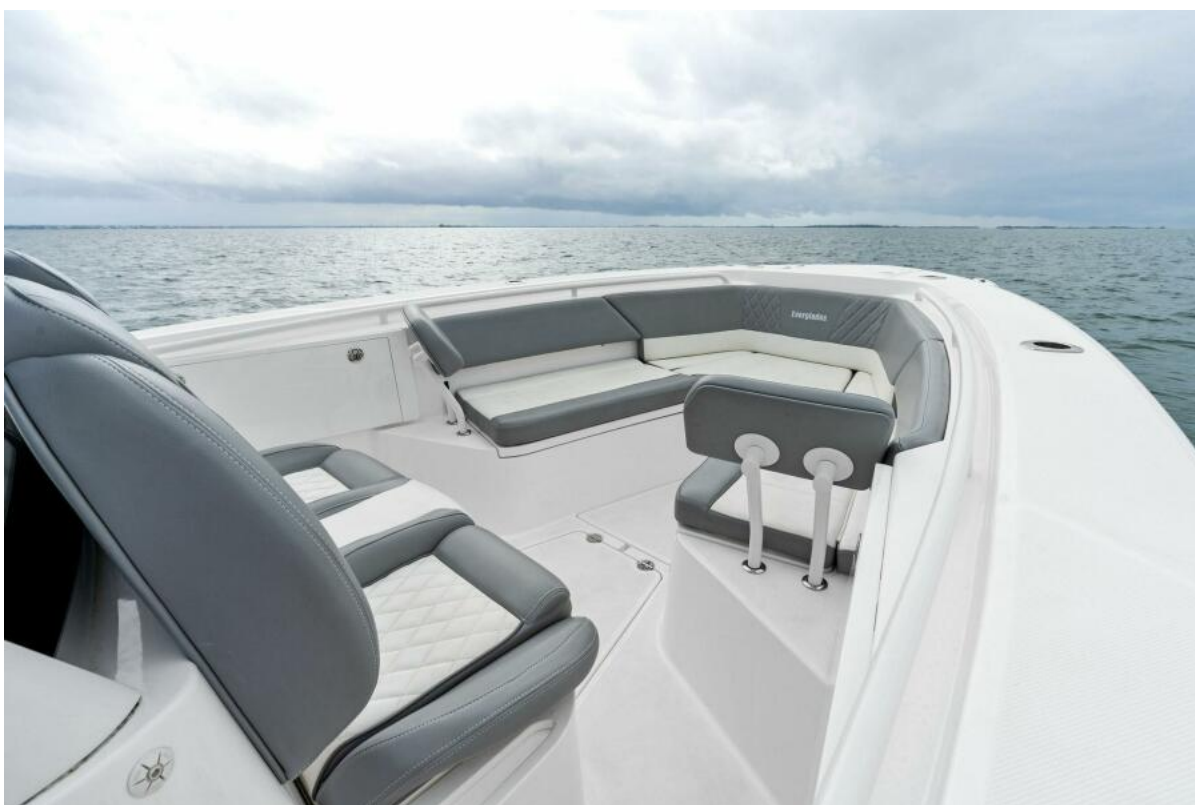
2022 Everglades 335 'Sisu' Bow