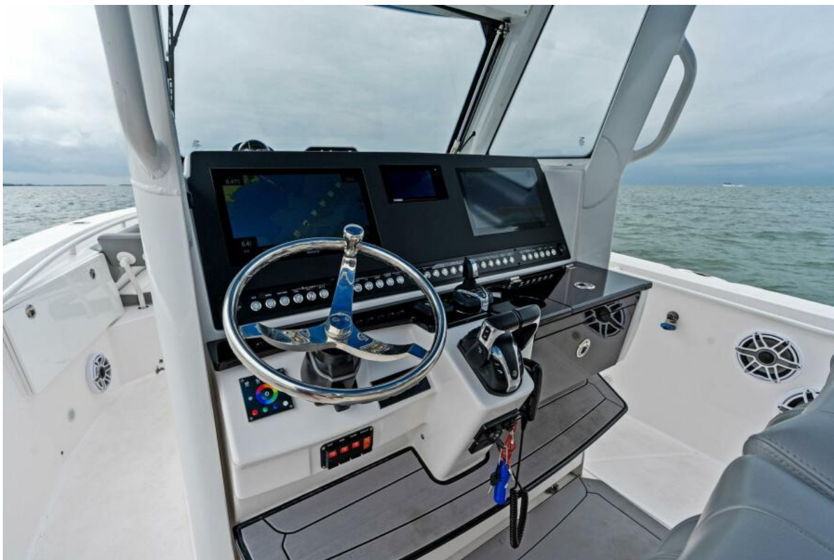
2022 Everglades 335 'Sisu' Helm