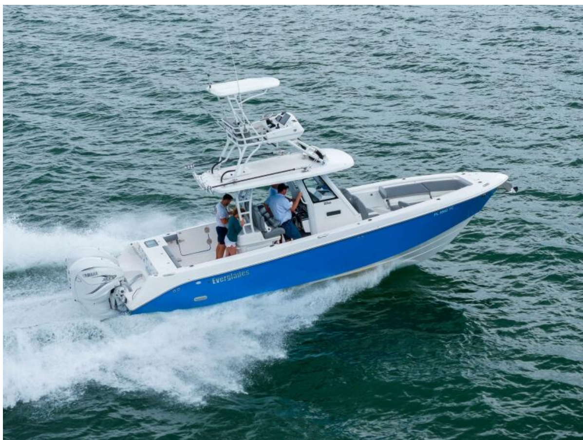
2022 Everglades 335 'Sisu'