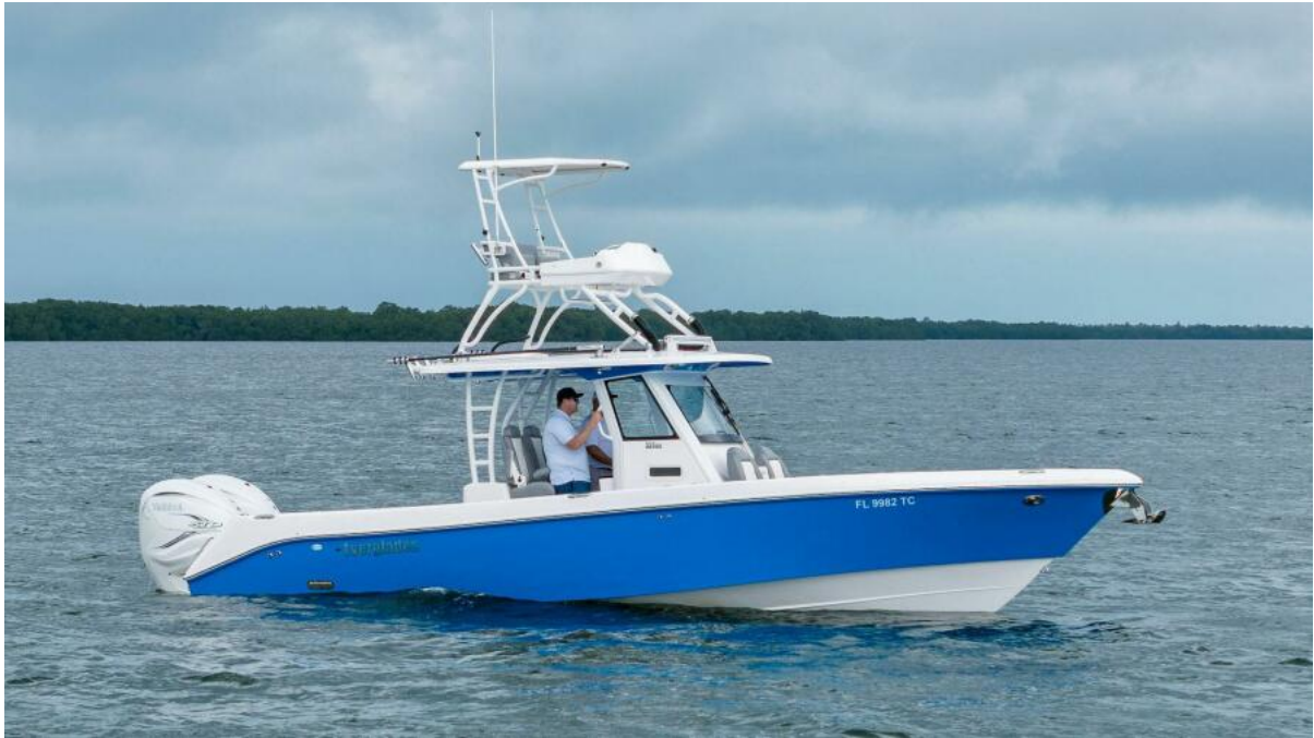
2022 Everglades 335 'Sisu'