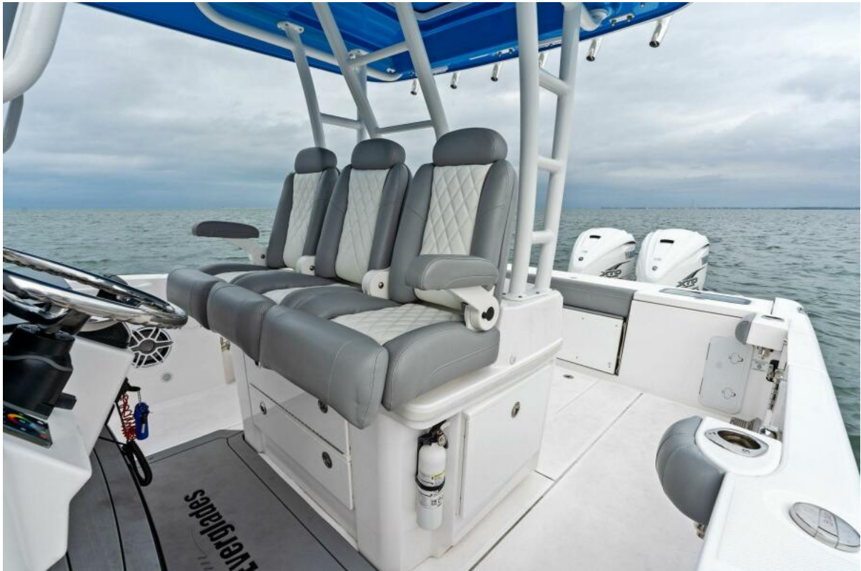
2022 Everglades 335 'Sisu' Console Seating