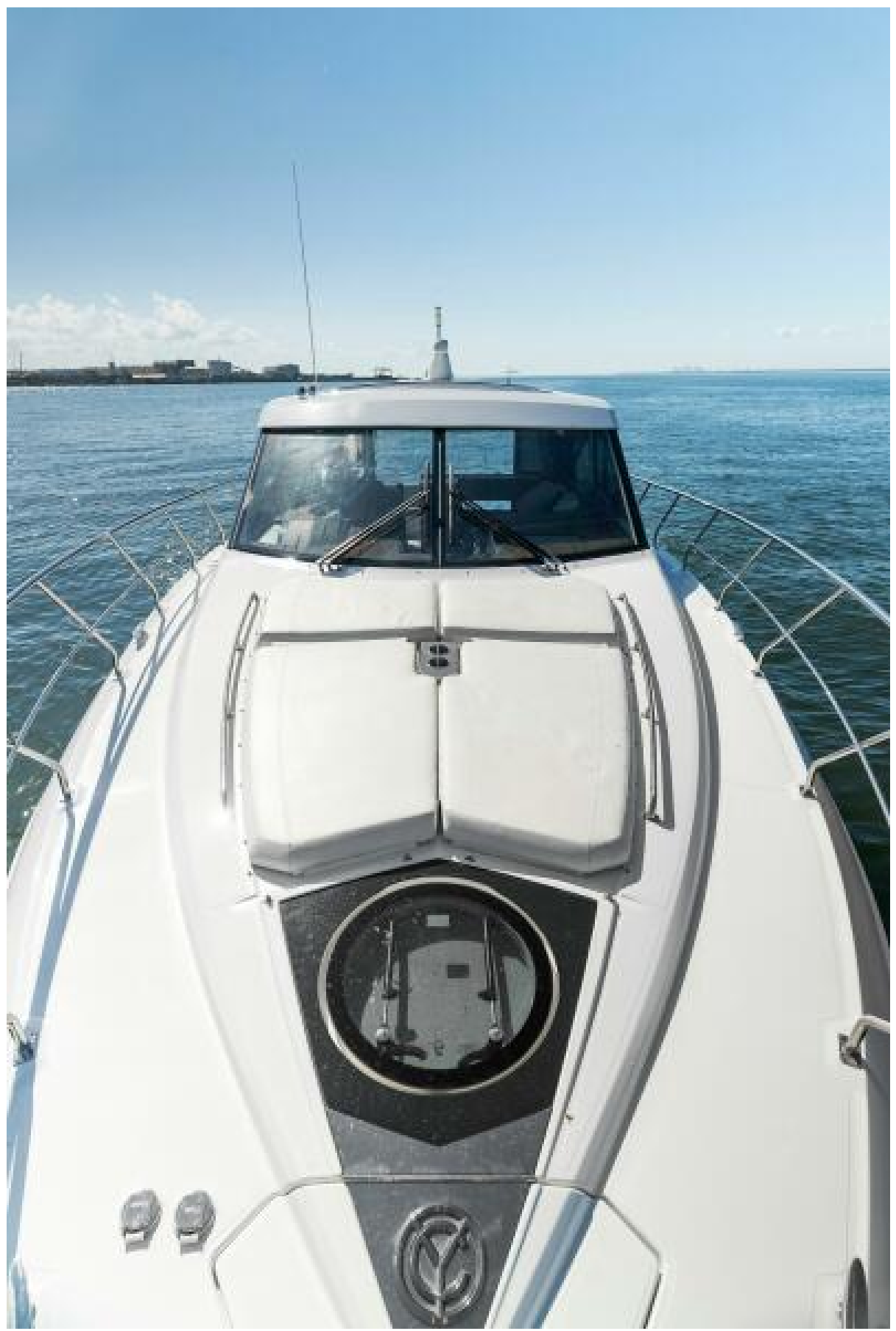
2018 Cruisers 45 Cantius 'Royal Speerit III' Bow