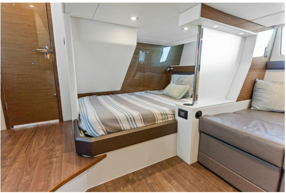
2018 Cruisers 45 Cantius 'Royal Speerit III' Aft Stateroom