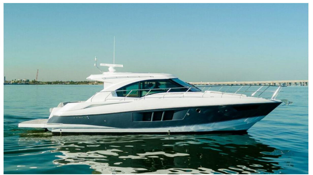
2018 Cruisers 45 Cantius 'Royal Speerit III'