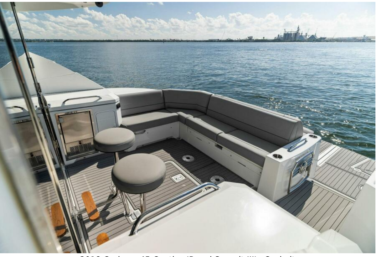
2018 Cruisers 45 Cantius 'Royal Speerit III' Cockpit