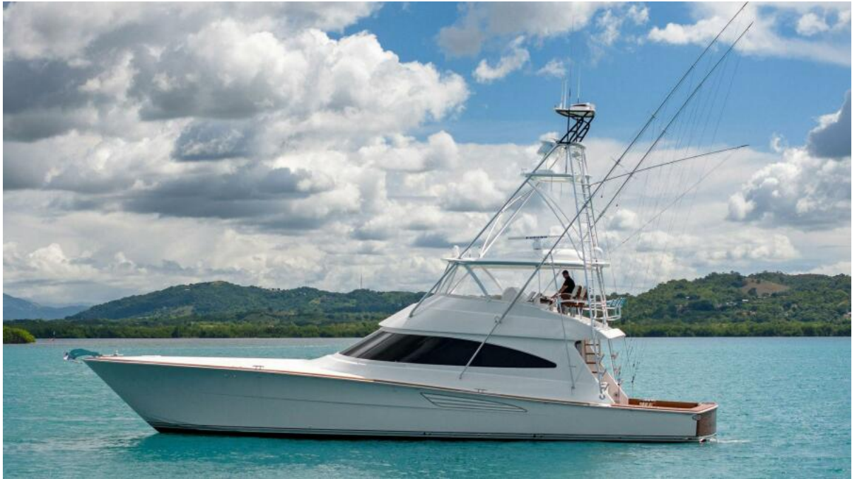
2021 Viking 68 Convertible 'Plan B'