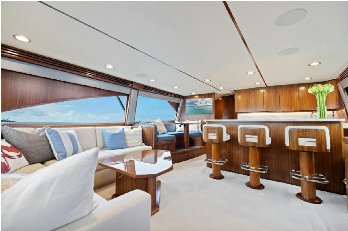
2021 Viking 68 Convertible 'Plan B' Salon