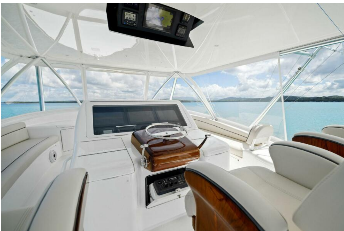
2021 Viking 68 Convertible 'Plan B' Flybridge