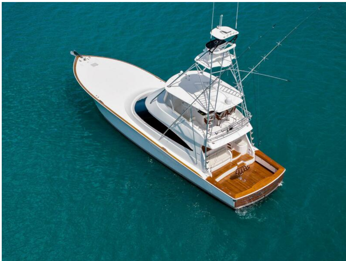
2021 Viking 68 Convertible 'Plan B' Aerial View