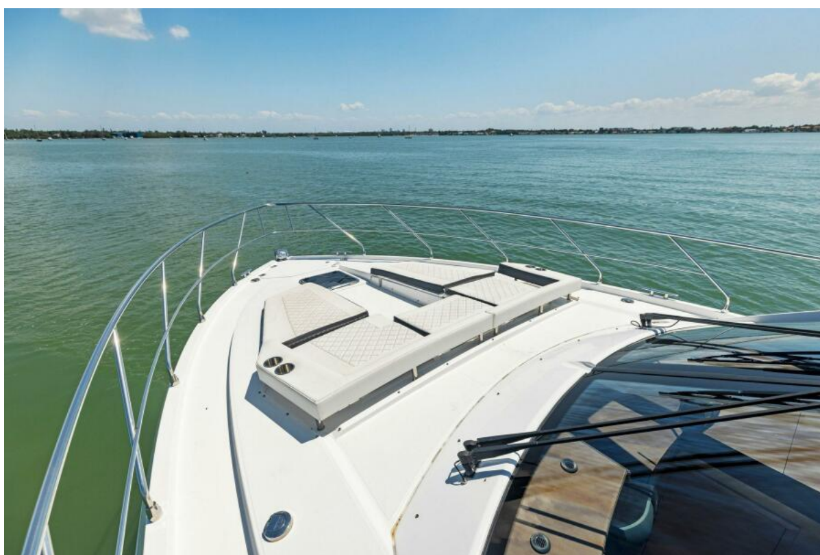
2019 Cruisers Yachts 54 Cantius 'Ruth Pearl' Bow