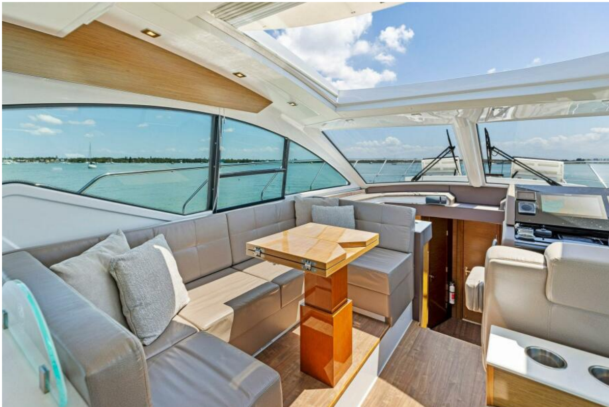
2019 Cruisers Yachts 54 Cantius 'Ruth Pearl'