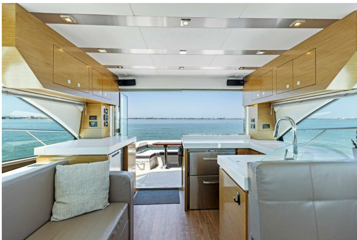
2019 Cruisers Yachts 54 Cantius 'Ruth Pearl' Salon