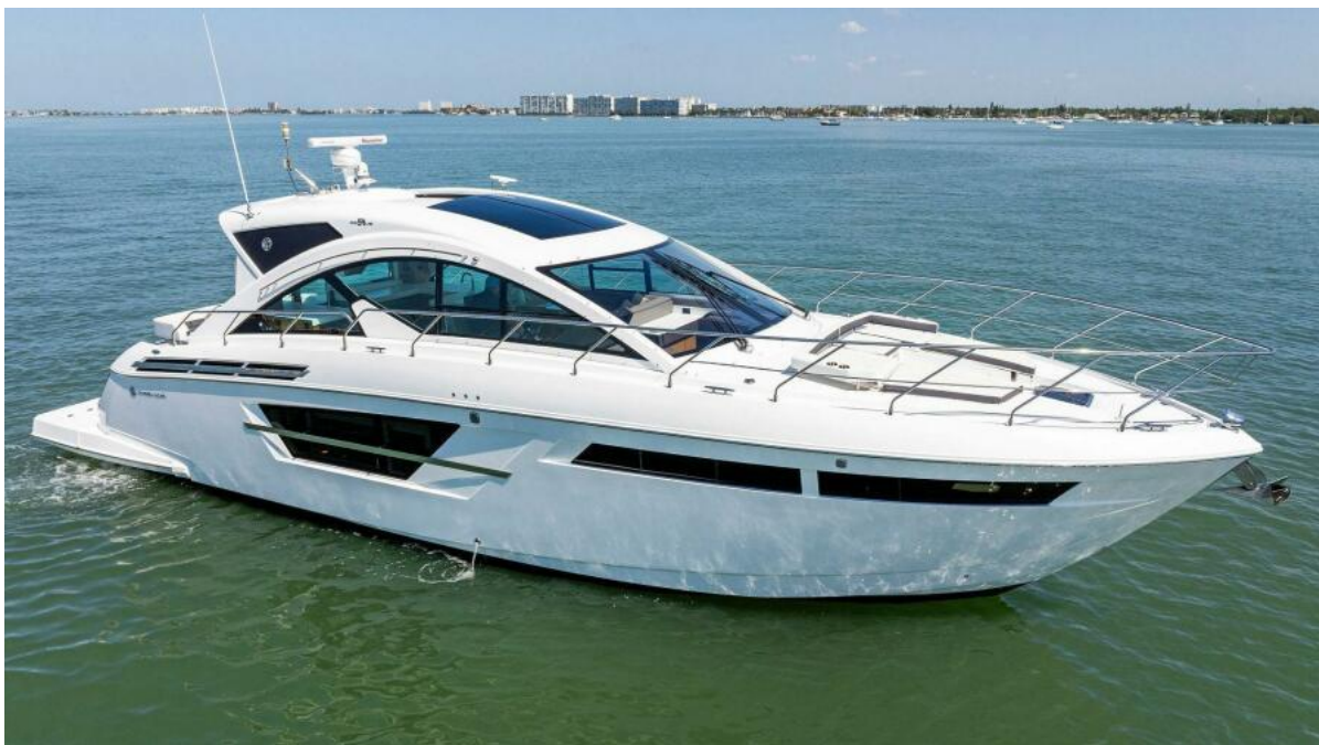
2019 Cruisers Yachts 54 Cantius 'Ruth Pearl'