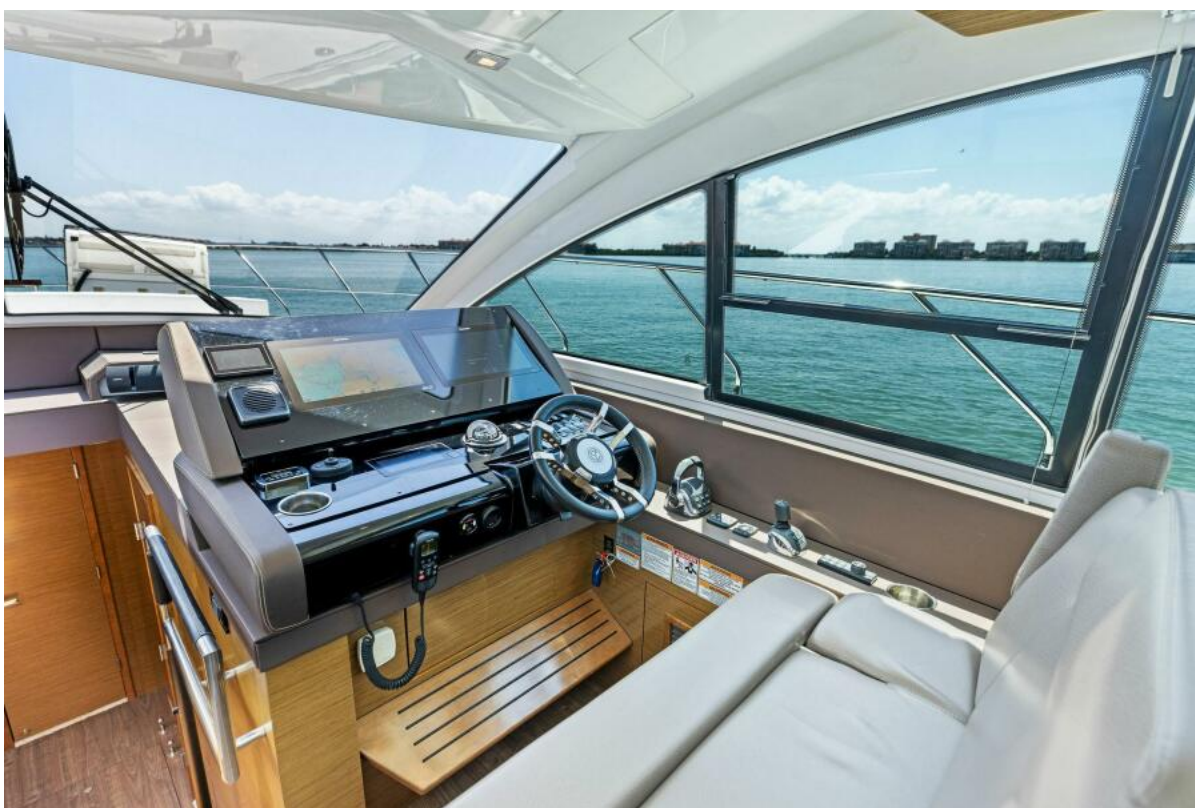
2019 Cruisers Yachts 54 Cantius 'Ruth Pearl' Helm